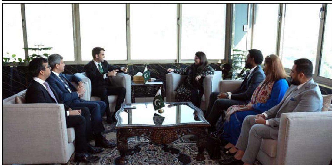
ISLAMABAD: Minister of State for IT and Telecommunication Ms. Shaza Fatima Khawaja in a meeting with TikTok delegation.