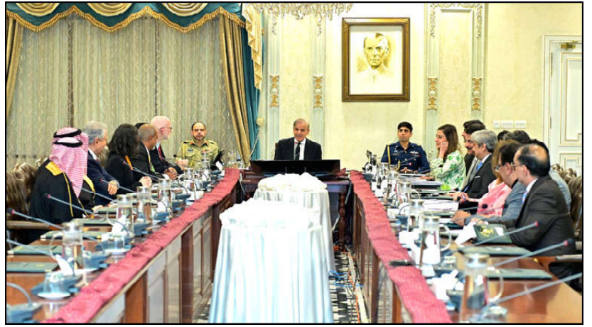
ISLAMABAD: A delegation of Polio Oversight Board meeting with Prime Minister Muhammad Shehbaz Sharif.

The Army Chief expressed his unwavering confidence in Pakistan's bright and stable future, and said that the clouds of despair that loomed over the country one year ago, have now cleared.