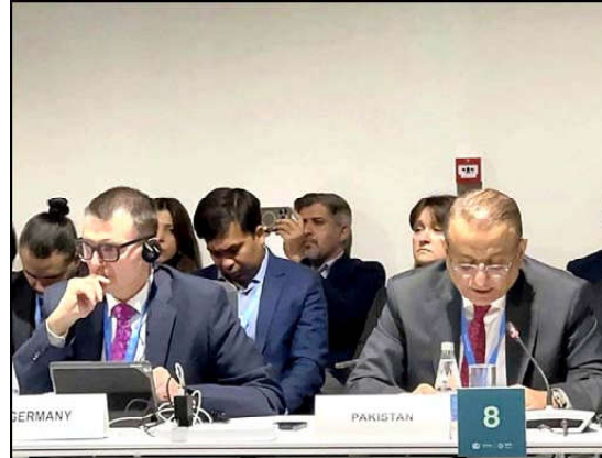
BAKU: Federal Minister for Communications, Privatization and Board of Investment, Abdul Aleem Khan during the COP29 in Baku.

He said that several projects of improvement in manpower as well as the Benazir Bhutto Scholarship Programme and Youth Skills Development Programme have been implemented, which would help end the sense of deprivation in the province.