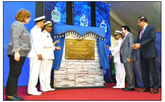
Chief of the Naval Staff Admiral Naveed Ashraf laid foundation of Pakistan Maritime Science and Technology Pak (PMSTP) during IDEAS 2024.

He said that the PTI founder misused his position and threatened the person responsible for assessing the value of the set.