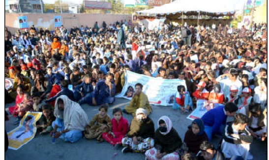
QUETTA: Students and local people participating in protest for missing Mosaver Khan at Balochistan Assembly Chowk.

The decision said IHC should see the matter again and decide in this regard.