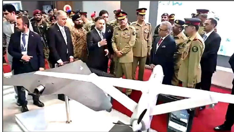
KARACHI: General Syed Asim Munir, NI (M) Chief of Army Staff (COAS), visiting the International Defence Exhibition and Seminar (IDEAS-2024) at the Karachi Expo Centre.