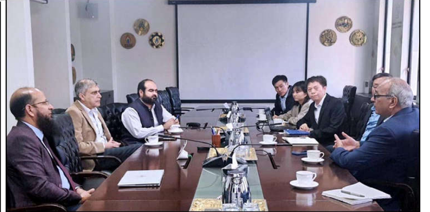
ISLAMABAD: A Delegation from China Geological Survey (CGS) Calls on Secretary Petroleum to Bolster Geoscientific Collaboration.