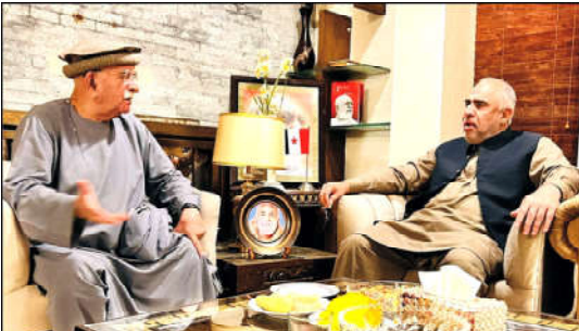
ISLAMABAD: PTI leader Asad Qaiser meeting with Chairman PMAF and Chairman Tehreek Tahafuz Aain-e-Pakistan Mehmood Khan Achakzai.

Besides, we are also taking steps to cope with terrorism in the province, he added. The Chief Minister Punjab on the occasion said that people living in Balochistan are like brothers. She said that the terrorists want to influence the development of Balochistan. Ms. Maryam Nawaz assured wholehearted assistance to the Chief Minister Balochistan for eliminating terrorism in the province.