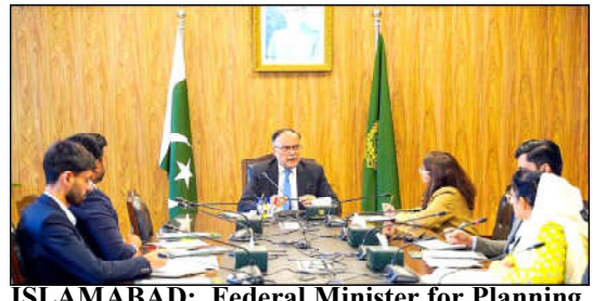
ISLAMABAD: Federal Minister for Planning, Development, and Special Initiatives, Ahsan Iqbal, chaired a high-level meeting to review the identification of locations for Model Special Economic Zones (SEZs) and the policy framework for relocating Chinese industries to Pakistan.

has met its highest-ever tax collection targets. He mentioned that the Pakistan Muslim League-Nawaz (PML-N) has always led the country out of crises whenever it came to power, even when the country was in ruins, and that PML-N was the only political party voted into power based on its performance. He also highlighted that in September, the country's IT exports increased by $292 million, with total exports nearing the $1.3 billion mark.