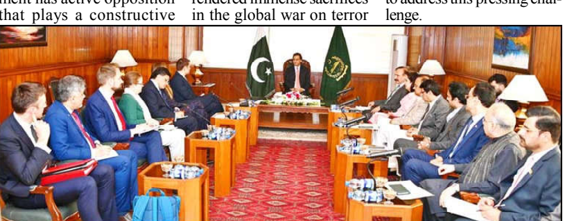
ISLAMABAD: Speaker National Assembly Sardar Ayaz Sadiq in a meeting with Minister/Parliamentary Under-Secretary of State at Foreign, Commonwealth & Development, United Kingdom Mr. Hamish Falconer along with delegation at Parliament House.

Furthermore, the Speaker underscored Pakistan's minimal contribution to global greenhouse gas emissions while being one of the most affected countries by climate change. He called for greater international collaboration to address this pressing chal-