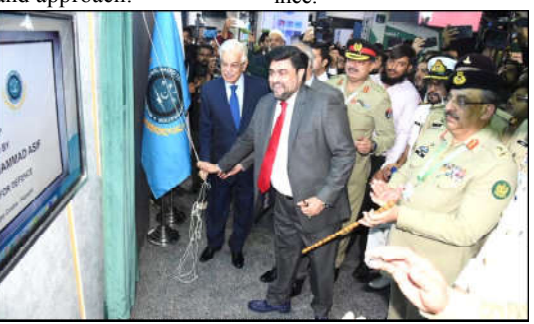
KARACHI; Federal Minister for Defense Khawaja Asif alongwith Governor Sindh Kamran Khan Tessori inaugurating IDEAS 2024 Exhibition at NRTC Pavilion.