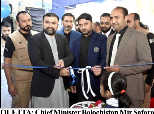
QUETTA: Chief Minister Balochistan Mir Safaraz Ahmed Bugti inaugurating Sciences and Art Exhibition at Jinnah Elite School.

The Chief Minister underlined the need to promote modern education along with conventional education in the province.