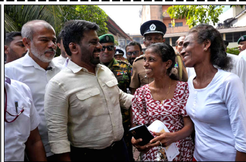
Sri Lanka's President and National People's Power (NPP) party leader Anura Kumara Dissanayake meets his party supporters after casting his vote on the day of the parliamentary election in Colombo, Sri Lanka.

The Republican leader has yet to select treasury and commerce chiefs to help set tax and trade policy, a health secretary to oversee abortion, transgender care and a host of other potential flashpoints, or someone for education — a department Trump wants to abolish.