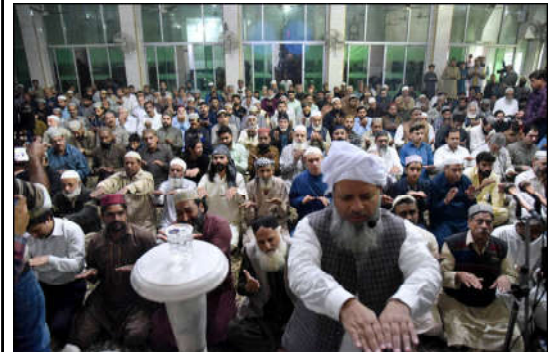
LAHORE: Chairman Islamic Ideological Council of Pakistan, Allama Dr. Raghib Hussain Naemi, offers prayers for rain and mercy at Jamia Masjid Dalgiran Chowk.

The court highlighted a recent study by the Punjab government, conducted in collaboration with the Asian Development Bank, to restore the Ravi River, and suggested that this research should be effectively utilized.