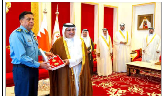
His Royal Highness Prince Salman bin Hamad Al Khalifa, Deputy King of the Kingdom of Bahrain conferring Bahrain Medal-First Class upon Chief of the Air Staff, Pakistan Air Forces, Air Chief Marshal Zaheer Ahmed Baber Sidhu.

"We did that back in 2019. And at the end of the day, we're going to continue to stand shoulder-to-shoulder with Pakistan in its fight against terrorism and violent extremism."