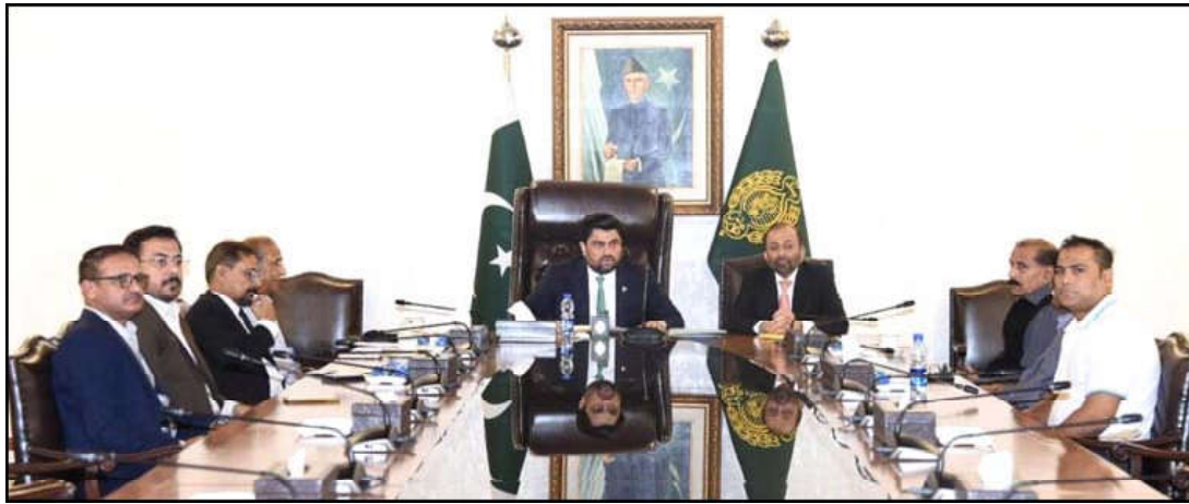
KARACHI: A delegation of Khidmat-e-Khalq Foundation Trustees led by MNA Dr. Feroq Sattar meeting with Governor Sindh Kamran Khan Tessori.