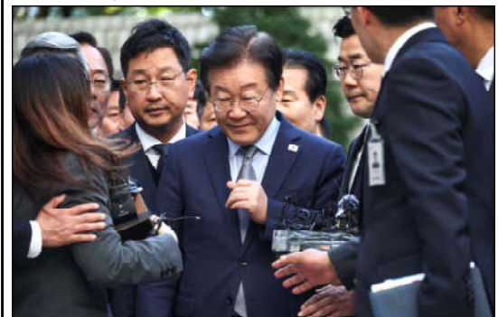
South Korea's main opposition Democratic Party leader Lee Jae-myung arrives at a court in Seoul, South Korea.

"The biggest political victory in 129 years... We swept all swing states. We won the popular vote," he said. He stressed that the country is "doing good" since he was elected on November 5. "Now the only thing is, Mr. Speaker, I think it's important, maybe you should pass a bill — you have to start my term from November 5, OK? Or November 6 if you want. November 5, because the market's gone through the roof, enthusiasm's doubled in the last short while," he said.