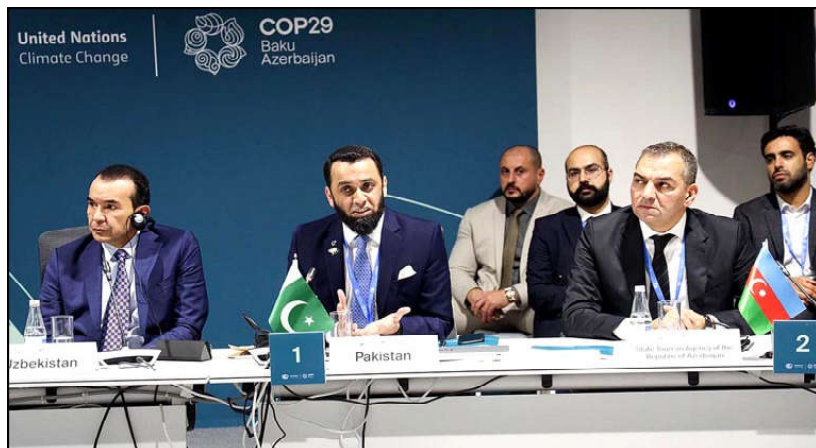
BAKU: Mr. Attaullah Tarar, Federal Minister for Information and Broadcasting, National Heritage and Culture delivering a speech at high-level Ministerial Dialogue.

The amount has been distributed under the Benazir Income Support Programme.