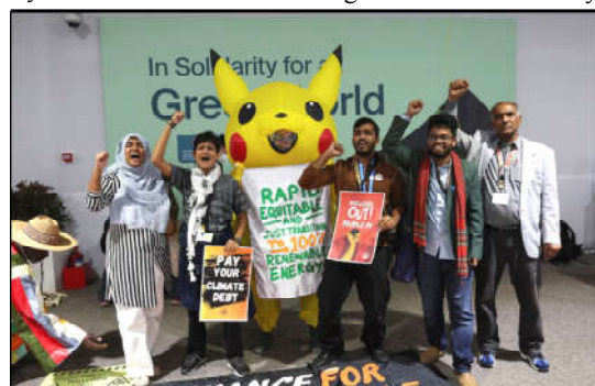
Global environmental activists protest against the gas industry during the United Nations Climate Change Conference (COP29), in Baku, Azerbaijan.

The port was officially opened in a ceremony overseen virtually by Xi and Peruvian counterpart Dina Boluarte from Lima, where they will attend an Asia-Pacific Economic Cooperation (APEC) summit on Friday and Saturday. "China plays a major role in the growth of our economy," Boluarte said at the event, even as an official warned Latin American nations should be vigilant on Chinese investment.