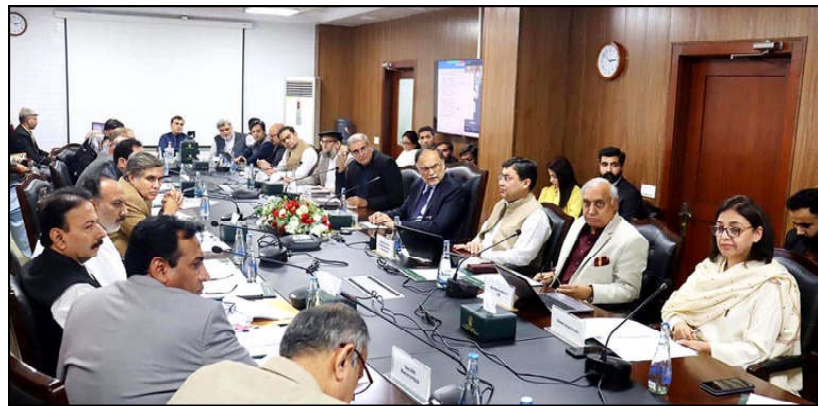
ISLAMABAD: Minister for Planning, Development, and Special Initiatives (PDSI) and Deputy Chairman of the Planning Commission Ahsan Iqbal chaired the Central Development Working Party (CDWP) meeting and approved three major development projects worth Rs. 58.857 billion.

as to create easiness in their daily lives. Speaking on the occasion, Director General Public Relations said that the basic objective of Hawkers Welfare Fund is to help out the labourers who play important role in timely dissemination of news and information. He also said that the present government is determined for welfare of the people associated with the journalism under leadership of the Chief Minister Mir Sarfraz Bugti.