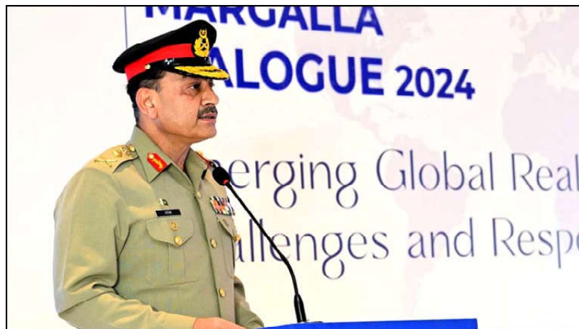
ISLAMABAD: Chief of the Army Staff, General Syed Asim Munir addressing Margalla Dialogue 2024.

He went on to say that although technology has played a crucial role in disseminating information, but it has also crucial role in rapid spread of misinformation and disinformation.