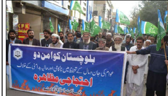
QUETTA: Activists of Jamat-e-Islami (JI) are holding protest demonstration for demanding peace in Balochistan, at Quetta press club.

ISLAMABAD (APP): Pakistan Telecommunication Authority (PTA) Zonal Office Peshawar, in collaboration with the Federal Investigation Agency (FIA) Cyber Crime Wing Peshawar conducted successful raids on telecom franchisees in Barakahu, Islamabad, and Shinkari, District Mansehra. According to news release both franchisees were involved in the illegal issuance of SIMs by deceitfully obtaining fingerprints of underprivileged women from various villages in Orakzai Agency.