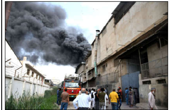
KARACHI: Smoke billows as a fire blazes at Plastic Factory site area Ghani Chowrangi in Karachi.

need to take better measures to prevent tax evasion, for which the scope of the tax net needs to be expanded. Governor Punjab said that payment of tax is the moral and legal responsibility of all of us. He said that the people are ready to pay taxes, but the government has to simplify the system and impose taxes in consultation with the business community. He said that the implementation of the plan presented by President of Pakistan Asif Ali Zardari regarding taxation on the agricultural sector will strengthen the country's economy.