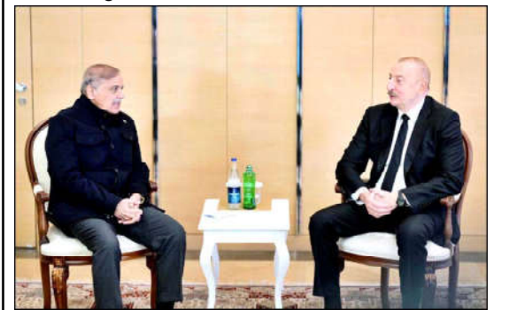
BAKU: Prime Minister Muhammad Shehbaz Sharif meets President of Azerbaijan Ilham Aliyev on the sidelines of COP29 Climate Action Summit.

PTI founder has said lawyers should come out for the sake of Supreme Court. Civil society, farmers and students should come out for protest, she said this while talking to media men outside Adiala jail Wednesday. She said people should come out for voicing protest against the stolen mandate, unjust massive arrests and 26th constitutional amendment. Nation has to decide today either they have to live under martial law or in freedom. PTI founder has given final call for protest on November 24, she held.