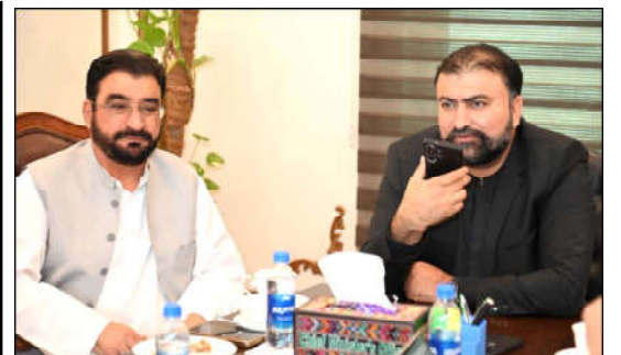
QUETTA: Chief Minister Balochistan Mir Sarfraz Ahmed Bugti enquiring from a citizen on progress on complaint through video link at Complaint Cell.

SWAT (INP): Pakistan Tehreek-e-Insaf (PTI) senior leader Asad Qaiser has expressed hope that PTI founder Imran Khan will be released soon, claiming that he cannot be kept in jail for much longer despite court orders. Speaking to a private TV Channel program, Qaiser criticized the current government, which he described as a product of Form 47, and accused it of operating in a manner that disregards the will of the people. Qaiser, who was part of a PTI delegation attempting to meet Khan in jail, revealed that the group had received an order from the Islamabad High Court allowing them to meet the former Prime Minister.