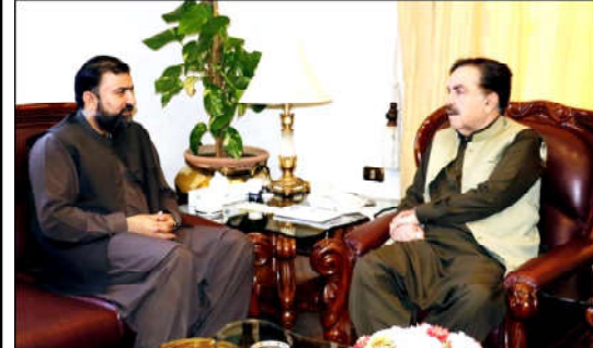
QUETTA: Chief Minister Balochistan Mir Sarfaraz Ahmed Bugti meeting with Governor Sheikh Jaffar Khan Mandokhail.