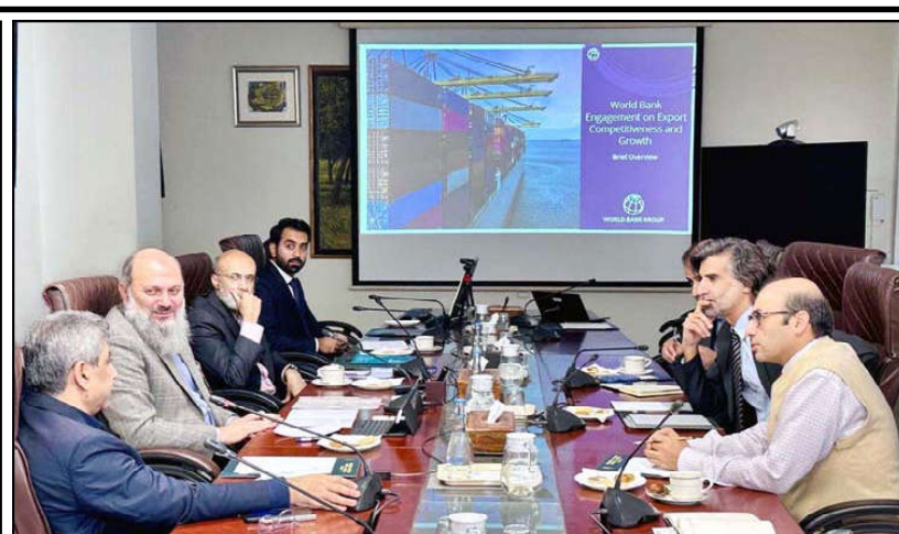
ISLAMABAD: Federal Minister for Commerce, Jam Kamal Khan meets with the World Bank team to discuss strategies for boosting Pakistan's export competitiveness and strengthening trade policies, emphasizing a Whole-of-Government approach for export-led growth.

Pakistan's olive sector is poised to significant growth, with Rana Tanveer outlining ambitious plans to transform the country into a major player in the global market.