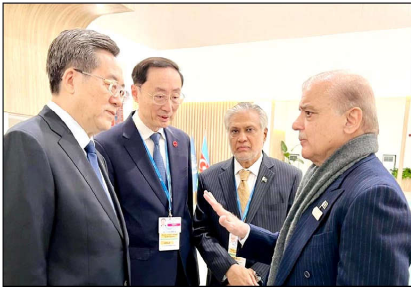
BAKU: Prime Minister Muhammad Shehbaz Sharif met Chinese Vice Premier Ding Xuexiang, on the sidelines of COP29 Climate Action Summit in Baku.

The Chinese vice premier expressed his desire to work with Pakistan to overcome security challenges and further expand Pak-China cooperation for the development and prosperity of the peoples of the two countries.