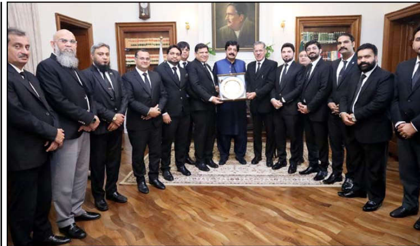
LAHORE: Governor Punjab, Sardar Saleem Haider Khan in a group photo with delegation led by Patron Chief Pakistan Tax Bar, Rana Munir Ahmed and President Lahore Tax Bar Shehbaz Siddique at Governor House.

urban and congested areas across Punjab." She added, "15 Clinics on Wheels and 3 ultrasound vehicles are busy in semi-urban and congested areas of Lahore, whereas more than 736,000 people received treatment from the field hospital in remote areas of Punjab." She flagged, "More than 100,000 people in the villages were provided free lab test facility through the field hospitals, and more than 46,000 people from remote villages were given the facility of free X-ray and ultrasound tests."