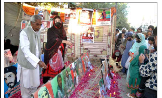
QUETTA: Participants are enlightened candles to pay homage in the memory of Baloch Martyrs on the occasion of Baloch Martyrs Day organized by Voice for Baloch Missing Persons, in Quetta.

According to documents from the Ministry of Petroleum, providing LNG to domestic consumers will require an investment of Rs163 billion. Sources said that the imported LNG is increasing pressure on pipelines on a daily basis.