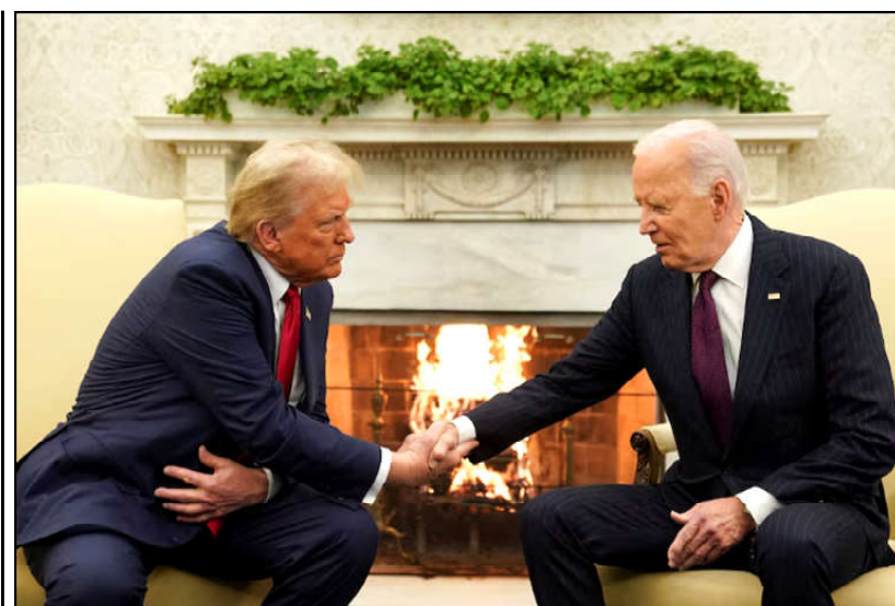
U.S. President Joe Biden meets with President-elect Donald Trump in the Oval Office at the White House in Washington, U.S.

Efforts by Arab mediators, Qatar and Egypt, backed by the United States, have so far failed to end the war in Gaza, with Hamas and Israel trading the blame for the lack of progress.