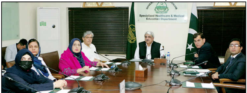
LAHORE: Punjab Minister for Health Khawaja Salman Rafique presides over the high level meeting at Specialized Healthcare and Medical Education Department.

During the visit, DG LDA Tahir Farooq highlighted the rapid pace of construction, particularly the ongoing work on the city's infrastructure, including roads and other key developments.