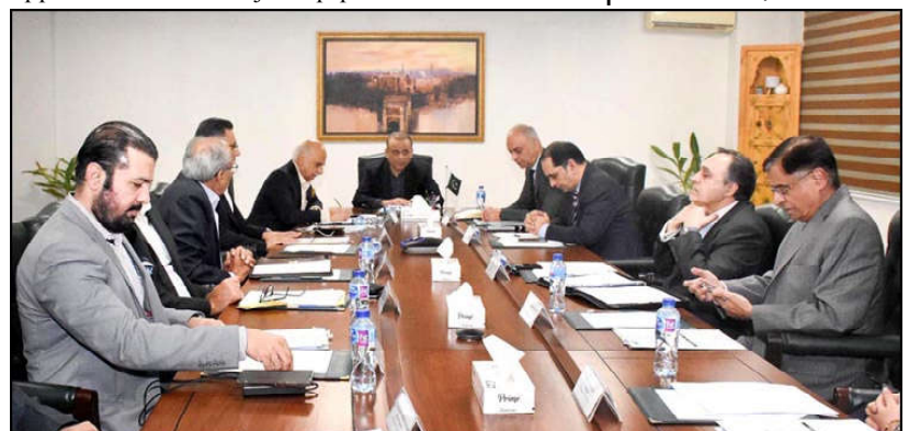
ISLAMABAD: Federal Minister for Privatisation, Investment and Communication Abdul Aleem Khan chairing 227th meeting of Privatisation Commission Board.

appreciates the announcement of the winter package - the relief in the electricity tariff announced under it should be made available to small & medium enterprises (SMEs) as well through withdrawing the condition of 100,000 units consumption in the corresponding period of last year; and, resultantly, only applying the Rs. 26/kWh tariff to the incremental units consumed after that threshold.