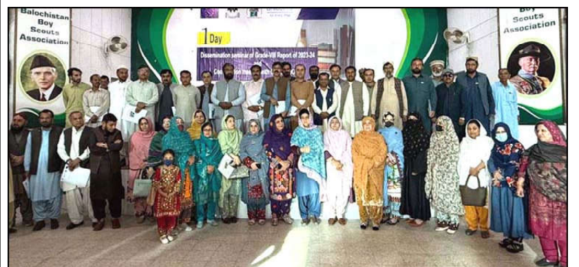
QUETTA: Balochistan Education Minister, Raheela Hameed Durrani in a group photo along with participants during the Dissemination Seminar of Grade-VIII Report of 2023-24 held in Quetta.

Addressing the high-level event, the deputy prime minister/foreign minister reaffirmed Pakistan's commitment to safeguarding lives and protecting communities from the unpredictable and severe impacts of climate change.