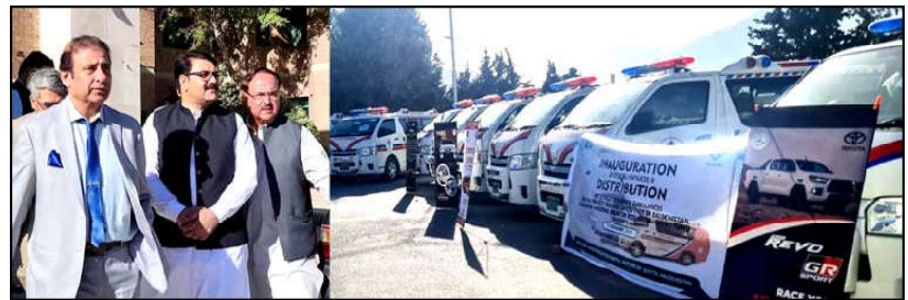
QUETTA: Provincial Minister for Health Bakht Muhammad Kakar inspecting ambulances distributed among DHOs of different districts at Sheikh bin Zayed Hospital.

Maqam paid tribute to the brave Major Atif Khalil of Sudhnuti for his martyrdom and offered a special prayer for his soul's elevation.