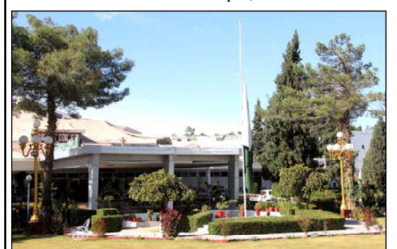
QUETTA: Nataon flag flying half-mast due to three-day mourning over the bomb blast at the railway station

"Are we unconstitutional until the constitutional bench is established?" he asked, adding that this means constitutional cases would not be heard until the constitutional bench comes into force. He further remarked that even if this regular bench heard the case, nobody could question it. Even if the regular bench decided the case, who could stop it, he asked further.