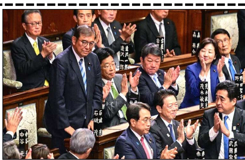
Lawmakers applaud as Japan's Prime Minister Shigeru Ishiba (standing L) is reappointed as leader after the second round of a parliamentary vote to nominate a prime minister following the October 27 general election, during a special session of parliament in Tokyo.