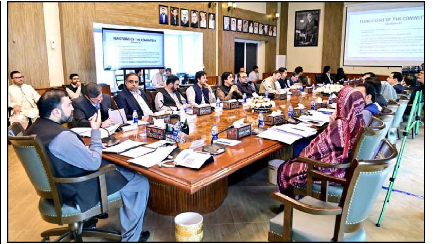
QUETTA: Chief Minister Balochistan Mir Sarfaraz Ahmed Bugti presiding over meeting of Provincial Cabinet.

The prime minister also called for holding of accountability of Israel for its war crimes, besides, urging the summit to pursue the adoption of UNGA special session's resolution 10/24 that followed up a historic advisory opinion of the International Court of Justice (ICJ). Prime Minister Shehbaz Sharif also demanded a comprehensive review of Israel's membership of the United Nations.