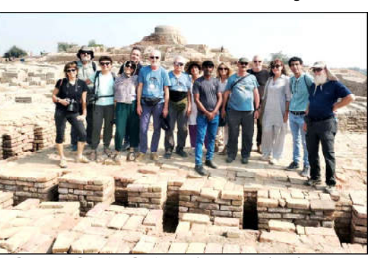
MOHENJO DARO: A tourist delegation from Italy are visiting and expressed keen interest in the historical ruins of the World Heritage Monuments of Mohenjo Daro.

Swearing-in ceremony of elected general councilors held DIR LOWER (APP): A swearing-in ceremony of the general councilors who won the local government by-election was held here at ADC Office Jirga Hall, Blombat, on Monday. District Returning Officer/Deputy Commissioner of Dir lower Muhammad Arif Khan administered the oath to the elected councilors and congratulated them.