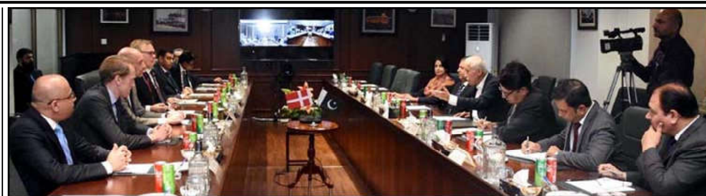
ISLAMABAD: Federal Minister for Maritime Affairs, Qaiser Ahmed Shaikh along with the officers of Ministry of Maritime Affairs in meeting with the senior officials of Danish Shipping Company Maersk Line in Islamabad.

He also highlighted the role of Pakistani expatriates settled in Denmark for strengthening bilateral ties and promoting commerce and cultural exchanges between both the countries.