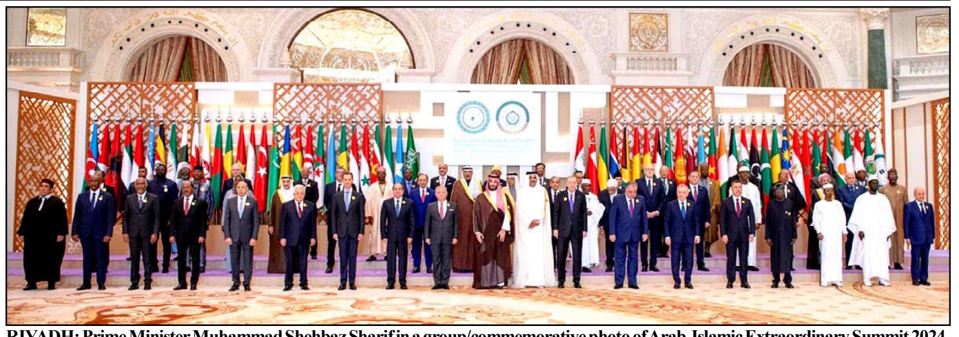
RIYADH: Prime Minister Muhammad Shehbaz Sharif in a group/commemorative photo of Arab-Islamic Extraordinary Summit 2024.

He further noted that the RTI applies to all public bodies of the federal government, and citizens can submit an application to a designated official for information. The law also allows citizens to access information from private bodies that are substantially financed by the government