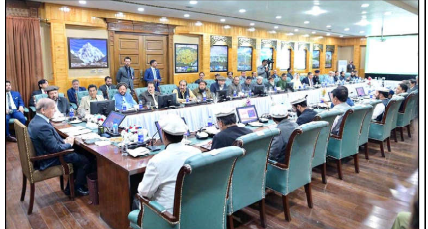
GILGIT: Prime Minister Muhammad Shehbaz Sharif chairs a special meeting of the Gilgit Baltistan Cabinet.

The defence counsel succeeded in completing cross questioning on 37th