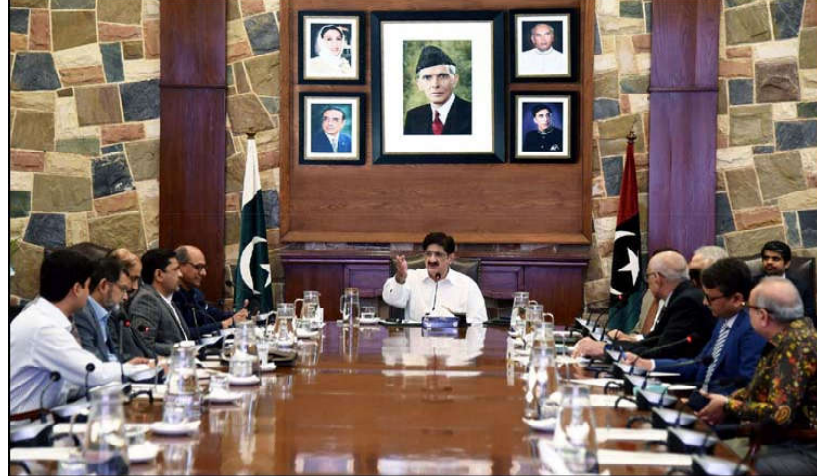
KARACHI: Sindh Chief Minister, Syed Murad Ali Shah reviews progress on key Karachi projects: Karimabad Underpass, Korangi Causeway Bridge and Malir Expressway, at CM House in Karachi.