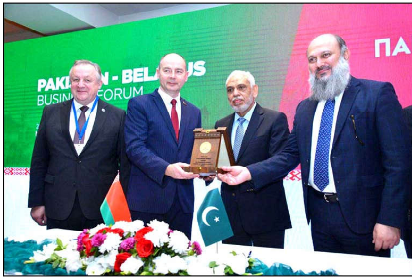
ISLAMABAD: Federal Minister for Commerce Jam Kamal Khan presents a souvenir to Belarusian Minister Alexey Kushnarenko during the Pakistan-Belarus Business Forum 2024, where both witnessed the signing of 8 MoUs/Agreements.

The minister said that the two countries' exports and trade have a major focus on surgical instruments comprising about 62% of the total exports to Belarus and imports of Belarus tractors and machinery.