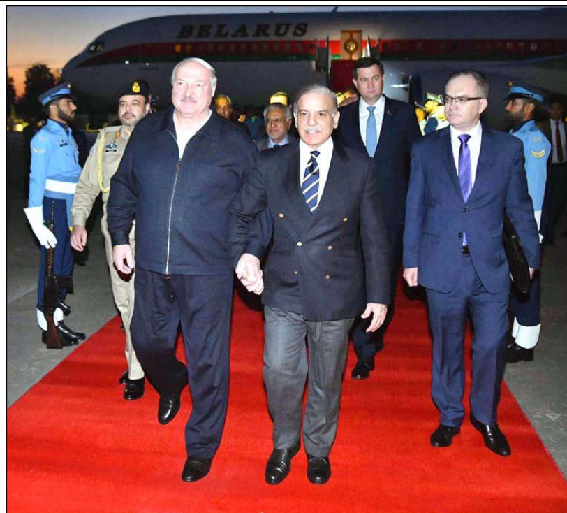
RAWALPINDI: Prime Minister Muhammad Shehbaz Sharif receives President of Belarus Aleksandr Lukashenko at PAF Nur Khan Air Base.