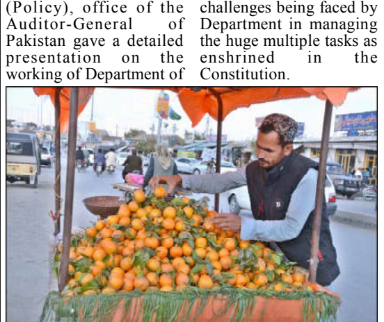
QUETTA: A vendor arranging and displaying oranges on handcart to attract the customers at Double Road.

the Auditor-General of Pakistan covering its mandate and scope, interaction with the stakeholders, the internal governance and integrity mechanism and the impact of audit activity on strengthening the internal controls, stabilization of economy and benefits for the citizens. He was apprised about the audit reports which are professionally written and contain audit recommendations, are based on independently and apolitically executed audit programs to assist the parliament and provincial legislatures in promoting transparency, accountability and good governance. To make auditing a collaborative exercise, all PAOs, CSOs and even the general public were approached for their inputs for next year Audit Plans. The finance minister was apprised about the challenges being faced by Department in managing the huge multiple tasks as enshrined in the Constitution.