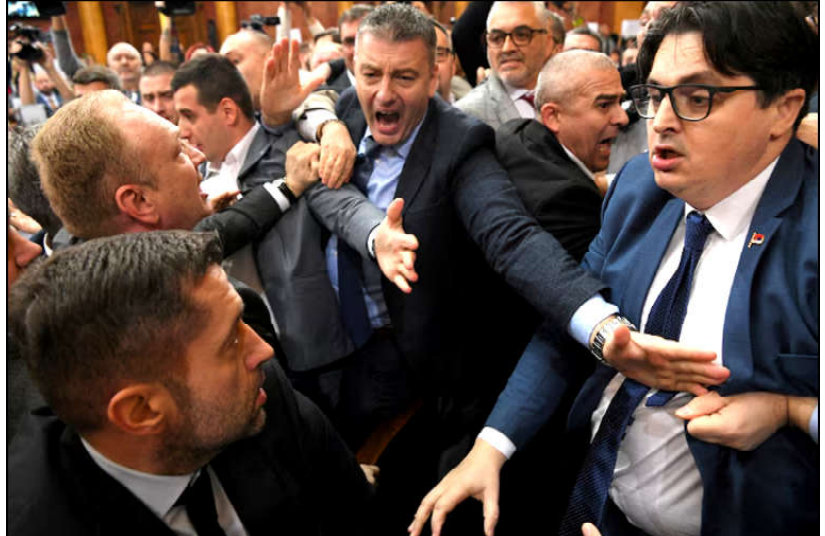
Opposition and the ruling coalition deputies brawl as tensions rose over Novi Sad's fatal train station roof collapse, during a session in the Serbian parliament hall in Belgrade, Serbia.

Among the issues that remain is an Israeli demand to reserve the right to act should Hezbollah violate its obligations under the emerging deal. The deal seeks to push Hezbollah and Israeli troops out of southern Lebanon. Israel accuses Hezbollah of not adhering to a U.N. resolution that ended the 2006 war between the sides that made similar provisions, and Israel has concerns that Hezbollah could stage a Hamas-style cross-border attack from southern Lebanon.