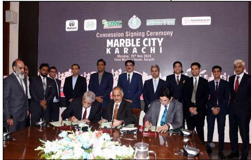
KARACHI: Sindh Chief Minister, Syed Murad Ali Shah along with others witness the signing ceremony of the Concession agreement between Sindh Government and private partners Kainatt Enterprises and Hassan Constructions for the development of Marble City, at CM House in Karachi.

ISLAMABAD (APP): The price of 24 karat per tola gold decreased further by Rs 4,300 and was sold at Rs 278,400 on Monday against its sale at Rs 182,700, All Sindh Sarafa Jewellers Association reported. The price of 10 grams of 24 karat gold also went down by Rs.3,657 to Rs.238,683 from Rs. 242,370 whereas that of 10 gram 22 karat gold decreased to Rs 218,793 from Rs 222,172. The price of per tola gold declined by Rs 50 to Rs 3,400 whereas that of ten gram silver went down by Rs 42.87 to Rs 2,914.95.