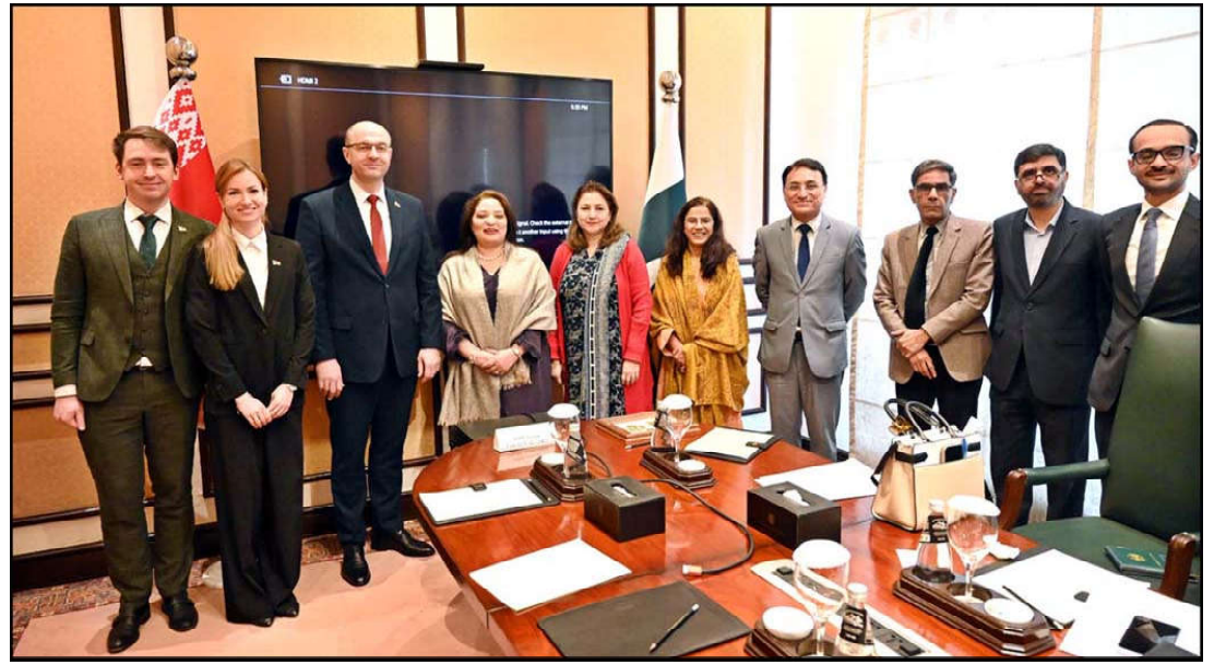
ISLAMABAD: Coordinator to the PM on Climate Change Ms. Romina Khurshid Alam in a group photograph with Minister of Natural Resources and Environmental Protection Belarus Sergey Maslyak.

Romina Khurshid said that Pakistan would appreciate collaboration with Belarus on the exchange of academia, exchange of technical know-how, knowledge sharing and capacity building to promote green education and awareness in the field of nature and environmental protection.