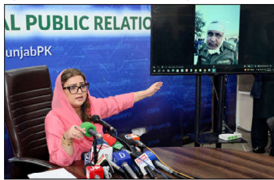
LAHORE: Provincial Information Minister, Azma Bokhari addressing a press conference in the Provincial Capital.

while lacking even basic knowledge, such as properly reciting "Durood Sharif". Azma Bokhari asserted that the PTI and its armed factions were seeking casualties to advance their disruptive political agenda. "Life continues as normal across Punjab. Not even a bird has stirred here," she said and emphasized that commercial and social activities remain uninterrupted in the province. Azma Bokhari condemned continued violence by "Tehreek-e-Fasad" on the second day of unrest, which included torching police vehicles and attacking officers.