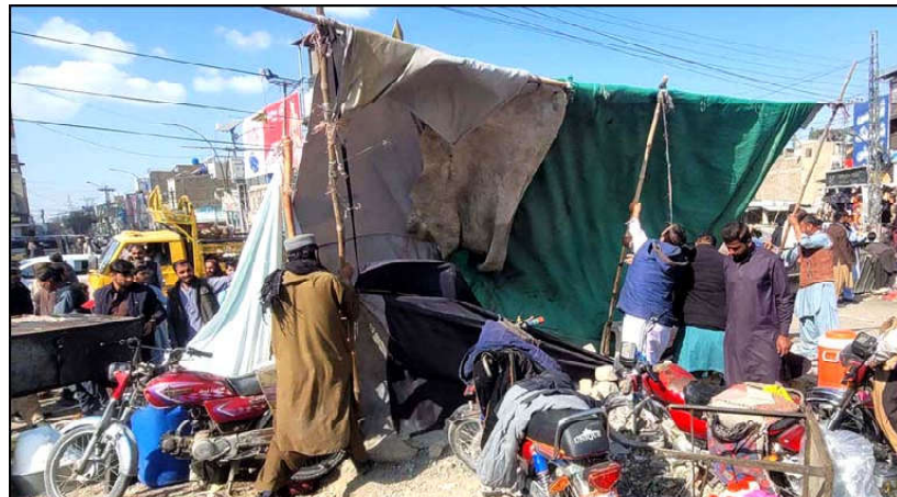
QUETTA: A view of Metropolitan Corporation staffer busy in demolish illegal encroachment at bacha khan chowk during operation at motton market.

QUETTA: All the educational institutions including schools, colleges and universities remain closed in Quetta and other parts of Balochistan province on Monday. The educational institutions were closed on directives of the Colleges, Higher and Technical Education Department, issued the other day. As per the notification of the Education Department, the educational institutions were closed in view of the non-operational of the public transport in Quetta and other province. The notification mentioned that the activities in educational institutions would resume today (Tuesday).