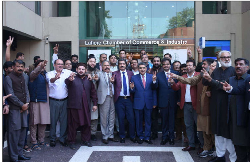
LAHORE: A group photo of members of Lahore Chamber of Commerce after re counting of votes in the Provincial Capital.