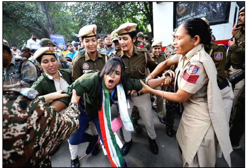
Police detain a supporter of India's main opposition Congress party during a protest against Indian billionaire Gautam Adani, in New Delhi, India.

On the battlefield, Ukrainian forces are straining to hold at bay a push by Russia's bigger army at places in the eastern Donetsk region. Russian forces recently have gained ground at "a significantly quicker rate" than they did in the whole of last year, according to the Institute for the Study of War, a Washington think tank. The Russians have detected and are exploiting weaknesses in the Ukrainian defenses, it said in an analysis late Sunday. The war surpassed 1,000 days last week, and the milestone coincided with a significant escalation in hostilities. Meanwhile, Ukraine's air force said Russia is adapting its drone tactics, as it fired 145 Shahed drones at Ukraine.