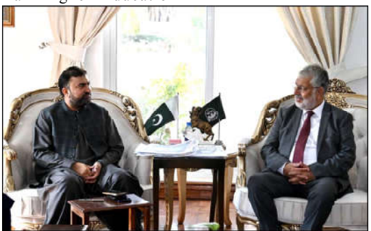
QUETTA: Chairman Higher Education Commission Dr. Mukhtar Ahmed meeting with Chief Minister Balochistan Mir Sarfraz Ahmed Bugti.

The Chief Minister also said that he hail the positive recommendations of the HEC and vowed to put the universities of province on path of improvement together with it (HEC).