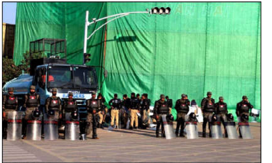
ISLAMABAD: A view of Rangers personals stand on closed road to PTI protest in twin cities.