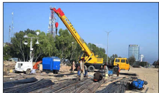
ISLAMABAD: Heavy machinery being used at the site of under-construction PTCL Chowk underpass project during development work in Federal Capital.

Unite to End Violence against Women will draw attention to the alarming escalation of violence against women to revitalize commitments, call for accountability and action from decision-makers.