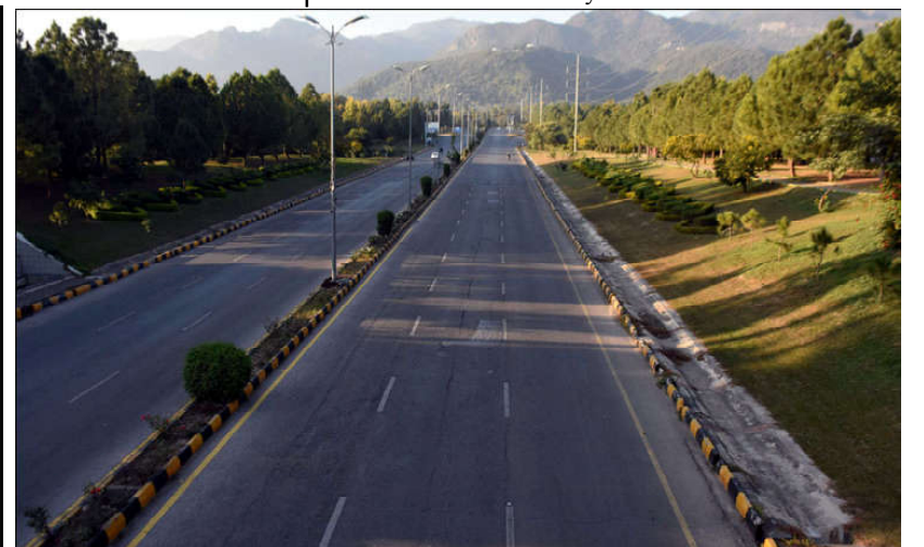
ISLAMABAD: A view of deserted roads of the Federal Capital during lockdown.

The Court observed that the matters of tax and property may be dealt with by the department concerned.