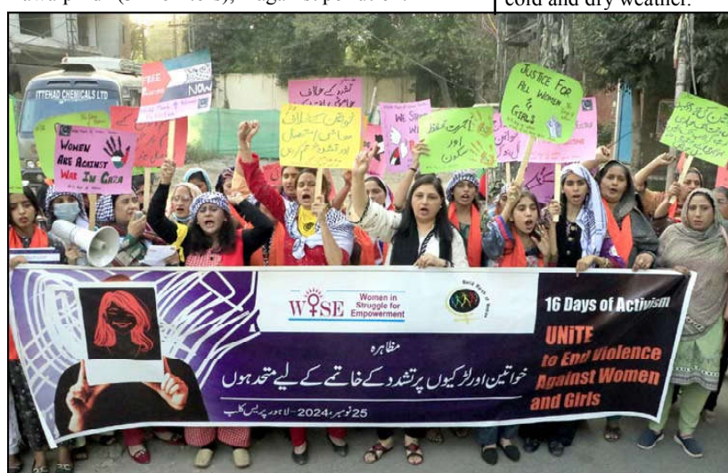
LAHORE: Members of Women in Struggle for Empowerment (WISE) are holding rally to mark the International Day for the Elimination of Violence against Women, at Lahore press club.

Faisalabad, Sheikhpura, and Sialkot (1 monitor each), as well as Multan, Gujranwala, and Bahawalpur (2 monitors each). Sargodha (2 monitors) and Dera Ghazi Khan (1 monitor) are expected to activate their systems by the end of this month. These devices are linked to the Environmental Protection Agency's (EPA) central control room for real-time monitoring. The Senior Minister highlighted that the collected air quality data will be integrated with the global Air Quality Index (AQI) system, providing accurate and reliable information to the public and researchers. This system is designed to facilitate timely actions against pollution.