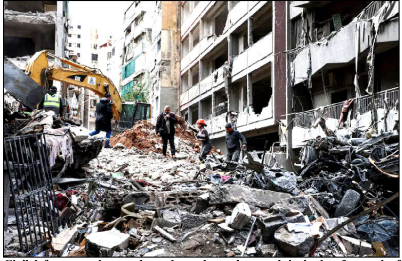
Civil defense members and people work at a damaged site in the aftermath of Israeli strikes, amid the ongoing hostilities between Hezbollah and Israeli forces, in Beirut's Basta neighbourhood, Lebanon.

Monitoring Desk NEW DELHI: Camera traps, drones and other technology for monitoring wildlife like tigers and elephants are being used to intimidate, harass and even spy on women in India, researchers said on Monday. In one particularly egregious example, a photo of an autistic woman relieving herself in the forest was shared by local men on social media, prompting villagers to destroy nearby camera traps. Trishant Simlai, a researcher at the UK's Cambridge University, spent 14 months interviewing some 270 people who live near the Corbett Tiger Reserve in northern India.