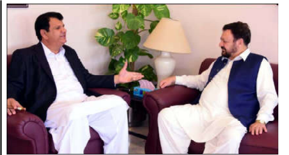
ISLAMABAD: Federal Minister for Kashmir Affairs, Gilgit Baltistan and SAFRON, Engr. Amir Muqam exchanging views with Gulbar Khan, Chief Minister of Gilgit-Baltistan during meeting held in Islamabad.

By addressing existing gaps—such as inadequate resources, limited training for members, lack of inclusivity, and insufficient public awareness—DRCs can become more efficient, accessible, and responsive to community needs. Strengthened DRCs not only provide timely and cost-effective justice but also play a vital role in reducing the burden on formal courts and fostering social harmony at the grassroots level.