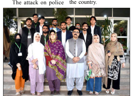
QUETTA: Provincial Education Minister Raheela Hameed Khan Durrani and Health Minister Bakht Muhammad Kakar in a group photo with students of Khuda Bakhsh College during their visit to Assembly.

He also directed to provide the best medical facilities to the police personnel injured as a result of stone pelting and violence stoked by the protestors.