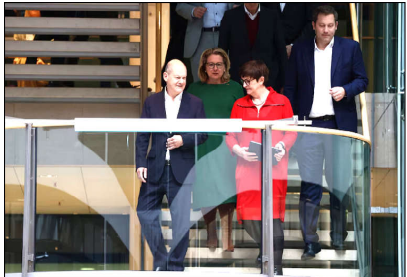
German Chancellor Olaf Scholz, co-leaders Lars Klingbeil and Saskia Esken walk to attend a press conference to announce Scholz as the officially nominated candidate for the upcoming general elections after a Social Democratic Party (SPD) board meeting in Berlin, Germany.

those responsible for war crimes to justice. Israel has rejected the jurisdiction of the Hague-based court and denies war crimes in Gaza. The warrant for a Hamas leader, Ibrahim Al-Masri, lists charges of mass killings during the Oct. 7, 2023, attacks on Israel that triggered the war on the long-blockaded Palestinian enclave, and also charges of rape and the taking of hostages. Israel has said it killed Masri, also known as Mohammed Deif, in an airstrike in July but Hamas has neither confirmed nor denied this.