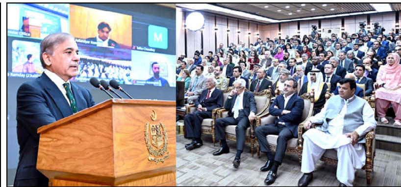
ISLAMABAD: Prime Minister Muhammad Shehbaz Sharif addresses a ceremony of laying a foundation stone of Ramday University, Thagos, Ghanche.