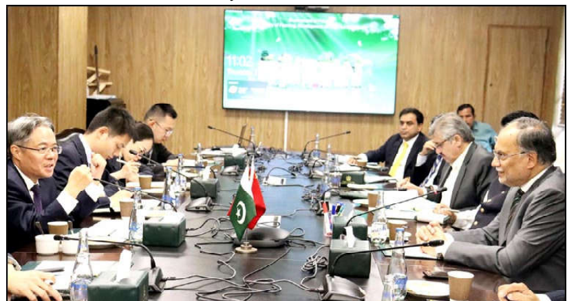
ISLAMABAD: Chinese Ambassador to Pakistan, Mr. Jiang Zaidong, called on the Federal Minister for Planning, Development & Special Initiatives, Prof. Ahsan Iqbal.