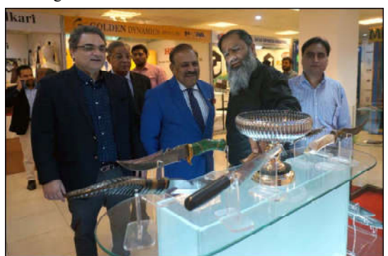
GUJRANWALA: Honorary Consul of Malta along with other taking keen interest in made in Gujranwala Products during his visit in Gujranwala Business Center.