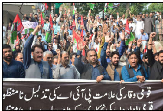
RAWALPINDI: PIA Employees Union protesting outside the press club against the privatization of national airline.