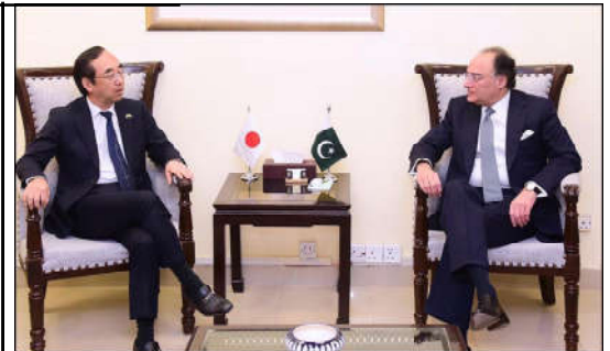
ISLAMABAD: Ambassador of Japan to Pakistan, Mitsuhiro Wada pays a farewell call to the Federal Minister for Finance and Revenue, Senator Muhammad Aurangzeb, at the Finance Division.

ISLAMABAD (APP): Pakistani rupee on Thursday depreciated by 05 paise against the US dollar in the interbank trading and closed at Rs 277.94 against the previous day's closing of Rs 277.89. However, according to the Forex Association of Pakistan (FAP), the buying and selling rates of the dollar in the open market stood at Rs 277.50 and Rs 279 respectively. The price of Euro decreased by 18 paise to close at Rs 298.91 against the last day's closing of Rs 299.09, according to the State Bank of Pakistan (SBP). The Japanese yen remained unchanged and closed at Rs 1.80, whereas an increase of 82 paise.