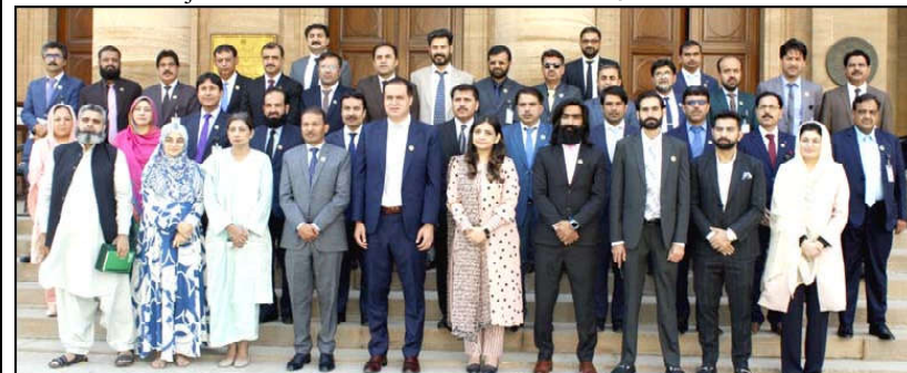
KARACHI: Participants of Balochistan Civil Services Academy in a group during their visit to State Bank of Pakistan.