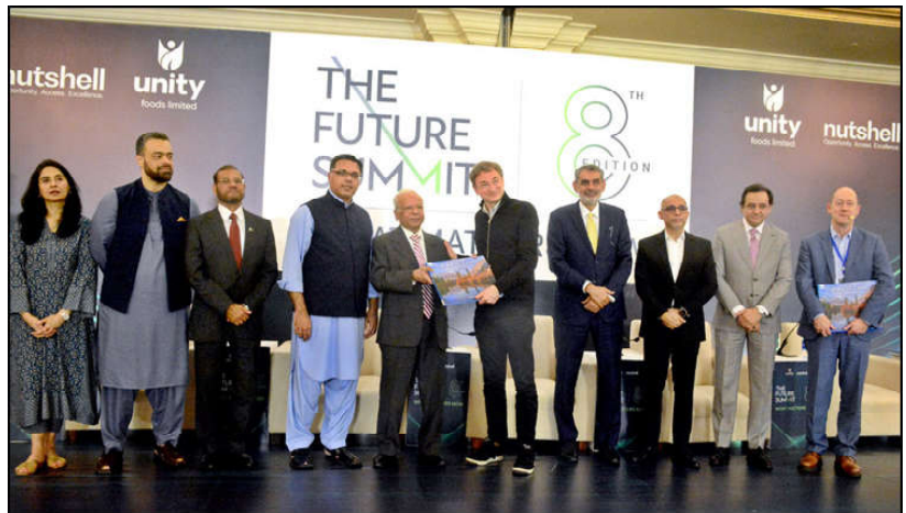
KARACHI: Renowned economist and former SBP governor, Dr. Ishrat Hussain giving away souvenirs to panelists at the Eighth Edition of Future Summit.

Haider Khan said that Pakistan is the best country in the world in terms of agricultural products and its products have a special recognition all over the world. He said that it is a matter of great joy that our rice exports are increasing every year, which is not only increasing the country's foreign exchange but also making the country's name famous at the global level. Governor Punjab said that our basmati rice is an example for the world. He said that by focusing on other crops along with rice, further improvement can be brought to the country's economy. Governor Punjab said that everyone should work together to make the country better and stronger. He said that stability in the country's economy and increasing business opportunities are the promise of a bright Pakistan. Governor Punjab further said that the doors of the Governor House are always open for you people.