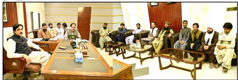
A delegation of elites of Ziarat meeting with Provincial Minister Noor Muhammad Durrani regarding development works and solution of issues.