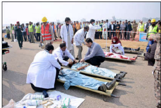
MULTAN: Pakistan Airports Authority Rescue and medical teams provide aid to injured passengers during the Pakistan Airports Authority's emergency exercise at Multan International Airport.

KARACHI (APP): Sindh Senior Minister Sharjeel Inam Memon, Thursday, said that the Sindh government attaches priority to health and education and billions of rupees were invested to make revolutionary strides in both the sectors. Sindh government excels in various areas but a negative propaganda campaign was maliciously launched against the People's Party, attributing inaction and negativity to its governance, the senior minister, who holds portfolios of Information, Transport, Mass Transit, Excise, Taxation, and Narcotics Control, stated while talking to a delegation of Islamabad based journalists here, said a statement issued here. Terming lives and health of the people as top priorities of the PPP and Punjab require help for similar projects. He said that the government was investing billions of rupees in various sectors, including health. The healthcare facilities introduced by the Sindh government serve not only the people of Sindh but also citizens from across the country and even people from neighboring countries were benefiting from these services, he claimed adding that people previously had to travel abroad for transplants but now these facilities were available in Pakistan free of charge. "Chairman Bilawal Bhutto and President Asif Ali Zardari are eager to establish an NICVD (National Institute of Cardiovascular Diseases) in Balochistan," he said and added that the Sindh government is ready to assist wherever KP and Punjab require help for similar projects.