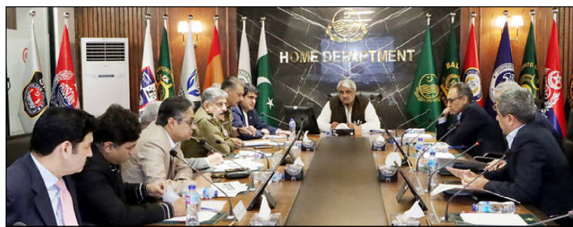
LAHORE: Punjab Minister for health presides over the high level meeting at Home Department.