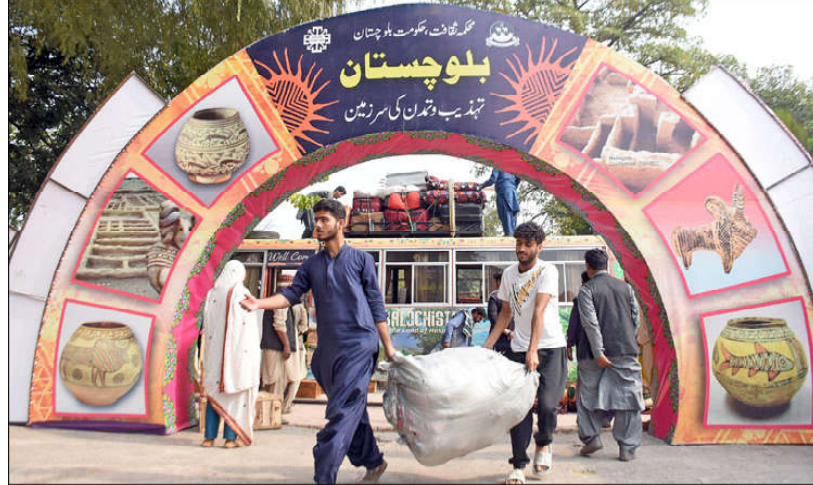
ISLAMABAD: Baloch stall holders carrying Balochi traditional items for displaying on their stall in connection with Lok Mela title "Focusing on the Youth of Pakistan" start on 8 November at Lok Virsa, in the Federal Capital.