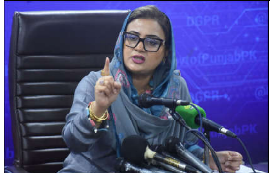
LAHORE: Provincial Information Minister, Azma Bukhari addressing a press conference in the Provincial Capital.

Pakistan Red Crescent conducted a thorough assessment of the situation. A comprehensive report based on the findings will be submitted shortly to further guide the relief efforts. Pakistan Red Crescent Khyber Pakhtunkhwa remains steadfast in its commitment to providing continuous support and assistance to the displaced individuals, ensuring their immediate needs are met with the utmost urgency. It is worth mentioning here that dozens of persons were died and injured during the ongoing clashes between local tribes.