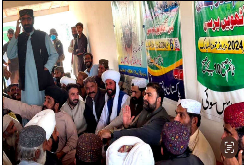
SUI: Chief Minister Balochistan Mir Sarfraz Ahmed Bugti talking with tribal elites and different delegations.