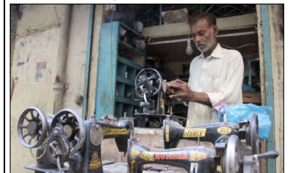
KARACHI: A mechanic busy in repairing sewing machine at his workplace in the Provincial Capital.