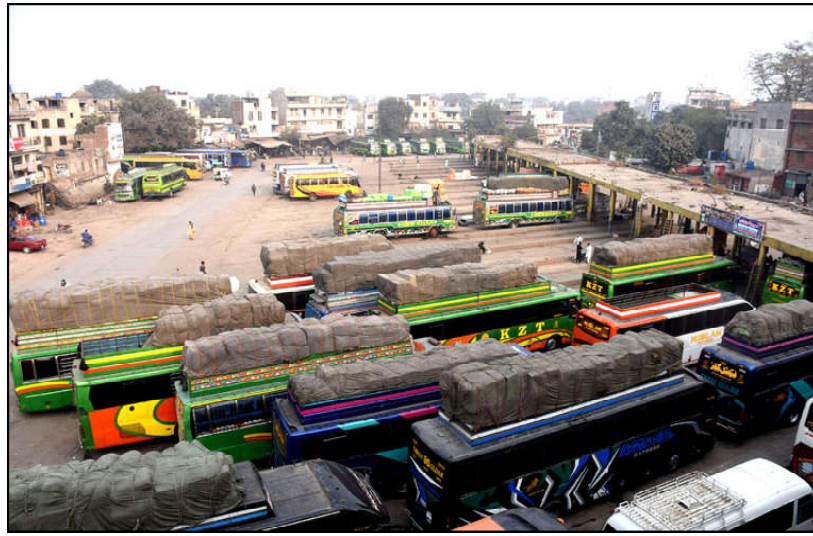
LAHORE: Buses loaded with goods stationed at the lorry stand due to the closure of the Motorway, Ring Road, due to the PTI's Islamabad rally in the provincial capital.

DPM/FM Dar said, similarly, the Belarusian President was due on Monday on his official visit to Pakistan and prior to it, Belarusian ministers and business delegations were also arriving on Sunday.