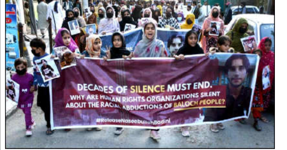
QUETTA: Relatives of missing persons hold a rally of the release of their love ones at Adalat road.