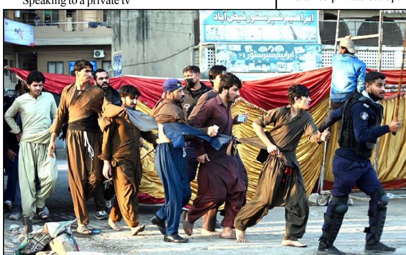
ISLAMABAD: Police taken to arrested Pakistan Tehreek-e-Insaf (PTI) workers towards prison van.

"According to the report, the decrease in exports due to the strikes causes a daily loss of Rs26 billion," said the finance minister.