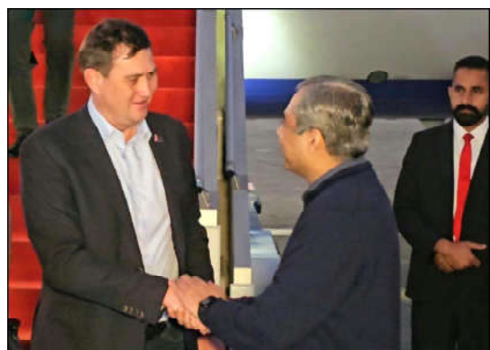
ISLAMABAD: Federal Minister for Interior Mohns Naqvi receiving High level Belarusian delegation on their arrival.