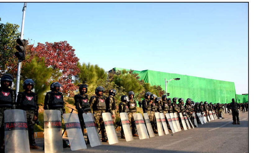
ISLAMABAD: Paramilitary soldiers alert at the D-Chowk in the Federal Capital ahead of PTI protest in the Federal Capital.

PTI is all set to hold a countrywide protest today on the call of PTI founder Imran Khan.