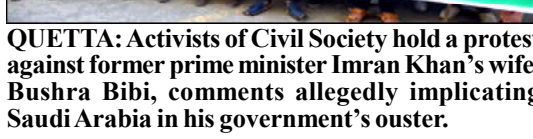
QUETTA: Activists of Civil Society hold a protest against former prime minister Imran Khan's wife, Bushra Bibi, comments allegedly implicating Saudi Arabia in his government's ouster.

Petroleum minister said Pakistan had overcome economic crisis and heading towards stability.