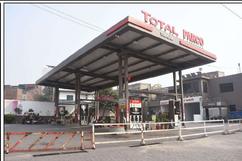
LAHORE: Petrol Pump on Ravi Road closed due to ongoing protest.

In a statement issued here, he said the region holds tremendous potential for trade, energy projects and connectivity initiatives like the China-Pakistan Economic Corridor (CPEC) and the Trans-Afghanistan Pipeline. He said such mega ventures require stability and cooperation, making it imperative for both states to prioritise trust and dialogue bringing an end to perpetual menace of terrorism.