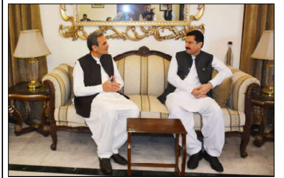
MARDAN: Governor Khyber Pakhtunkhwa Faisal Karim Kundi meets former Chief Minister Amir Haider Khan Hoti at his residence.

the federal level. They cautioned that if immediate attention is not given to maintaining peace in the region, the situation could deteriorate to an alarming extent, potentially spreading instability to other parts of the country. Governor Faisal Karim Kundi stressed the need for all political parties in Khyber Pakhtunkhwa to unite on a common platform to exert pressure on the federal government and secure the province's rights. He also highlighted the importance of a united voice for acquiring provincial financial resources and development funds. Ameer Haider Khan Hoti appreciated the call for unity and acknowledged that cooperation among political parties would not only help resolve public issues but also strengthen the province's political autonomy and stability.