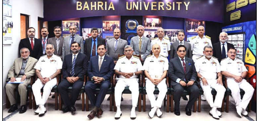
ISLAMABAD: Chief of the Naval Staff Admiral Naveed Ashraf in a group photo with Board of Governors of Bahria University

"Now a days, it is the age of social media and by using social media, lawyers should play their role in highlighting the freedom movement of Kashmir at the global level," he advised the AJK legal fraternity.