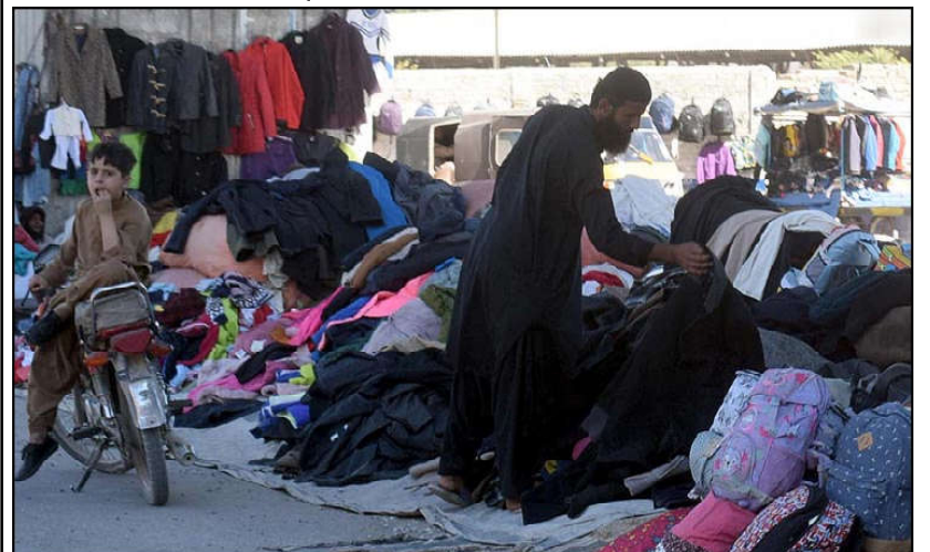
QUETTA: People selecting & purchasing warm cloth from roadside vendor stall after change weather in Provincial capital.

also called for the inclusion of local industries in the Export Facilitation Scheme (EFS), as the absence of industrial development was leading to increased unemployment and social issues among the youth. Regional trade, transit trade, land trade corridors, border markets, and the promotion of barter trade were essential, he observed. Discussing the amendments to the Petroleum Act 1934, he highlighted the need for involving all stakeholders in consultations.