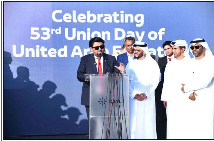
KARACHI: Sindh Governor Kamran Khan Tessori talks to media during his visit to AD Ports.