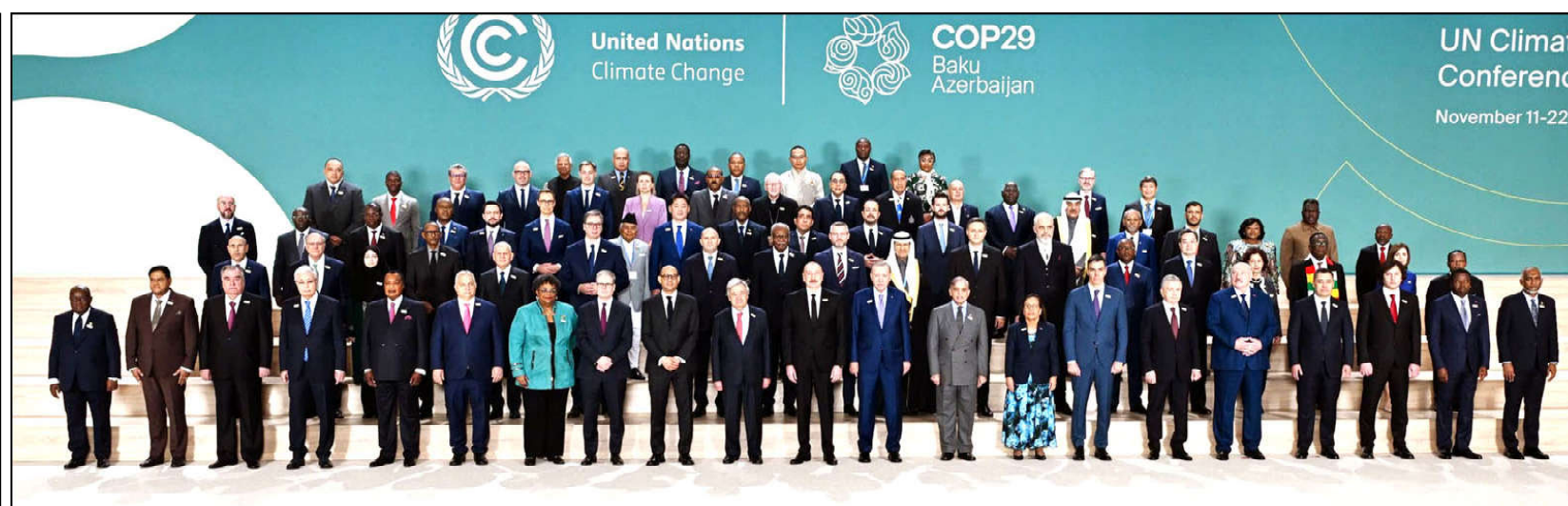
BAKU: Prime Minister Muhammad Shehbaz Sharif in Family Photo at the inaugural Session COP-29 Climate Action Summit in Baku.