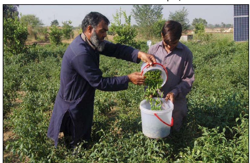
ISLAMABAD: Workers busy in collecting green chili from a field in the outskirts of Federal Capital.

According to the data, as many as 30,625 cars were sold during the months under review as opposed to 20,871 units in the same months of last year. The breakup figures showed that 4,424 units of Honda Civic and City were sold during July-October 2024-25 compared to the sale of 2,239 units during July-October 2023-24. Toyota Corolla and Yaris cars sales increased by 65.05 percent.