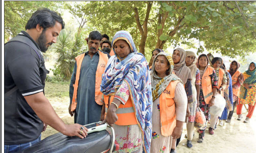
ISLAMABAD: A women sanitary worker provide biometric verification for attendance at sector G-7, in the Federal Capital. Capital Development Authority (CDA) has decided to extend biometric attendance system outside for sanitary workers.

ISLAMABAD (APP): Minister for Kashmir Affairs and Gilgit-Baltistan Engineer Amir Muqam on Wednesday expressed the resolve that the sacrifices and blood of Kashmiris, particularly Martyrs of Jammu, will not go in vain. In his message on Jammu Martyrs' Day, being observed Wednesday, he paid homage to the martyrs saying that the Kashmiris have rendered matchless sacrifices for Pakistan. Amir Muqam said the Indian army in their nexus with Dogra Army and Rashtriya Swayamsevak Sangh martyred three hundred thousand Kashmiris.