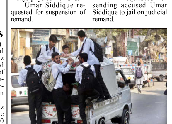
ISLAMABAD: A group of people, including a man in a white shirt, standing together.

ISLAMABAD (APP): Speaker of the National Assembly, Sardar Ayaz Sadiq, on Wednesday paid homage to the martyrs of Jammu, observing November 6, 1947, as a solemn reminder of the "dark day" in history. In his message, Ayaz Sadiq commemorated the sacrifice of over 200,000 unarmoured Kashmiris, who were tragically killed by the forces of Maharaja Hari Singh while migrating to Pakistan. Kashmiris on both sides of the Line of Control and around the world are observing Jammu Martyrs' Day today to reaffirm their commitment to the martyrs' mission for self-determination.