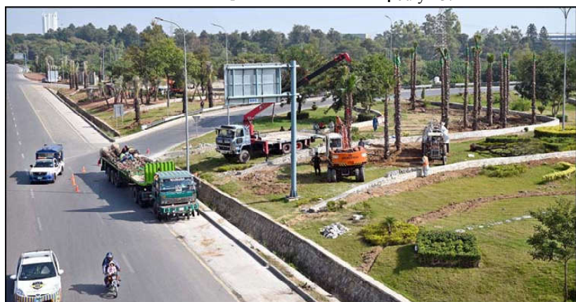
ISLAMABAD: CDA workers busy planting large trees at greenbelt along the 6th Avenue Underpass, Srinagar Highway in the Federal Capital.