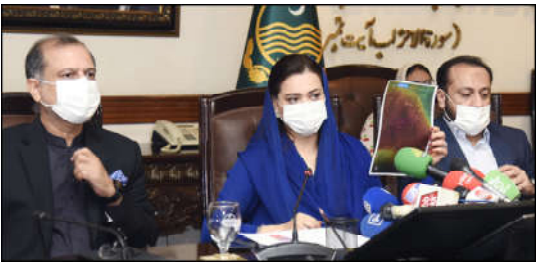
LAHORE: Senior Punjab Minister Marriyum Aurangzeb announces important issues regarding heavy smog in Lahore during a Press conference.