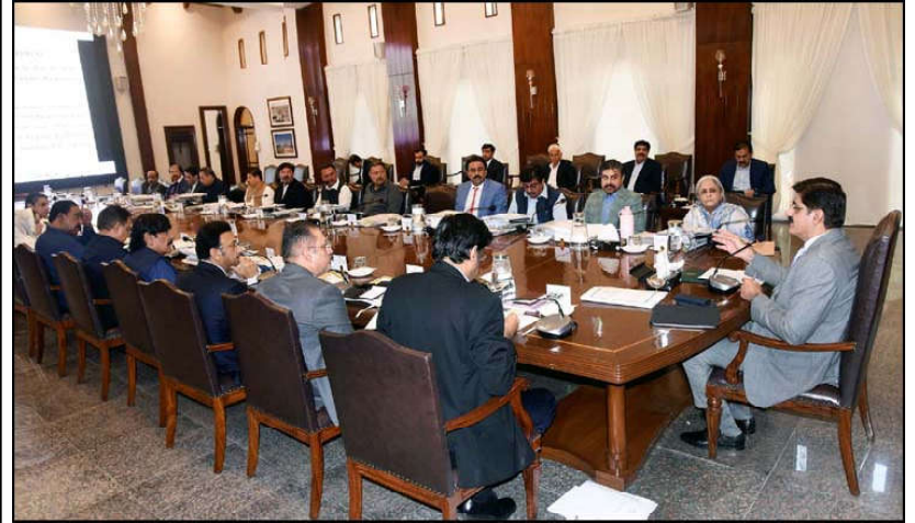
KARACHI: Sindh Chief Minister, Syed Murad Ali Shah presides over a cabinet meeting, held at CM House in Karachi.