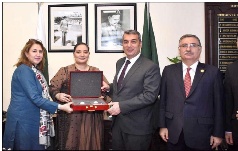
ISLAMABAD: Coordinator to Prime Minister on Climate Change, Romina Khurshid Alam presenting a souvenir to Azerbaijan's Ambassador to Pakistan, Khazar Farhadov, during his visit to her office.

scarcely resources such as fertile land and water. Conflicts involving natural resources have also been found to be twice as likely to relapse. The United Nations attaches great importance to ensuring that action on the environment is part of conflict prevention, peacekeeping and peace building strategies, because there can be no durable peace if the natural resources that sustain livelihoods and ecosystems are destroyed. On 5 November 2001, the UN General Assembly declared 6 November of each year as the International Day for Preventing the Exploitation of the Environment in War and Armed Conflict (A/RES/56/4). On 27 May 2016, the United Nations Environment Assembly adopted resolution UNEP/EA.2/Res.15, which recognized the role of healthy ecosystems and sustainably managed resources.