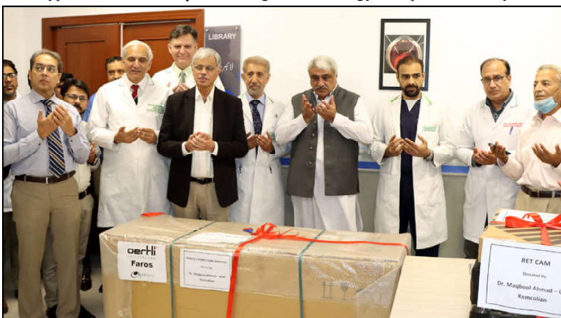
LAHORE: Punjab Minister for health Khawaja Salman Rafique offering Dua after provision of latest equipments for eyes related diseases.

RAWALPINDI (APP): Anti-Narcotics Force (ANF) while conducting three operations recovered over 20 kg drugs worth Rs 1.8 million and arrested two accused, said an ANF Headquarters spokesman here on Wednesday. He informed that in an operation, 1.2 kg hashish was recovered from an accused arrested near a university on Lalazar Road in Rawalpindi. The arrested accused confessed to selling drugs to the students of educational institutions. In another operation, 11.155 kg hashish was recovered from Kohat and 7.200 kg hashish and 1 kg ice were recovered from the possession of an accused rounded up near East Bypass in Karachi.