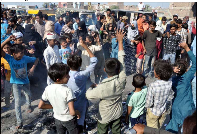
HYDERABAD: Residents of Naya Pul are block road and burn tires as they are holding protest demonstration against prolong electricity load shedding and high inflated electricity bills, at Naya Pul road in Hyderabad.

ISLAMABAD (APP): Pakistan's First Sider honey shipment heads to Malaysia, according to the Federal Minister for Commerce, Jam Kamal Khan's vision leads towards this export milestone. Demonstrating the effectiveness of strategic leadership in enhancing Pakistan's export portfolio, Jam Kamal Khan has overseen a significant breakthrough with the export of the first consignment of Sider honey from Tarnab, Khyber Pakhtunkhwa, to Malaysia, said a press release issued here on Wednesday. The achievement of this milestone is a direct result of the minister's relentless focus on promoting Pakistani agricultural products in the global market. Minister Jam Kamal Khan's vision has been the driving force behind initiatives that have positioned Pakistan as a serious contender on the international stage. The Minister's proactive policies culminated in the success of FoodAg 2024, an event that showcased Pakistan's agricultural capabilities. The Trade Mission at the High Commission of Pakistan in Kuala Lumpur, operating under the minister's directive, played a critical role in facilitating connections between Malaysian companies and Pakistani producers. This effort was notably evident during the Second International Agriculture and Food Exhibition.