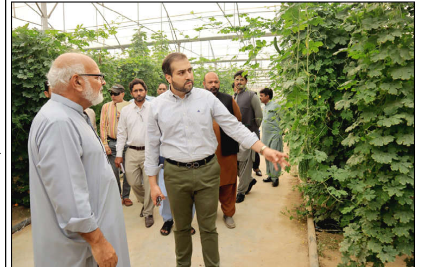
FAISALABAD: Punjab Minister for Agriculture & Livestock Syed Ashiq Hussain Kirmani inspecting the new hybrid varieties of tunnel cultivated vegetables during his visit to Private Seed Company Model Farm.

which is in high demand in Dubai. He pointed out that Pakistani mangoes are sold in Dubai for $10 but, after repackaging, are sold at $120. This underscores the need for value addition in Pakistan's agricultural sector, which requires collective effort from both government and stakeholders. Al-Rumaiti also highlighted that food security is a top priority in the region, adding that many Pakistanis in Dubai often prefer Pakistani mangoes as gifts for their families. He further explained that while the UAE has shifted its focus to economic growth rather than political issues.