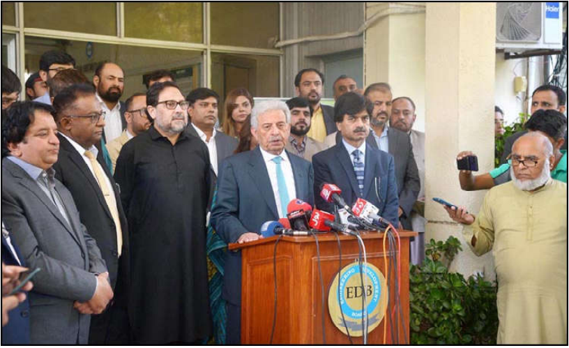
ISLAMABAD: Federal Minister for Industries and Production Rana Taveer Hussain is addressing an unveiling exhibition ceremony of models of electric bikes at Engineering Development Board.