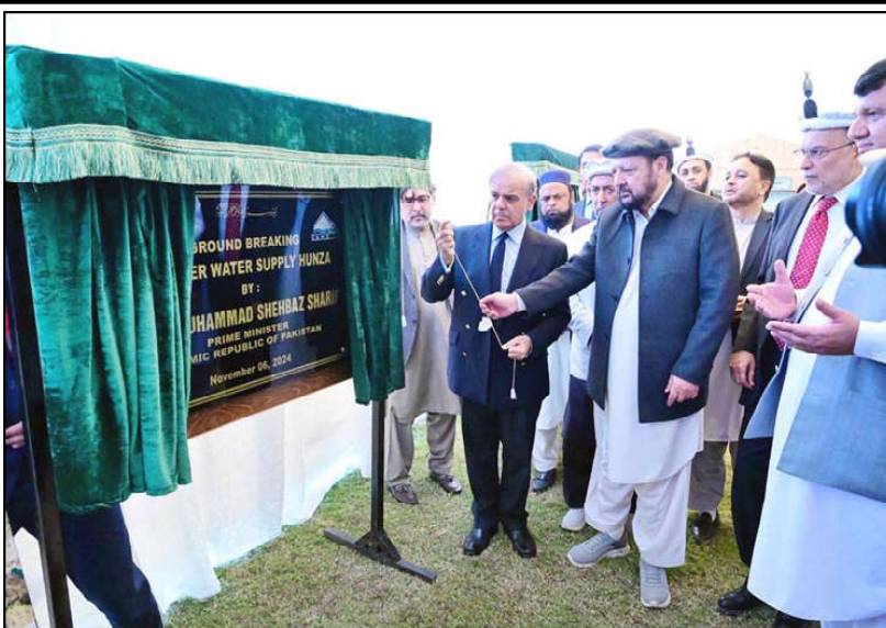
GILGIT: Prime Minister Muhammad Shehbaz Sharif unveils the plaques of groundbreaking and inaugurations of various development projects in Gilgit Baltistan.