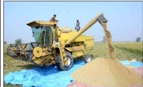
FAISALABAD: Farmers use a thresher to harvest rice crops in the field, efficiently separating grain from the stalk in the field.