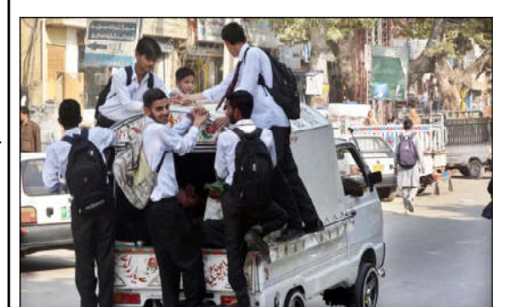
ISLAMABAD: A school van overloaded, posing a high risk to the lives of students and violating traffic laws in the Alipur area of the Federal Capital.