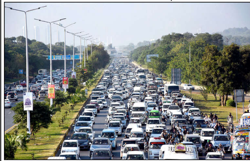
ISLAMABAD: A view of massive traffic jam at Islamabad Highway, in the Federal Capital.