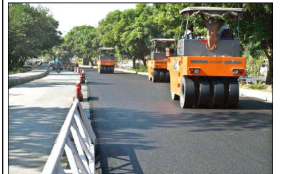
ISLAMABAD: Heavy machinery being used during extension work of Club Road during development work in Federal Capital.

ISLAMABAD (INP): The five-day 28th Annual Conference of International Association of Peacekeeping Training Centre kicked off at Centre for International Peace and Stability, National University of Science and Technology in Islamabad on Monday. The Conference, being hosted for the first time in Pakistan, officially commenced with the inauguration of new CIPS building by Chief of Army Staff, General Syed Asim Munir, the Inter-Services Public Relations (ISPR) said in a press release today.