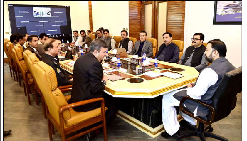
QUETTA: Chief Minister Balochistan Mir Sarfaraz Ahmed Bugti presiding over a high level meeting regarding elimination of polio

He also directed to complete the national electronic immunization in all districts of the province. In this regard, he directed to all the commissioners to extend assistance to the Health department.