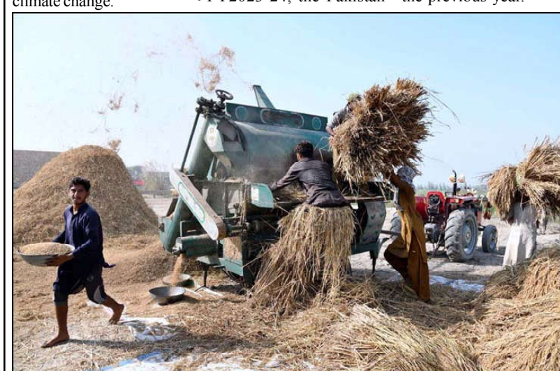
LARKANA: Farmers threshing rice crop at their field near Mashori Sharif Road

Based on the figures, the services trade deficit shrank by 21.77 percent during the first quarter as compared to the corresponding months of the previous year.