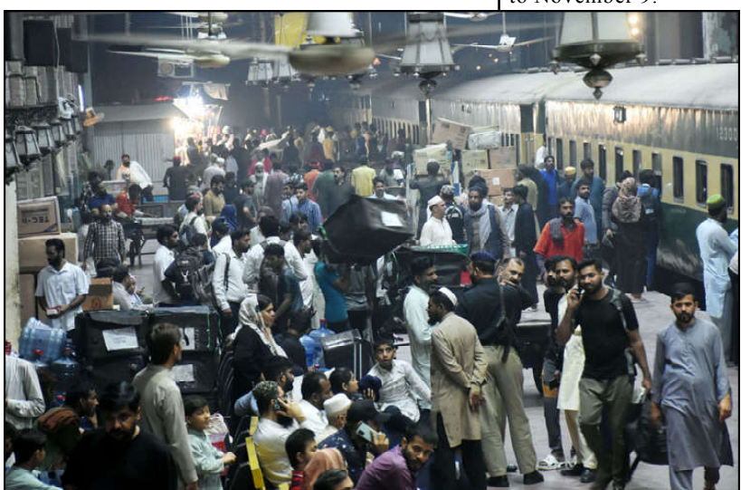
LAHORE: Passengers boarding trains at railway station, Trains' movement delayed due to smog in provincial capital.

On this occasion, the District Police Officer said in his message that the Nowshera Police is determined to take strong actions against those who create distortions in the society and especially those who darken the future of the builders of the nation and to punish them. Nothing will be compromised to fulfill the commitment.