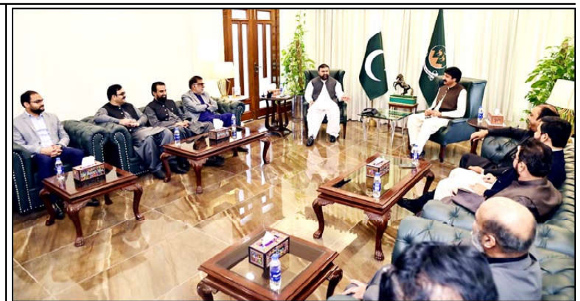
QUETTA: Governor Punjab Sardar Saleem Haider Khan meeting with Chief Minister Balochistan Mir Sarfaraz Ahmed Bugti

This visit provides an important opportunity to advance cooperation and dialogue between Pakistan and Iran on a wide range of areas including trade, energy and security.