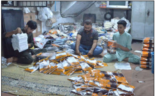
FAISALABAD: Vendors busy in packing vests at the hosiery market in Jinnah Colony.