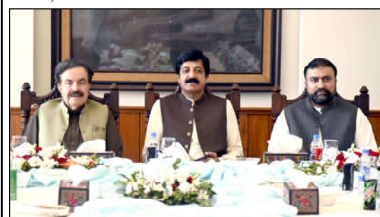
QUETTA: Governor Punjab Sardar Saleem Haider Khan and Governor Balochistan Sheikh Jaffer Khan Mandokhail attending luncheon hosted by Chief Minister Balochistan Mir Sarfaraz Ahmed Bugti

Matters of mutual interest were discussed during the meeting. Chief Minister Mir Sarfaraz Bugti briefed the Punjab Governor on ongoing initiatives for reforms and improvements in various sectors, including good governance, health, and education in the