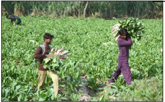
FAISALABAD: Farmers carrying freshly harvested radishes for transport to the vegetable market.

Mr. Aurangzeb also expressed his confidence in Pakistan's economic growth and the government's commitment to creating a conducive environment for both domestic and foreign investments.