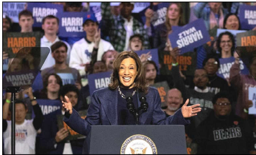
Democratic presidential nominee US Vice President Kamala Harris speaks during a campaign rally at Michigan State University in East Lansing, Michigan, U.S.