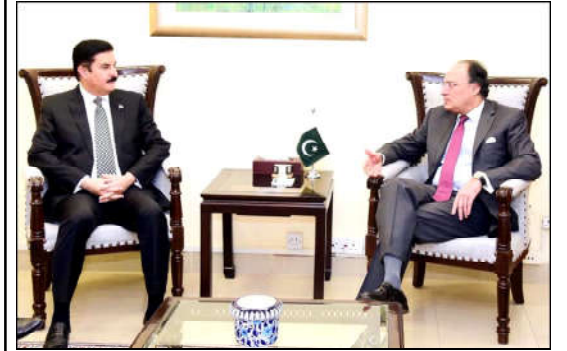
ISLAMABAD: Mr. Faisal Karim Kundi, Governor Khyber Pakhtunkhwa (KPK), called on the Federal Minister for Finance and Revenue, Senator Muhammad Aurangzeb, at the Finance Division.