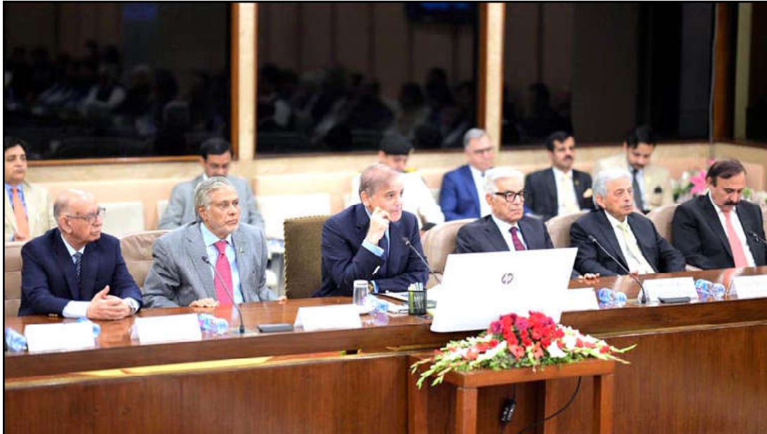
ISLAMABAD: Prime Minister Muhammad Shehbaz Sharif chairs a meeting of the PML-N's Parliamentary Party at Parliament House.

Ph: 2841470/2841473 REG: No. BC-116 B/ID-445 Vdt XXVI No 75, Jamaadi ul Awwal 02, 1446 AH Tuesday November 05, 2024 Pages 08, Price Rs.15