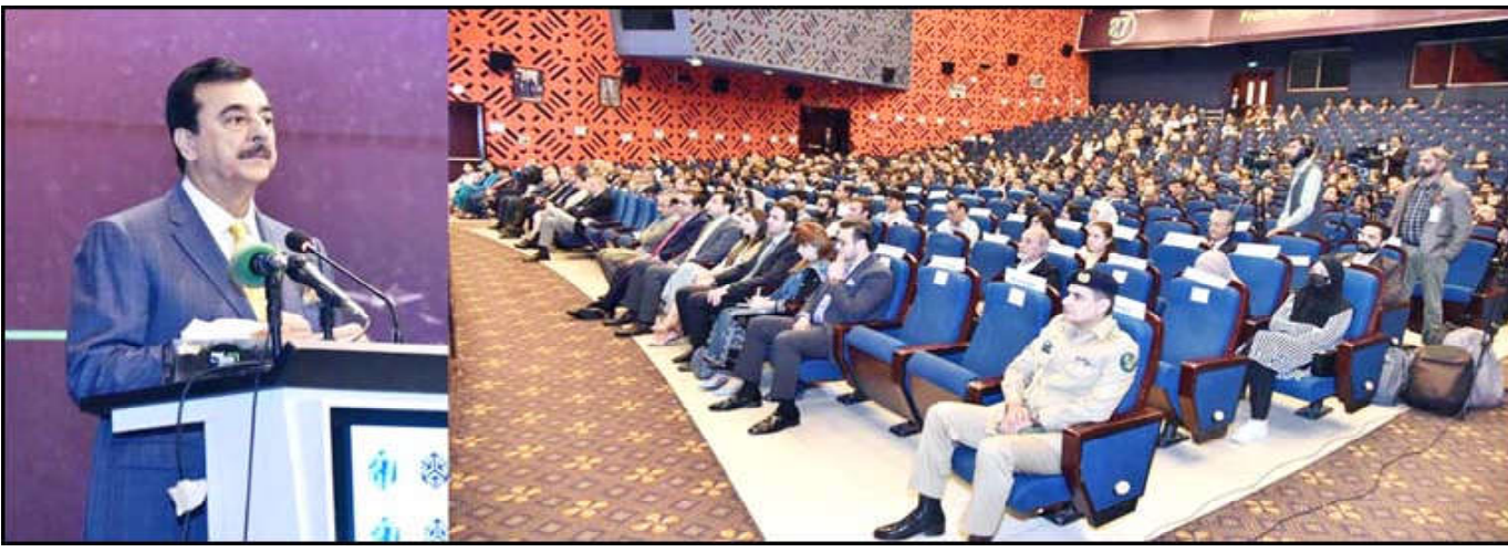
ISLAMABAD: Acting President Syed Yousaf Raza Gillani addressing the inaugural plenary of the 27th Sustainable Development Conference at Pak-China Friendship Centre.