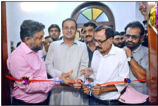
Corner at the Karachi Press Club library.

Present at the occasion were the President