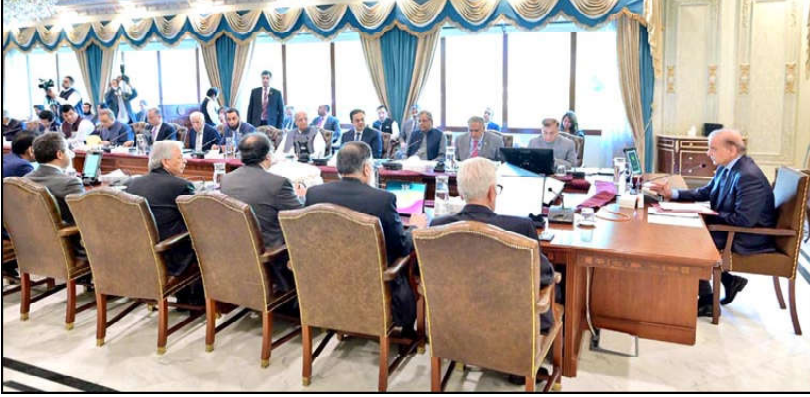
ISLAMABAD: Prime Minister Muhammad Shehbaz Sharif chairs the Federal Cabinet Meeting.

Matter of fact remains that those elements opposing the move are exactly not known to the benefits and advantages, the beloved country is going to have in the long run. Or at least these elements don't want to see Pakistan progressing.