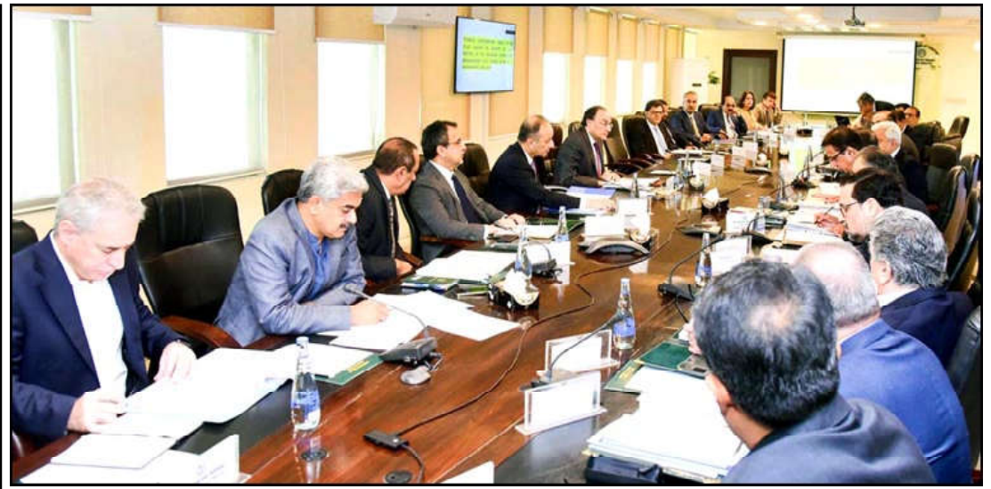
ISLAMABAD: Federal Minister for Finance and Revenue, Senator Muhammad Aurangzeb, chaired the meeting of the Economic Coordination Committee (ECC) at the Finance Division.

He expressed disappointment at the lack of response from powerful nations regarding the ongoing violence against Palestinian civilians.