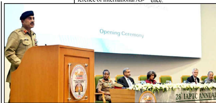
ISLAMABAD: Chief of Army Staff (COAS) General Syed Asim Munir addressing 28th Annual Conference of International Association of Peacekeeping Training Centre (IAPTC)

The Governor also said that it is our objective to prepare the educated and skilled youth who may contribute in development of their areas.