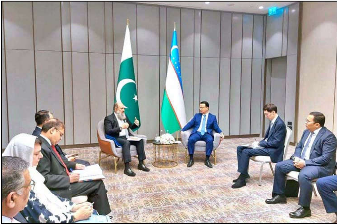
TASHKENT: Pakistan's Minister for Commerce, Jam Kamal Khan, engages in discussions with Uzbekistan's Minister of Investment, Industry and Trade, Laziz Kudratov.