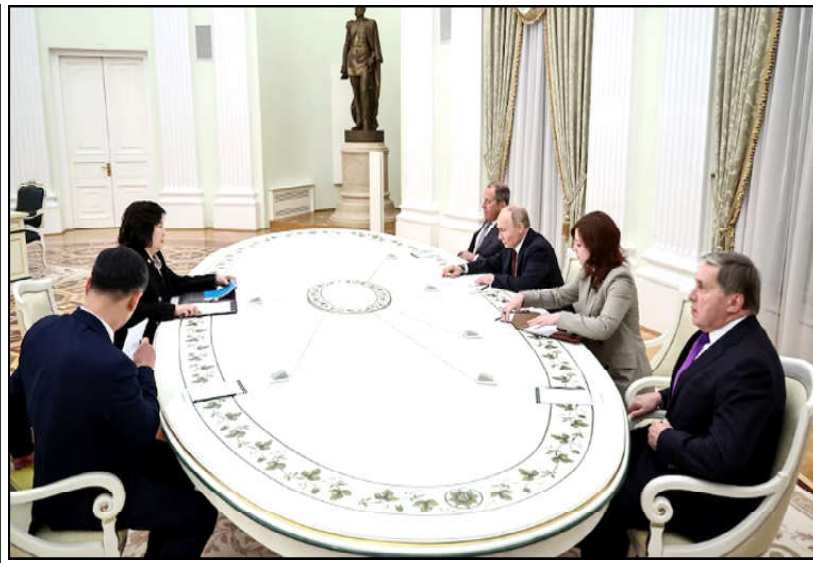
Members of the delegations, led by Russian President Vladimir Putin and North Korean Foreign Minister Choe Son Hui, attend a meeting in Moscow, Russia.

In a background briefing with local media Monday, South Korea's military said North Korea has built anti-tank, trench-like structures at two sites near the heavily armed border, where it blew up northern parts of unused cross-border road and rail routes last month in a display of anger toward South Korea.