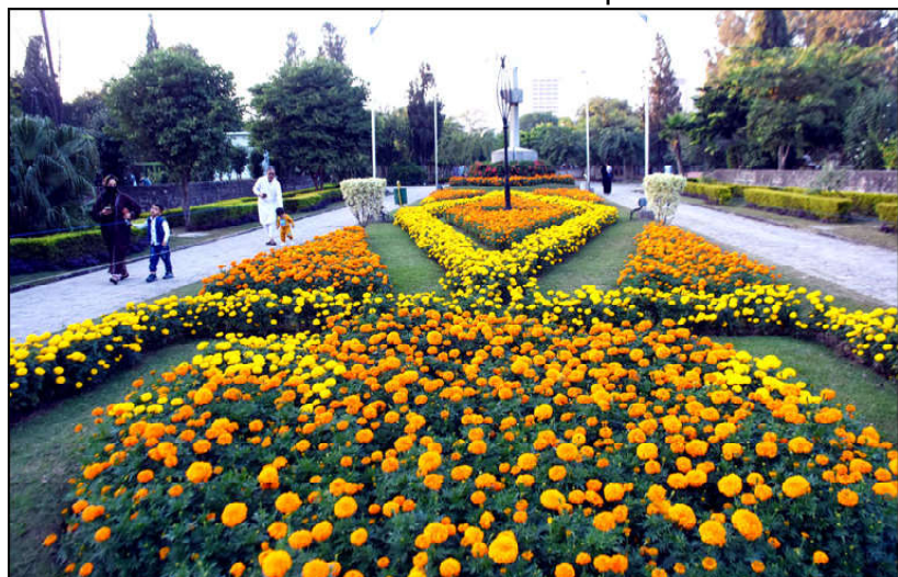
ISLAMABAD: Blossoming Yellow and Orange Marigold flowers in Argentina Park of Sector G-6 in the Federal Capital.