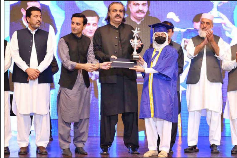
PESHAWAR: Chief Minister KP Ali Amin Gandapur giving degree and trophy to graduate student during the graduation ceremony under Alternate Learning Pathways Initiative of Elementary and Secondary Education Department at Nishtar hall.

The average rate of smog in the city was less than the previous day, but the situation is still alarming. In order to protect children from the polluted atmosphere, holidays have been announced in the primary schools of Lahore from November 4 to November 9.