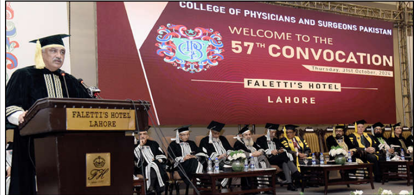
LAHORE: Punjab Minister for Health Khawaja Salman Rafique addressing the 57th convocation ceremony of CPSP at local hotel.

Governor Sindh said that for the last two years, ration is being distributed to thousands of deserving people every day.