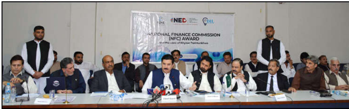
PESHAWAR: Governor Khyber Pakhtunkhwa Faisal Karim Kundi addressing NFC Award seminar at University of Peshawar.

and empowerment of women so that they could easily contribute in the national development without any fear of violence. In the past, the women were brutally treated and denied for their rights, but now their rights would be protected at all levels, she said, adding that strict action would also be taken against the violators without any discrimination.