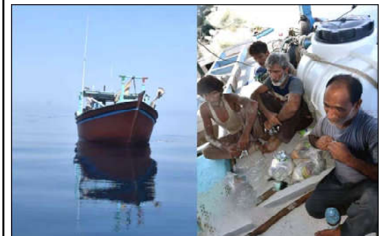
KARACHI: Maritime Security Patrol rescued an Iranian Fishing Dhow AL MUHAMMADI with 23 fishermen onboard, stranded over 1200 Nautical Miles from its home port.

He outlined the Pakistani government's commitment to providing a conducive environment for foreign investors and discussed potential incentives to facilitate their entry into the Pakistani market.