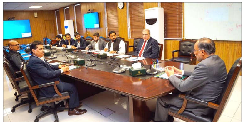
Federal Minister for Planning & Development, Ahsan Iqbal Chairing a meeting to review the progress of ongoing projects under the CPEC in Islamabad.