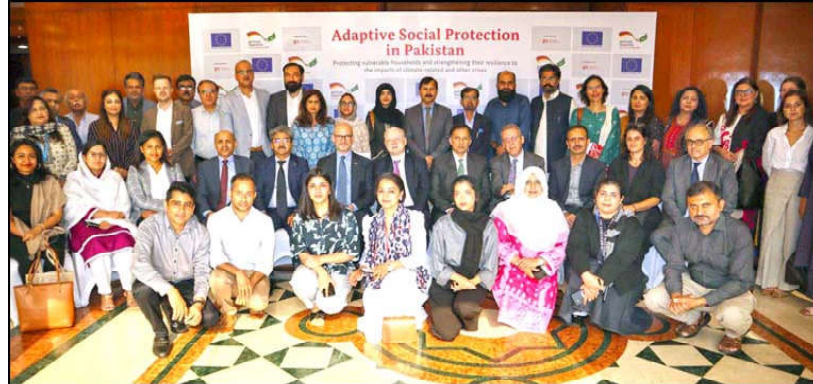
EU, Germany, and ASP project leaders unite to strengthen climate resilience and social protection in Sindh.

ISLAMABAD (APP): Chairman Pakistan People's Party (PPP) Bilawal Bhutto Zardari has warmly extended his warmest greetings to the Hindu community in Pakistan and around the world on the auspicious occasion of Diwali. This festival of lights reflects the universal principles of unity, peace, and goodwill that enrich Pakistan's diverse cultural heritage. In a message issued by the Media Cell Bilawal House, he extended his congratulations and best wishes, acknowledging the valuable contributions of the Hindu.