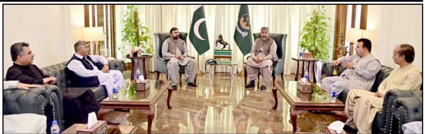
QUETTA: A delegation of Quetta Chamber of Commerce meeting with Balochistan Chief Minister Mir Sarfraz Ahmed Bugti.