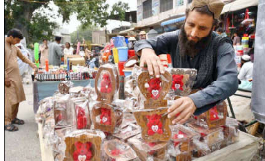
PESHAWAR: A vendor displaying beautiful decoration pieces on his handcart to attract customers near Mohallah Jhangi.