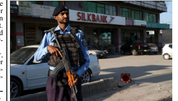
ISLAMABAD: A police personnel stand alter outside bank after recent robbery incident in Federal capital.

Control Authority (PSQCA). Some 12 brands including Natural Pure Life, Bro H2O, Purifa Spring Water, Aqua Health, Meher Natural, Mountain Pure, Oslo, Smart Pure, Fiji, More Plus, Qudrat, and Natural were found to be unsafe due to the presence of higher levels of sodium, two brands (Black Seed Water, Natural) were found unsafe due to presence of high level of Turbidity than the permissible limit, said a press release issued here Thursday.