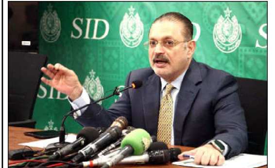
KARACHI: Sindh Minister for Information, Transport and Mass Transit, Excise Taxation and Narcotics Control, Sharjeel Inam Memon addresses to media persons during press conference, held in Karachi.

The initiative reaffirms the government's commitment to supporting journalists and acknowledging their role in society.