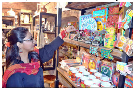
LAHORE: A Women browses and selects handcrafted decorative items especially truck art at a handicrafts shop near Delhi Gate.

Independent Report KARACHI: As per directions of honorable Minister of Science and Technology, the Director Conformity Assessment CA Islamabad Zone assigned the task to Conformity Assessment Officers of Islamabad Zone for crackdown against Illegal / Sub-Standards and Non-Licence Products. In this regard Assistant Director and Field Officer conducted Market Surveillance of food and non-food mandatory products. Non-licence brands without having PS Mark on label found in Super Stores and were de-shelved. During the crackdown against illegal keeping in stock and sale, some mandatory items such as Skin Cream, Toilet Soap, Hair Dye, Iodized Salt, Red Chilli Powder, Fruit Drinks, Pickles and Jams were found illegal / Non-Licence. The Manager of Departmental Stores were given notices to avoid keeping in stocks of mandatory food and non-food items/brands, which are not licensed and duly marked PS logo. They were also warned that in case of non-compliance of the directives of the Authority, the illegal/un-licensed items will be confiscated and strict legal action will be taken. Furthermore, notices are being issued to manufacturers of such identified illegal/unlicensed brands under section 14 of PSQCA Act 1996 to refrain from manufacturing.