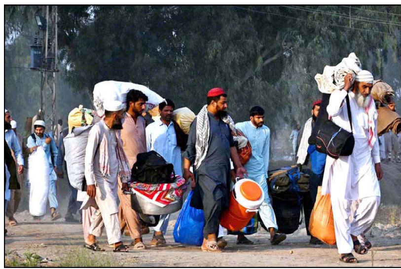
LAHORE: A large number of people arrives to attend three-day religious congregation during the annual Tablighi Ijtima in Raiwind in the outskirts of the city.