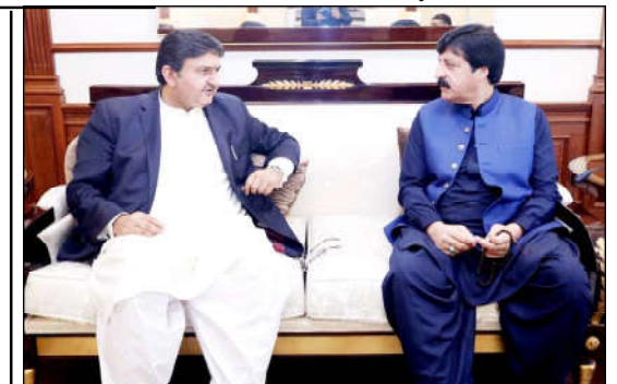
LAHORE: Speaker Punjab Assembly Malik Muhammad Ahmad Khan meeting with Governor Punjab Sardar Saleem Haider Khan.

The brothers belonged to the Khesghi Bala area of Nowshera district.