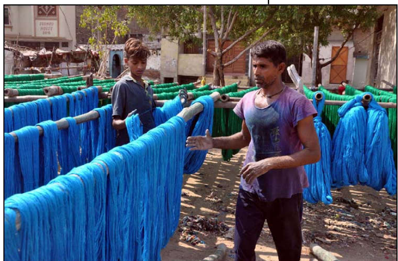
HYDERABAD: Laborers are busy in drying threads, which they use to prepare clothes to earn their livelihood for support their families, at a workplace in Hyderabad.

ISLAMABAD (APP): Federal Board of Revenue (FBR) on Thursday launched an advanced Stock Register system via the Information Center 2.0 platform to provide officers real-time, in-depth access to registered persons' data, bolstering transparency and securing compliance with Income Tax (IT) and Sales Tax (ST) regulations. The board has launched the system under the direction of the Chairman FBR and as part of FBR's comprehensive digitalization efforts to optimize tax administration and boost revenue collection, said a news release. The system functions as a sophisticated management information and reporting system, empowering tax officers to securely retrieve detailed stock data to facilitate precise tax assessments and mitigate the risk of tax evasion. The system centralizes taxpayer profiles, offering thorough views of IT & ST filing histories, summaries, and authorized representative profiles. This integrated access is further strengthened by tax and declaration comparisons, providing comprehensive oversight capabilities. By meticulously recording stock movements and capturing essential details such as quantities, valuations, and transaction dates, the system enables tax officers to enforce regulatory compliance and validate accurate stock and compliance reports. The Information Center 2.0 portal enhances FBR's capacity.