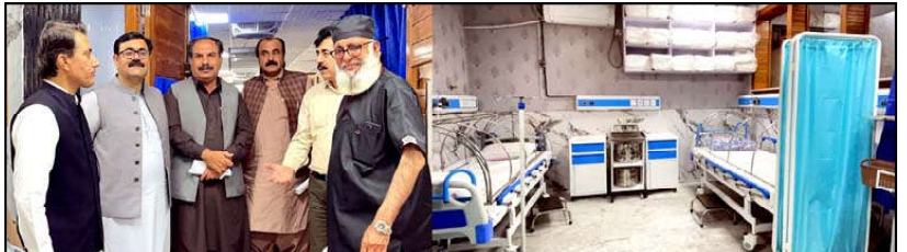
QUETTA: Provincial Minister for Health Bkhat Muhammad Kakar inspecting the burn unit at Quetta Civil Hospital. Secretary Health Mujeebur-Rehman Panezai is also present.