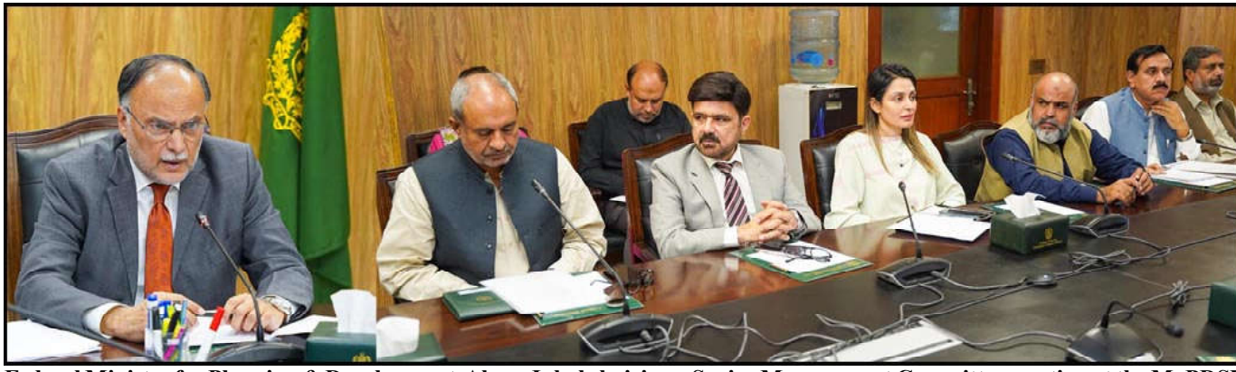
Federal Minister for Planning & Development, Ahsan Iqbal chairing a Senior Management Committee meeting at the MoPDSI, focusing on strategic planning and key national projects in Islamabad