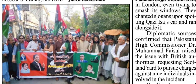
QUETTA: Leaders and activists of Peoples Party (PPP) are holding celebration demonstration on approval of the 26th constitutional amendment, held at Quetta press club.

Independent Report ISLAMABAD: Pakistan Navy Ship ZULFIQUAR while deployed on Regional Maritime Security Patrol rescued an Iranian Fishing Dhow AL MUHAMMADI with 23 fishermen onboard, stranded over 1200 Nautical Miles from its home port. PNS ZULFIQUAR promptly responded to distressed call of Fishing Dhow AL MUHAMMADI. Upon communication with Pakistan Navy Ship, Fishing Dhow reported a seriously injured crew member as well defective engine and requested for necessary assistance. PNS ZULFIQUAR swiftly responded and dispatched its medical and technical teams which provided First Aid to the injured fisherman.