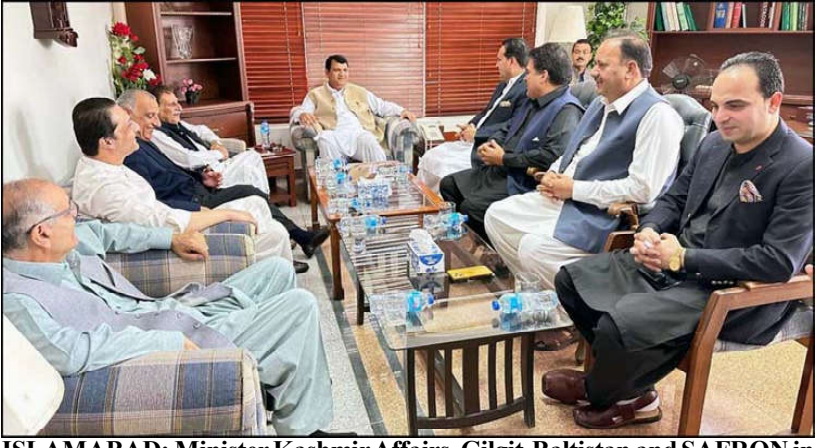
ISLAMABAD: Minister Kashmir Affairs, Gilgit-Baltistan and SAFRON in a meeting with PML-N leadership Azad Jammu Kashmir.

nations but also contribute to building a prosperous and peaceful future for the region and the Islamic world, he added. Bringing a collaborative approach between universities and industries is crucial for fostering innovation, economic growth, and mutual benefit, he said, adding, this synergy enables the exchange of knowledge, resources, and expertise, ultimately leading to better research outcomes and industry applications. Federal Minister also revealed that Saudi Arabia has significantly expanded its investment portfolio in Pakistan, surpassing $2.8 billion, adding, additionally, Denmark and Russia have expressed keen interest in investing in the country.