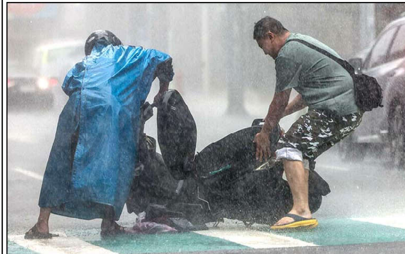
A man helps a motorist with a scooter amid heavy rain due to Super Typhoon Kong-rey in Keelung.

He reiterated the kingdom's position that it would not recognise Israel without a Palestinian state, adding on that proposed step, Saudi Arabia is "quite happy to wait until the situation is amenable," before moving ahead with normalisation. "We look at just what's happening now in north (Gaza) where we have a complete blockade of any access for humanitarian goods coupled with a continued military assault without any real pathway for civilians to find shelter, to find safe zones, that can only be described as a form of genocide," he said.