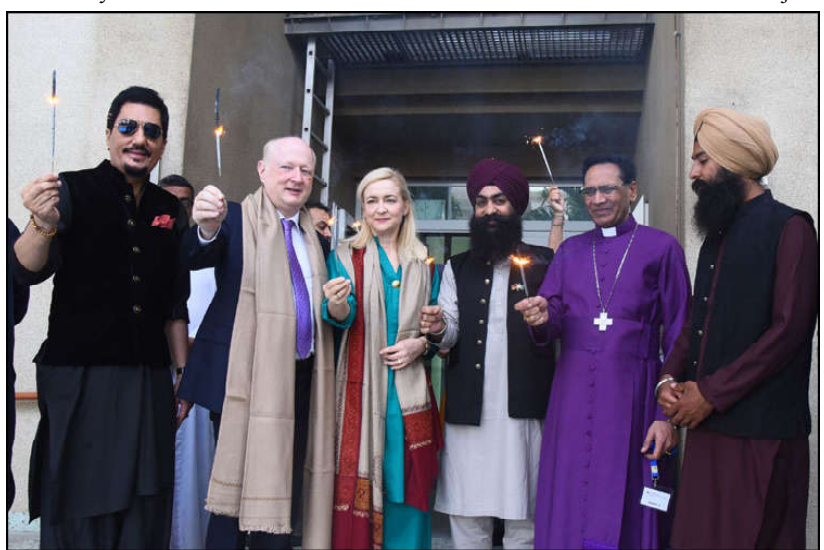
KARACHI: German Consul General Rüdiger Lotz, and others lighting snurburn on the occasion of the Hindu festival of Diwali at the German Consulate.