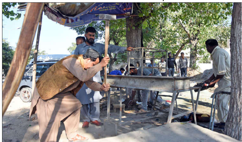
ISLAMABAD: Workers of Capital Development Authority (CDA) Enforcement taking part in Anti-Encroachment drive at sector G-7.

ings, arbitrary arrests, and torture surfacing daily. The introduction of draconian laws is seen as a calculated move to alienate the Kashmiri people in their land. According to analysts, India's approach toward Kashmir is rooted in stubbornness, which impedes genuine efforts to resolve the long-standing dispute. They stress that only by granting Kashmiris the right to self-determination can true peace and normalcy be achieved in the region. Despite India's attempts to subdue the spirit of the Kashmiri people, experts contend that the strong resistance and unyielding desire for freedom among Kashmiris.