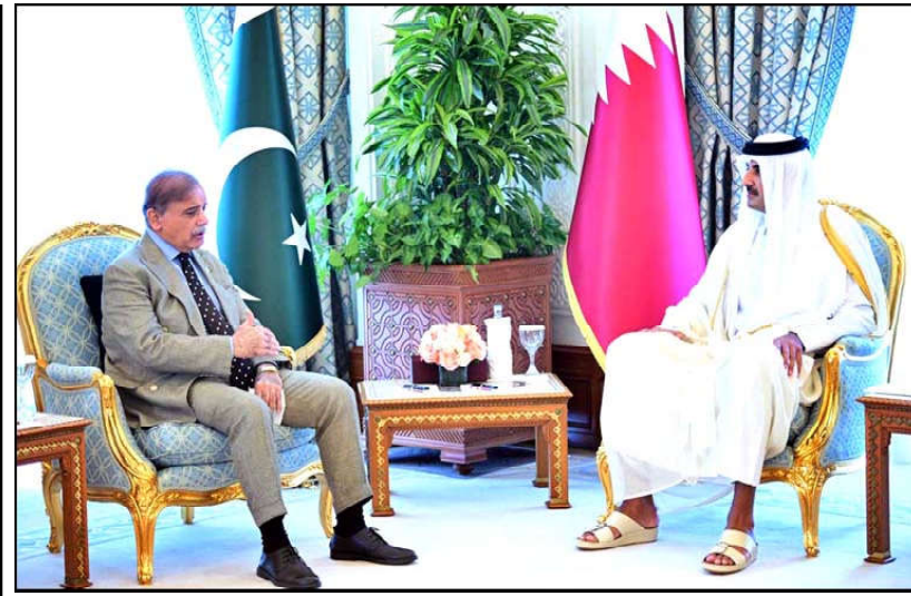
DOHA: Prime Minister Muhammad Shehbaz Sharif meets with Amir of Qatar His Highness Sheikh Tamim bin Hamad Al Thani.

As per the documents, federal ministries and divisions have informed the Establishment Division of their compliance with the federal cabinet's decision.