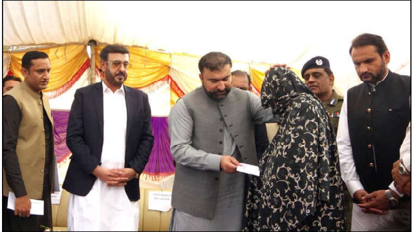
MULTAN: Chief Minister Balochistan Sarfraz Bugti is giving cheques to the family members of laborers killed in terrorist attack in Balochistan at Shuja Abad.