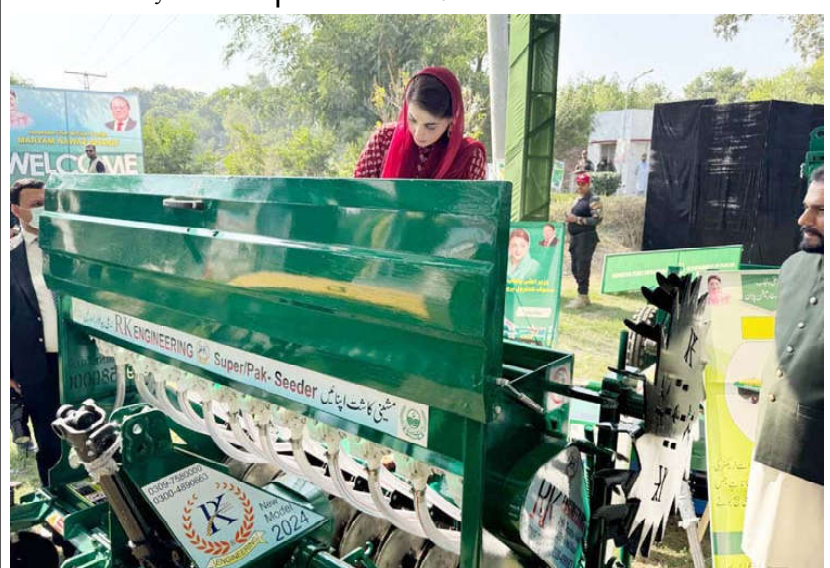
LAHORE: Chief Minister Punjab, Maryam Nawaz Sharif inspecting the Super Seeder during her visit to Rice Research Institute located on Kala Shah Kaku in Lahore.