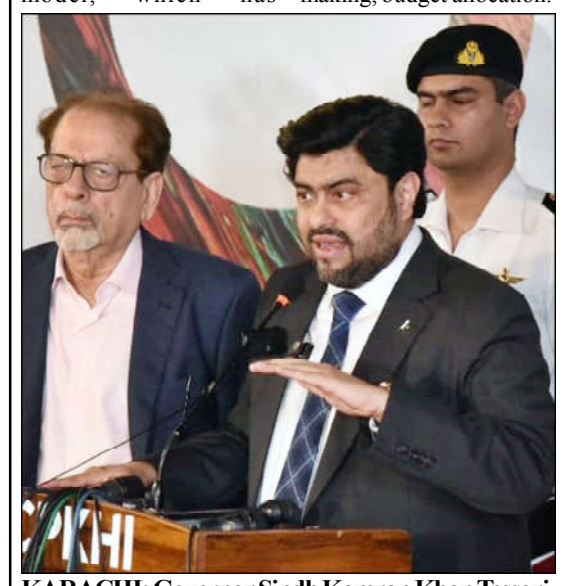
KARACHI: Governor Sindh Kamran Khan Tessori, talking to media persons during attending on the occasion of the German Artists performance in "Jazz Music," during World Culture Festival Karachi 2024 at Arts Council of Pakistan.

Traditionally, Sindh's education department has functioned under a centralized model. STA DEEP provided technical support to SELD to implement the school clustering policy that decentralizes decision-making, budget allocation.