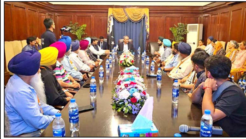
LAHORE: Interior Minister Mohsin Naqvi in a meeting with Sikh Yaatri delegation from USA at State Guest House.