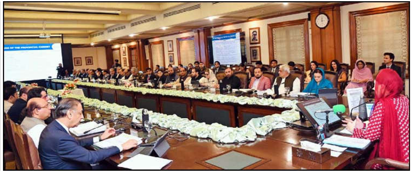
LAHORE: Chief Minister Punjab, Maryam Nawaz Sharif chairs provincial cabinet meeting held in Lahore.

Elderly farmers came to thank Chief Minister Maryam Nawaz. They put their hands on her head to show affection, and wore her 'chadar' brought from Marina. They said that Maryam Nawaz Sharif has raised the head of Punjab and the farmers of Punjab.