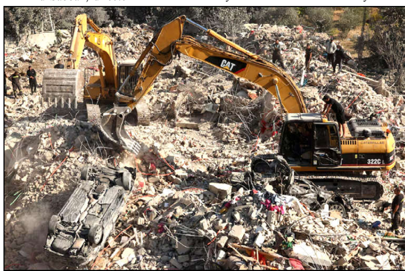
Excavators operate at the site of an Israeli strike, amid ongoing hostilities between Hezbollah and Israeli forces, in the southern Lebanese town of Sarafand, Lebanon.