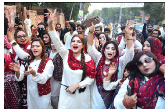
HYDERABAD: Women participate in a rally in connection with upcoming Sindhi Culture Day outside Press Club.

He instructed all assistant commissioners to expedite the work of recovery of agricultural income tax and submission of agricultural income tax return files from account holders.