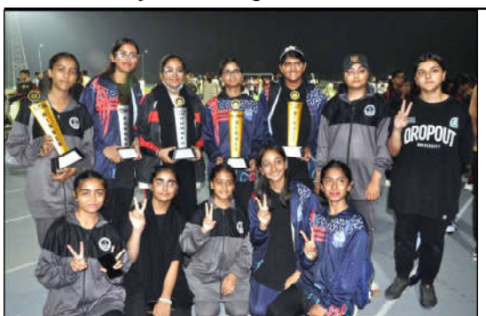
HYDERABAD: Players of winning team are in a group photo during the Iqbal Day Sports Festival held at Public School in Hyderabad.