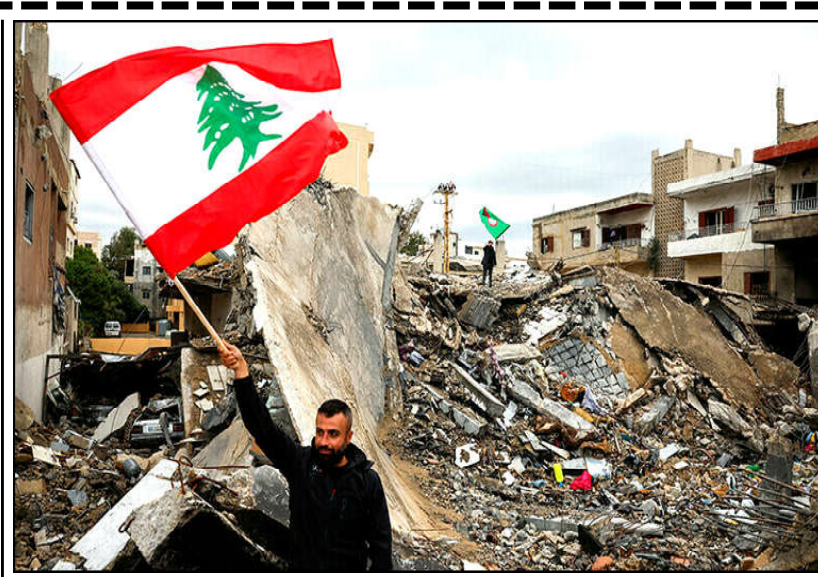
A man waves a Lebanese flag as he stands amidst the rubble of a building destroyed in Israeli strikes in Tyre, Lebanon.

Cyclones - the equivalent of hurricanes in the North Atlantic or typhoons in the northwestern Pacific.