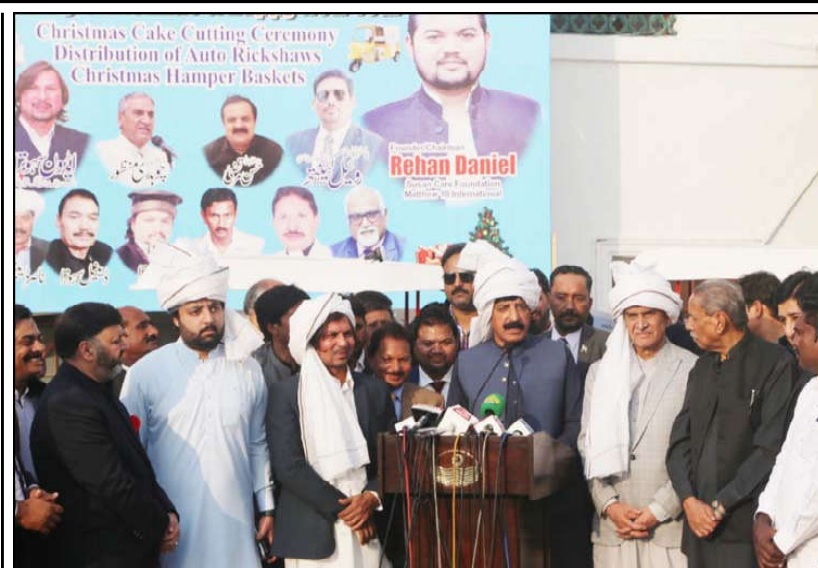
LAHORE: Governor Punjab Sardar Saleem Haider Khan addressing the distribution ceremony of rickshaws at Governor House organized by Lahore Presbytery Church and Vice President of People's Party Minority Wing Central Punjab, Advin Sahotra.

outsourcing of Solid Waste Management Services. More than 21 thousand cleaning machinery and 83,000 cleaning equipment will be provided. Door-to-door waste collection will be carried out from 15 lakh houses of Lahore due to outsourcing of Solid Waste Management. It was further apprised in the meeting that cleanliness will be ensured in 500 markets and 400 villages of Lahore. 540 workers will be hired to ensure cleanliness measures in Lahore. 10 loader rickshaws will be distributed in every union council of Lahore. The Chief Minister directed to maintain equal cleanliness quality measures in every street and town. She asserted.