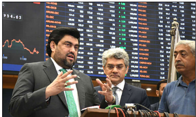
KARACHI: Governor Sindh, Kamran Khan Tesori along with MD Stock Exchange addressing a press conference at PSE, as Pakistan Stock Exchange (PSE) crosses benchmark share index 1,00,000 mark for the first time.

He said that the Belarusian President and his delegation was present in the red zone when the PTI protesters besieged the capital.