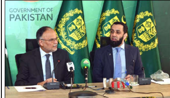
Mr. Attaullah Tarar, Federal Minister for Information & Broadcasting briefing the representatives of International media along with Mr. Ahsan Iqbal, Federal Minister for planning & development in Islamabad.

The visiting delegation, comprising parliamentarians, politicians, bureaucrats, Armed Forces officers, members of the media, and representatives of civil society, highly appreciated Pakistan Navy’s efforts.