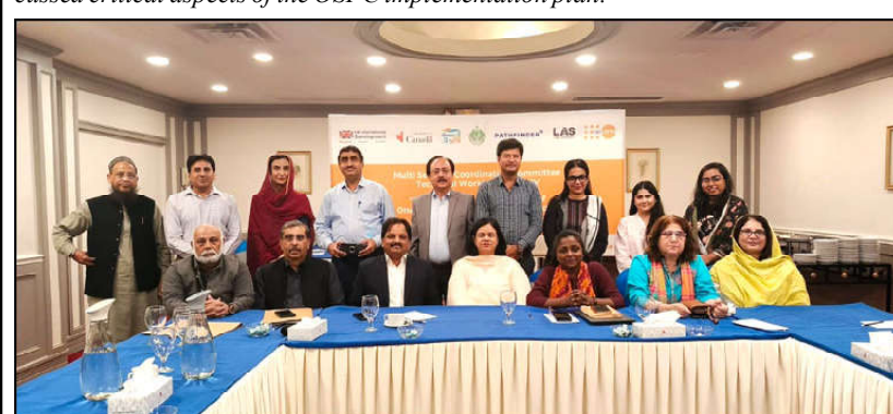
During the meeting, the participants engaged in detailed discussions on the three (03) core components vital for the success of the OSPC initiative: Human Resource Development, Infrastructure, and the Service Delivery System. These discussions are central to ensuring that the One Stop Protection Centers provide a comprehensive, efficient, and survivor-centric approach to addressing Gender-Based Violence (GBV). A major highlight of the meeting was the focus on the OSPC in Hyderabad, which is set to be established in 2024-2025. The Hyderabad center will serve as a model for future OSPCs across Sindh, creating a uniform system to better address GBV in the province.

Independent Report KARACHI: A key meeting was held by the Multi-Sectoral Coordination Committee Technical Working Group-IV on "Operationalization of One Stop Protection Centers (OSPCs) in Sindh." A major highlight of the meeting was the focus on the OSPC in Hyderabad, which is set to be established in 2024-2025. The Hyderabad center will serve as a model for future OSPCs across Sindh, creating a uniform system to better address GBV in the province.