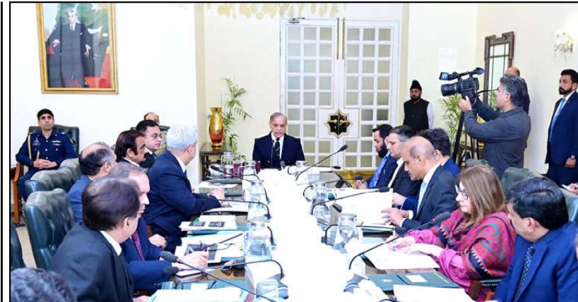
ISLAMABAD: Prime Minister Muhammad Shehbaz Sharif chairs a meeting regarding law and order situation.

The prime minister said, “Instead of following legal procedures, repeated efforts were made to create chaos by mobilizing forces towards Islamabad, attempting to spread unrest across the country.”