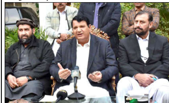
PESHAWAR: Federal Minister for Kashmir Affairs, Gilgit-Baltistan and SAFFRON Engr. Amir Muqam addressing a press conference at his residence.

Mir Tariq Ali Khan Talpur described the People’s Housing Scheme as a historic project of the Sindh Government, stating that under this initiative, 2.1 million houses are being constructed for deserving individuals.