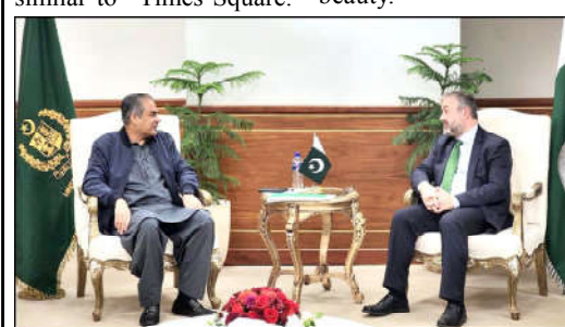
ISLAMABAD: Interior Minister Mohsin Naqvi in a meeting with World Bank Country Director for Pakistan South Asia Najy Benhassine.

During the visit to the walking track in Sukkur, the Provincial Minister was given a detailed briefing on the beautification plans and the construction of a stage similar to "Times Square."