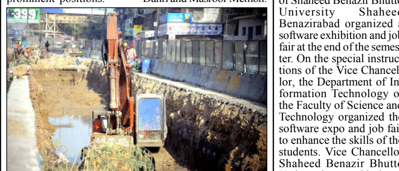
KARACHI: Construction projects of new development projects is underway rapidly under the supervision of local government department, located on University road in Karachi.