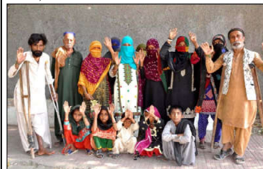
HYDERABAD: Residents of Husri are holding protest demonstration against high handedness of police, at Hyderabad press club.