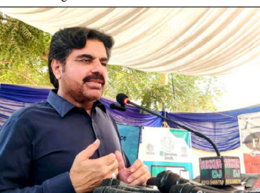
SUKKUR: Sindh Energy Minister, Nasir Hussain Shah addresses during the launching ceremony of E-Services Sindh App, in Sukkur.

Sharjeel Memon alleged that FC, Punjab Police and Rangers were attacked despite all odds the federal government displayed tolerance and pa-