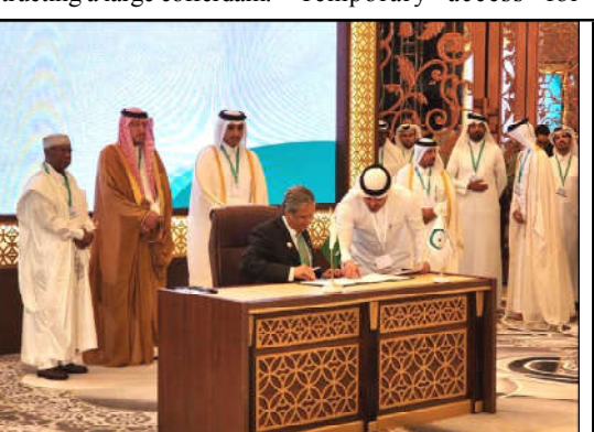
Federal Minister for Law & Justice and Human Rights, Senator Azam Nazeer Tarar, represented Pakistan at the OIC Anti-Corruption Ministerial Meeting in Qatar and signed the historic Makkah Convention in Doha.

The CM was in formed that over one million bank accounts had been opened to facilitate direct fund transfers for housing