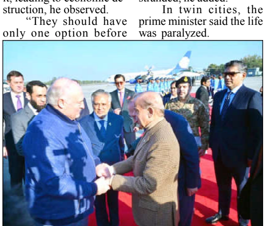
RAWALPINDI: Prime Minister Muhammad Shehbaz Sharif sees off President of Belarus, Aleksandra Lukashenko at PAF Nur Khan Airbase.

As a result of such riot, Islamabad in particularly and the country in generally, witnessed huge economic losses as businesses With the collective deliberations, they had to raising hue and cry, owners of the factories were in distress; daily wagers found it hard to get one time meal while the patients were stranded, he added.