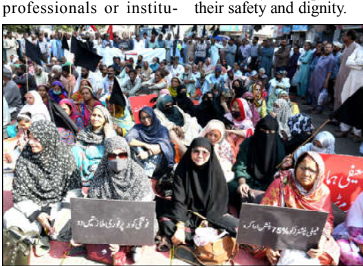
KARACHI: All KMC, TMCs Retired Employees and Pensioners Alliance are protesting in front of the KMC office on MA Jinnah Road for payment of dues.

stances," he stated. The attack saw a group of 50 to 60 protesters attempting to forcibly enter the National Press Club. Reports indicate that they tried to breach one of the gates, harassed staff, and even scaled the walls of the premises. Female journalists were among those targeted, and several journalists performing their duties elsewhere in Islamabad sustained injuries. The PCP chairman reaffirmed the Council's commitment to standing with the journalist community and upholding their safety and dignity.