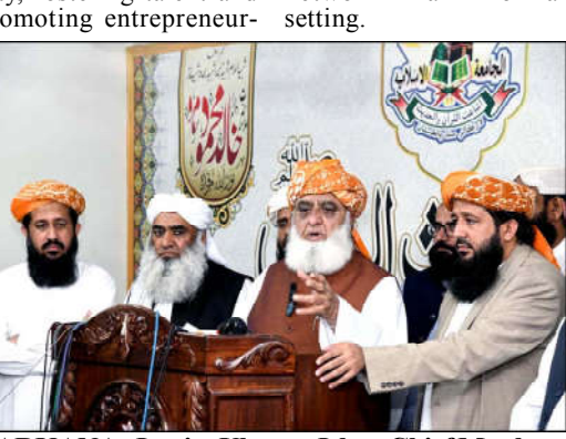
LARKANA: Jamiat Ulema e Islam Chief Maulana Fazl ur Rahman addressing a press conference at Jamia Islamia Madarsa Ishatul Quran Wal Hadeeth Dodai Road.

The event wrapped up with a delightful dinner accompanied by live music, providing guests with an opportunity to celebrate the occasion and network in an informal