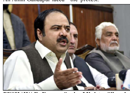
PESHAWAR: Former Senior Minister Sikander Hayvat Khan Sherpao addressing a press conference at PPC.

Ázma Bokhari said that 22 Punjab police vehicles were damaged record of Afghan citizens caught in the protest would be shared soon. The PML-N leader said that Imran Khan's own