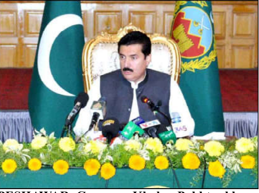
PESHAWAR: Governor Khyber Pakhtunkhwa, Faisal Karim Kundi addressing a press conference

ordinary citizens. She conveyed her sincere apologies for the inconvenience, stating,"I am truly saddened by the suffering the people have had to endure due to these disturbances