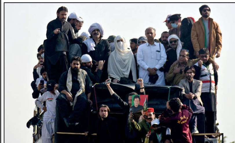
Bushra Bibi, wife of jailed former prime minister Imran Khan, and PTI supporters attend a rally demanding his release, in Islamabad.

According to the CM, the Karachi Safe City Project is designed to significantly enhance the Sindh Police's capabilities, ensuring greater public safety in Pakistan's largest city.