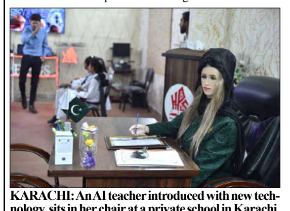
KARACHI: An AI teacher introduced with new technology, sits in her chair at a private school in Karachi.