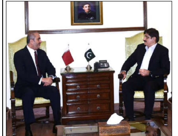
KARACHI: Sindh Chief Minister Syed Murad Ali Shah exchanges views with Ambassador of Qatar Mr. Ali Bin Mubarak Al-Khater at CM House.

situation and government will provide full support. Other day, three rangers and one police jawan were martyred, two ranger jawans are still in critical condition, four police personal of Islamabad police are in critical condition, two ASPs and one SP were seriously injured, five jawans of Punjab police are critical and seventy are injured, Mohsin Naqvi sharing details said that the Government is showing extreme restraint and is avoiding to escalate the situation but the other side took full advantage of government's soft stance. The minister said that the government had offered the PTI leadership a place at Sangiani for their protest and sit-in and they agreed to this and twice requested for ceasefire and removing of containers from their way to go back to the agreed place but all of sudden a secret hand sabotaged the deal. Government shown restraint upon the presence of Head of State in the capital and such footages and teargas shelling was causing a bad name for the country specially in the presence of high level delegation from Belarus, the minister said.