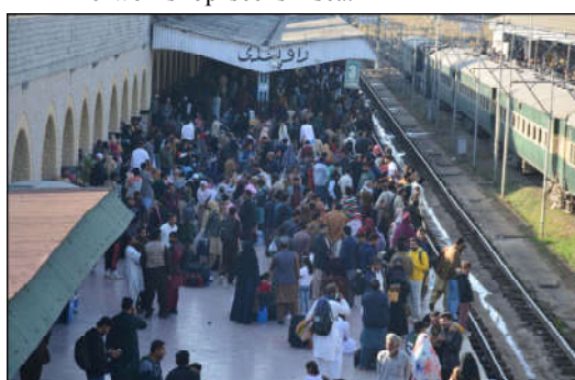
RAWALPINDI: Passengers rush to the railway station due to the closure of transport amid PTI protest.

LAHORE (APP): Seventh edition of the Maritime Security Workshop (MARSEW-7) aimed at enhancing knowledge and understanding of maritime security, geopolitical dynamics in the broader Indian Ocean region and the Blue Economy besides exploring Pakistan's untapped maritime potential commenced on Tuesday at Pakistan Navy War College. The workshop was inaugurated by the Commandant of Pakistan Navy War College, Rear Admiral Azhar Mahmood, said a news release issued by the Directorate General of Public Relations (Pakistan Navy). MARSEW is a national-level forum organized under the auspices of the Pakistan Navy, with the theme "Secure Seas, Prosperous Pakistan." The workshop seeks to highlight the challenges and opportunities in Pakistan's maritime sector and its critical role in supporting the national economy. This forum provides a shared platform for participants from the public and private sectors, including senators, parliamentarians, senior bureaucrats, maritime industry professionals, business leaders, academia, think tanks, and media representatives, to deliberate on pressing national maritime issues. A total of 38 participants from the public, private, and military sectors are taking part in MARSEW-7. In his welcome address, Rear Admiral Azhar Mahmood outlined the purpose of the workshop, emphasizing the need for Pakistan's intelligentsia to shift its strategic focus towards the sea.