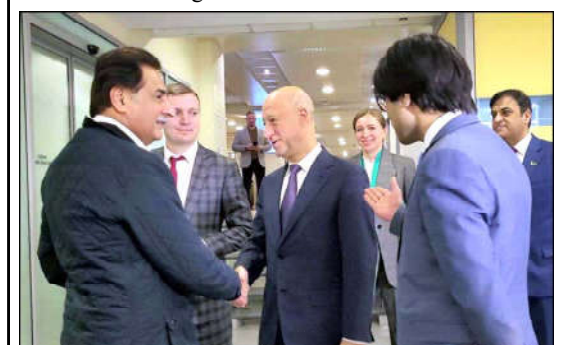
MOSCOW: Speaker National Assembly Sardar Ayaz Sadiq being welcomed at Moscow on his arrival by Vice Chairman of Russian State Duma Mr. Alexander Babakov.

He said Pakistan cannot afford any form of chaos or bloodshed.