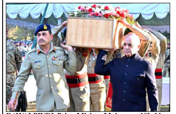
RAWALPINDI: Prime Minister Muhammad Shehbaz Sharif and COAS General Asim Munir attend the funeral procession of the martyred Rangers officials.

He said that Sindh Chief Minister Syed Murad Ali Shah and the Sindh Cabinet members are making efforts to implement the chairman's vision. He said that Chairman Bilawal Bhutto Zardari has given strict instructions to give ownership to people's housing program.