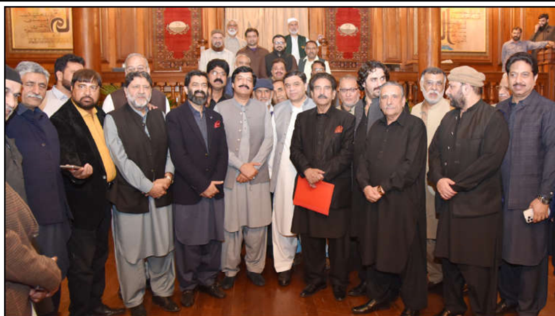
LAHORE: Governor Punjab Sardar Saleem Haider Khan in a group photo with delegation of the business community led by Humayun Iqbal Mir at Governor House. Senior PPP Lahore leader Aslam Gill is also present on the occasion.

there should be no problem in ensuring 100 percent cleanliness. He said that outsourcing cleanliness and sanitation systems in rural areas would ensure manual, and mechanical sweeping, waste collection, drain cleaning and waste disposal. Local government departments would monitor the outsourcing system digitally, he said. The monitoring would include biometric attendance, vehicle tracking management system, vehicle weighing at dumping site, digital monitoring of the fleet and container clearance through geo-tagging and prompt resolution of the complaints, he informed. At the district level, a control room under the supervision of Assistant Commissioners is being built in the Deputy Commissioners' Office and in each Tehsil.