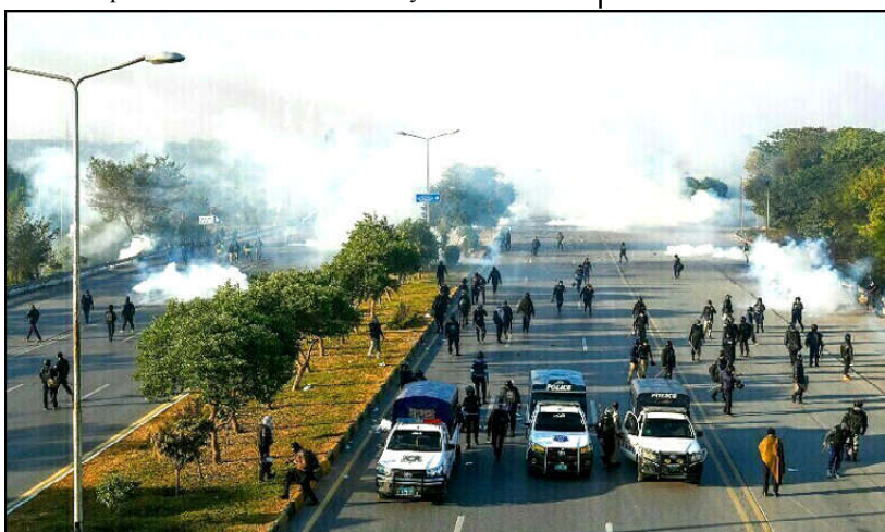
ISLAMABAD: A view of tear gas smoke raise after clash between police and PTI protesters in capital city.

"With profound grief, I extend my condolences to the families of the martyred personnel and pray for the swift recovery of the injured.