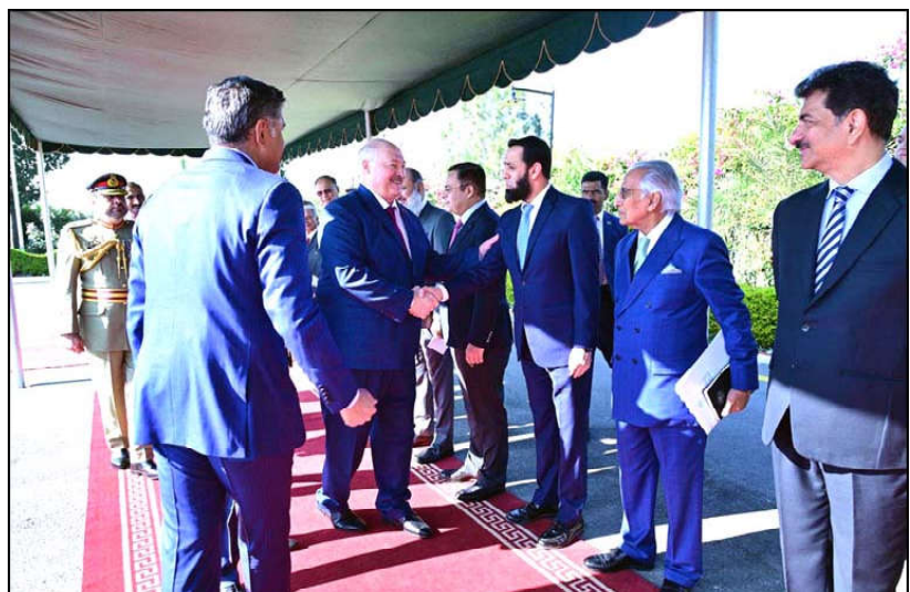
ISLAMABAD: Prime Minister Muhammad Shehbaz Sharif and President of Belarus H.E. Aleksandr Lukashenko introducing their respective delegations.