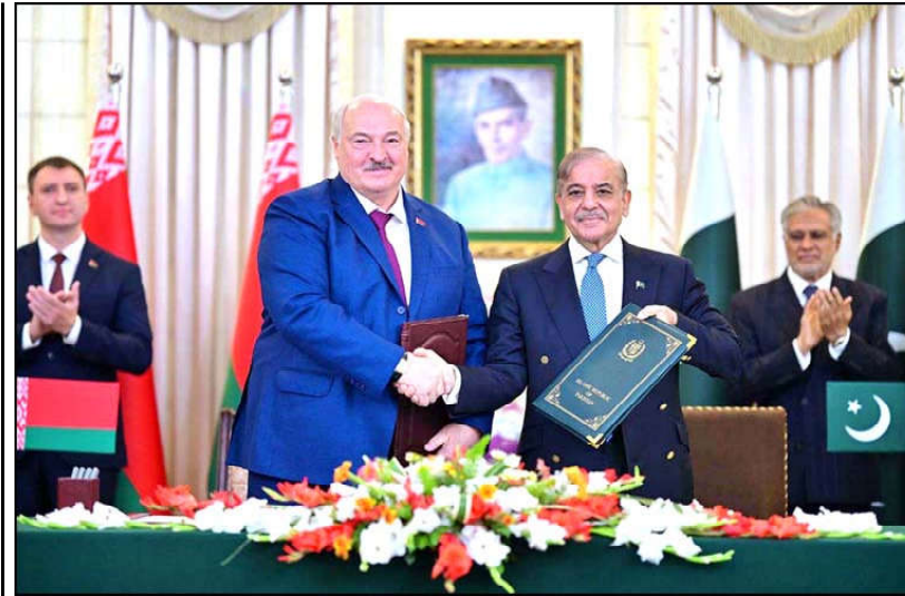
ISLAMABAD: Prime Minister Muhammad Shehbaz Sharif and President of Belarus H.E. Aleksandr Lukashenko exchanging joint communiqué.