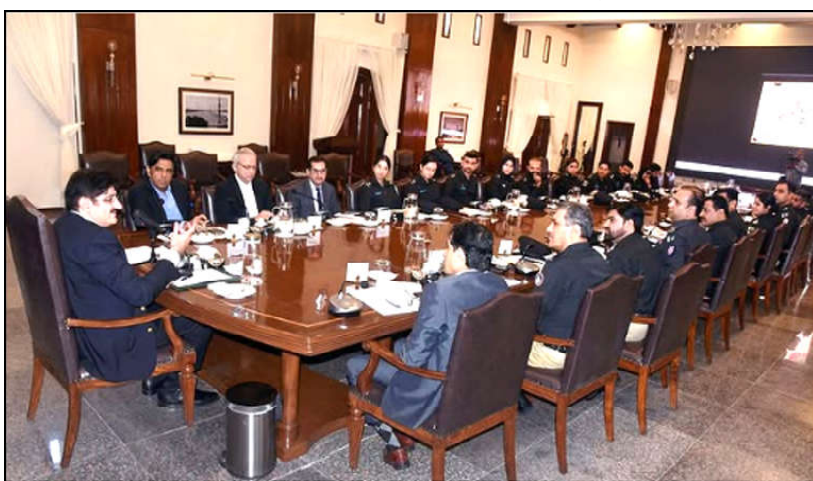
KARACHI: Sindh Chief Minister Syed Murad Ali Shah meets with the 51st Specialized Training Program officers of the Initial Command Course at CM House.

He also referred to Bushra Bibi, wife of PTI founder Imran Khan, as being responsible for instigating the unrest.