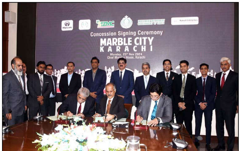
KARACHI: Sindh Chief Minister, Syed Murad Ali Shah along with others witness the signing ceremony of the Concession agreement between Sindh Government and private partners Kainatt Enterprises and Hassan Constructions for the development of Marble City, at CM House in Karachi..

(SEZMC), is strategically located in Karachi, Pakistan's primary trade and industrial hub. Special Assistant to CM on Investment Syed Qasim Naveed briefing the CM said that with its proximity to the Port of Karachi, Jinnah International Airport, and key national highways, Marble City Karachi promises unmatched connectivity for businesses targeting both domestic and international markets. He added that the project boasts modern infrastructure, utilities, and robust security, including 24/7 surveillance, secure perimeters, and comprehensive emergency management systems, ensuring a safe and productive environment for investors and workers alike.