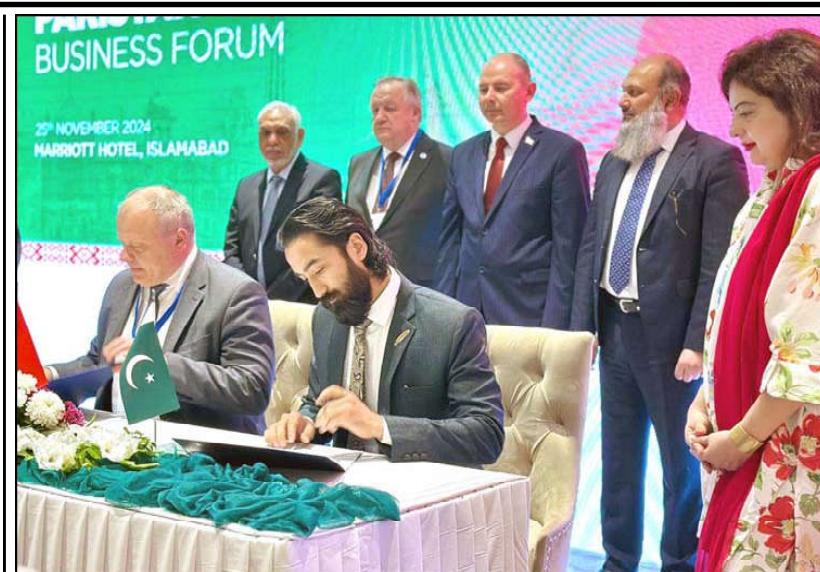
ISLAMABAD: Federal Minister Jam Kamal Khan and Belarusian Minister Alexey Kushnarenko witness the signing of 8 MoUs/Agreements at the Pakistan-Belarus Business Forum 2024.

Rana Tanveer said that around thirty-one companies have issued manufacturing licenses by the Engineering Development Board (EDB) enabling them to produce two/three-wheeler EVs in Pakistan.