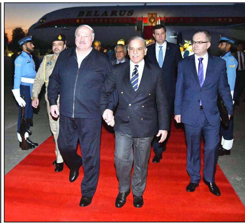
RAWALPINDI: Prime Minister Muhammad Shehbaz Sharif receives President of Belarus Aleksandr Lukashenko at PAF Nur Khan Air Base.