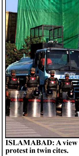
ISLAMABAD: A view of Rangers personals stand on closed road to PTI protest in twin cities.

Corporation (KMC), is restoring the city's vibrancy and lights, and work is visible in every district, proving that when intentions are right and the desire to work is strong, resources and authority never become obstacles. He said that efforts are being made to complete the ongoing development projects in Karachi in a timely manner to provide better convenience for citizens' commute. Due to heavy traffic in Shireen Jinnah Colony, the road conditions were worrying, and there were issues of traffic jams, he added.