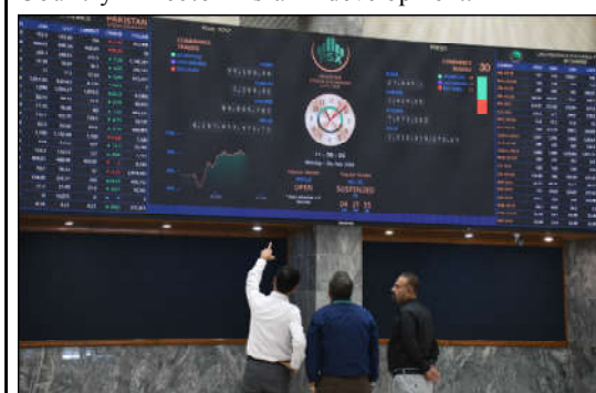
KARACHI: A stockbroker monitors share prices during a trading session at Pakistan Stock Exchange (PSX) in Karachi. The Pakistan Stock Exchange's KSE-100 index gained 1,519.24 points, or 1.55%, to reach 99,317.47 points.

She added, "The Punjab government is moving forward under a comprehensive plan to attain socio-economic development."