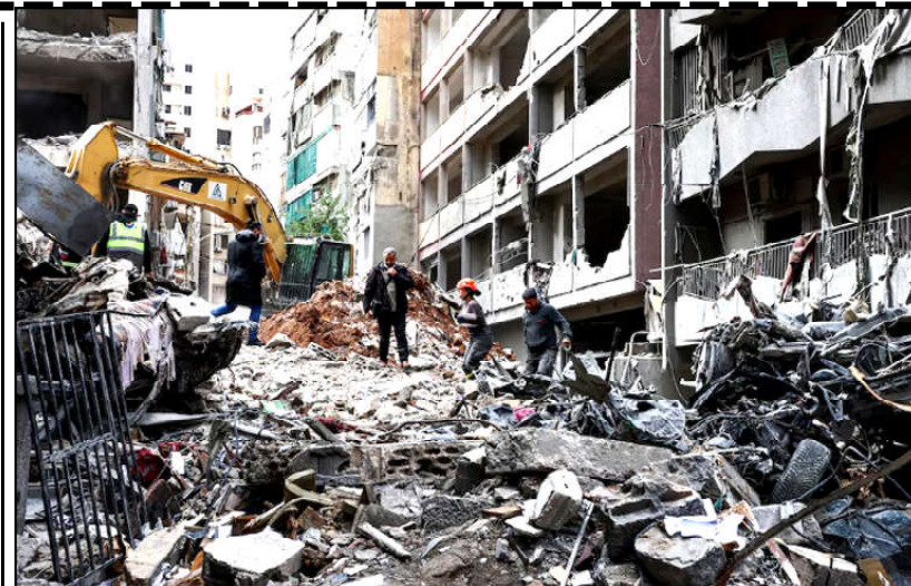
Civil defense members and people work at a damaged site in the aftermath of Israeli strikes, amid the ongoing hostilities between Hezbollah and Israeli forces, in Beirut's Basta neighbourhood, Lebanon.