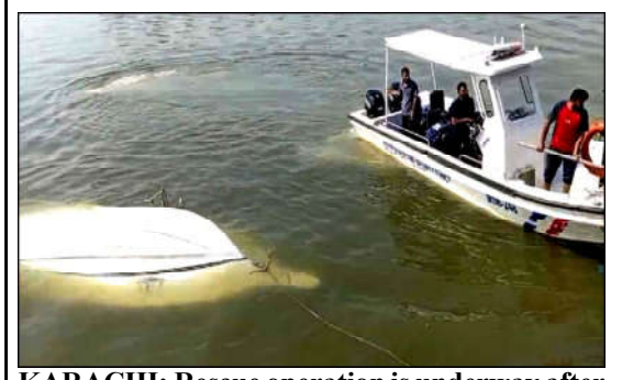
KARACHI: Rescue operation is underway after boat overturned into deep waters, near Ibrahim Hyderi in Karachi.