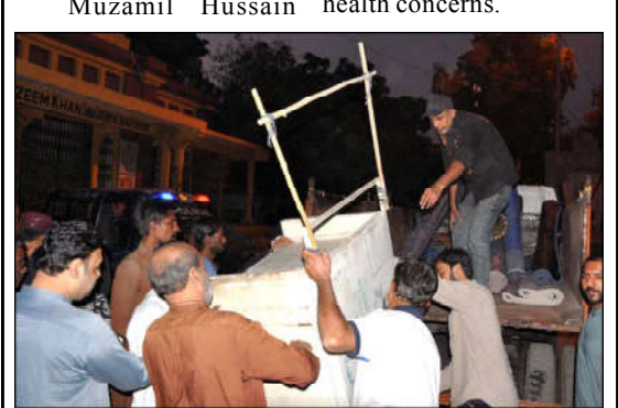
HYDERABAD: Anti encroachment operation in progress removed illegal encroachment during anti encroachment drive under the supervision of Municipal Department, at Miran Mohammed Shah Road in Hyderabad.