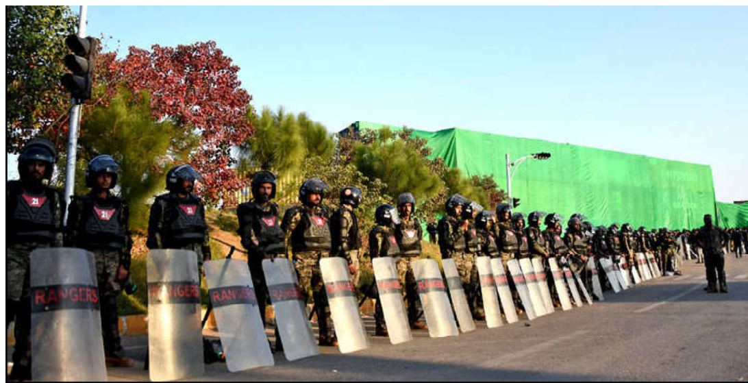
ISLAMABAD: Paramilitary soldiers alert at the D-Chowk in the Federal Capital ahead of PTI protest in the Federal Capital.