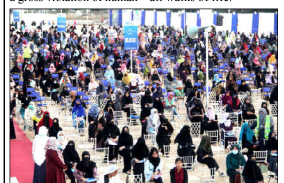
KARACHI: Students taking part in the entrance test for admission to the "Banu Qabal" program under Jamaat-e-Islami at Nishtar Park in the Provincial Capital.

rights and a major impediment to achieving a just and equitable society. We must commit ourselves to eliminating it from all aspects of life, be it at home, in the workplace, or in public spaces," he said. Highlighting the PPP's pioneering role in advancing women's rights in Pakistan, Chairman Bilawal Bhutto Zardari said, "The PPP has a proud history of empowering women by electing them as Prime Minister, Speaker, and Ministers, besides appointing judges and other key posts for the first time in the history of Pakistan." He credited Shaheed Zulfikar Ali Bhutto with laying the foundation for gender equality through the 1973 Constitution, which ensures protection against gender-based discrimination and promotes women's participation in all walks of life.