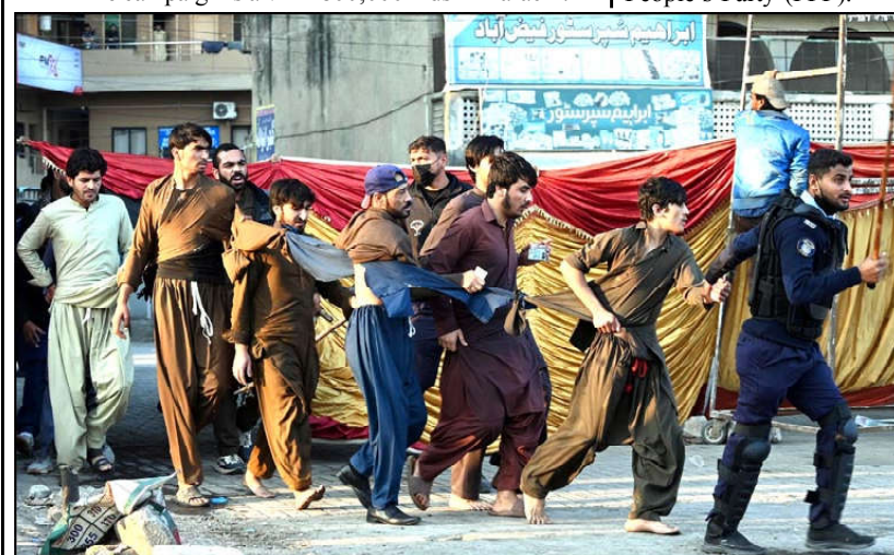
ISLAMABAD: Police taken to arrested Pakistan Tehreek-e-Insaf (PTI) workers towards prison van.

SUKKUR (APP): Colourful events, education exhibitions and seminars were organised by the Sindh Rural Support Organisation (SRSO) in connection with the World Children's Day in different districts, including Khairpur Mirs, Sukkur and Ghotki. The event was celebrated in Village Muhammad Khan Lound District Ghotki under the EPI Demand Generation Project funded by UNICEF in partnership with RSNP by SRSO in district Ghotki. The SRSO-EPI project team conducted different activities with children and the community to aware of the rights of children and promote children's rights and well-being. They said that each year WCD reminds us that children are our shared responsibility and must be protected from all forms of abuse, violence, and discrimination. They emphasized to community members to ensure full vaccination courses for the children as a basic right to protect future generations.