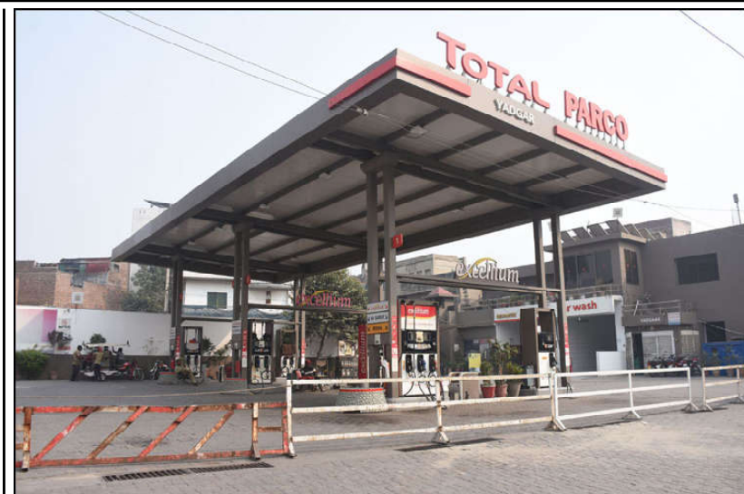
LAHORE: Petrol Pump on Ravi Road closed due to ongoing protest.

In a statement issued here, he said the region holds tremendous potential for trade, energy projects and connectivity initiatives like the China-Pakistan Economic Corridor (CPEC) and the Trans-Afghanistan Pipeline. He said such mega ventures require stability and cooperation, making it imperative for both states to prioritise trust and dialogue bringing an end to perpetual menace of terrorism.