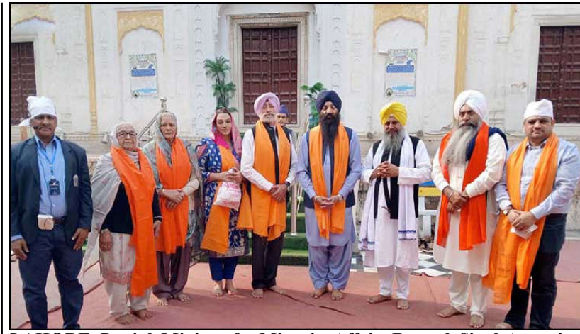
LAHORE: Punjab Minister for Minority Affairs Ramesh Singh Arora in a group photo with Sikh community at Dera Sahib Gurdwara.

Pakistan Red Crescent conducted a thorough assessment of the situation. A comprehensive report based on the findings will be submitted shortly to further guide the relief efforts. Pakistan Red Crescent Khyber Pakhtunkhwa remains steadfast in its commitment to providing continuous support and assistance to the displaced individuals, ensuring their immediate needs are met with the utmost urgency. It is worth mentioning here that dozens of persons were died and injured during the ongoing clashes between local tribes.