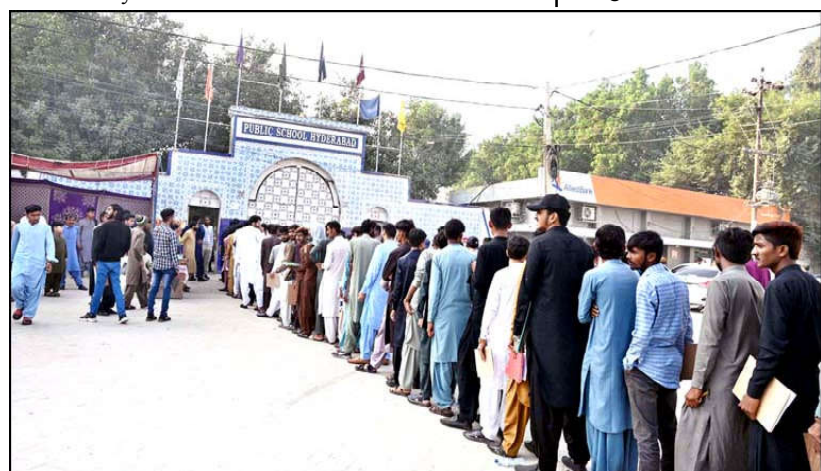
HYDERABAD: Students standing in queue to enter in Public School for pre-entry test for admission in Law College.