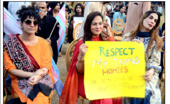
HYDERABAD: Transgender community (gathered from all over Sindh) celebrating their annual function Moorat March, demanding equality, protection and creating the opportunities in public and private sectors for betterment in their lifestyle, in the city.