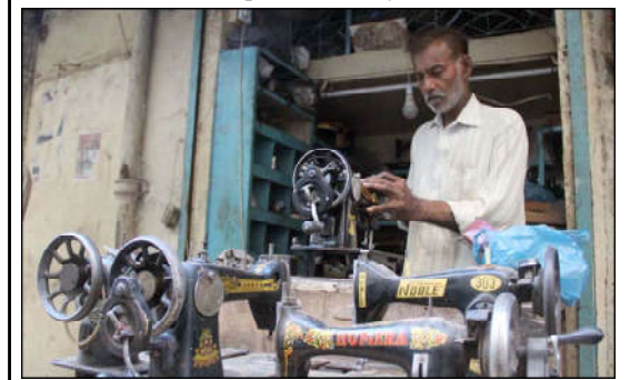
KARACHI: A mechanic busy in repairing sewing machine at his workplace in the Provincial Capital.