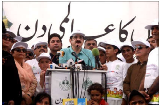
KARACHI: Sindh Chief Minister Syed Murad Ali Shah addresses a ceremony marking World Children's Day at Nishan-e-Pakistan.

Bilawal Bhutto has also directed Khyber Pakhtunkhwa Governor Faisal Karim Kundi to provide a detailed report on the situation in the Kurram district.