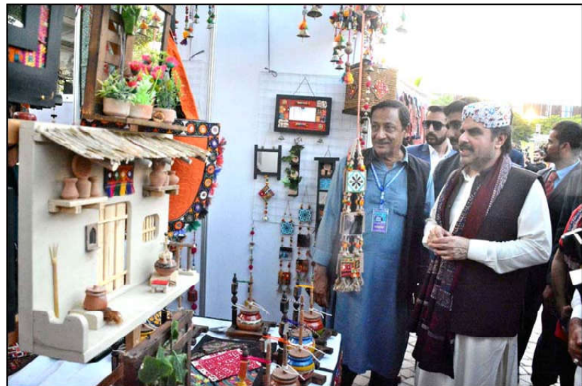
KARACHI: Sindh Minister for Energy Syed Nasir Hussain Shah visiting stall during Sindh Crafts Festival at Port Grand.

LAHORE (INP) Prime Minister Shehbaz Sharif chaired a consultative meeting held in Model Town Lahore on Sunday and discussed the current political situation. According to media reports, National Assembly Speaker Sardar Ayaz Sadiq and Speaker Punjab Assembly Malik Muhammad Ahmed Khan also participated in the meeting. The situation after the final call of protest by Pakistan Tehreek-e-Insaf (PTI) was also discussed in the meeting. During the meeting, Prime Minister Muhammad Shehbaz Sharif directed to remove the reservations of the Pakistan People's Party (PPP).