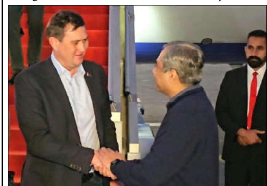
ISLAMABAD: Federal Minister for Interior Mohnsin Naqvi receiving High level Belarusian delegation on their arrival.

He warned that whatever actions PTI took, would not be welcomed by either the friendly countries or the Pakistani public.