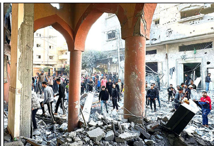
Palestinians inspect the site of an Israeli strike on a mosque at Nuseirat refugee camp, in central Gaza Strip.