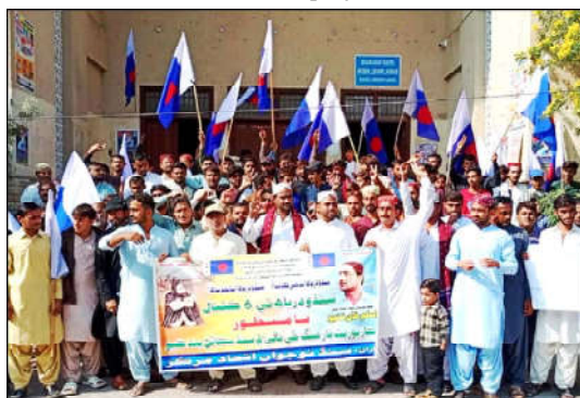
LARKANA: Members of Sindh Youth Alliance are holding protest demonstration against building new canals to draw additional water from the Indus River, anti-people policies decisions and amending the Irsa Act held at Jinnah Bagh in Larkana.