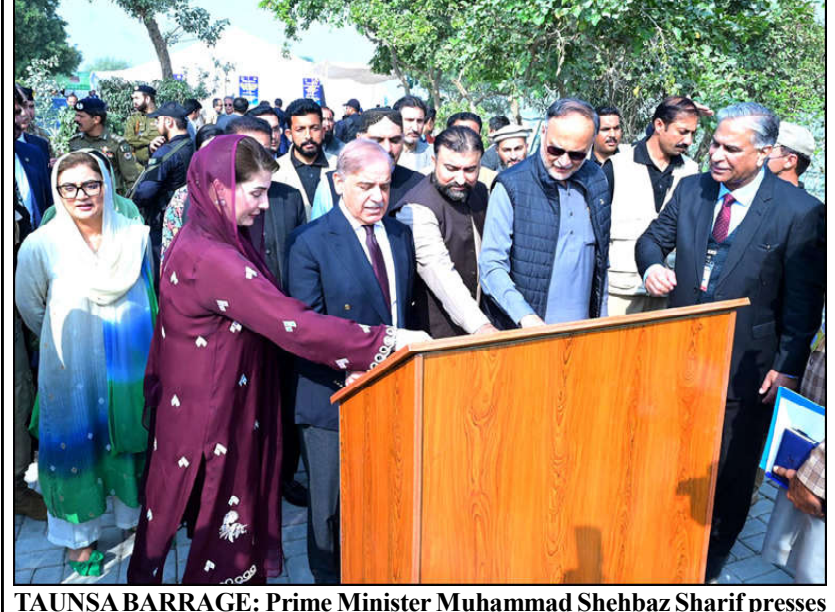
the button to open gates for flow of water from Indus River into Kacchi Canal.

yond understanding. The largest national interest is being "slaughtered" to serve the short-term political interest," he remarked after inaugurating the project that will irrigate over 715,000 acres of land in Balochistan and revive life in the area turned barren