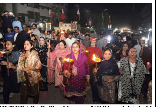
HYDERABAD: Torchbearers NGO's activists hold a Torch rally in connection with the Tolerance March held.

A male complainant said that they were receiving inflated bills of electricity in spite of paying their bills. He said that they had made complaints in this regard to KE but their issues were not being resolved.