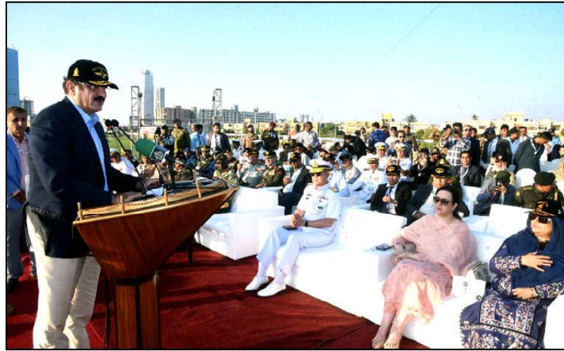
KARACHI: Sindh Chief Minister, Syed Murad Ali Shah addresses during power demonstration show of the Pakistan Armed Force Special Service Group Commandos for counter terrorism activities on the sidelines of the 12th International Defence Exhibition and Seminar (IDEAS-2024) under the aegis of Defence Export Promotion Organization (DEPO), held at Nishan-e-Pakistan Park located on Seaview Beach Karachi.

President, PM strongly condemn. Meanwhile President Asif Ali Zardari on Thursday strongly condemned the incident of firing took place in Kurram district targeting the passengers vehicles.