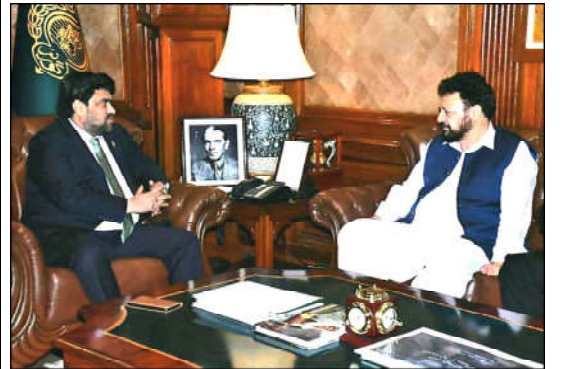
KARACHI: Chief Minister Gilgit-Baltistan Gulbar Khan meeting with Governor Sindh Kamran Khan Tessori.

It may be recalled that during a media talk on Thursday (November 14), the PPP chairman had accused PML-N of reneging on commitments after the passage of the 26th Constitutional Amendment.