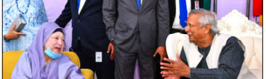
Chief adviser of Bangladesh's interim government Muhammad Yunus with former premier and Bangladesh Nationalist Party chairperson Khaleda Zia at a reception in Dhaka, Bangladesh.

SEOUL: North Korea and Russia have signed a protocol on cooperation after meetings covering trade, the economy, science and technology in Pyongyang, North Korean state media KCNA said on Thursday.