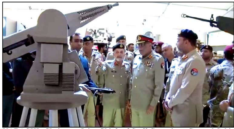
KARACHI: Chairman Joint Chiefs of Staff Committee General Sahir Shamshad Mirza visiting 12th International Defence Exhibition and Seminar-24 at Expo Center.

Talking to journalists, Sindh Senior Minister Sharjeel Inam Memon said that the Sindh government has taken several steps for the welfare and professional development of jour-