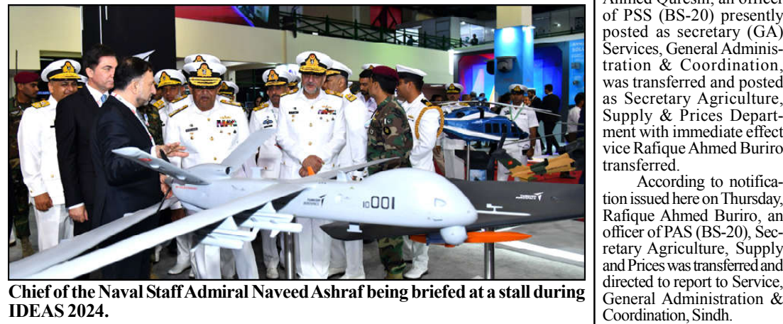
Chief of the Naval Staff Admiral Naveed Ashraf being briefed at a stall during IDEAS 2024.

The ICC Champions Trophy tour highlights Pakistan's role as a host nation, generating excitement ahead of the much-anticipated tournament.