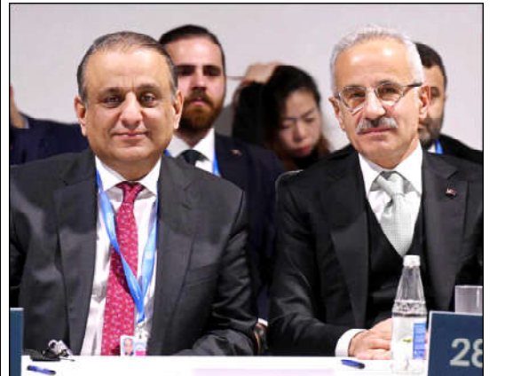
BAKU: Turkish Minister of Transport and Infrastructure, Abdulkadir Uraloğlu with Federal Minister Communications, Abdul Aleem Khan on the eve of COP29.

It's worth mentioning here that PPP-led Sindh government and the Centre are currently at odds as Bilawal Bhutto Zardari yesterday declined a meeting with Prime Minister Shehbaz Sharif, requested by the federal government following his criticism.