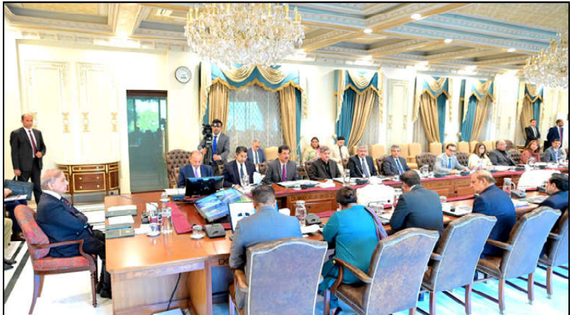
ISLAMABAD: Prime Minister Muhammad Shahbaz Sharif chairing a review meeting of the Public Procurement and Good Governance.

The IHC directed the Interior Secretary to form a committee, either under the leadership of the Interior Minister or a suitable official, to facilitate dialogue with PTI's leadership.