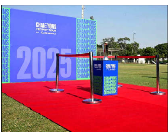
KARACHI (INP): As part of Pakistan's preparations for the ICC Champions Trophy, the coveted trophy was put on display at the National Stadium Karachi.

The event included a special photo session, drawing cricket enthusiasts and officials eager to catch a glimpse of the prestigious prize.