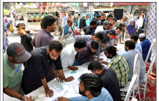
HYDERABAD: Private Sector employees are registered themselves into Sindh Employees Social Security Institution (SESSI) Scheme, at the membership camp arranged by SESSI, at Latifabad area in Hyderabad.