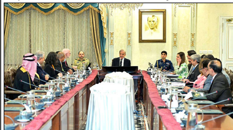
ISLAMABAD: A delegation of Polio Oversight Board meeting with Prime Minister Muhammad Shabbaz Sharif.

The court ruled that there is no other option but to take the test again, adding that the representatives of the Sindh government, Pakistan Medical and Dental Council (PMDC), and Dow University agreed on re-testing.