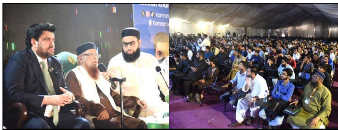
KARACHI: Murad Ali Shah addressing students of IT Marquee. Governor Sindh Kamran Khan Tessori is also present.