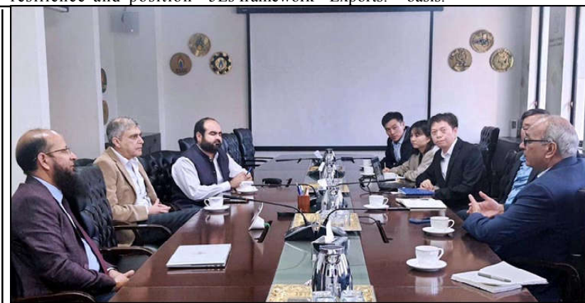
ISLAMABAD: A Delegation from China Geological Survey (CGS) Calls on Secretary Petroleum to Bolster Geoscientific Collaboration.

The CEO further assured that he is personally overseeing train schedules and that efforts are being made to resolve issues impacting punctuality. To enhance convenience, the names and phone numbers of train managers will soon be prominently displayed in all trains.