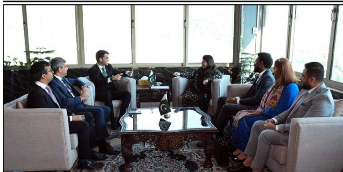
ISLAMABAD: Minister of State for IT and Telecommunication Ms. Shaza Fatima Khawaja in a meeting with TikTok delegation.