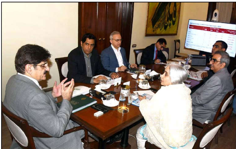
KARACHI: Sindh Chief Minister, Syed Murad Ali Shah presides over a meeting regarding polio eradication, held at CM House in Karachi.

He highlighted that maintaining law and order is crucial for the well-being and prosperity of citizens.