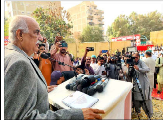
SUKKUR: Peoples Party (PPP) Senior Leader and Member of National Assembly (MNA), Khurshid Shah addresses during the inauguration ceremony of newly established Indus Eagle Squad to facilitate the resident of Sukkur, in Sukkur.

Syed Awais Qadir emphasized the importance of Artificial Intelligence for the e-parliament program. Ambassador Irfan Neziroglu discussed Türkiye's commitment to strengthening ties and supporting Sindh Assembly's Strategic Plan.