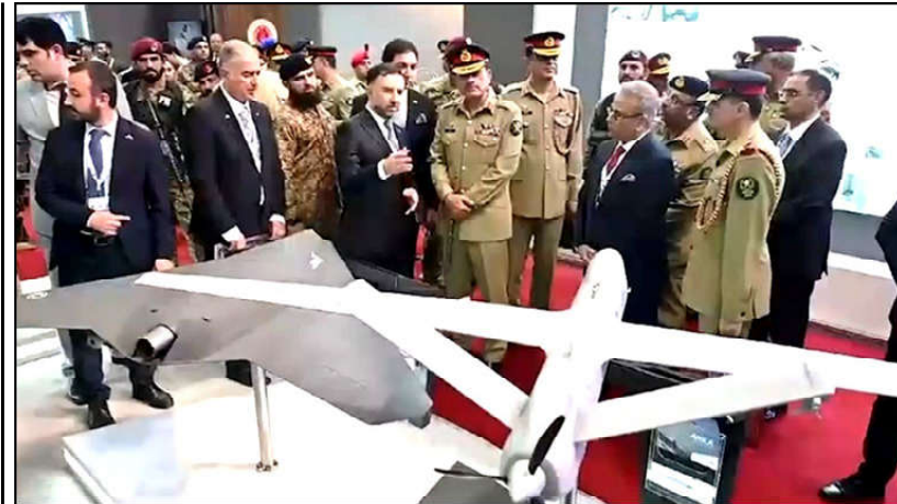
KARACHI: General Syed Asim Munir, NI (M) Chief of Army Staff (COAS), visiting the International Defence Exhibition and Seminar (IDEAS-2024) at the Karachi Expo Centre.

General Asim Munir reaffirmed his belief that "despair is forbidden for Muslims," and highlighted that all of Pakistan's economic indicators are now positive. He expressed optimism that these indicators will further improve in the coming year.