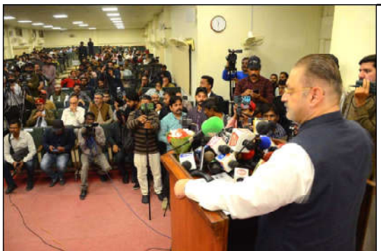
HYDERABAD: Sindh Minister for Information, Transport and Mass Transit, Excise Taxation and Narcotics Control, Sharjeel Inam Memon addresses during a ceremony on the eve of World Sustainable Transport Day, at Isra University in Hyderabad.

"As a nation, we must stand on our own feet so that we do not have to rely on others for assistance," he said.