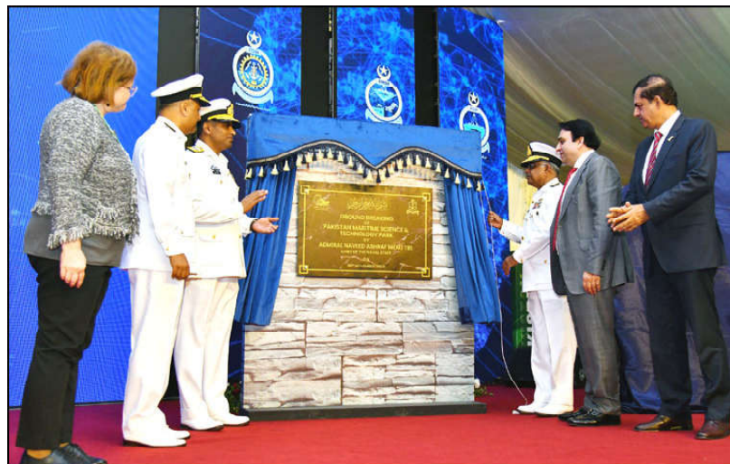
Chief of the Naval Staff Admiral Naveed Ashraf laid foundation of Pakistan Maritime Science and Technology Park (PMSTP) during IDEAS 2024.