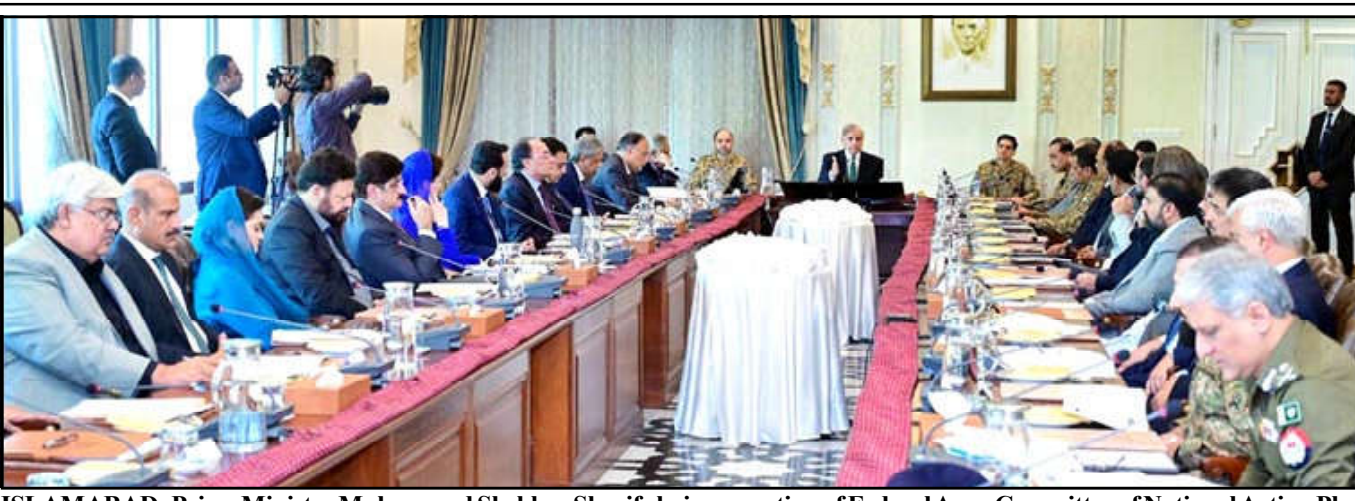
ISLAMABAD: Prime Minister Muhammad Shehbaz Sharif chairs a meeting of Federal Apex Committee of National Action Plan.

A whole-of-system approach was adopted, incorporating diplomatic. political, informational, intelligence, socio-economic, and military efforts to address these issues compre-