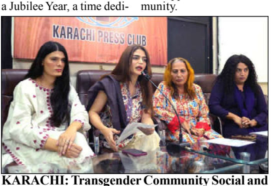
held at Karachi.

hope, ready to embrace the challenges ahead with the strength of their faith and marked the culmination of the support of their com-