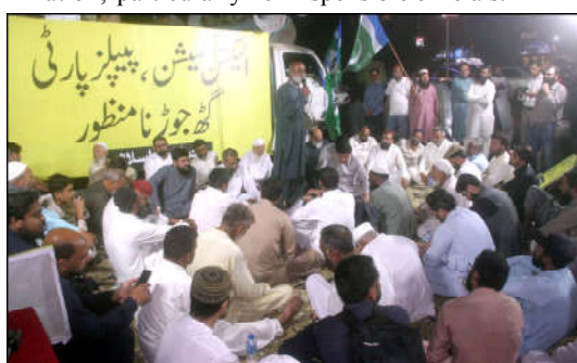
KARACHI: Workers of Jamaat-e-Islami sitting on dharna against the alleged rigging in the by-elections on Shahrah Faisal.

The deputy commissioner warned that any negligence or failure in duty would lead to strict punitive action against the responsible officials.