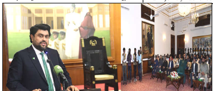
KARACHI: Governor Sindh Kamran Khan Tessori addressing a seminar "Awareness about Wildlife" at Governor House.

HYDERABAD (APP): The Entry Test for admissions 2024-25 at Shaheed Allah Bukh Soomro (SABS) University of Art, Design and Heritage Jamshoro was conducted at the Campus. Candidates from Sindh, Punjab, Balochistan, Khyber Pakhtunkhwa, Azad Jammu Kashmir and other parts of the country appeared in the test. There are a total of 200 seats available for the candidates on merit, self-finance, university support program and foreign with 50% quota reserved for Sindh and 50% for other parts of the country. The University offers admission in six departments such as: Fine Art, Architecture and Planning, Communication, Textile, Fashion and Interior Design. 217 female and 33 male candidates appeared in the test.