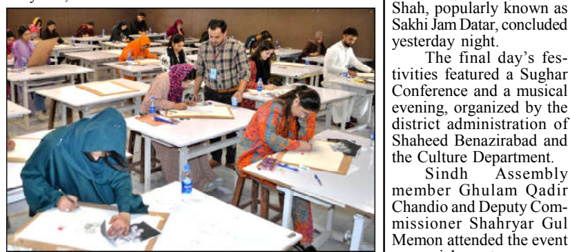
JAMSHORO: Students appearing in entry test of painting for admissions 2024-25 in Shaheed Allah Bukh Soomro (SABS) University of Art, Design and Heritage.