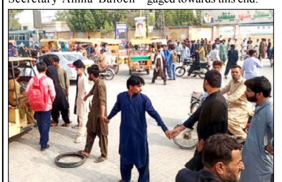
LARKANA: Residents of Karma Bagh are block road and burn tires as they are holding protest demonstration against the un-rest law and order situation city, at SSP Chowk in Larkana.