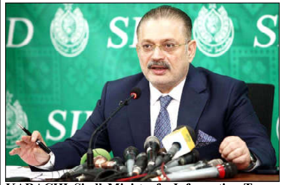
KARACHI: Sindh Minister for Information, Transport and Mass Transit, Excise Taxation and Narcotics Control, Sharjeel Inam Memon addresses to media persons during press conference, in Karachi.

KARACHI (APP): Sindh Senior Minister Sharjeel Inam Memon on Thursday said that the Sindh government was actively working to address Karachi's traffic problems. Illegal bus stands that had been operating in the city for the past 40 years were dismantled, with all bus stands now relocated outside the city to the Bus Terminal. For the first time, a free shuttle service has been introduced to transport passengers to the terminal. Work is progressing on the new Red Line and Yellow Line BRT projects to enhance travel options for millions of citizens in Karachi. By the end of December 2024, the Green Line service will also be transferred to the Government of Sindh. Addressing a press conference here at the Directorate of Electronic and Social Media, Sindh Senior Minister for Information, Transport, Excise, Taxation, and Narcotics Control, Sharjeel Inam Memon announced that the Excise Department is currently conducting a campaign to check unregistered and tax-defaulting vehicles across Sindh. In November alone till to date, the department inspected 22,103 vehicles. Among them, 115 were found to be unregistered, while 1,304 were tax defaulters and were subsequently taken into custody. Documents of 1,472 vehicles were seized. A total of 10065000 rupees in tax was collected from the tax-defaulter vehicles, along with fines amounting to 873000 rupees, resulting in a total collection of 10938000 rupees.