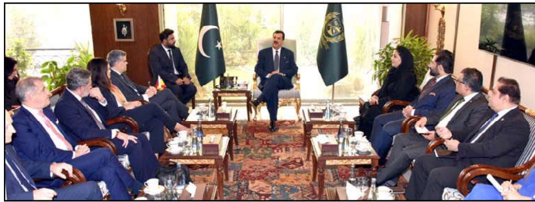
ISLAMABAD: Chairman Senate, Syed Yousaf Raza Gilani exchanging views with members of the Parliamentary delegation of senate affairs committee of the kingdom of Spain at Parliament House.

ISLAMABAD (APP): Chairman Senate Syed Yousaf Raza Gilani Thursday called for increased collaboration between Pakistan and Spain in diverse sectors as the two countries share commonalities and both have a shared vision for peace and sustainable development. The Chairman Senate expressed these views in a meeting with 4-member parliamentary delegation of the Spanish Senate said a news release. Welcoming the delegation, the Chairman Senate termed the relations between Pakistan and Spain as historic, however, he observed that there is still a huge scope for further deepening the mutual collaboration in diverse sectors. The Chairman Senate recognized the longstanding diplomatic ties between Pakistan and Spain, rooted in mutual respect and shared values and emphasized that this visit marks a valuable opportunity to further deepen these bonds and explore avenues for productive collaboration. He recalled his visit to Spain in 2010 as Prime Minister and said that productive dialogue with Spanish and EU officials regarding Pakistan's textile industry, led to the EU's special trade package to boost Pa-