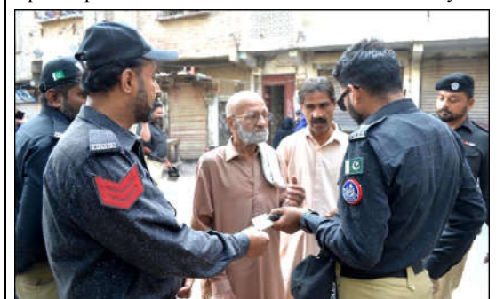
HYDERABAD: Police personals guide an old vote during Local bodies by-election in Hyderabad.

ISLAMABAD (Online): Foreign Office (FO) while refuting the reports of sending security team by China for the protection of its citizens has said such reports are part of propaganda to harm the friendship between the two countries. "fool proof security arrangements are being made for the safety of Chinese nationals. Dialogue continue to occur on the safety of Chinese nationals. The old standing relations between US and Pakistan are based on non interference in each other affairs, this was said by Foreign Office Spokesperson Muntaz Zahra Baloch during her weekly press briefing here Thursday. Pakistan will protect Chinese nationals and institutions at every cost, she added. Foreign Office Spokesperson Muntaz Zahra Baloch said this is an established fact that the terror groups receive support from India. She recalled that Pakistan arrested an Indian Naval Officer a few years back who was the mastermind of support for espionage and terror activities in Balochistan. The spokesperson urged the Afghan authorities to take action against the terror groups and do not allow the use of their soil against Pakistan or any other neighboring country. She said Afghanistan should take Pakistan's repeated requests seriously and not test the patience of Pakistani people. Responding to a question, the spokesperson said Pakistan will continue to work with China for the safety and security of Chinese nationals, projects and institutions in the country.