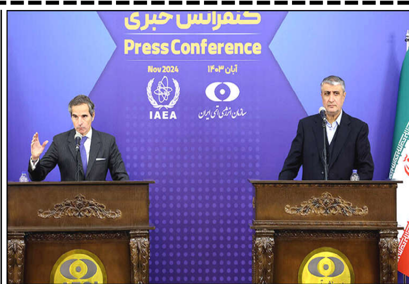
Iran's head of the Atomic Energy Organisation Mohammad Eslami and the United Nations nuclear chief Rafael Grossi hold a joint press conference in Tehran.

but Trump is expected to give Israel a far freer rein after he takes office in January. The IAEA chief described his meeting with Araghchi as "indispensable" in a post on X. Araghchi was Iran's chief negotiator in talks that led to a landmark 2015 nuclear deal with major powers, abandoned three years later by Trump. Araghchi posted that their meeting was "important & straightforward". He said Iran was "willing to negotiate" based on the "national interest" and "inalienable rights," but was not "ready to negotiate under pressure and intimidation". "We agreed to proceed with courage and goodwill. Iran has never left the negotiating table on its peaceful nuclear programme," he said. Grossi also met the head of Iran's atomic energy organisation, Mohammad