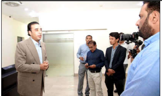
KARACHI: Peoples Party (PPP) Chairman, Bilawal Bhutto Zardari visited various departments including media cell, monitoring room and news section, at Bilawal House in Karachi.