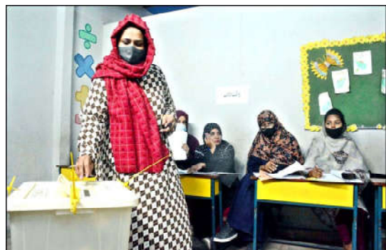
KARACHI: A female voter casting her vote in Local Government Bye-Elections being held across the province on different vacant seats of local bodies.

KARACHI (APP): The polling was started on all 33 vacant seats of Union Committee/Council Chairmen, vice Chairmen, General Councilors and member District Council across Sindh including 10 seats in Karachi on Thursday (Nov 14). Polling was underway and will continue till 5 pm for which Election Commission and the provincial government adopted strict security measures. All the deputy commissioners have already announced local holidays in the Union Committees/Councils where polls are being held. Police have ensured strict security arrangements to maintain law and order as several polling stations had already been classified as highly sensitive and sensitive by the Election Commission of Pakistan. In Karachi, several polling stations in TMCs of Malir, Model Council, Saddar and Liaquatnagar were classified as highly sensitive and sensitive where a large number of police personnel was deployed to maintain a secure environment during the polling process.