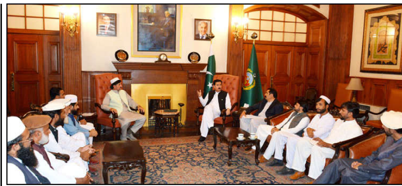
PESHAWAR: Governor Khyber Pakhtunkhwa Faisal Karim Kundi called on by Mamozai Qaumi Ittehad representative delegation at Governor House.