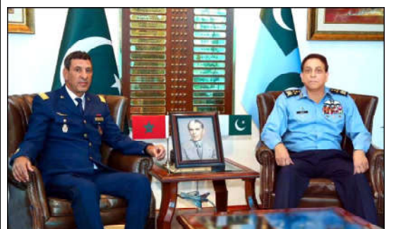
ISLAMABAD: Chief of Air Staff, Air Chief Marshal Zaheer Ahmed Baber Sidhu exchanging views with Major General Mohammed Gadih, Inspector Royal Moroccan Air Force during meeting held at Air Headquarters in Islamabad.

Furthermore, research by USAID indicates that 42% of transgender individuals are only marginally literate, while 40% lack access to education entirely. Research involving representatives from the transgender community for the policy draft revealed that Sindh has approximately 22,065 transgender individuals.