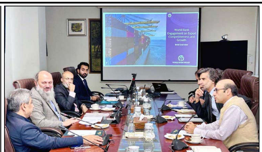
ISLAMABAD: Federal Minister for Commerce, Jam Kamal Khan meets with the World Bank team to discuss strategies for boosting Pakistan's export competitiveness and strengthening trade policies, emphasizing a Whole-of-Government approach for export-led growth.

The price of 10 grams of 24 karat gold also went up by Rs.1,200 to Rs.233,111 from Rs.231,911 whereas that of 10 gram 22 karat gold increased to Rs.213,685 from Rs.212,584.