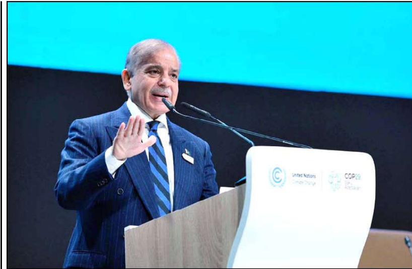
BAKU: Prime Minister Muhammad Shehbaz Sharif addressing the COP29 Climate Action Summit.

However no loss to property and life has been reported so far.