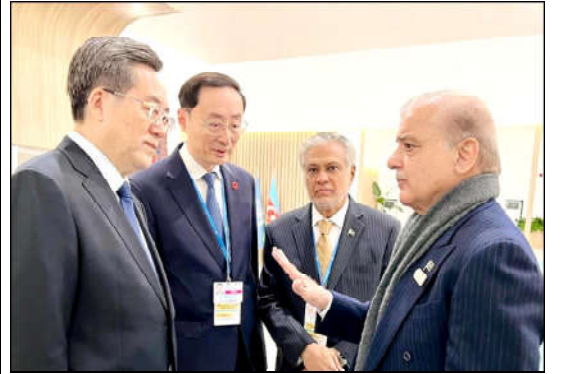
BAKU: Prime Minister Muhammad Shehbaz Sharif met Chinese Vice Premier Ding Xuexiang, on the sidelines of COP29 Climate Action Summit in Baku.

Referring to the recent visit of the Chinese Premier to Pakistan, the prime minister said that China was a long-standing friend of Pakistan and a new era of strengthening relations between the two countries had begun. Highlighting the steps taken by the government for the security of the Chinese