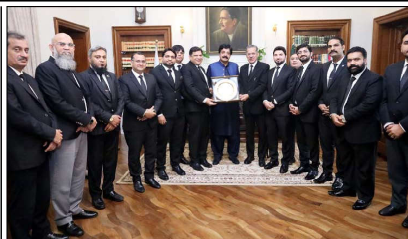
LAHORE: Governor Punjab, Sardar Saleem Haider Khan in a group photo with delegation led by Patron Chief Pakistan Tax Bar, Rana Munir Ahmed and President Lahore Tax Bar Shehbaz Siddique at Governor House.

urban and congested areas across Punjab." She added, "15 Clinics on Wheels and 3 ultrasound vehicles are busy in semi-urban and congested areas of Lahore, whereas more than 736,000 people received treatment from the field hospital in remote areas of Punjab." She flagged, "More than 100,000 people in the villages were provided free lab test facility through the field hospitals, and more than 46,000 people from remote villages were given the facility of free X-ray and ultrasound tests."