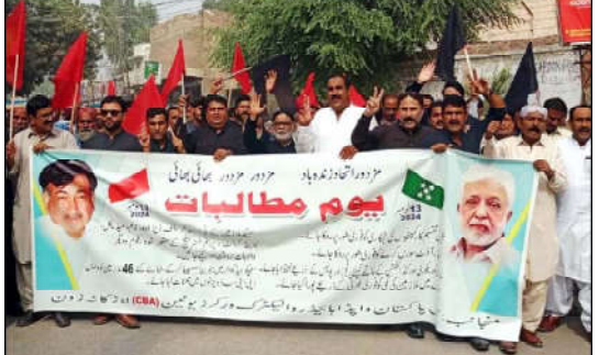
LARKANA: Members of All Pakistan Wapda Hydro Electric Workers Union are holding protest rally for acceptance of their demands, in Larkana.