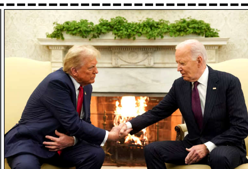
U.S. President Joe Biden meets with President-elect Donald Trump in the Oval Office at the White House in Washington, U.S.

United States' top diplomat said it's time to end the war. The Israeli military has denied any such intention, and Prime Minister Benjamin Netanyahu has said he does not want to reverse the 2005 withdrawal of settlers from Gaza. Hardliners in his government have talked openly about going back. It said forces have killed hundreds of Hamas militants in Jabalia, Beit Lahiya and Beit Hanoun during its new military offensive, which began more than a month ago. Hamas and the Islamic Jihad armed wing claimed killing several Israeli soldiers during ambushes and anti-tank rocket fire. Efforts by Arab mediators, Qatar and Egypt, backed by the United States, have so far failed to end the war in Gaza, with Hamas and Israel trading the blame for the lack of progress.