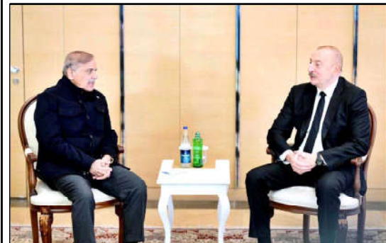
BAKU: Prime Minister Muhammad Shehbaz Sharif meets President of Azerbaijan Ilham Aliyev on the sidelines of COP29 Climate Action Summit.

The visiting Principal Deputy Assistant Secretary discussed the modernisation of the agriculture sector to transform life in rural areas.