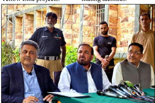
KARACHI: Provincial Election Commissioner, Sharifullah along with others addresses to media persons during press conference regarding the Local Government (LG) By-Elections in Sindh, held at Election Commission of Pakistan (ECP) Office in Karachi.

The senior minister who holds portfolios of Information, Transport and Mass Transit and Excise, Taxation and Narcotics Control, was presiding over a meeting of Transport and Mass Transit Department held here to review progress on the BRT Red Line and Yellow Line projects.