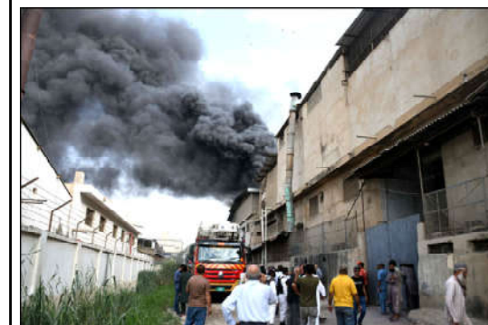
KARACHI: Smoke billows as a fire blazes at Plastic Factory site area Ghani Chowrangi in Karachi.