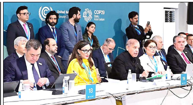
BAKU: Prime Minister Muhammad Shehbaz Sharif addressing the High-Level Climate Finance Roundtable hosted by Pakistan at COP-29 Climate Action Summit in Baku.

Prime Minister Shehbaz underscored that the donor countries should fulfill their commitment to provide 0.7 per cent of their gross national income as developing assistance and capitalize existing climate funds.