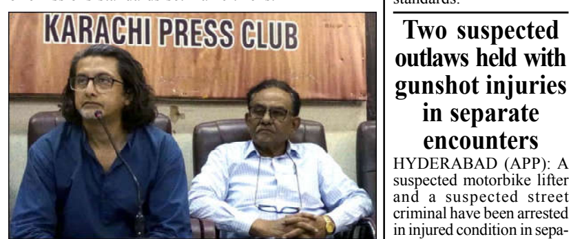
KARACHI: Climate Action Center (CAC) Representatives addressing to media persons during press conference regarding Air Quality Smog, held at Karachi press club.