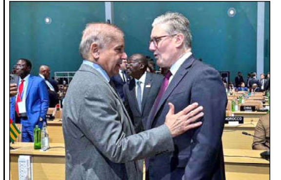
BAKU: Prime Minister Muhammad Shehbaz Sharif meets Prime Minister of the United Kingdom Sir Keir Starmer on the sidelines of COP-29 Climate Action Summit.

BAKU (APP): Prime Minister Muhammad Shehbaz Sharif and Prime Minister of Denmark Mette Frederiksen on Tuesday agreed on the need to enhance bilateral cooperation as well as build global consensus on the key climate change priorities so that the planet could be saved from the harmful impact of climate change. During a meeting on the sidelines of the COP 29, both sides discussed bilateral cooperation between Pakistan and Denmark in political, trade and investment, agriculture, information technology and climate change with special emphasis on the areas of green transition and infrastructural development, PM Office Media Wing said in a press release. Referring to 75 years of diplomatic relations between Pakistan and Denmark this year, the prime minister stressed on the need to expand economic ties through collaborative partnerships. The Danish premier conveyed their willingness to work with Pakistan for further bolstering bilateral economic ties and addressing regional and global issues of common interest.