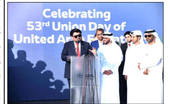
KARACHI: Sindh Governor Kamran Khan Tessori talks to media during his visit to AD Ports.

Emphasizing the significant role of workers in these projects, Kamran Khan Tessori noted that progress on the ports would not be possible without the dedication of laborers, whose efforts are strengthening the national economy. He stressed on keeping the welfare of these hardworking individuals as a top priority.