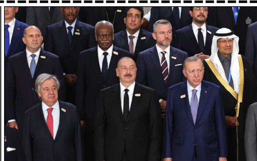
United Nations Secretary-General Antonio Guterres, Azerbaijan's President Ilham Aliyev, Turkish President Recep Tayyip Erdogan and other leaders pose for a family photo at the United Nations climate change conference, known as COP29, in Baku, Azerbaijan.

He singled out the United States, the world's largest historic carbon emitter, and the European Union for particular criticism. "Unfortunately, double standards, a habit to lecture other countries, and political hypocrisy became kind of modus operandi for some politicians, state-controlled NGOs and fake news media in some Western countries," he said. The United States is the world's largest oil and gas producer. European countries, meanwhile, have some of the world's strictest targets to cut emissions by 2030 - but have also raced to secure new gas supplies following Russia's 2022 full-scale invasion of Ukraine.