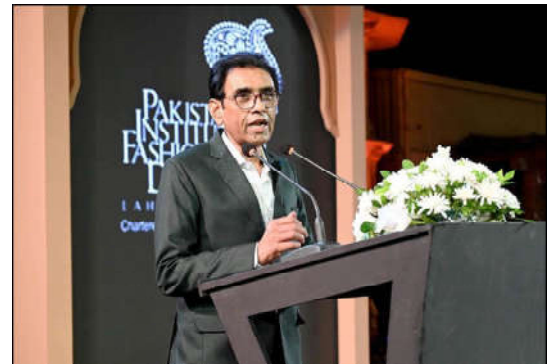
ISLAMABAD: Federal Minister Khalid Maqbool Siddiqui while addressing the inaugural ceremony of the PIFD Karachi chapter.