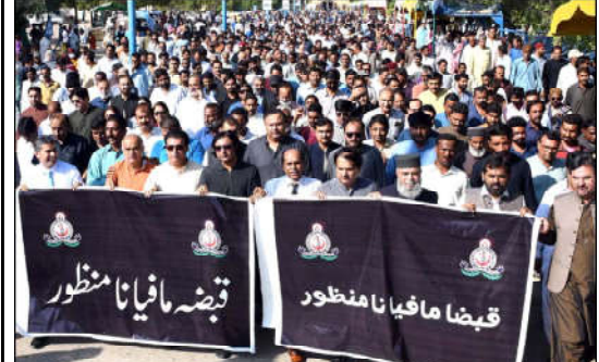
HYDERABAD: Students, Staff Members of Liaquat University of Medical and Health Sciences (LUMHS) are holding protest rally against high handedness of land grabbers, at Jamshoro.

HYDERABAD (APP): The Sindh Public Service Commission (SPSC) has announced the results of the written examination for Secondary School Teachers (BPS-16) in Hyderabad Division's Science and General categories. A total of 350 male and 179 female candidates in the General category, and 338 male and 190 female candidates in the Science category, have been declared successful. The examination was conducted in May 2024 for vacancies advertised under Advertisement No. 09/2022, which received approximately 400,000 applications. The SPSC has released detailed results, including candidate names and scores, and instructed successful candidates to submit their documents.