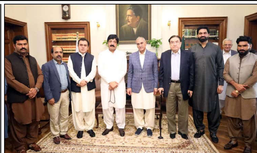
LAHORE: A delegation of PPP members of parliament and Mohmand Agency Loya Jirga in a group photo with the Punjab Governor, Sardar Saleem Haider Khan at Governor House.