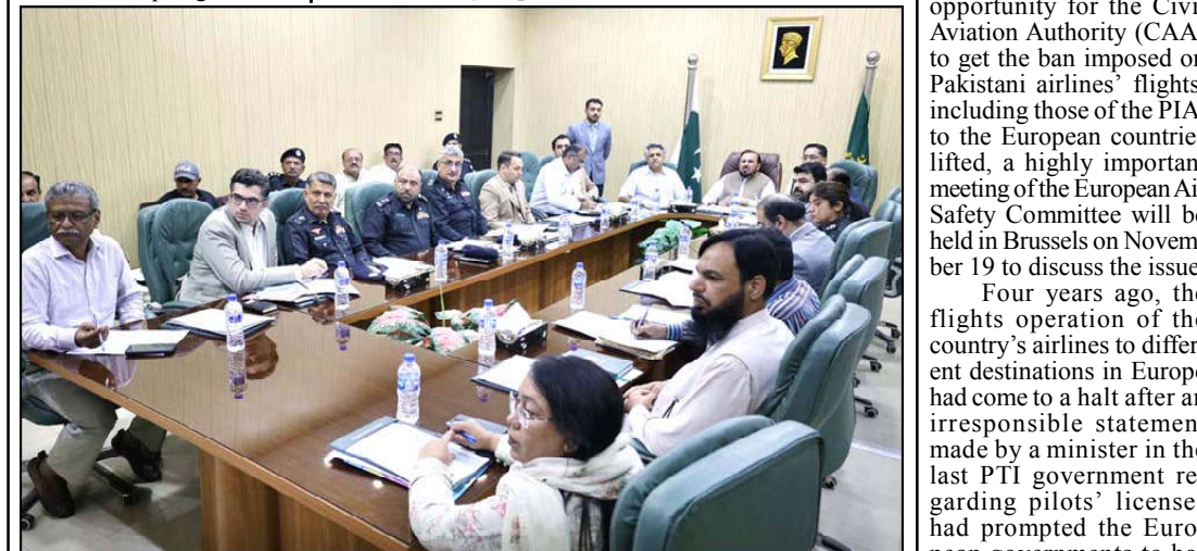
KARACHI: Provincial Election Commissioner Sindh, Sharifullah, presides over a meeting to review arrangements for the upcoming Local Bodies election across the province.

Four years ago, the flights operation of the country's airlines to different destinations in Europe had come to a halt after an irresponsible statement made by a minister in the last PTI government regarding pilots' licenses had prompted the European governments to bar flights from Pakistan from entering their countries' airspace.