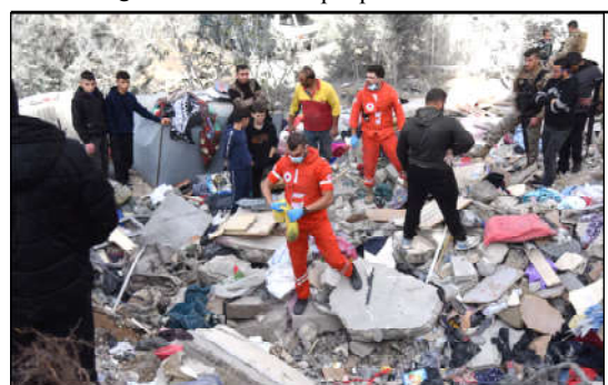
Lebanese Red Cross members look for remains of bodies at the site of an Israeli airstrike on the northern Lebanese town of Ain Yaaqoub, Lebanon.