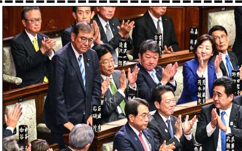
Lawmakers applaud as Japan's Prime Minister Shigeru Ishiba (standing L) is reappointed as leader after the second round of a parliamentary vote to nominate a prime minister following the October 27 general election, during a special session of parliament in Tokyo.