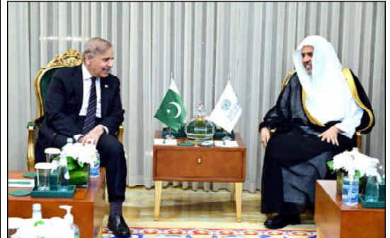
RIYADH: Prime Minister Muhammad Shehbaz Sharif meets with Secretary General of the World Muslim League Sheikh Dr. Mohammad bin Issa on the sidelines of Arab-Islamic Extraordinary Summit.