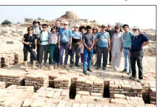
MOHENJO DARO: A tourist delegation from Italy are visiting and expressed keen interest in the historical ruins of the World Heritage Monuments of Mohenjo Daro.