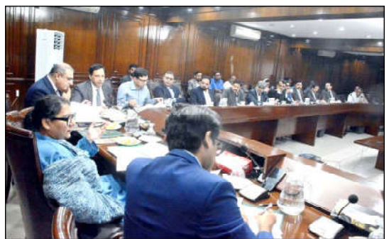
KARACHI: Senator Quratulain Marri, Chairperson of the Senate Standing Committee on Planning, presides over a meeting to review PSDP projects for Sindh at Sindh Secretariat.