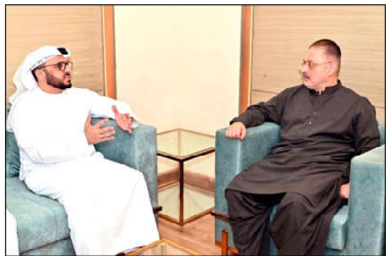
KARACHI: Sindh Minister for Information, Transport and Mass Transit, Excise Taxation and Narcotics Control, Sharjeel Inam Memon exchanges views with UAE Consul General, Bakheet Ateeq Al Remethi during meeting held at his office in Karachi.

The provincial government is committed to enhance the partnership for promoting peace and prosperity and deepening these relations, the minister vowed.