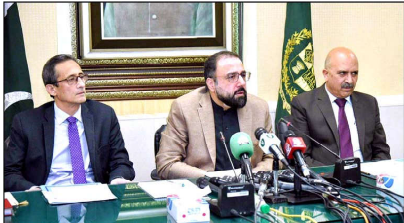
ISLAMABAD: Federal Minister for Religious Affairs and Inter-Faith Harmony, Chaudhary Salik Hussain announced Hajj Policy 2025 during press conference in federal capital.

suues, including the use of banned Chinese salt (MSG) at some locations. Poor maintenance of freezers and cross-contamination risks were also noted, leading to immediate action and the suspension of production at three centers with substandard hygiene practices. Director General Sindh Food Authority, Muzamil Hussain Halepoto, emphasized the importance of adhering to food safety protocols to safeguard public health and reaffirmed that such operations will continue against violators.