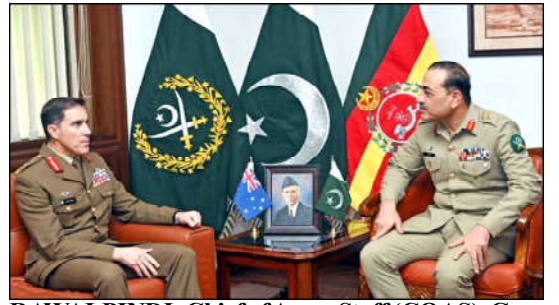
RAWALPINDI: Chief of Army Staff (COAS), General Syed Asim Munir exchanging views with Lieutenant General Simon Stuart, Chief of the Australian Army during meeting held at General Headquarters (GHQ) in Rawalpindi.

President Zardari thanked President Xi Jinping for his insight, leadership, and cooperation in advancing Pakistan-China relations.