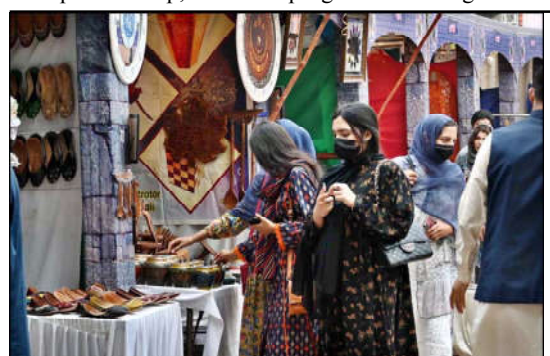
ISLAMABAD: Women visiting stalls during ten days Folk Festival Lok Mela at Lok Virsa in the Federal Capital.

She said, "By providing secure cyberspace to businesses, the government of Pakistan has made significant progress in that regard."