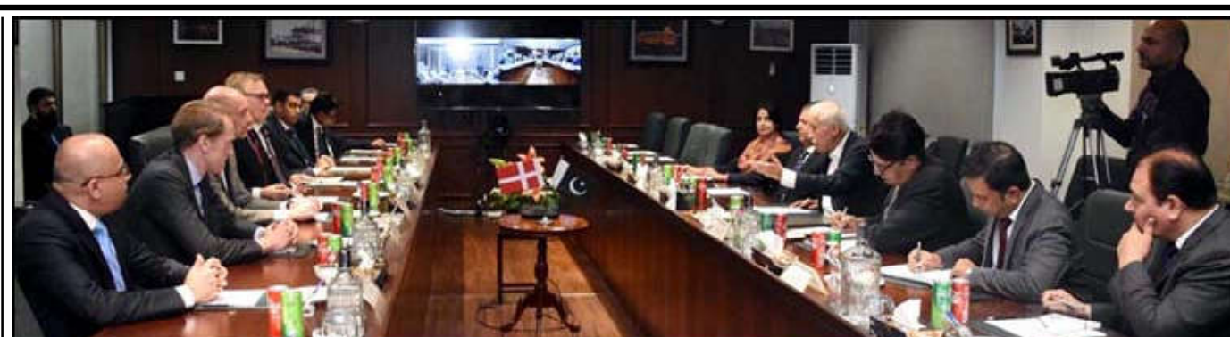
ISLAMABAD: Federal Minister for Maritime Affairs, Qaiser Ahmed Shaikh along with the officers of Ministry of Maritime Affairs in meeting with the senior officials of Danish Shipping Company Maersk Line in Islamabad.

He also highlighted the role of Pakistani expatriates settled in Denmark for strengthening bilateral ties and promoting commerce and cultural exchanges between both the countries.