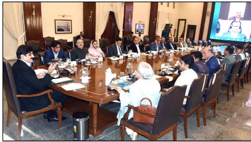
KARACHI: Sindh Chief Minister, Syed Murad Ali Shah chairs 4th the Population Task Force meeting, at CM House in Karachi.

tion surge, with an annual growth rate of 2.55 per cent, resulting in a total population of 241 million in Pakistan. "Sindh alone has grown to over 55 million people, although officials suspect that the census data may have undercounted the actual figures," he said. The chief minister, despite these challenges, highlighted his government's ongoing efforts to mitigate the socio-economic effects of rapid population growth. He referenced several legislative and policy measures, including the Child Marriage Restraint Act of 2013, the recently approved Reproductive Health Rights Bill, the Population Policy of Sindh (2016), and the Costed Implementation Plan on Family Planning (2015), as part of Sindh's proactive approach.