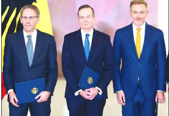
Newly appointed German Finance Minister Joerg Kuehns stands next to Transport and Justice Minister Volker Wissing, and his predecessor, Christian Lindner.

Monitoring Desk SOCHI: Russian President Vladimir Putin on Thursday (Nov 7) congratulated Donald Trump on winning the US election, praised him for showing courage when a gunman tried to assassinate him, and said Moscow was ready for dialogue with the Republican president-elect. In his first public remarks since Trump's win, Putin said Trump had acted like a real man during an assassination attempt on him while he was speaking at a campaign rally in Pennsylvania in July. "He behaved, in my opinion, in a very correct way, courageously, like a real man," Putin said at the Valdai discussion club in the Russian Black Sea resort of Sochi. "I take this opportunity to congratulate him on his election." Putin said remarks Trump had made during the election campaign about Ukraine and restoring relations with Russia deserved attention. "What was said about the desire to restore relations with Russia, to bring about the end of the Ukrainian crisis, in my opinion this deserves attention at least," said Putin. Trump said during campaigning that he could bring peace in Ukraine within 24 hours if elected, but has given few details on how he would seek to end the biggest land war in Europe since World War II. The 72-year-old Kremlin chief gave just one note of caution: "I do not know what is going to happen now. I have no clue."