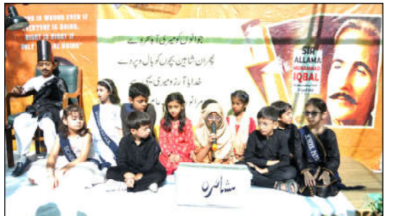
HYDERABAD: Students of a private school present tableaux to pay tribute to national poet on his Birthday.