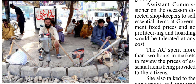
KARACHI: Laborers sit with their tools during the hot days, waiting for work at the roadside to earn a livelihood in the provincial capital.