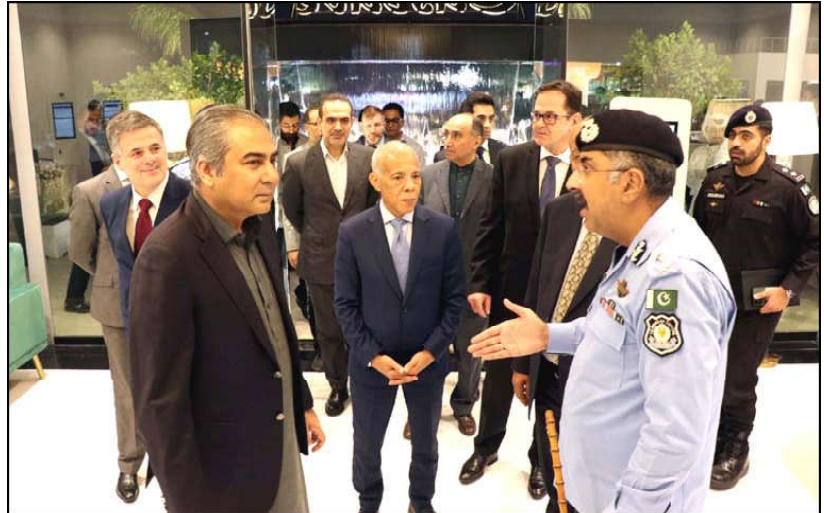
ISLAMABAD: Federal Minister for Interior, Mohsin Naqvi visiting Cascade Facilitation Center, at Diplomatic Enclave in Islamabad.