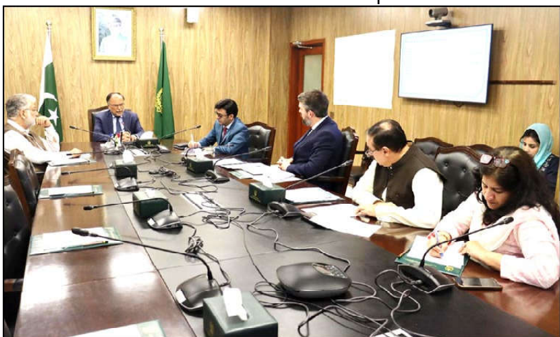
Federal Minister for Planning & Development Ahsan Iqbal chairing a high-level meeting on the "Framework for Processing Concept Proposals for New Projects under the Pakistan-UK Education Gateway Phase 2" in Islamabad.

In the meeting, the DG Audit Sindh raised objections to the complete record of Rs 600 million spent on solar tube wells and solar water pumps.