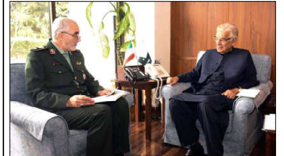
ISLAMABAD: H.E. Brig General Hojjatollah Qoreishi Deputy Minister for Defence of Islamic Republic of Iran Called on Minister for Defence & Defence Production, Khawaja Muhammad Asif in federal capital.

He said due to the efforts of the Prime Minister, Saudi Arabia, UAE and Qatar were investing in Pakistan whereas Azerbaijan had also announced 2 billion dollars investment in Pakistan.