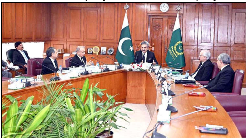
ISLAMABAD: The Hon'ble Chief Justice of Pakistan/Chairman Supreme Judicial Council Justice Yahya Afridi presiding over the meeting of Supreme Judicial Council at Supreme court of Pakistan.

representatives included Civil Society Organizations (CSOs), faith actors, women activists, and district networks including Women Leadership Forum (WLF) and Community Support Group (CSG).