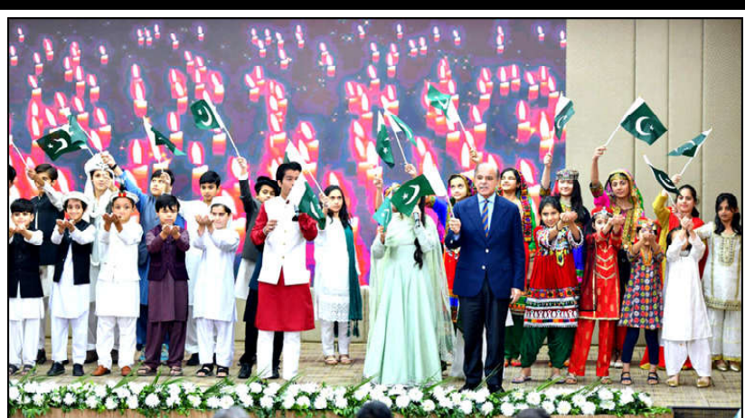
ISLAMABAD: Prime Minister Muhammad Shehbaz Sharif waving the Pakistani flag at a ceremony to celebrate Allama Muhammad Iqbal's Birthday.