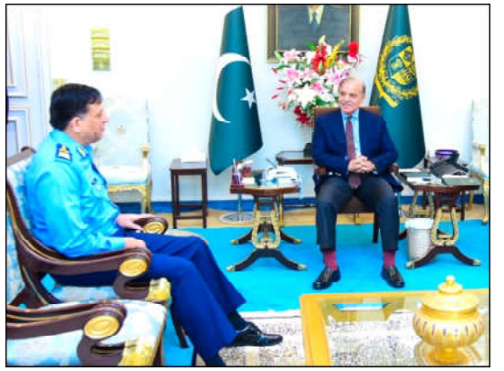
ISLAMABAD: Chief of Air Staff Air Chief Marshal Zaheer Ahmad Babar Sidhu called on Prime Minister Muhammad Shehbaz Sharif.