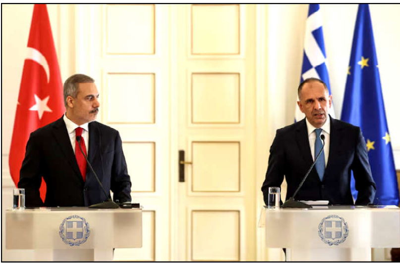
Turkish Foreign Minister Hakan Fidan and Greek Foreign Minister George Gerapetritis give statements to the press at the Ministry of Foreign Affairs in Athens, Greece.

rights' age and gender backs the Palestinian assertion that women and children represent a large portion of those killed in the war. This finding indicates "a systematic violation of the fundamental principles of international humanitarian law, including distinction and proportionality," the U.N. rights office said in a statement accompanying the 32-page report. "It is essential that there is due reckoning with respect to the allegations of serious violations of international law through credible and impartial judicial bodies and that, in the meantime, all relevant information and evidence are collected and preserved," United Nations High Commissioner for Human Rights Volker Turk said. The office of Israeli Prime Minister Benjamin Netanyahu did not immediately respond to a request by Reuters for comment on the report's findings. Israel's military, which began its offensive in response to the Oct. 7, 2023 attack in which Hamas fighters killed about 1,200 people in southern Israel and seized more than 250 hostages, says it takes care to avoid harming civilians in Gaza. It has said approximately one civilian has been killed for every fighter, a ratio it blames on Hamas, saying the Palestinian militant group uses civilian facilities. Hamas has denied using civilians and civilian infrastructure, including hospitals, as human shields.