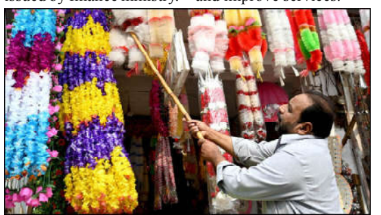
RAWALPINDI: Ashopkeeper arranges garlands and festive decorations, ready to welcome customers seeking to celebrate in style as the wedding season kicking off in the twin cities.

During the meeting, the Minister reiterated the government's resolve for tax reforms with a focus on people-processed technology and end-to-end digitalisation to enhance transparency, plug leakages and improve services.