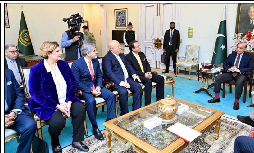
ISLAMABAD: A delegation of VEON Group calls on Prime Minister Muhammad Shehbaz Sharif.