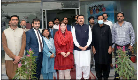
LAHORE: Governor Khyber Pakhtunkhwa, Faisal Karim Kundi, poses for a group photo with officials of the Punjab Social Protection Authority during his visit to the Punjab Social Protection Authority (PSPS).

If there is pressure of government on DC and others then they will work.