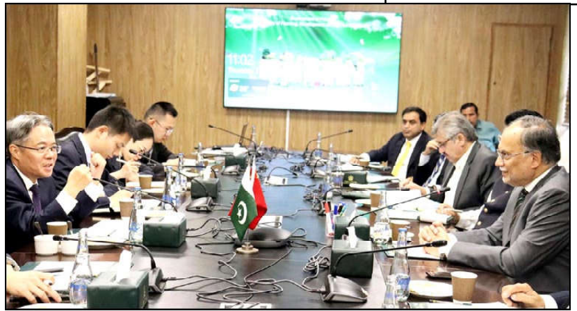
ISLAMABAD: Chinese Ambassador to Pakistan, Mr. Jiang Zaidong, called on the Federal Minister for Planning, Development & Special Initiatives, Prof. Ahsan Iqbal.

Current year so many people lost their lives across northern Sindh including Karachi and Hyderabad due to heatwave and most of the victims were elderly people.