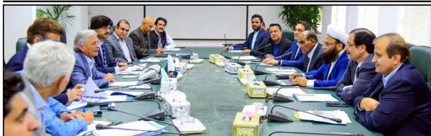
ISLAMABAD: Federal Minister for Industries and Production, Rana Tanveer Hussain presided over a meeting of the Sugar Advisory Board (SAB).