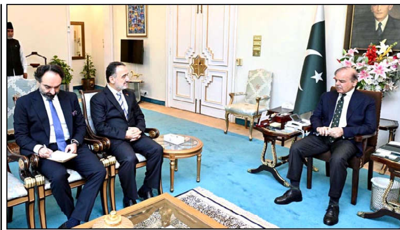
ISLAMABAD: Ambassador of the Republic of Turkey, Irfan Neziroglu calls on Prime Minister Muhammad Shehbaz Sharif.

According to the chief minister as part of the Competitive and Liveable City of Karachi (CLICK) project, a one-stop regulatory approval system for 16 departments is in development to streamline investment procedures.