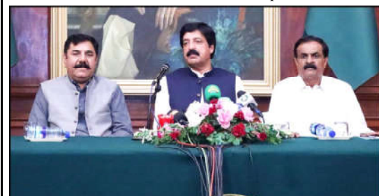
LAHORE: Governor Punjab, Sardar Saleem Haider Khan, addressing a press conference regarding the problems of farmers at the Governor House Lahore along with General Secretary of Pakistan Peoples' Party Central Punjab, Syed Hassan Murtaza.

that the government has coordinated with pharmaceutical manufacturers to maintain adequate stocks of essential medicines for smog-related illnesses. He also announced the formation of a daily monitoring group, consisting of representatives from both the pharmaceutical industry and the health department, to ensure a steady supply of these medicines. "All government hospitals are well-stocked with medicines to treat smog-induced ailments," Nazir affirmed. He further urged the public to buy medicines only as needed, to allow equal access for all.