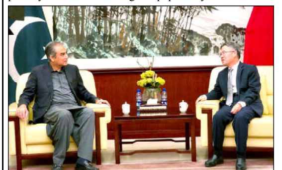
ISLAMABAD: Federal Minister for Interior Mohsin Naqvi in a meeting with Chinese Ambassador Jiang Zaidong.

Naqvi stated, "We fully agree with the Chinese approach of combining development with security, and we will ensure the safety of Chinese nationals and projects as a top priority."