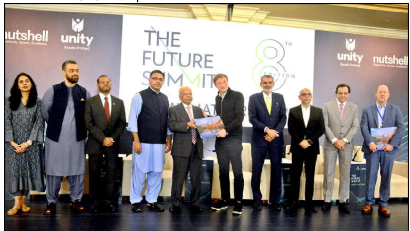
KARACHI: Renowned economist and former SBP governor, Dr. Ishrat Hussain giving away souvenirs to panelists at the Eighth Edition of Future Summit.