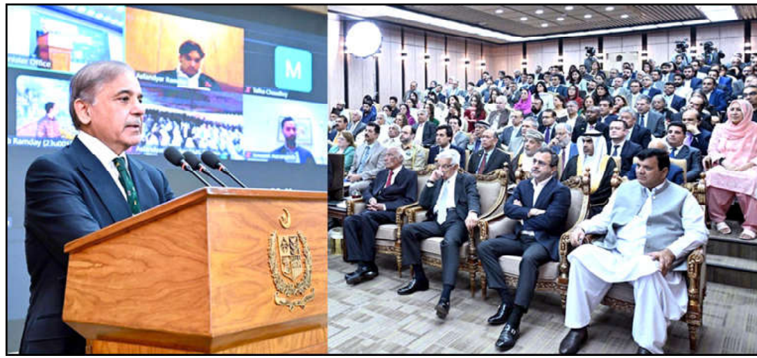
ISLAMABAD: Prime Minister Muhammad Shehbaz Sharif addresses a ceremony of laying a foundation stone of Ramday University, Thagos, Ghanche.