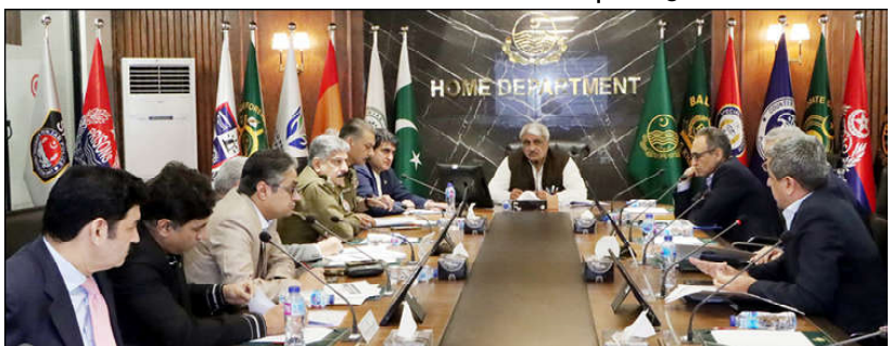
LAHORE: Punjab Minister for health presides over the high level meeting at Home Department.

The speakers discussed risk factors such as lifestyle habits, obesity, and family history, and encouraged attendees to adopt protective practices including regular exercise, maintaining a healthy weight, and breastfeeding. They also discussed the significance of annual screenings—such as mammograms and clinical breast exams.