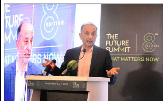
KARACHI: Federal Minister for Petroleum, Dr. Musadik Malik addressing the Eighth Edition of Future Summit as a keynote speaker.