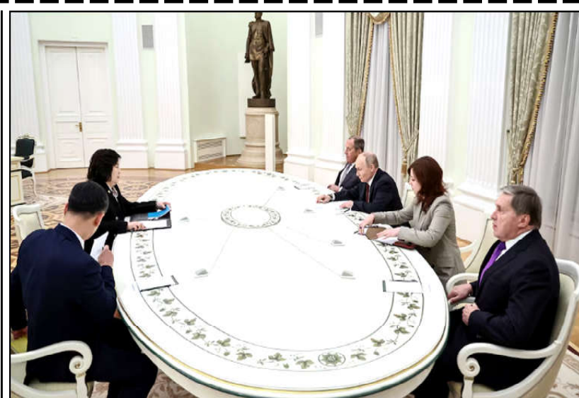
Members of the delegations, led by Russian President Vladimir Putin and North Korean Foreign Minister Choe Son Hui, attend a meeting in Moscow, Russia.

troops to Russia. If they start fighting against Ukraine forces, it would mark North Korea's first participation in a large-scale conflict since the end of the 1950-53 Korean War. North Korean leader Kim Jong Un has used the Russia-Ukraine war as a way to expand defense and economic cooperation with Russia in the face of an intensifying U.S.-led pressure campaign against his advancing nuclear program. The U.S., South Korea and others accuse North Korea of having already exported artillery shells, missiles and other conventional arms to Russia. In the past two years, Kim has also ramped up tests of nuclear-capable missile systems, as Russia and China have repeatedly blocked U.S.-led attempts to toughen international sanctions on North Korea over its testing activities in defiance of U.N. bans.