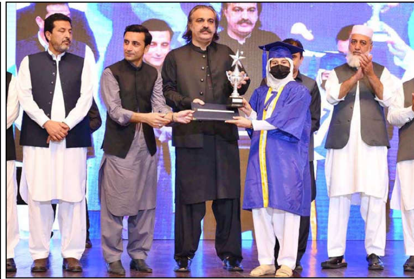
PESHAWAR: Chief Minister KP Ali Amin Gandapur giving degree and trophy to graduate student during the graduation ceremony under Alternate Learning Pathways Initiative of Elementary and Secondary Education Department at Nishtar Hall.

government had been working on introducing an Education Card, prioritizing the merged districts and backward areas of the province. The Chief Minister added that female students in the schools of merged districts were being provided with a monthly stipend to improve literacy rates in those districts. He was addressing a graduation ceremony organized by the Elementary and Secondary Education Department here on Monday at Nishtar Hall, Peshawar.