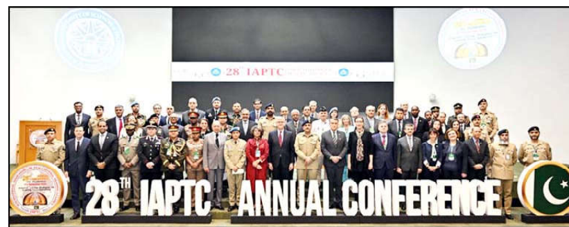
ISLAMABAD: Chief of Army Staff (COAS) General Syed Asim Muneer in a group photo during 28th Annual Conference of International Association of Peacekeeping Training Centre (IAPTC).