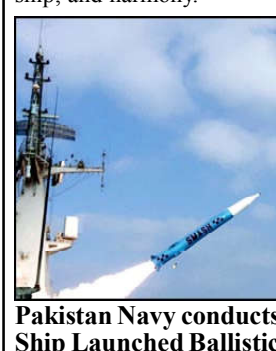
Pakistan Navy conducts successful flight test of an indigenously developed Ship Launched Ballistic Missile.

This unique gathering celebrated the cultural richness of Diwali, highlighting its values of light, friendship, and harmony.