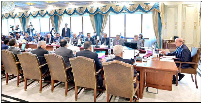
ISLAMABAD: Prime Minister Muhammad Shehbaz Sharif chairs the Federal Cabinet Meeting.

Sustainability Investment Expo 2024 held alongside the moot to showcase cutting-edge technology, fostering collaboration and attracting investment. He said the theme of the conference "From Fragility to Resilience: Enhancing Sustainable Development" was a reminder of the critical importance of transforming and turning vulnerabilities into strengths.