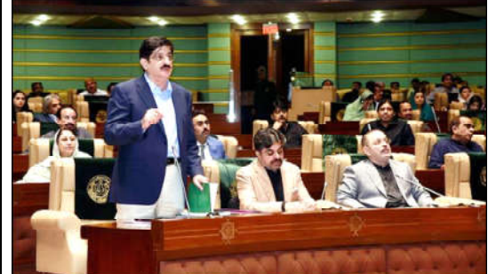
KARACHI: Sindh Chief Minister Syed Murad Ali Shah speaks on the floor of the Sindh Assembly.

He further said that the history would always remember those who had staked their politics for the sake of country's survival, adding the historians would always write about those who worked for the sake of the country and those elements who addressed letter to International Monetary Fund (IMF) to halt country's financial programme. The prime minister also lauded the members of parliament belonging to PML-N for sacrificing their politics for the sake of country and said that they had thought about 240 million people.