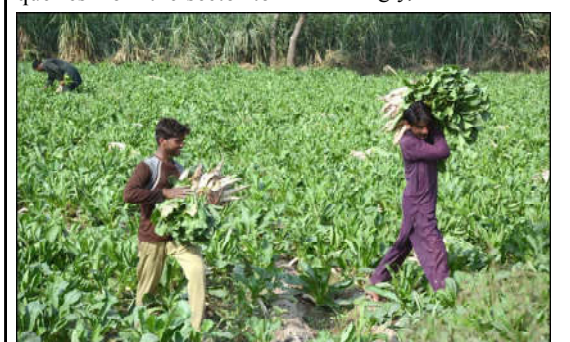
FAISALABAD: Farmers carrying freshly harvested radishes for transport to the vegetable market.

The petrochemical industry has evolved over the past many decades and we need to amend our laws accordingly, he added.