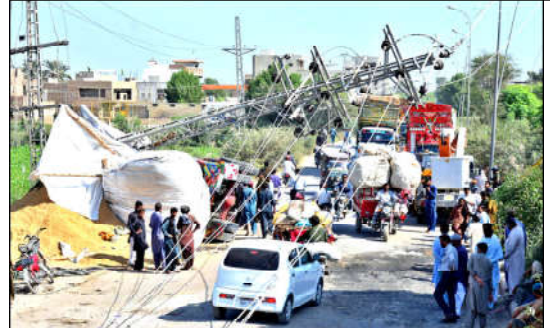
HYDERABAD: An electric pole has fallen due to a truck collision at Tando Yousuf Road.

KARACHI (APP): A man was killed and another sustained injuries in a traffic accident that took place near Korangi Godam Chorangi area of Karachi, tv channels quoting rescue sources reported on Monday. According to details, a rashly driven trailer hit the two-wheeler coming from opposite direction near Korangi Godam Chorangi area. As a result of accident, a motorcyclist died on the spot. One person was also injured in the same incident. Rescue team rushed to the site and shifted the dead and injured to nearby hospital. Police also reached the spot and started search for the heavy vehicle.