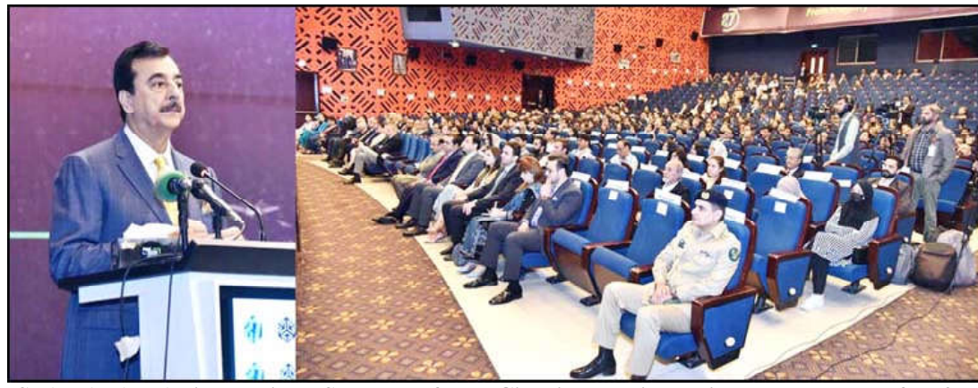
ISLAMABAD: Acting President Syed Yousaf Raza Gillani addressing the inaugural plenary of the 27th Sustainable Development Conference at Pak-China Friendship Centre.

In the end, Sherry Rehman inaugurated the 27th Sustainable Development Expo 2024.