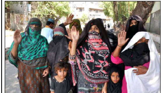
HYDERABAD: Women residents of Tando Jam are holding protest demonstration against high handedness of their area police department, at Hyderabad press club.

said that urban development is not possible without the cooperation of businessmen and other stakeholders. He suggested that a forum should be formed with administrative officers, businessmen and other stakeholders headed by the Deputy Commissioner so that a comprehensive plan could be made and implemented to provide relief to the citizens. He said that funds have been allocated for the problems of sewage in the city and construction and repair of roads.