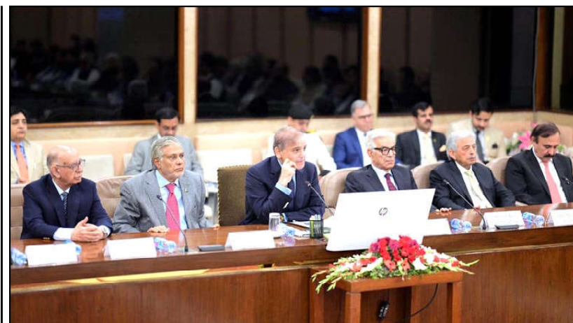
ISLAMABAD: Prime Minister Muhammad Shehbaz Sharif chairs a meeting of the PMLN's Parliamentary Party at Parliament House.

Despite the disruption, the minister briefed the assembly on the provisions of the bills, highlighting the backlog of thousands of pending cases at the Supreme Court's registry, which necessitates the increase in judicial capacity.