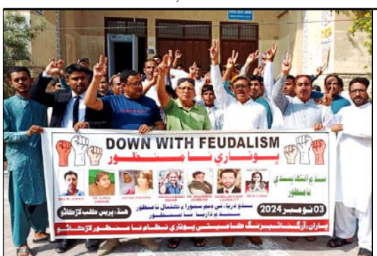
LARKANA: Members of the Organizing Committee Feudalism are holding protest demonstration against the feudalism system in Sindh, at Jinnah Bagh in Larkana.

The SBCA remains committed to transforming Shahrah-e-Faisal into a visually appealing avenue that reflects the city's urban development goals. This project not only highlights Karachi's architectural charm but also sets an example for other districts to enhance their infrastructure aesthetics in the interest of beautifying public spaces across the city.