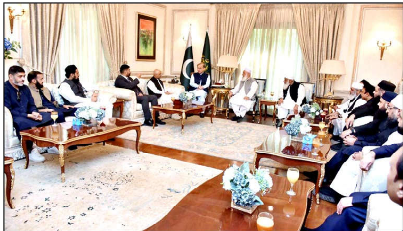
LAHORE: A delegation of leading businessmen of the United Kingdom calls on Prime Minister Muhammad Shehbaz Sharif.

A former privatisation minister was also giving him suggestions, he said and added that he should have implemented those suggestions during his tenure as the minister. He said that the PIA was a national asset and could not be sold at throw-away price. Abdul Aleem Khan said that on the PIA bidding day, he was in Riyadh busy in a meeting with Saudi Arabia's Investment minister. He said that on the day of PIA bidding two meetings were held, one of the privatisation commission, which he presided over, and he also attended the CCOP meeting on the same day.