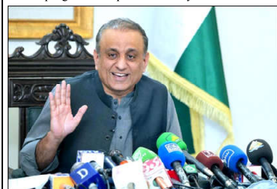
LAHORE: Federal Minister for Privatization Board of Investment & Communications Abdul Aleem Khan held media talk on PIA.