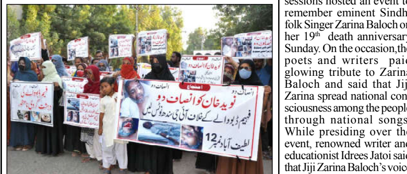
HYDERABAD: Residents of Latifabad No.12 are holding protest demonstration against high handedness of influential people, at Hyderabad press club.

According to him an official letter dated October 31, 2024, and a prior letter from the district session judge No. D&SJ/AM/3708 dated October 26, 2024, all details regarding the textbooks were provided to the district session judge under DEO's letter No. DEO/ES&HS/Malir/Admn/2280/2024 dated October 29, 2024.