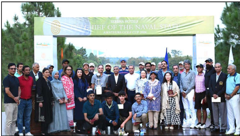
ISLAMABAD: Chief of the Naval Staff Admiral Naveed Ashraf along with prize winners of 17th CNS Amateur Golf Cup 2024 at MGGC, Islamabad.

Organized under the Center of Innovation and Entrepreneurship (CIE) and Office of Research, Innovation, and Commercialization (ORIC) at Isra University, this two-day event offered an ideal platform for young entrepreneurs, attracting participants from prominent institutions such as SST Public School Rashidabad, the University of Sindh, Mehran University of Engineering & Technology, and the University of Karachi.