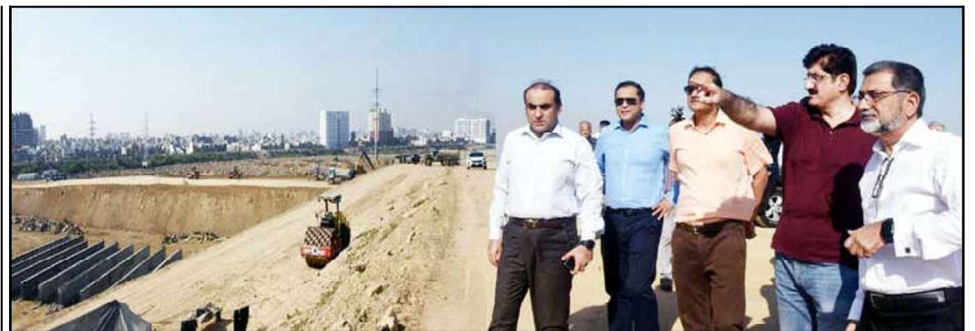
KARACHI: Sindh Chief Minister, Syed Murad Ali Shah inspects the progress and quality of the construction work of Malir Expressway, in Karachi.

Murad Ali Shah, along with his team, travelled along the expressway from Shah Faisal to Quaidabad to inspect the ongoing construction. During the briefing, it was noted that while the expressway itself was ready, the small interchange at Quaidabad had been halted due to issues with land acquisition.