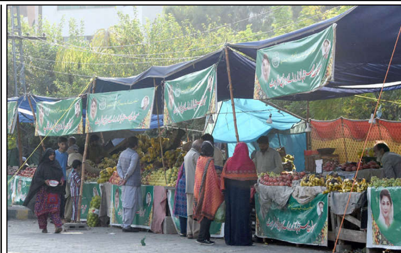
RAWALPINDI: People are busy buying fruits and vegetables in Sahulat Bazaar outside Allama Iqbal Park in the city.

feature the ninth session of the Pakistan-Uzbekistan Inter-Governmental Commission (IGC) on Trade-Economic and Scientific-Technical Cooperation, and the fourth Uzbekistan-Pakistan Business Forum, the commerce ministry said. The session will be co-chaired by Khan and Uzbek Minister for Investment, Industry and Trade Mr. Laziz Kudratov. The ministry said that the Business Forum will host 33 Pakistani business delegates across various sectors for B2B meetings aimed at fostering new partnerships and enhancing trade.