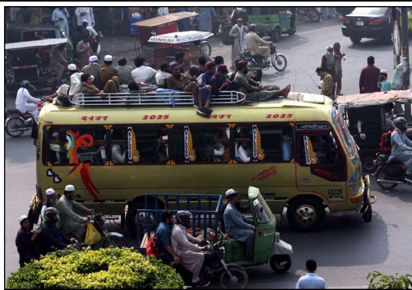
LAHORE: Participants are coming back after participated in Annual Tablighi Ijtema 2024 in Raiwind, at Thokar Niaz Baig in Lahore.