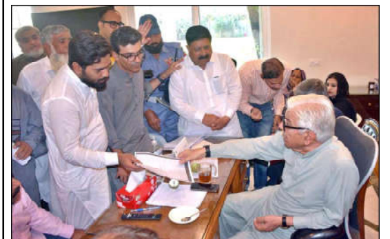
SIALKOT: Minister of Defense Khawaja Muhammad Asif listening to the problems of people at his residence.