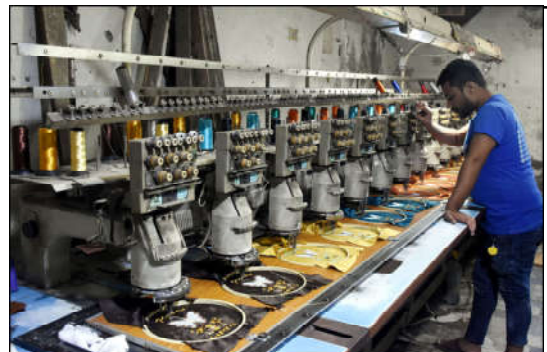
LAHORE: Artisans making ready-made clothes on a machine in the provincial capital.

In parallel, falling battery prices are also likely to boost solar adoption, making urgent grid adaptation essential for maintaining the financial viability of Pakistan's utility model.