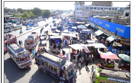
KARACHI: View of illegal encroachment by pushcart vendors on a road by influential encroachment mafia, which is creating problems for residents and commuters, showing negligence of concerned authorities of anti-encroachment department to draw its attention toward issue, at Quaidabad area in Karachi.