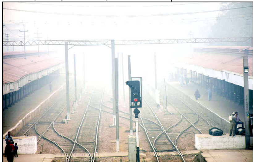
LAHORE: Citizens heading towards their destinations in the provincial capital in the early hours of the morning, during dense fog.

As per the ECP's code of conduct for the Cantonment Board bye-elections on November 14, 2024, law enforcement personnel, including police, must ensure free, fair, and transparent atmosphere outside polling stations including in Ward No. 06 of Rawalpindi Cantt, Ward Nos. 04 and 08 of Wah Cantt, and Ward No. 02, 04 of Pano Aqil Cantt, so that voters are not intimidated or obstructed in any way while casting their votes.