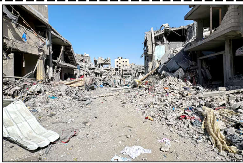
Palestinians view the damage after Israeli forces withdrew from the area around Kamal Adwan hospital, amid the ongoing Israel-Hamas conflict, in Jabalia, in the northern Gaza Strip.

Medics and Gaza's civil defence rescuers on Saturday reported three people killed in a strike on Nuseirat, in central Gaza, a day after AFP images showed the blood-stained shrouds of several people killed there in an Israeli strike.