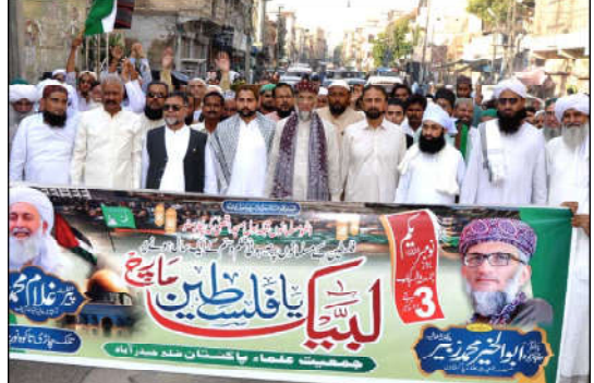
HYDERABAD: Activists of Jamiat Ulama Pakistan (JUP) are holding protest rally against Israeli cruel and inhumane acts and expressing unity with the innocent people of Palestine, in Hyderabad.

The AC spent more than two hours in markets to review the prices of essential items being provided to the citizens. She also talked to the consumers and inquired from them about the rates and quality of daily-use items.