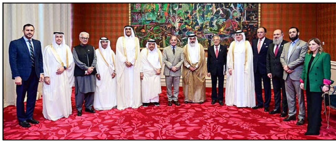
DOHA: Prime Minister Muhammad Shehbaz Sharif in a group photo with a delegation of Qatar Businessmen Association.

Additionally, the Chief Secretary highlighted the importance of vigilant neighborhood surveillance and instructed officials to develop an expanded system for monitoring activities in local communities.