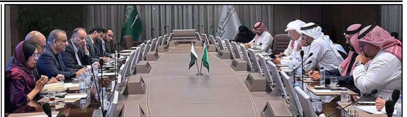
RIYADH: PAK Saudi Minister for investment Sh. Khalid Bin Abdul Aziz and Abdul Aleem Khan held meeting Musadaq Malik & senior officials joined.

Eleven ships were engaged at PQA berths during the last 24 hours, out of them five ships, GFS Ruby, Tucapel, KS Camellia, Zarrar Hanif, and Arkas are expected to sail on Friday. Cargo volume of 189,543 tonnes, comprising 151,032 tonnes import cargo and 38,511 tonnes of export cargo carried in 2,327 Containers (1,600 TEUs Imports & 1,637 TEUs Export).