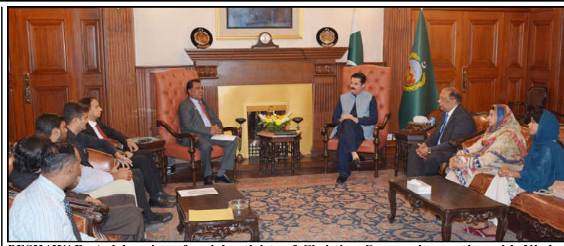
PESHAWAR: A delegation of social activists of Christian Community meeting with Khyber Pakhtunkhwa Governor Faisal Karim Kundi.

LAHORE (Online): Lahore High Court (LHC) has given indication for two days work from home in offices, closure of schools for two days and suspension of all commercial activities on Sunday in a week in view of smog.