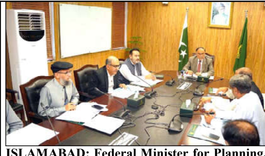
ISLAMABAD: Federal Minister for Planning, Development, Ahsan Iqbal chaired a meeting to review the progress on the transfer of Pak Public Works Department (Pak PWD) projects to provincial governments under the Public Sector Development Programme (PSDP) in Islamabad.

He also extended prayers for the swift recovery of the injured, emphasizing the government's commitment to bring the perpetrators to justice.