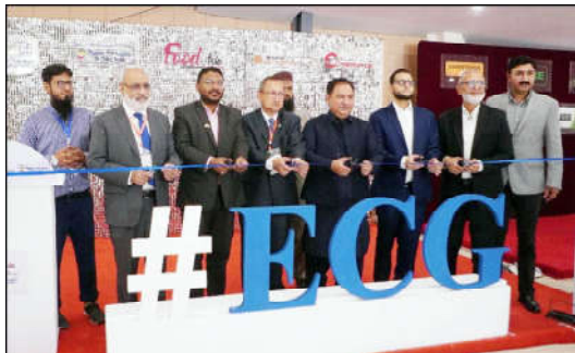
Various exhibiting companies from Vietnam, Thailand, Turkey, China, and Iran have received overwhelming responses from local delegates and visitors in the food and allied sectors, signing different business deals and MoUs for strategic partnerships in the future.

He reviewed development projects and other initiatives being taken by the Sukkur Municipal Corporation under public welfare schemes. SMC officials present in the meeting were instructed to streamline the sanitation system of the city and ensure that those who do not maintain hygiene around their commercial establishments follow sanitation rules to avoid legal proceedings.