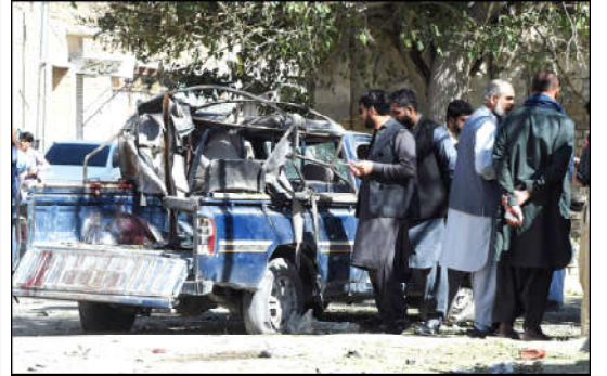
QUETTA: A view of damage vehicle at blast site near a school in Balochistan's Mastung district, killed five people, including three children and a police officer, according to security officials.