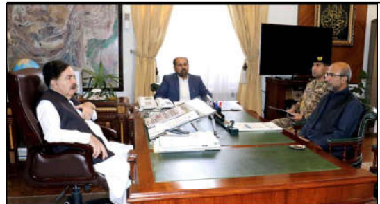
QUETTA: Chairperson Balochistan Revenue Authority Noor-ul-Haq Baloch meeting with Balochistan Governor Jaffar Khan Mandokhail.

He further urged the government to restore the Freight Subsidy at a higher rate to meet GOP target prorata, i.e., 1.5 to 2% instead of 1%.