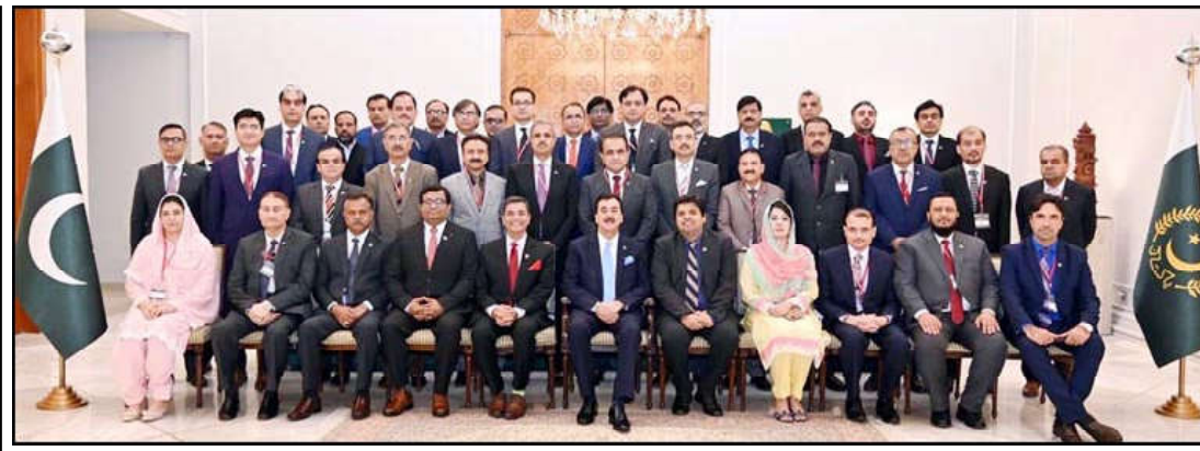
ISLAMABAD: A delegation of the participants of the 36th Senior Management Course (SMC) from the National Institute of Public Administration (NIPA), Karachi called on the Acting President Syed Yousuf Raza Gillani, at Aiwan-e-Sadr.

The ECC also took up and approved a proposal of Ministry of Interior for provision of Rs. 2.939 billion as Technical Supplementary Grant to Director General Immigration & Passports for purchase of two e-Passport Personalization systems and six desktop personalization machines for uninterrupted and smooth official business of the Directorate in the public interest.