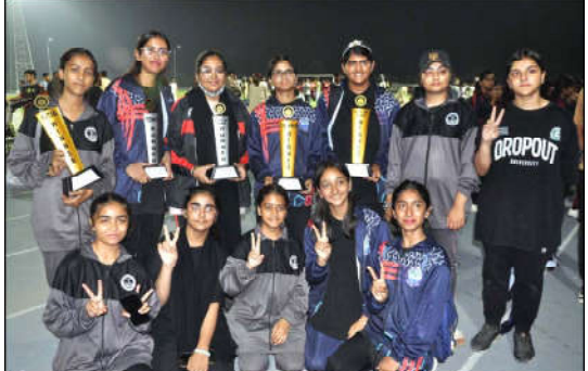
HYDERABAD: Players of winning team are in a group photo during the Iqbal Day Sports Festival held at Public School in Hyderabad.

the unique challenges faced by Khyber Pakhtunkhwa, particularly in terms of security, infrastructure, and economic development. Federal Minister acknowledged the concerns raised by the Governor and assured him of the federal government's commitment to addressing the issues, particularly in regard to enhancing the province's security apparatus and ensuring that Khyber Pakhtunkhwa receives its due share of resources and rights within the federation.