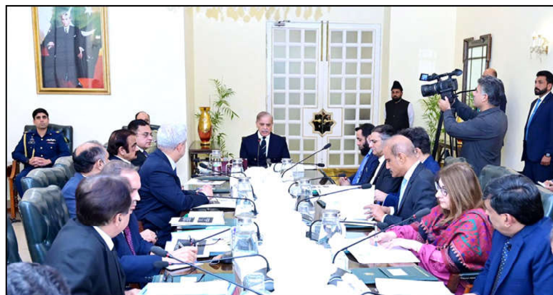
ISLAMABAD: Prime Minister Muhammad Shehbaz Sharif chairs a meeting regarding law and order situation.

exchange crossed the 100,000 points mark," the prime minister pointed out. "The country suffered billions in losses due to these attempts to spread disorder." The prime minister held the disruptive group and its masterminds responsible for the economic damage. He called for the immediate identification and punishment of the disruptive elements within the group.