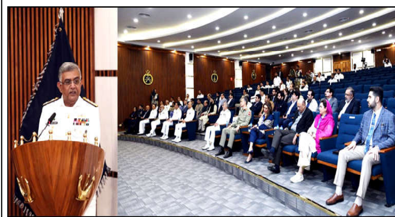
ISLAMABAD: Chief of the Naval Staff Admiral Naveed Ashraf addressing the participants of 7th Maritime Security Workshop (MARSEW-7) during visit to Naval Headquarters.

He emphasized efforts to enhance maritime and coastal security through initiatives such as Regional Maritime Security Patrols and Coastal Security and Harbour Defence measures. The visiting delegation, comprising parliamentarians, politicians, bureaucrats, Armed Forces officers, members of the media, and representatives of civil society, highly appreciated Pakistan Navy's efforts and offered valuable suggestions.