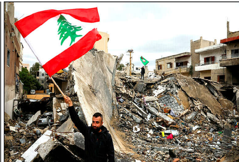
A man waves a Lebanese flag as he stands amidst the rubble of a building destroyed in Israeli strikes in Tyre, Lebanon.

Announcing the Lebanon accord on Tuesday, U.S. President Joe Biden said he would now renew his push for a ceasefire agreement in Gaza, urging Israel and Hamas to seize the moment. Months of efforts to negotiate a ceasefire have yielded scant progress, and negotiations are now on hold. The ceasefire in the parallel conflict between Israel and Hezbollah, an ally of Hamas, took effect before dawn on Wednesday, bringing a halt to hostilities that had escalated sharply in recent months and overshadowed the conflict in Gaza. In Nuseirat, one of Gaza's eight historic refugee camps, Israeli planes carried out several airstrikes, destroying a multi-storey building and hitting roads outside mosques.