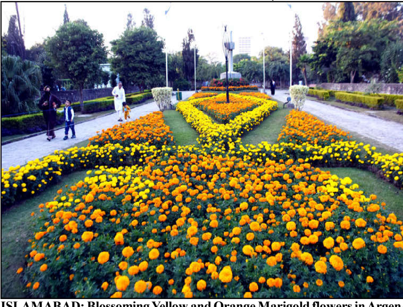
ISLAMABAD: Blossoming Yellow and Orange Marigold flowers in Argentina Park of Sector G-6 in the Federal Capital.

dens and staying vigilant After the police stateduring the high-risk denment, the court disposed of the case.