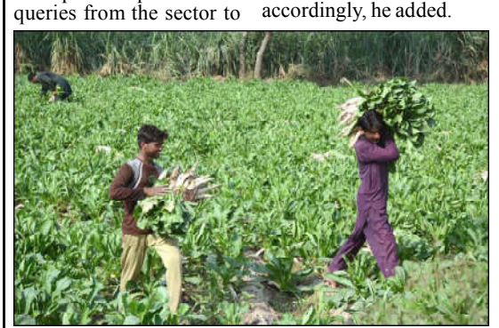
FAISALABAD: Farmers carrying freshly harvested radishes for transport to the vegetable market.

The petrochemical apprised that FPCCI had industry has evolved over officially written to the DG the past many decades and Explosives after receiving multiple complaints and we need to amend our laws accordingly, he added