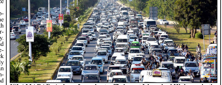
ISLAMABAD: A view of massive traffic jam at Islamabad Highway, in the Federal Capital.