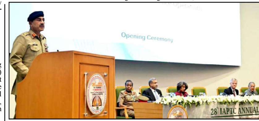
ISLAMABAD: Chief of Army Staff (COAS) General Syed Asim Munir addressing 28th Annual Conference of International Association of Peacekeeping Training Centre (IAPTC)

The bills include the Supreme Court (Practice and Procedure) (Amendment) Bill, 2024," the "Islamabad High Court (Amendment) Bill, 2024,<sup>3</sup> Pak Army Amendment Bill, 2024," the Pakistan Air Force Amendment Bill, 2024," and the "Pakistan Navy Amendment