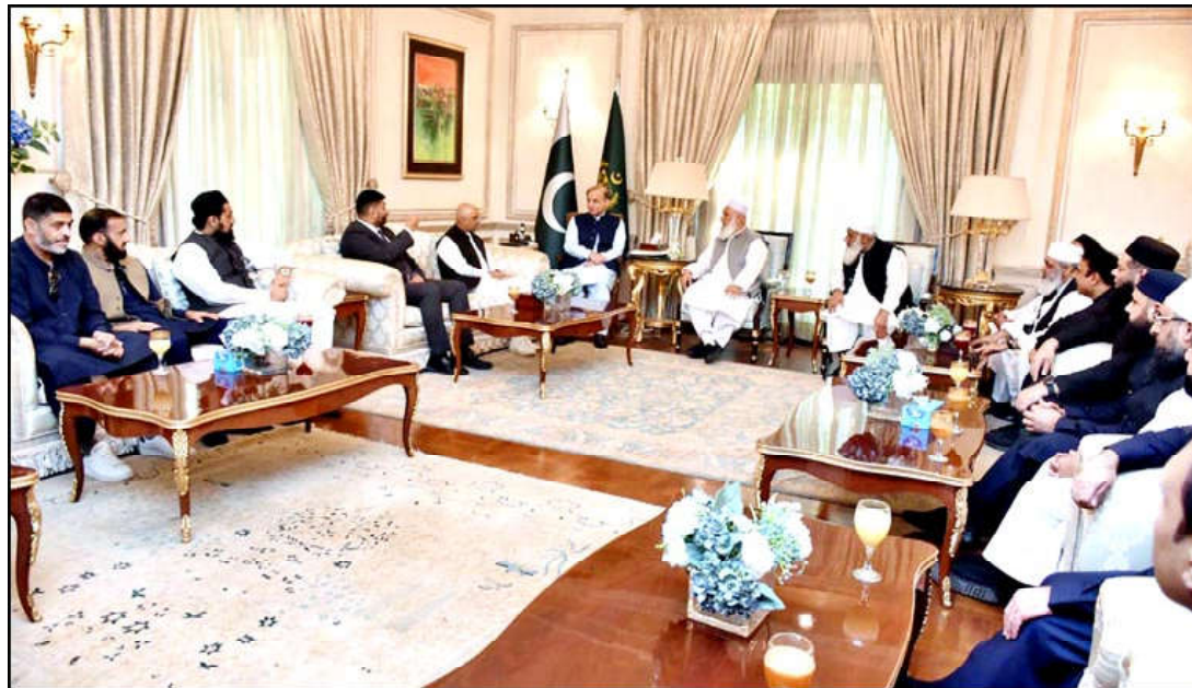
LAHORE: A delegation of leading businessmen of the United Kingdom calls on Prime Minister Muhammad Shehbaz Sharif.

LAHORE (APP): Prime Minister Muhammad Shehbaz Sharif has said that ensuring favourable environment for foreign investment in the country is top-most priority of the government. Talking to a business delegation from the United Kingdom (UK) during a meeting here on Sunday, he said immaculate services are being provided to the business and trader community through 'One Window Operations' under the Special Investment Facilitation Council (SIFC) in the country. The UK-based renowned business figure Zubair Isa led the business delegation during the meeting. Inviting the businesspeople to invest in Pakistan, the PM said country's economy had improved due to dedicated efforts of the government in the recent days, adding that the initiatives had increased confidence of the overseas investors to invest in various ventures in Pakistan. Ways to discover new vistas to enhance business-to-business ties between Pakistan and the UK were also discussed during the meeting. The delegation hailed the economic policies of Prime Minister Shehbaz Sharif, which had strengthened the economy and put the country on the path to sustainable development.