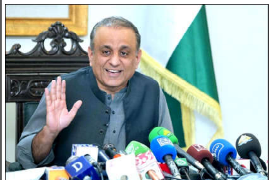
LAHORE: Federal Minister for Privatization Board of Investment & Communications Abdul Aleem Khan held media talk on PIA.

In a statement issued here, Nawaz Sharif said, "Maryam sought advice from me, asking if we should take over the PIA and make it a brand new airline." The PML-N president said that Maryam Nawaz suggested giving a 'brand new airline' to Pakistan named 'Air Punjab'.