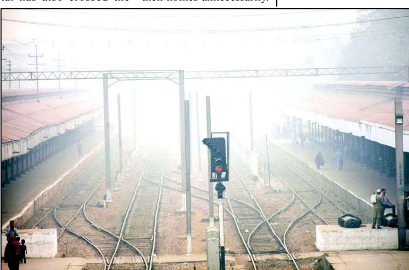
LAHORE: Citizens heading towards their destinations in the provincial capital in the early hours of the morning, during dense fog.

LAHORE (APP): Smog reigns in the city of gardens, Lahore is still number one among the most polluted cities in the world. Air pollution in Lahore soared on Sunday, with the Air Quality Index (AQI) briefly reaching an "unprecedented" level of over 1,000 despite the Punjab government intensified efforts and a "green lockdown" in the city. Data from a global air quality monitoring platform, AQI, showed air quality at 1,067 between 8am and 9am on Sunday. It was the highest in the world. The average level of smog in the provincial capital has also crossed the alarming level, making Lahore's mean air quality index 650. Apart from this, the smog has increased to an alarming level in Multan also, due to which citizens have common complaints of breathing problems and eye irritation. In terms of air pollution, the Indian city of Delhi is number two. The American space agency NASA has released an aerial image in which it can be seen that smog has intensified due to the burning of crop residues in Indian bordering regions. Medical experts have instructed citizens to wear masks and do not leave their homes unnecessarily.