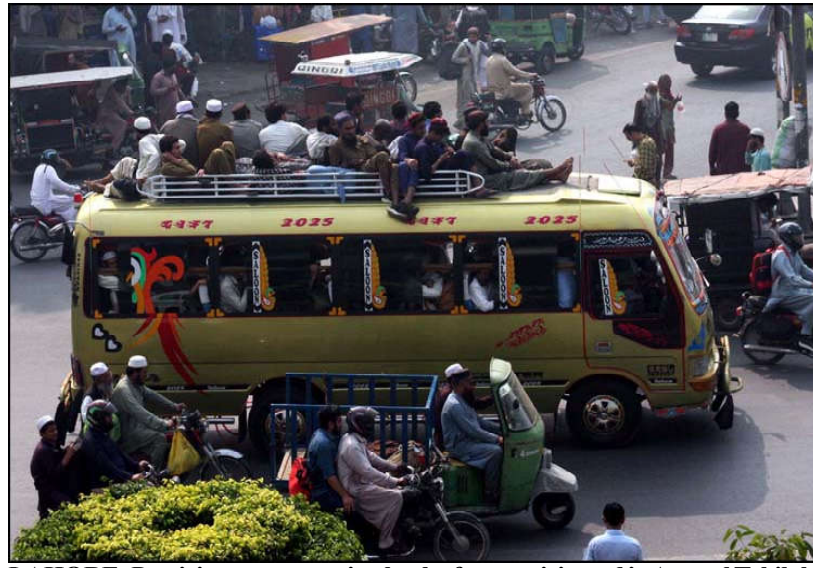
LAHORE: Participants are coming back after participated in Annual Tabilgh-i-Jtma 2024 in Raiwind, at Thokar Niaz Baig in Lahore.