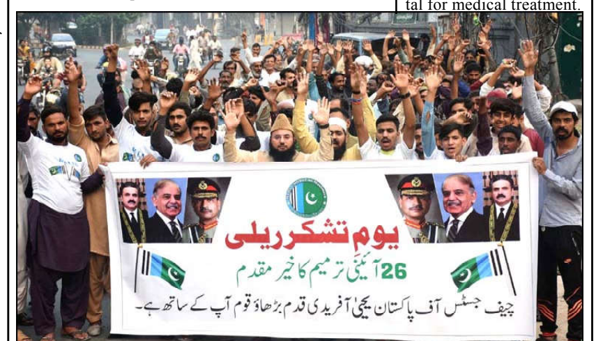
LAHORE: Members of Majlis-e-Ittehad-ul-Muslimeen are holding celebration demonstration on approval of the 26th constitutional amendment, at Lahore press club.

He welcomed the decision of the President of the Gujranwala Chamber of Commerce to take a trade delegation to Uzbekistan and assured the business delegation of GCCCI to get full cooperation in Uzbekistan, describing it as important for bilateral trade. He said that the business community of Pakistan can work in Uzbekistan in textile, Chemicals, IT, wood production and many potential sectors. Uzbekistan is geographically located in the centre of Central Asia and can play a vital role in connecting the 80 million population of Central Asia with Pakistan, he added.