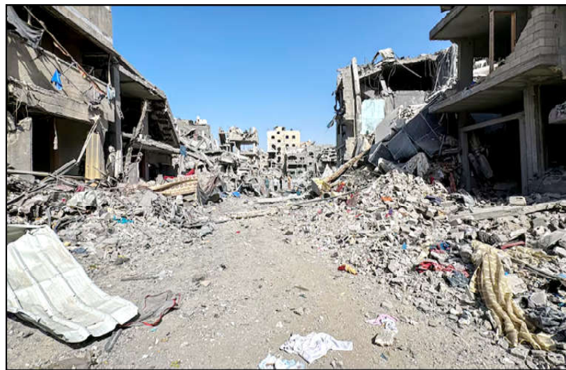
Palestinians view the damage after Israeli forces withdrew from the area around Kamal Adwan hospital, amid the ongoing Israel-Hamas conflict, in Jabalia, in the northern Gaza Strip.