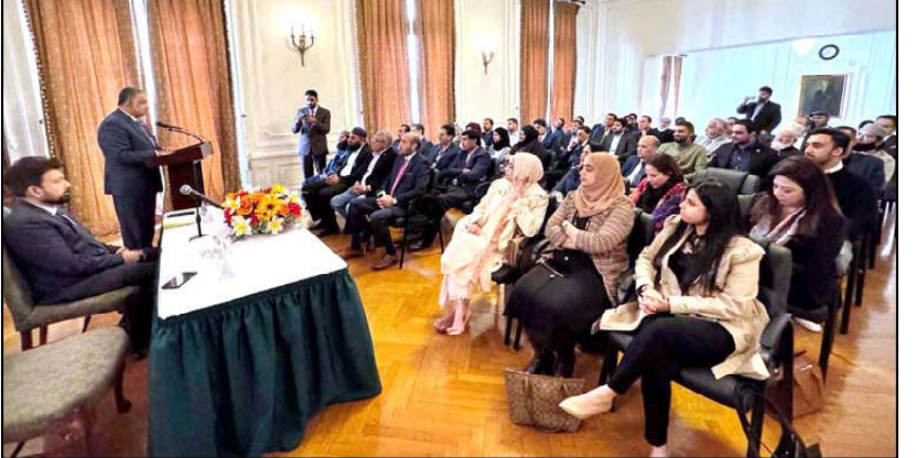
NEW YORK: Pakistan Ambassador to US Rizwan Saeed Sheikh addressing during community event held at the Consulate General of Pakistan.