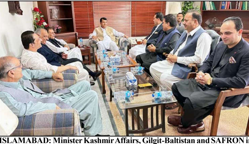
ISLAMABAD: Minister Kashmir Affairs, Gilgit-Baltistan and SAFRON in a meeting with PML-N leadership Azad Jammu Kashmir.

Federal Minister also revealed that Saudi Arabia has significantly expanded its investment portfolio in Pakistan, surpassing $2.8 billion, adding, additionally, Denmark and Russia have expressed keen interest in investing in the country.