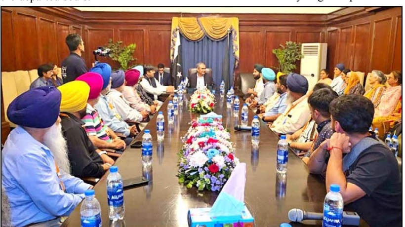
LAHORE: Interior Minister Mohsin Naqvi in a meeting with Sikh Yaatris delegation from USA at State Guest House.

The Chief Minister also pledged to foil every nation or religion. conspiracy against the He said that the ter-country and take revenge of rorists made nefarious at- every single drop of blood.