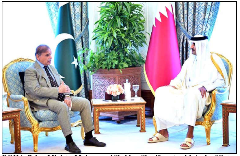
DOHA: Prime Minister Muhammad Shehbaz Sharif meets with Amir of Qatar His Highness Sheikh Tamim bin Hamad Al Thani.

Ph: 2841470/2841473 Vol: XIX No. 240, Rabi-us-Sani 28, 1446 AH Friday November 01, Pages 04, Price Rs. 15