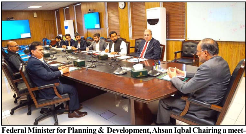
ing to review the progress of ongoing projects under the CPEC in Islamabad.

Their remarks also echoed a consensus that CPEC's extension to Afghanistan had to be a starting point towards achieving this objective.