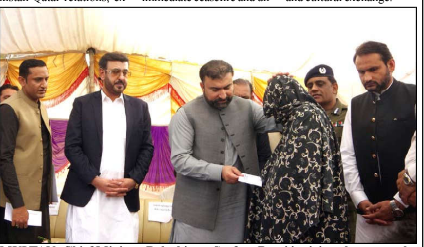
MULTAN: Chief Minister Balochistan Sarfraz Bugti is giving cheques to the family members of laborers killed in terrorist attack in Balochistan at Shuja Abad.

Abdulrahman Al-Thani wherein they discussed avenues to further strengthen bilateral relations, particularly focusing on enhancing cooperation in areas such as trade, investment, energy and cultural exchange.