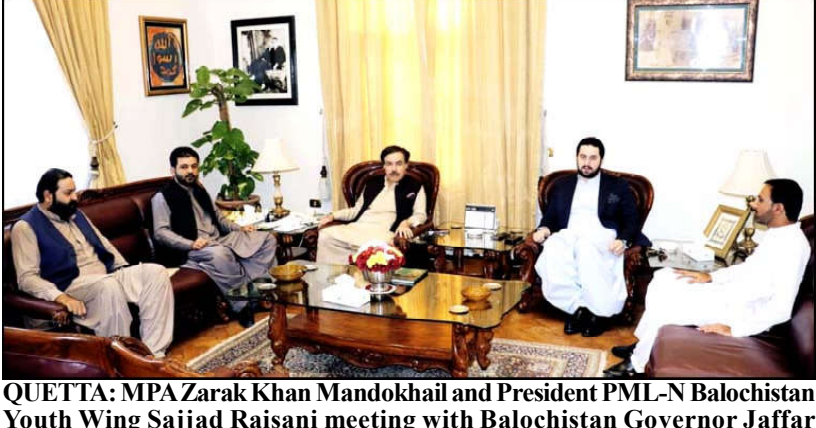
Youth Wing Sajjad Raisani meeting with Balochistan Governor Jaffar

They also appreciated the role of Governor in opening of the Taftan border for 45 days saying that he has won hearts of the