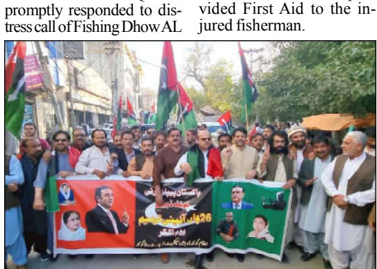
QUETTA: Leaders and activists of Peoples Party (PPP) are holding celebration demonstration on approval of the 26th constitutional amendment, held

swiftly responded and dispatched its medical and technical teams which provided First Aid to the in-