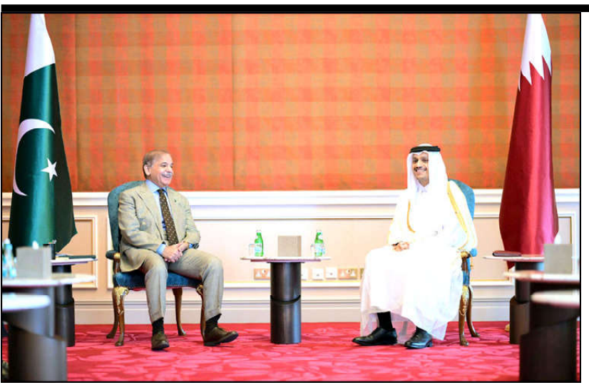
DOHA: Prime Minister Muhammad Shehbaz Sharif meets with the Prime Minister of Qatar H.E. Sheikh Mohammed bin Abdulrahman Al-Thani.