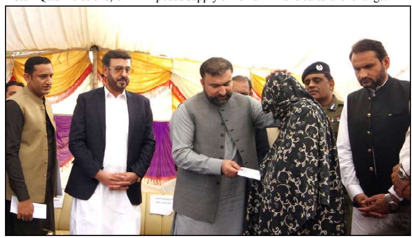
MULTAN: Chief Minister Balochistan Sarfraz Bugti is giving cheques to the family members of laborers killed in terrorist attack in Balochistan at Shuja Abad.

Meanwhile, Prime Minister Shehbaz Sharif on Thursday met his Qatari counterpart Mohammed Abdulrahman Al-Thani wherein they discussed avenues to further strengthen bilateral relations, particularly focusing on enhancing cooperation in areas such as trade, investment, energy,