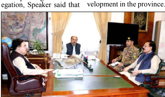
QUETTA: Joint Secretary Home Shabbir Khattak meeting with Balochistan Governor Jaffar Khan

The members of delegation discussed with the Speaker the ways and means for bringing improvement in the education sector. The Speaker of Provincial Assembly assured his cooperation to the teachers for educational de-