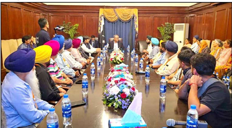
LAHORE: Interior Minister Mohsin Naqvi in a meeting with Sikh Yaatris delegation from USA at State Guest House.

Balochistan. The Chief Minister also pledged to foil every any nation or religion. He said that the terrorists made nefarious at-