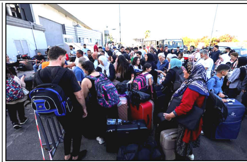
Turkish nationals wait to register for boarding Turkish navy ships to leave Lebanon, amid the ongoing hostilities between Hezbollah and Israeli forces, in Beirut, Lebanon.