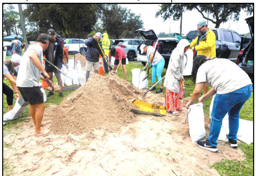
People fill bags with sand at a park in Stuart, Florida, in preparation for Hurricane Milton.