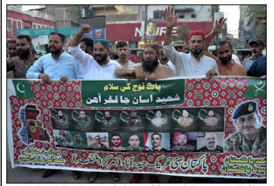
HYDERABAD: Activists of Sunni Tehreek (PST) are holding rally in favor of Pakistan Armed Forces, in Hyderabad.

Commitment of our government to local government elections is a significant step towards promoting decentralization, empowerment, and democratic governance in Gilgit-Baltistan, he added.