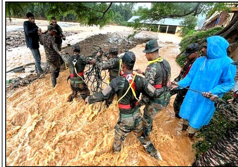
Indian soldiers help people cross a stream in Wayanad, India, using a rope.

"The key is in managing it well." Spain will work on making it easier for migrants to come with a series of initiatives, including recognising academic qualifications for temporary workers, simplifying contracts as part of a new labour migration programme, and reducing red tape for residency applications, Sanchez said.