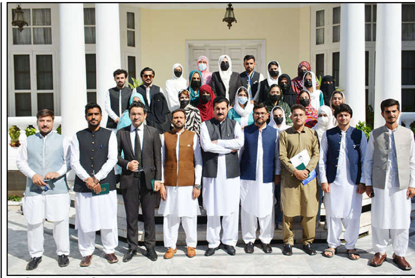
PESHAWAR: Governor Khyber Pakhtunkhwa Faisal Karim Kundi in a group photo with Young Leaders Parliament delegation at Governor House.

During the operation, a dumper truck with registration number 2158, coming from the Munda area was stopped and searched.