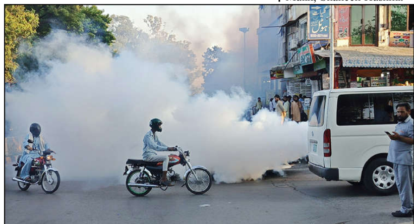
ISLAMABAD: A view of anti dengue spray initiative by the Health Department at Aabpara as a response to the rise in dengue cases in the twin Cities.