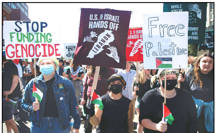
DENVER: Pro-Palestinian demonstrators march on the first anniversary of the Israeli invasion of Gaza.