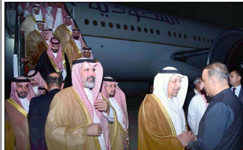
ISLAMABAD: Investment Minister of KSA, Sh. Khalid Bin Abdul Aziz Alfaleh welcomed by Federal Minister for Board of Investment, Privatization and Communications Abdul Aleem Khan.

During interaction with the bereaved family members, the prime minister conveyed his condolence and offered Fateha for the martyred soul and strength for the family members to bear the loss.