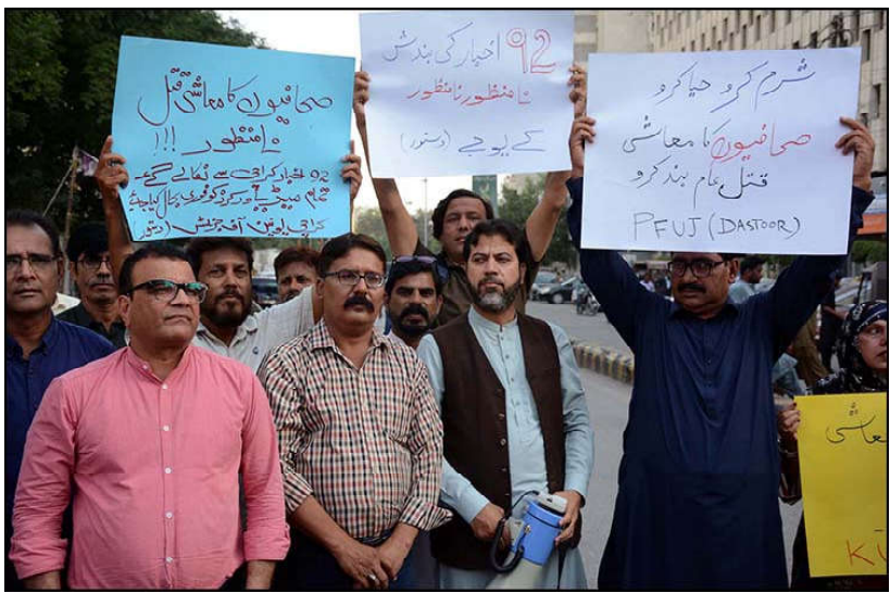
KARACHI: Members of Karachi Union of Journalists (KUJ) and Pakistan Association of Press Photographers (PAPP) are holding protest demonstration against forced dismissal of journalists from private news channel, held at Karachi press club.

One militant was killed in a terrorist incident that occurred in Swabi during the last nine months.