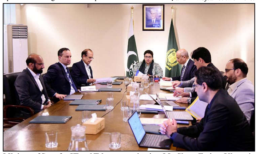
Minister of State for IT and Telecommunication, Ms. Shaza Fatima Khawaja chairing 61st meeting of Board of Directors of Pakistan Software Export Board (PSEB) in Islamabad

Similarly, on a year-on-year basis, the worker's remittance went up by 29.03 per cent in September 2024 to $2.849 billion from $ 2.208 billion during the same month last year.