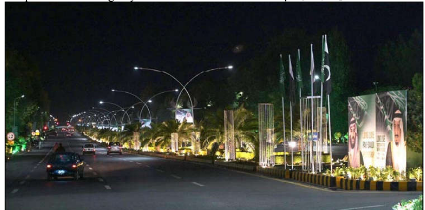
ISLAMABAD: The Federal Capital decorated with flowers and fancy lights to present a welcoming to international guests and delegates as it gears up for the Shanghai Cooperation Organization (SCO) Summit 2024.

ISLAMABAD (APP): The Wafaqi Mohtasib, Ejaz Ahmad Qureshi on Wednesday intervened to resolve the long-standing issue of affixing of e-protector stamp on the passports of Pakistanis intending to proceed abroad for employment or higher education. As a result, the Bureau of Immigration has now started online e-protector stamp facility also, which is available at the airports too. It may be informed that it is obligatory for all those traveling to middle eastern or other countries for employment to get the protector stamps affixed on their passports otherwise they have not been granted permission to travel abroad and many had to return from the airports due to its non-availability. This resulted in not only the loss of foreign employment but also the money spent on buying the tickets. On the directions of the Wafaqi Mohtasib online e-protector stamp facility is now available at all international airports of the country on 24/7 basis so that a protector stamp may be affixed on the passports of anyone desirous of going abroad.