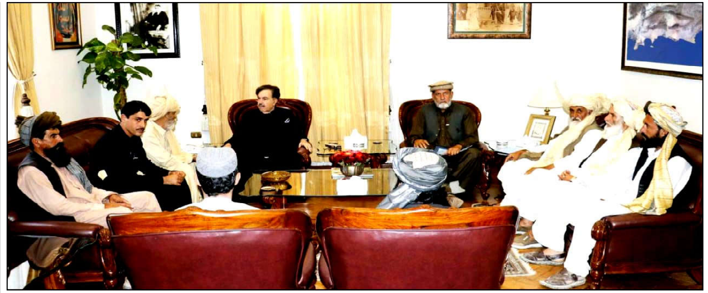
QUETTA: Different delegations meeting with Governor Balochistan Sheikh Jaffar Khan Mandokhail