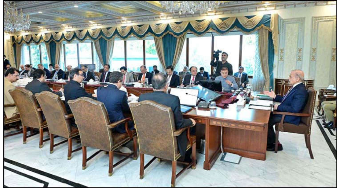
ISLAMABAD: Prime Minister Muhammad Shehbaz Sharif chairs a meeting of Cabinet Committee on Energy.