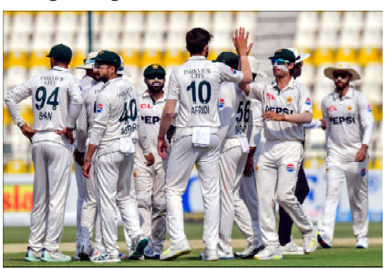
MULTAN: Players are in action during the third day of 1st Test Match between Pakistan and England, held at Multan Cricket Stadium