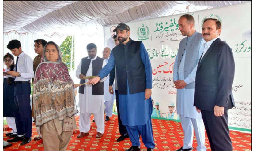
ISLAMABAD: Chaudhry Salik Hussain, Federal Minister for Overseas Pakistanis and Human Resource Development distributing cheques during a cheque distribution ceremony to disburse marriage and death grants to industrial workers.