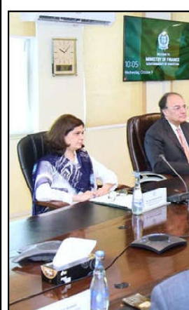
ISLAMABAD: Federal Minister for Finance & Revenue, Senator Muhammad Aurangzeb in a meeting with a high level delegation from the Asian Development Bank at the Finance Division.

During interaction with the bereaved family members, the prime minister conveyed his condolence and offered Fateha for the martyred soul and strength for the family members to bear the loss.