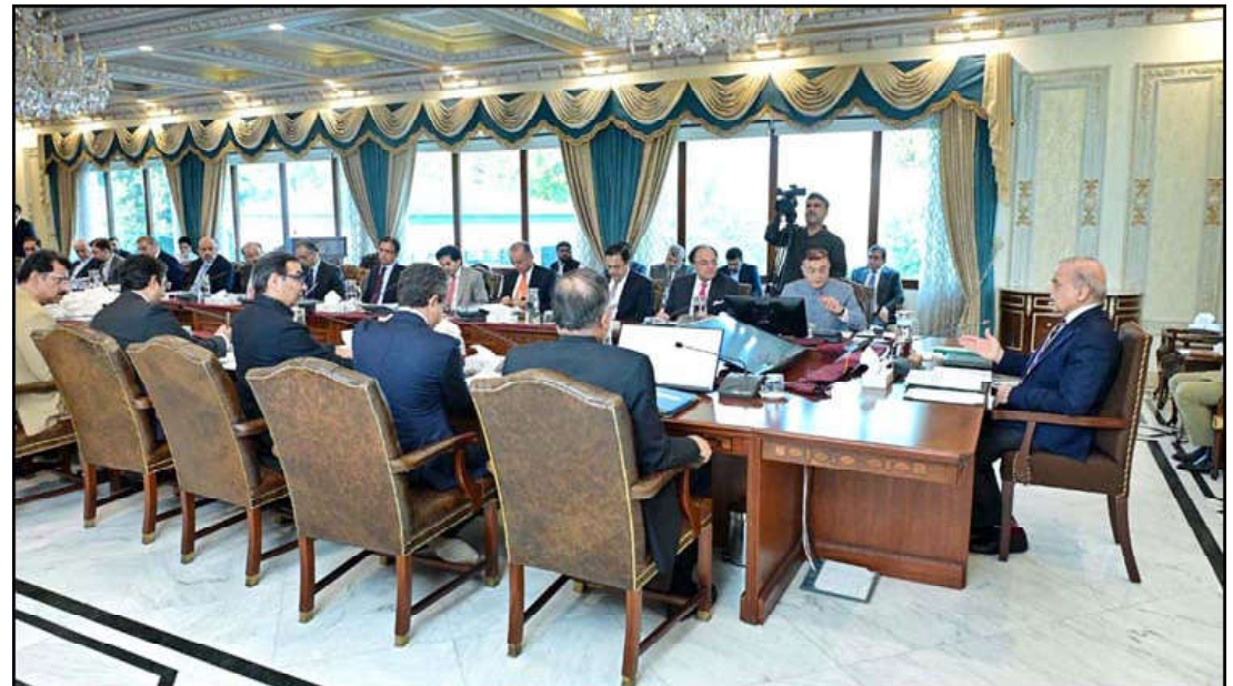
ISLAMABAD: Prime Minister Muhammad Shehbaz Sharif chairs a meeting of Cabinet Committee on Energy.

He added that after the ban on PTM, the Khyber Pakhtunkhwa government had placed 54 individuals and the Balochistan government had placed 34 individuals on the Fourth Schedule.