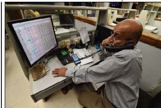
KARACHI: A Pakistani stockbroker monitors share prices during a trading session at the Pakistan Stock Exchange (PSX) in Karachi.