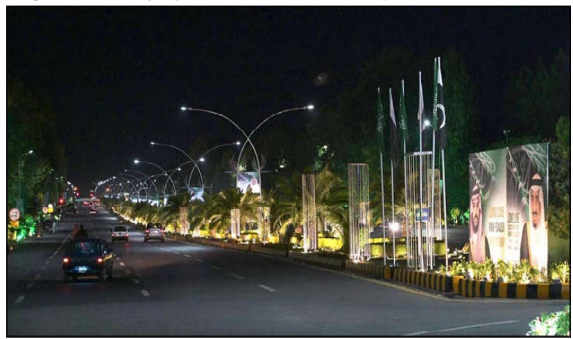
ISLAMABAD: The Federal Capital decorated with flowers and fancy lights to present a welcoming to international guests and delegates as it gears up for the Shanghai Cooperation Organization (SCO) Summit 2024.

system. Prof. Ahsan Iqbal Federal Minister for Planning Development & Special Initiatives inaugurated the conference. He stated that the diaspora of any country is key to its success and development. "It is inspiring to see the Pakistani diaspora. Manhattan Strategy Group (MSG), organized such a valuable event focused on education," he added. He said that we are in the era of artificial intelligence and technology.