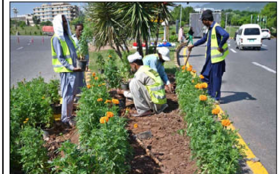
ISLAMABAD: CDA gardeners shape marigold flowers on the greenbelt of Constitution Avenue ahead of the 23rd Shanghai Cooperation Organization (SCO) summit in the Federal Capital.