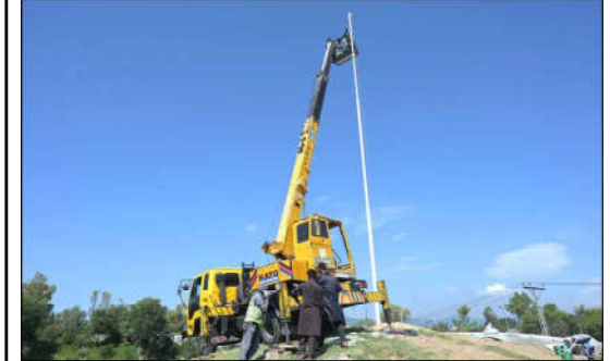
ISLAMABAD: CDA workers painting the poles of the highest national flag for preparation ahead of the 23rd Shanghai Cooperation Organization (SCO) summit at Zero Point in the Federal Capital.