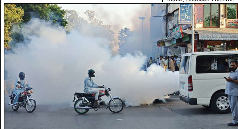
ISLAMABAD: A view of anti dengue spray initiative by the Health Department at Aabpara as a response to the rise in dengue cases in the twin Cities.