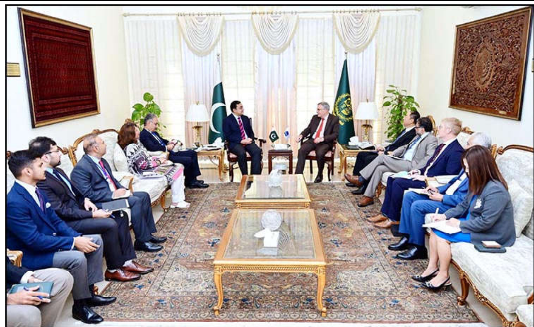
ISLAMABAD: Federal Minister for Economic Affairs, Ahsan Iqbal in meeting with the delegation of Asian Development Bank.

He warned that without intervention, the high taxation and electricity costs would continue to drive farmers away from cotton, despite its billion-dollar export potential.