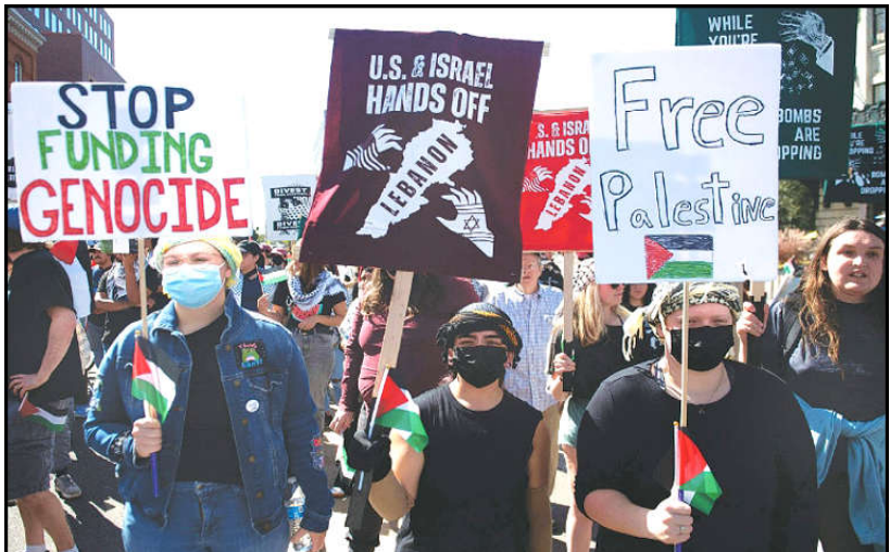
DENVER: Pro-Palestinian demonstrators march on the first anniversary of the Israeli invasion of Gaza.

Kyiv is still awaiting word from its Western partners on its repeated requests to use the long-range weapons they provide to hit targets on Russian soil.