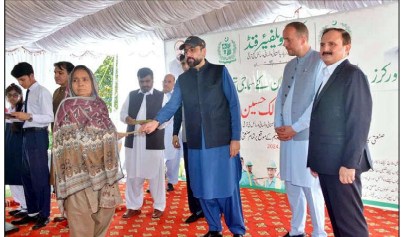
ISLAMABAD: Chaudhry Salik Hussain, Federal Minister for Overseas Pakistanis and Human Resource Development distributing cheques during a cheque distribution ceremony to disburse marriage and death grants to industrial workers.

protector stamps affixed on their passports otherwise they have not been granted permission to travel abroad and many had to return from the airports due to its non-availability. This resulted in not only the loss of foreign employment but also the money spent on buying the tickets. On the directions of the Wafaqi Mohtasib online e-protector stamp facility is now available at all international airports of the country on 24/7 basis so that a protector stamp may be affixed on the passports of anyone desirous of going abroad.