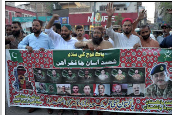
HYDERABAD: Activists of Sunni Tehreek (PST) are holding rally in favor of Pakistan Armed Forces, in Hyderabad.

He vowed to take strict action against the Islamabad police and administration if any torture against them was proven. As the chief minister of Khyber Pakhtunkhwa, he stated that the necessary security personnel and equipment would accompany him wherever he goes.