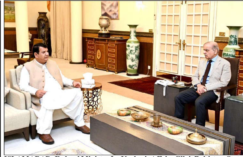
ISLAMABAD: Federal Minister for Kashmir Affairs Gilgit Baltistan, States and Frontier Regions, Engineer Amir Maqam calls on Prime Minister Muhammad Shehbaz Sharif.

would be reformed as per international level. Under another program, he said that campus of a university would be established in each district to facilitate the poor and needy students especially the girls at their door step. He urged that our UETs should be a brand in the world like Indian IETs, adding, this government is on path of reformation under leadership of Shabbaz Sharif. He hoped that our future generations would see a developed and prosperous Pakistan. Pakistan would be among top 15 economic countries through stability, consistency in policies, unity, reforms, continuity of democracy. He stated that the diaspora of any country is key to its success and development. "It is inspiring to see the Pakistani diaspora. Manhattan Strategy Group (MSG), organized such a valuable event focused on education," he added.