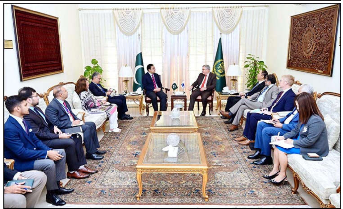
ISLAMABAD: Federal Minister for Economic Affairs, Ahsan Iqbal in meeting with the delegation of Asian Development Bank.

He warned that without intervention, the high taxation and electricity costs would continue to drive farmers away from cotton, despite its billion-dollar export potential.