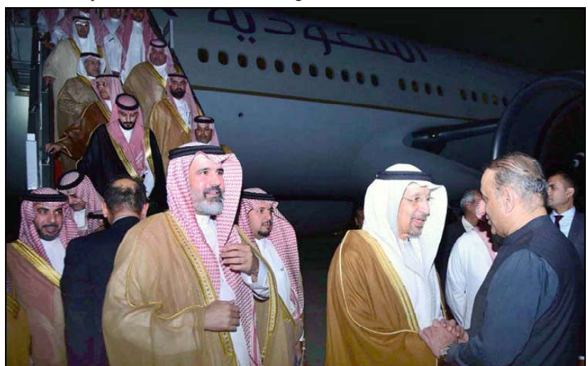
ISLAMABAD: Investment Minister of KSA, Sh. Khalid Bin Abdul Aziz Alfalsh welcomed by Federal Minister for Board of Investment, Privatization and Communications Abdul Aleem Khan.

according to a PM Office press release. The ISMO is aimed at gradually doing away with the government's role as a sole buyer of electricity and turning the electricity market into a multiplayer independent, transparent, and competitive market. It will also allow the power consumers to purchase electricity from suppliers other than power distribution companies. Under the ISMO, long-term planning would be made to produce low-cost electricity and its transmission besides reducing the power prices and circular debt. The ISMO Board will comprise the experts from the power sector.