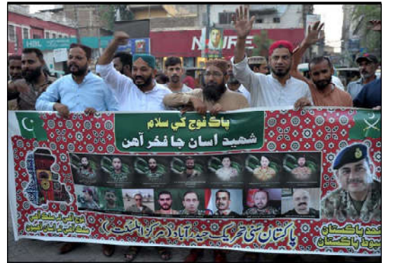
HYDERABAD: Activists of Sunni Tehreek (PST) are holding rally in favor of Pakistan Armed Forces, in Hyderabad.

He described the incidents during the PTI protests and at the KP House in Islamabad as intolerable. Deplored the police raids and damages of property at the KP House, the CM alleged that police officers and Rescue 1122 officials, along with rescue equipment, were unlawfully detained. He vowed to take strict action against the Islamabad police and administration if any torture against them was proven. As the chief minister of Khyber Pakhtunkhwa, he stated that the necessary security personnel and equipment would accompany him wherever he goes.