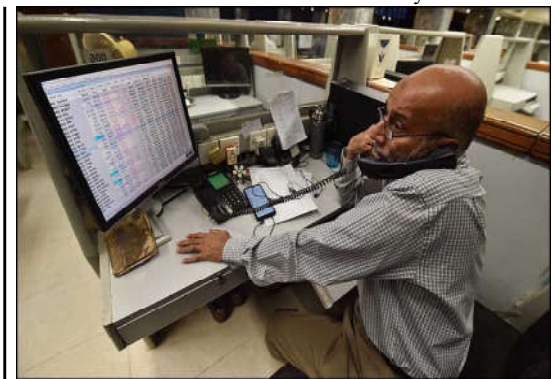
KARACHI: A Pakistani stockbroker monitors share prices during a trading session at the Pakistan Stock Exchange (PSX) in Karachi.