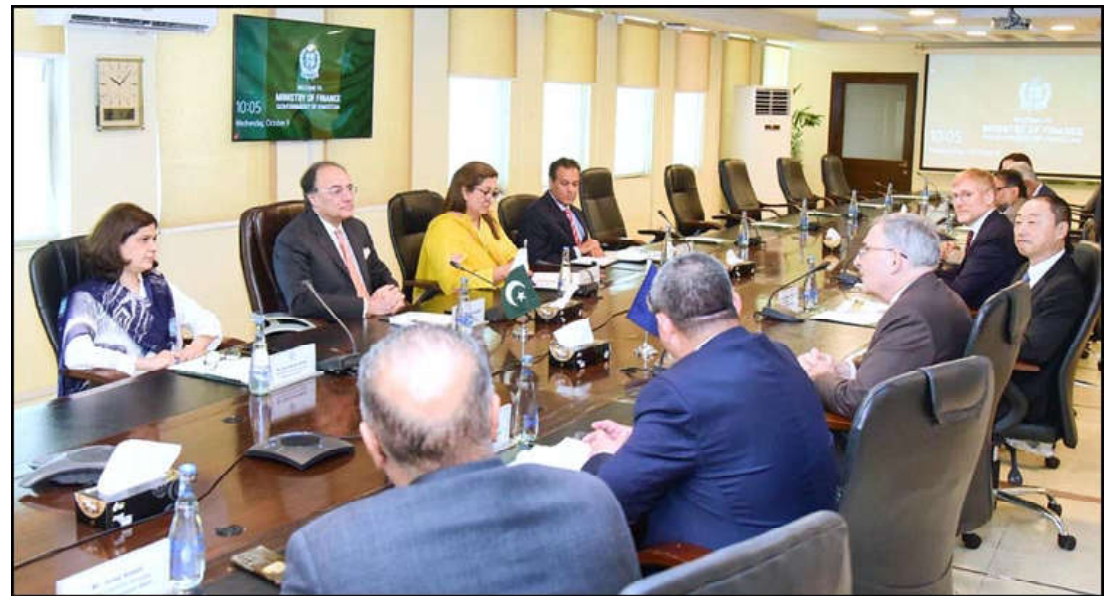
ISLAMABAD: Federal Minister for Finance & Revenue, Senator Muhammad Aurangzeb in a meeting with a high level delegation from the Asian Development Bank at the Finance Division.

development, we need 90 percent literacy rate in the country. He lamented that with such a huge numbers of out of school children, Pakistan can not progress. He termed education as mandatory tool to run the infrastructure of a country. The minister said that federal government is also establishing South Asia's top teachers training center in Pakistan to fulfill the need of best teaching practices. "We have to revise our curriculum as per international standards and in order to teach modern curriculum, we are working on teachers training on war-