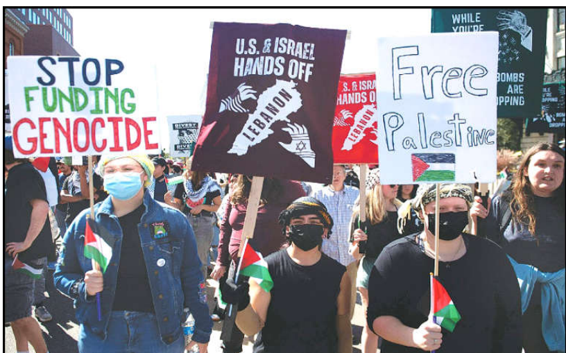
DENVER: Pro-Palestinian demonstrators march on the first anniversary of the Israeli invasion of Gaza.

Russian-installed authorities in the city of Feodosia on the coast of the Black Sea reported a fire at the terminal on Monday morning but did not say what might have caused it. Ukraine has increasingly targeted rear areas that are essential for Russia's onslaught, now deep into its third year. It has developed long-range drones that have hit oil depots and refineries as well as armories. Ukraine's aim is to impair Russia's ability to support its front-line units, especially in the eastern Donetsk region where the main Russian battlefield effort is stretching weary Ukrainian forces. Kyiv is still awaiting word from its Western partners on its repeated requests to use the long-range weapons they provide to hit targets on Russian soil.