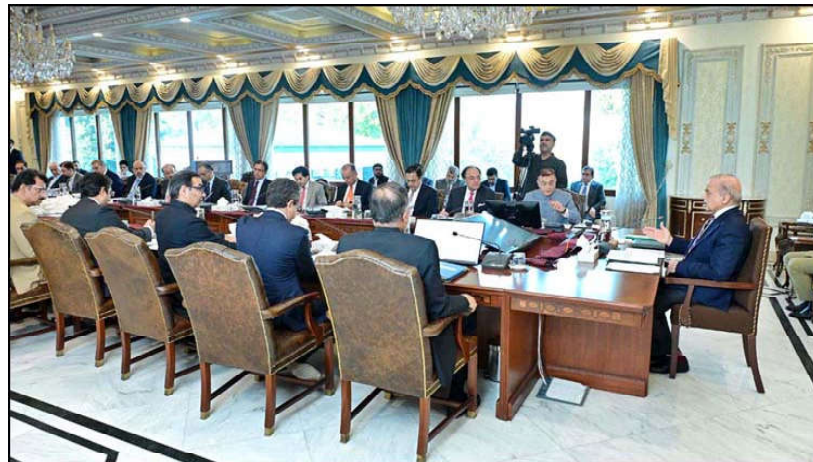
ISLAMABAD: Prime Minister Muhammad Shehbaz Sharif chairs a meeting of Cabinet Committee on Energy.

through ethnic discrimination. While discussing political issues and people's rights is permitted, no one will be allowed to incite people against the institutions. Naqvi mentioned that it has come to their attention that individuals from one or two political parties, when meeting with PTM leaders, supported them on the issue of rights but also emphasized that rights cannot be discussed while simultaneously taking up arms. He added that after the ban on PTM, the Khyber Pakhtunkhwa government had placed 54 individuals and the Balochistan government had placed 34 individuals on the Fourth Schedule.