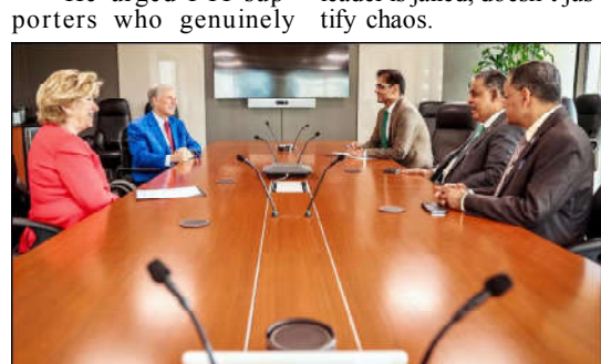
NEW YORK: Pakistan's Ambassador in USA Rizwan Saeed Sheikh meeting with Governor of Texas Greg Abbott.

want change and development to recognize the harm caused by their party's actions. The PTI's dharnas (protest) back in 2014 delayed the Chinese President's visit to Pakistan, and their efforts to derail the China-Pakistan Economic Corridor (CPEC) project have been detrimental to the country's progress. In 2018, CPEC was the primary target and serious allegations were made to discourage Chinese investors and divert them to other countries. Now that Pakistan has committed to CPEC Phase II with renewed enthusiasm, the PTI is attempting to undermine government's economic recovery efforts. It's crucial to acknowledge the damage caused by these actions and consider the consequences of supporting policies that hinder Pakistan's growth and development, he urged. The minister said, Pakistan cannot afford to indulge in destructive politics. Just because PTI's leader is jailed, doesn't justify chaos.