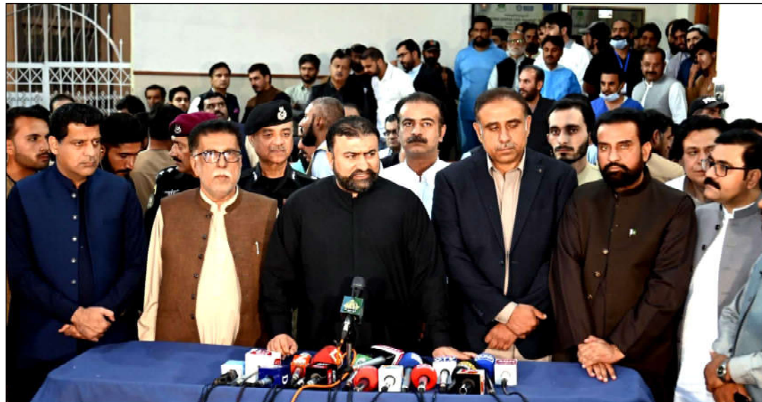
QUETTA: Chief Minister Balochistan Mir Sarfraz Bugti talking with mediapersons after visiting Trauma Center. Provincial Ministers are also present

Visit of US Navy Ship to Pakistan is a manifestation of deep rooted bilateral ties between both navies in general and nations in particular.