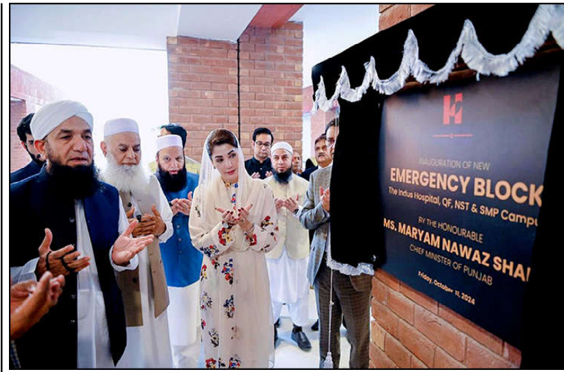
LAHORE: Punjab Chief Minister Maryam Nawaz Sharif offering Dua after inaugurating new emergency block of Indus Hospital Jubilee Town.