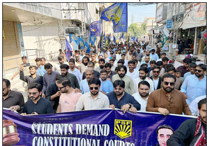
LARKANA: Leaders and members of Sindh Peoples Student Federation (SPSF) are holding protest demonstration for demanding constitutional courts, held in Larkana.