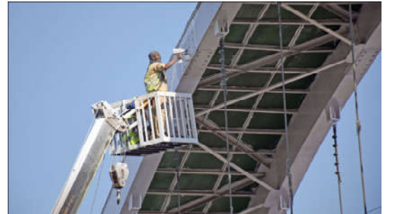
ISLAMABAD: CDA staff busy in the maintenance work of an overhead bridge.