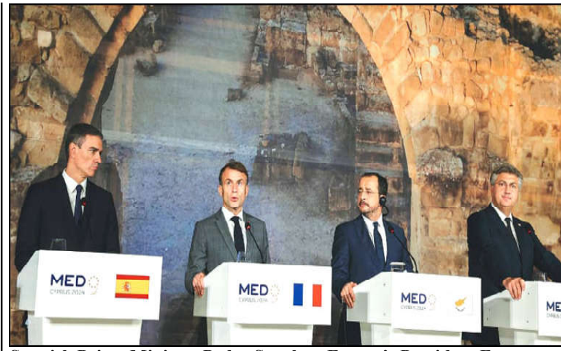
Spanish Prime Minister Pedro Sanchez, France's President Emmanuel Macron, Cypriot President Nikos Christodoulides, and Croatia's President Zoran Milanovic hold a press conference after a summit of Mediterranean countries at Paphos, Cyprus.

"The international community now need to collectively engage with Israel and put pressure on Israel to desist from this activity, to stop it, and to ensure that UN peacekeepers are not put in harm's way," he said.