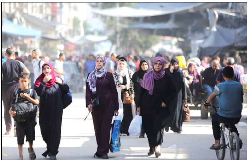
Displaced Palestinians make their way as they flee areas in the northern Gaza Strip, following an Israeli evacuation order, amid the Israel-Hamas conflict, in Gaza City.