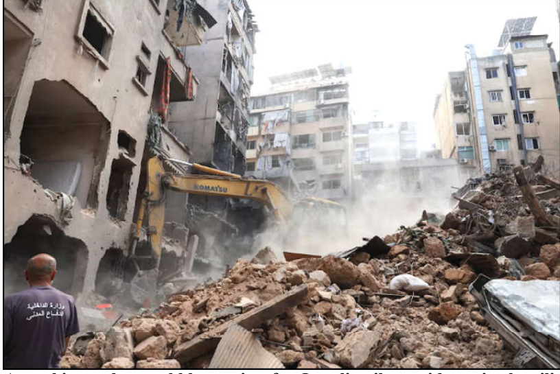
A machinery clears rubble at a site of an Israeli strike, amid ongoing hostilities between Hezbollah and Israeli forces, in Beirut, Lebanon.

In response to such threats, Taiwan has ordered billions of dollars in fighter jets, tanks, missiles and various upgrades to existing gear from the U.S., while revitalizing its own defense industry with the production of submarines and other equipment aimed at deterring or fending off a Chinese attack.