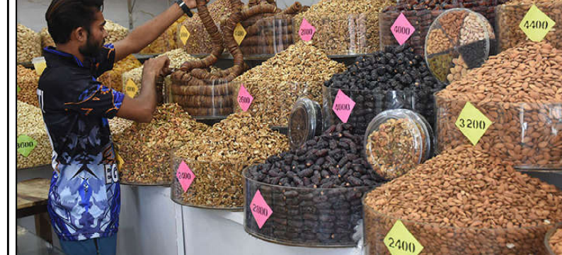
LAHORE: A shopkeeper decorating dry fruits as the weather changes in the Provincial Capital.

project. The steering committee will shortlist locations for the garment villages. Sohail Shaukat Butt told APP that model garment villages will be built on the pattern of handicraft centers of Social Welfare Department. The steering committee will take steps to supply necessary equipment to the model garment villages, he said. Human resource training for the model garment villages project will be ensured and a joint venture with Toyota will help play a role in making it a success. The Social Welfare Department will provide all logistical support to the steering committee, the minister added.