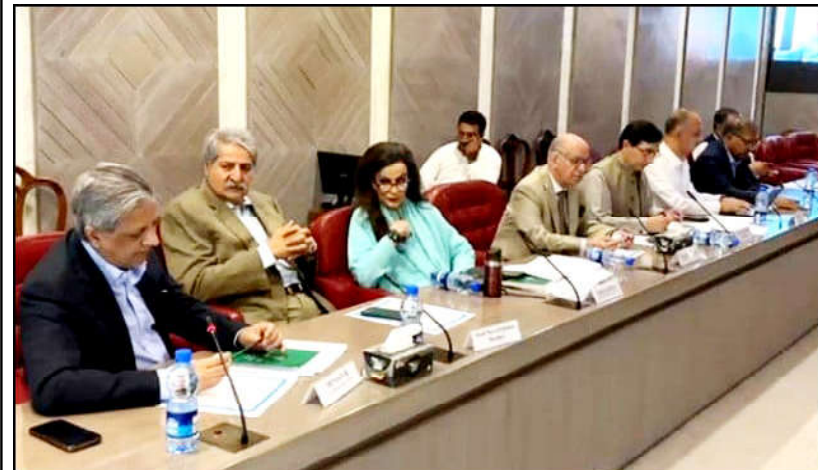
A view of Special Parliamentary Committee meeting held in Islamabad

Quaid-e-Azam said any question which relates to federal constitution or it arises from constitution should go to the federal court, he added.