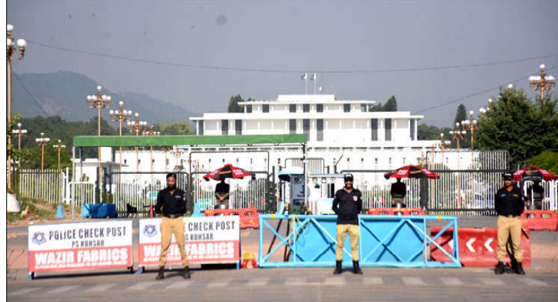
ISLAMABAD: Security of the Federal Capital beefed up for upcoming SCO Summit.