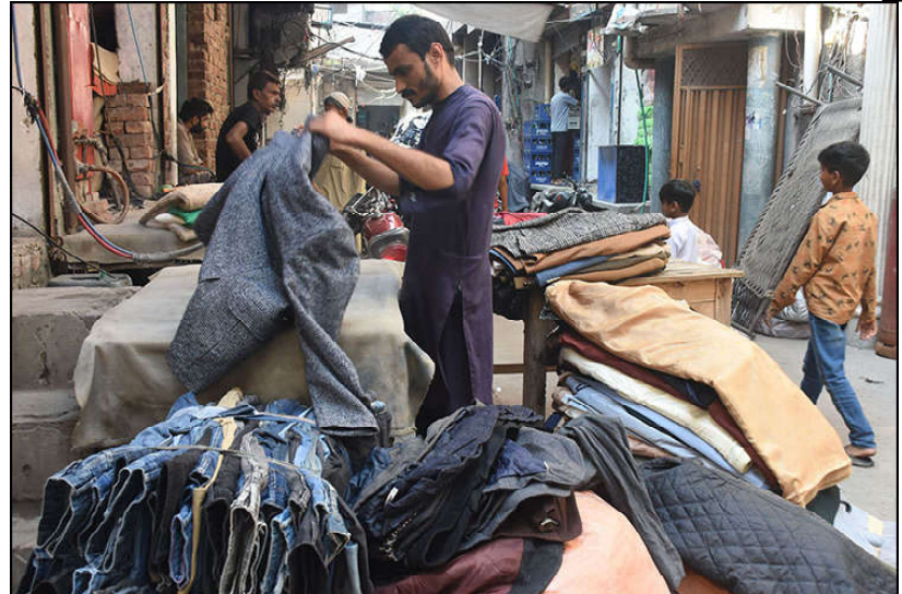
LAHORE: A shopkeeper iron second-hand coats and paints at a Landa Bazaar in the Provincial Capital.