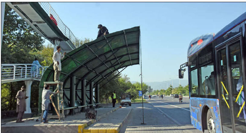
ISLAMABAD: CDA workers repairing a bus stop at Islamabad Expressway in the Federal Capital.