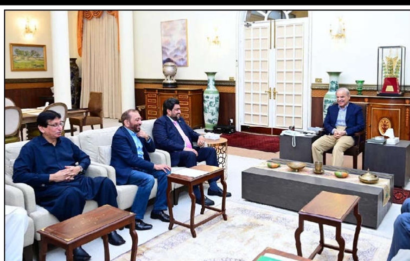
Governor Sindh Kamran Khan Tessori and a delegation of MQM called on Prime Minister Muhammad Shehbaz Sharif in Islamabad.

ISLAMABAD (INP): Former leader of the Pakistan Tehreek-e-Insaf (PTI), Asad Umar, discussed the internal challenges faced by the party, particularly during the leadership of Usman Buzdar. In an interview with Private TV Channel, Umar revealed that the presence of key figures like Jahangir Tareen and Aleem Khan had a significant impact on the party's dynamics, noting that Buzdar often felt threatened by their influence. Umar highlighted the broader context of party pressures, mentioning that many leaders were sidelined by the establishment when tensions escalated. Reflecting on his experience following his release from Adiala Jail, Umar emphasized that Imran Khan remains the party's core vote bank and stressed the importance of a well-thought-out strategy for PTI's future. Addressing the issue of constitutional amendments, Umar stated that building consensus is a lengthy process and cautioned against making hasty,