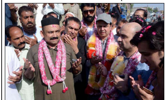
FAISALABAD: Senator/PMLN Central Leader Talal Chaudhary is offering Duaa after inaugurating the repair and renovation of Jaranwala-Faisalabad Road which would be completed with an estimated cost of Rs.2 billion.

He said that the Chief Minister government has taken historic initiatives like "Apni Chhat Apna Ghar" and "Himmat Card" in a short span.