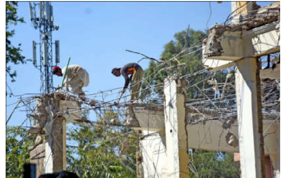
ISLAMABAD: Laborers are busy in dismantling a building at Sitara Market in the Federal Capital.