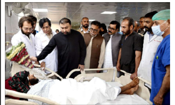
QUETTA: Chief Minister Balochistan Mir Sarfraz Bugti enquiring about health of an injured labourer at Trauma Center. Provincial Ministers are also present

Addressing a press conference at his residence in Sialkot Cantt, he said when the heads of 16, 17 countries of the Shanghai Cooperation Organization (SCO) are coming to Pakistan, the PTI founder has given a call for protest, however, he warned that the country's interests will be protected at any cost.