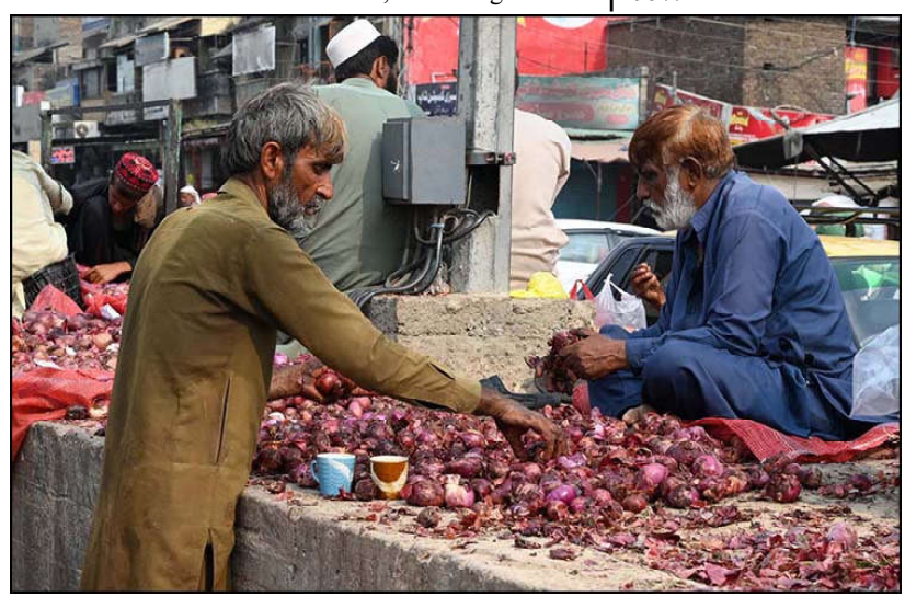
ISLAMABAD: A gypsy person is scavenging and gathering onions from a pile of discarded onions left behind by vendors at the Fruit and Vegetables Market.

With over 5,000 expected guests and 500 speakers, the conference will cover a wide range of topics, including economic stability, equitable development, climate change, artificial intelligence (AI).