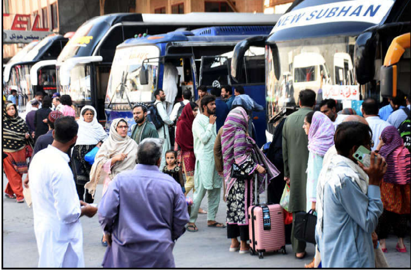
ISLAMABAD: Passengers leaving for their homes from Bus Stands after the government announced holidays on Shanghai Cooperation Organization (SCO) Summit in the Federal Capital.

ISLAMABAD (APP): UNICEF has appointed renowned actor Saba Qamar as its first National Ambassador for child rights in Pakistan. The announcement was made on International Day of the Girl Child, a day that recognizes girls' rights and the unique challenges girls face around the world. "It's an honor to join UNICEF. I will echo our shared mission of achieving every right for every child wherever I am," said Ms. Saba Qamar. "In my recent travels, I have seen both the challenges children and women face in this country and the difference UNICEF's dedicated efforts are making. I promise to play my part for the children and young people of Pakistan so that they can dream and have the chance to fulfill their dreams," added Qamar. In her role as UNICEF Pakistan's National Ambassador, the star of Kamli and Hindi Medium will use her international platform to help raise awareness of children's rights and issues affecting young people, such as child marriage, mental health, lack of education, gender equality, climate change and the impact of violence, exploitation and child poverty. Child marriage is one of the biggest impediments to girls realizing their rights in Pakistan. The country is home to 19 million child brides, the sixth highest globally. More than half of adolescent girls are pregnant before their 18th birthday which can be life-threatening for the mother and the child.