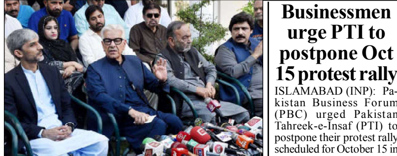
SIALKOT: Defence Minister Khawaja Muhammad Asif talking to media persons at his residence.

but we can also polish the creative talent of all students of the university through such activities. He said that there's no dearth of talent in our women but lack of necessary facilities and opportunities create hurdles in their way. The Governor urged the university administration to keep on such activities in future as well. He also exhorted the students to take wholehearted part in these activities. Later, the Governor visited the exhibition and inspected the art pieces displayed there. He also announced prizes for the outstanding artists.