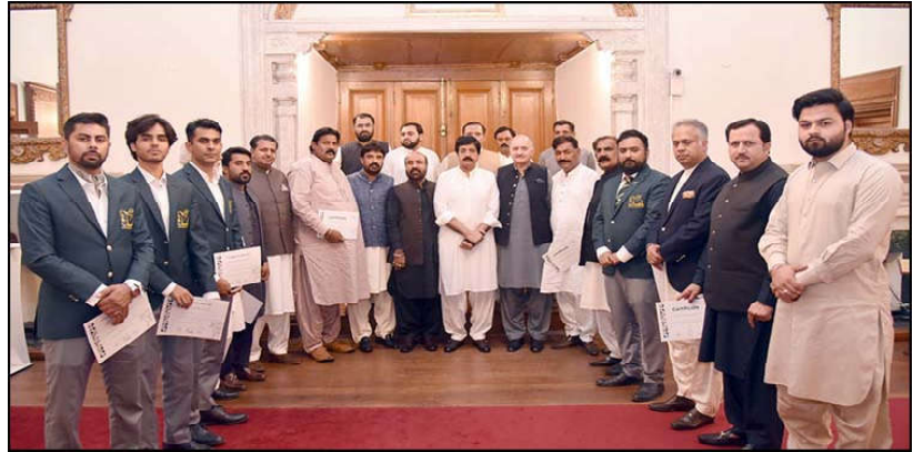
LAHORE: The participants of the training course organized for National Javelin Judges of Pakistan Horse and Mounted Archery Federation in a group photo with Governor Punjab Sardar Saleem Haider Khan at Governor House.