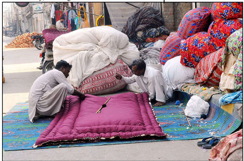
MULTAN: Workers are busy stitching quilts at their workplace as demand increases in the winter season.

KHANEWAL (APP): In line with the directions of the Punjab government, the district administration has initiated pre-measures to achieve the wheat cultivation target for the upcoming season. The Agriculture Extension Department has been tasked with cultivating wheat on 504,000 acres across the district. A district-level wheat committee meeting was chaired by Deputy Commissioner Bukhari directed the Agriculture department to achieve the set cultivation target. meeting was attended by ADCG Ghulam Mustafa, officials from the Agriculture Extension and Irrigation departments, fertilizer dealers, and representatives of the farming community. Discussions focused on the steps necessary to meet the cultivation target, as well as the availability of quality wheat seeds and fertilizers.