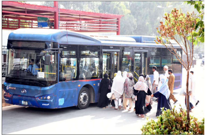
ISLAMABAD: Metro Bus Service resumed in the twin cities.