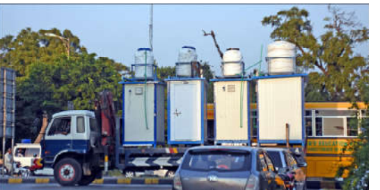
ISLAMABAD: A trawler shifting the ready-made bathrooms in the federal capital.

He also mentioned that the founder of PTI is expected to oppose the constitutional amendment. Additionally, the PML-N leader pointed out that the PTI founder has never spoken out against Israel, and that PTI had not taken part in the All Parties Conference (APC) organized in support of Palestine. He added that the founder of Pakistan Tehreek-e-Insaf (PTI) is aware that the end of anarchy will mark the end of his political career.