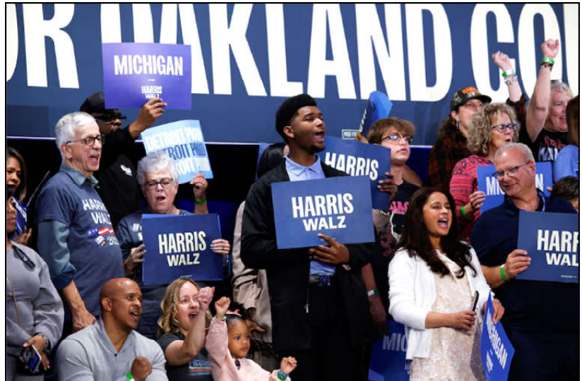
Supporters hold signs during a campaign event by Democratic presidential nominee U.S. Vice President Kamala Harris in Waterford township, in Oakland County, Michigan, U.S.

Monitoring Desk MANILA: Philippine vice-president Sara Duterte accused President Ferdinand Marcos Jr of incompetence and a lack of leadership in a scathing attack on Friday that showed the deepening rift between the two powerful families ahead of mid-term elections. Duterte, the daughter of Marcos' predecessor, resigned from cabinet in June, signalling the collapse of a formidable political alliance that helped her and Marcos.