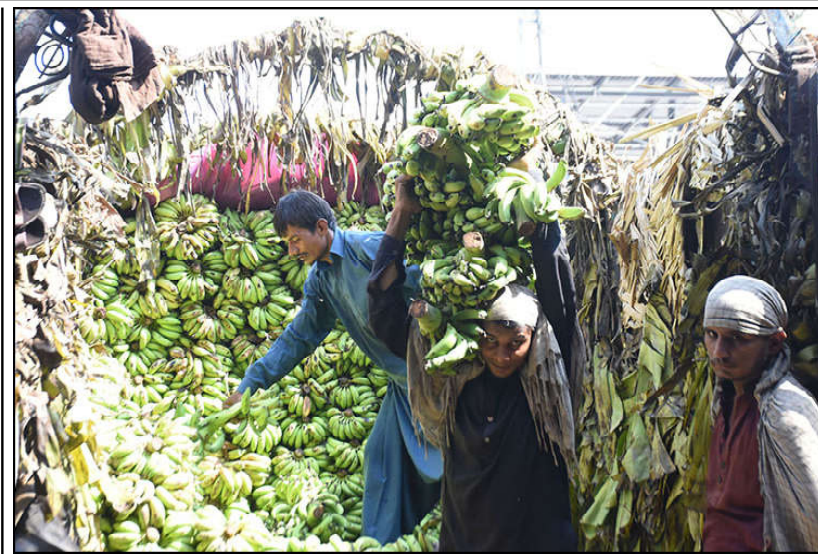
ISLAMABAD: People are busy buying and selling in the I-9 Fruit and vegetable market of the federal capital.