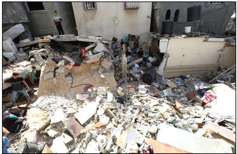
Palestinians inspect the site of an Israeli strike on a house, amid the ongoing Israel-Hamas conflict, in Al Maghazi refugee camp in the central Gaza Strip.

CVS cut its financial expectations for the third time in August with all major pharmacy chains attempting to navigate a drastically changed landscape, facing competition online and elsewhere.