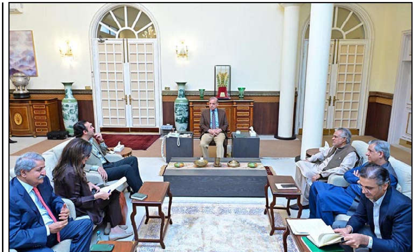
ISLAMABAD: Chairman Pakistan People's Party Bilawal Bhutto Zardari along with a delegation called on Prime Minister Muhammad Shehbaz Sharif.

He said that our security forces would succeed with support and prayers of the nation and ultimately, would defeat the terrorists.