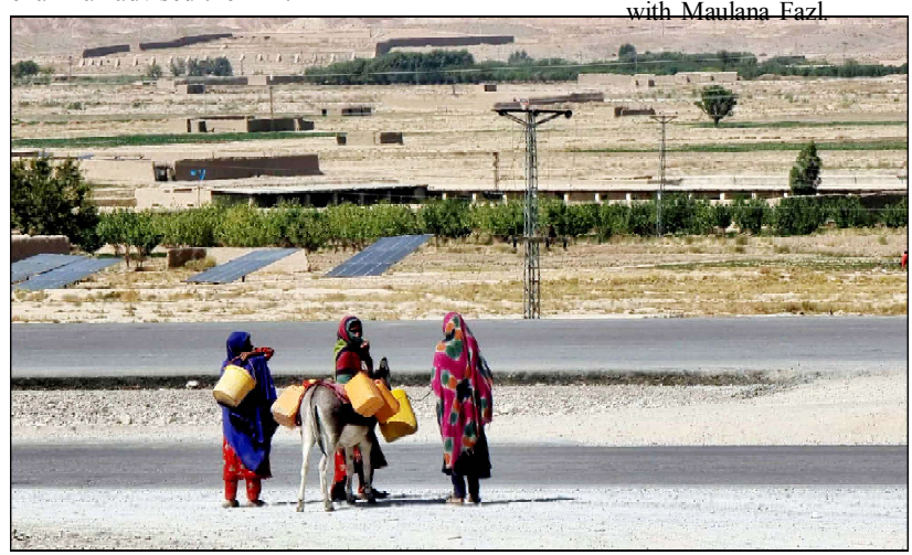
Women are carrying empty drinking water cans pass through a street for searching drinking water due to shortage of drinking water in Muslim Bagh