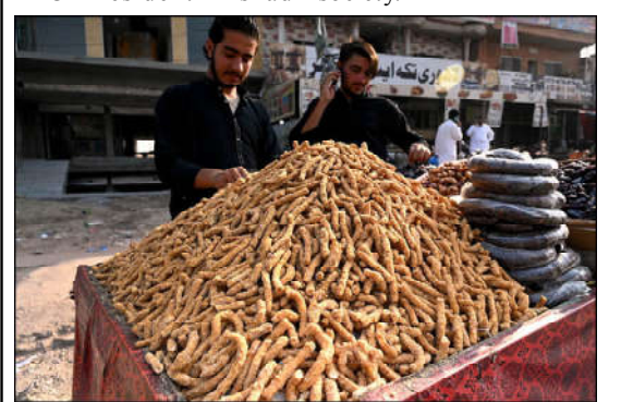
ISLAMABAD: Vendor arranging and displaying traditional sweets item at roadside in the Federal Capital.

MULTAN (APP): The seed cotton (phutti) equivalent to over 3.1 million (3,101,743) bales have reached ginning factories across Pakistan till October 15, 2024, registering a decrease of 48.27 per cent compared to corresponding period of last year. According to a fortnightly report of Pakistan Cotton Ginners Association (PCGA), issued to media on Friday, over 2.7 million (2,736,449) bales have undergone the ginning process i.e converted into bales. Cotton arrivals in Punjab were recorded 1,185,647 bales registering a decrease of 53.38 per cent as compared to the corresponding period of last year when arrivals were recorded 2,543,100 bales. Sindh generated 1,916,096 bales registering a decrease of 44.51 per cent as compared to corresponding period of last year when arrivals were recorded 3,452,986 bales. Arrivals in Balochistan were recorded at 94,850 bales. Exporters/traders bought 3,200 cotton bales while textile sector bought total 2,590,977 bales.