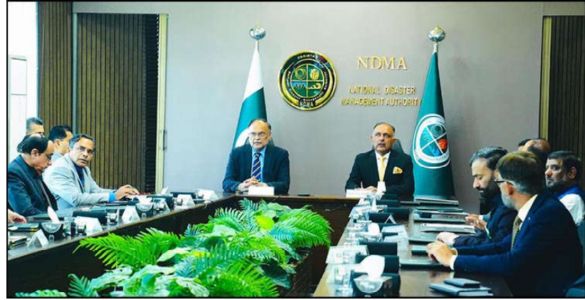
ISLAMABAD: NDMA held coordination meeting for humanitarian assistance for Gaza and Lebanon