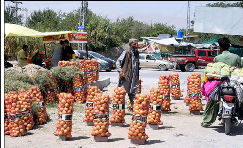
QUETTA: A vendor selling sack of apple from roadside in provincial capital.