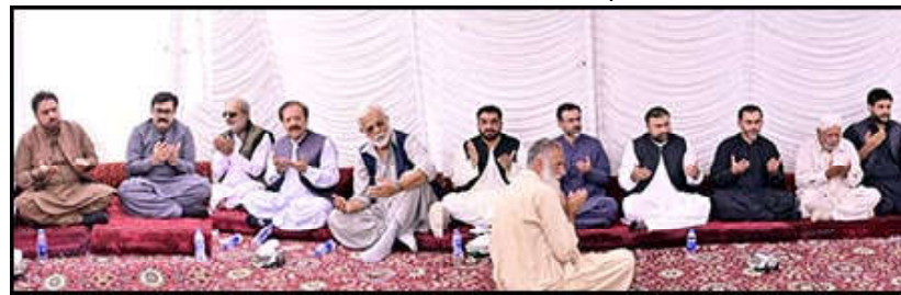
QUETTA: Chief Minister Balochistan Mir Sarfraz Ahmed Bugti offering Fateha for the departed soul of former Caretaker Chief Minister Mir Humayun Marri. Provincial Ministers are also present

Police had collected evidence from home after shifting the bodies to civil hospital. The killer escaped from the scene with murder weapon.