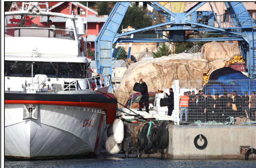
Migrants, who were intercepted at sea and later detained at a reception facility in Albania, board an Italian coast guard vessel to leave for Italy after a court in Rome overturned their detention orders, in Shengjin, Albania.

The probe into Phue Thai comes months after Move Forward - the country's former main opposition party that won last year's election - was dissolved by court order in August, following an investigation by the Election Commission.