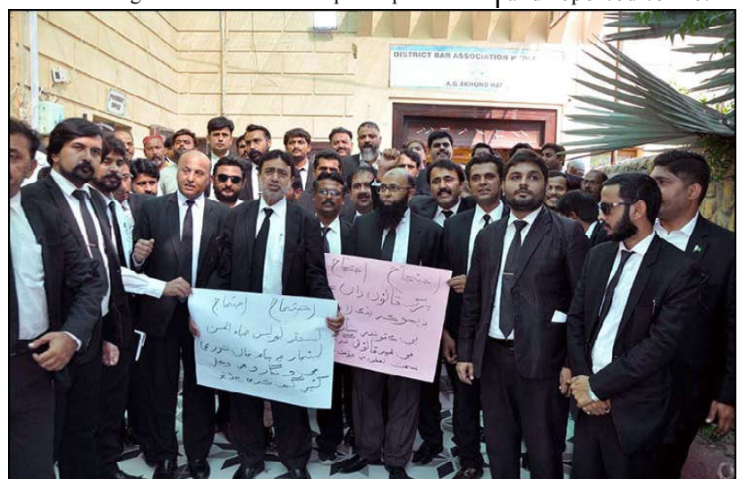
HYDERABAD: Members of District Bar Association are holding protest demonstration against arrested of senior lawyer and demanding for releasing, outside District and Session Court premises in Hyderabad.

Merciless killers deserve no concessions, he said adding that the killers should be immediately arrested and reported to me.