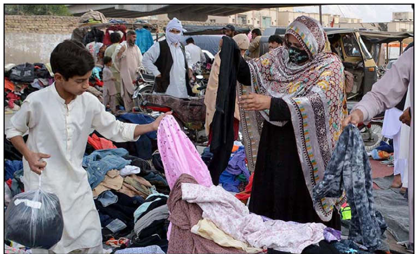
QUETTA: Woman selecting and purchasing warm clothes from roadside vendor after change weather in provincial capital.