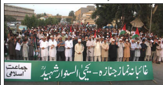
KARACHI: Supporters of the Jamaat e Islami gather for an absentee funeral prayer for Hamas leader Yahya Sinwar killed in Gaza