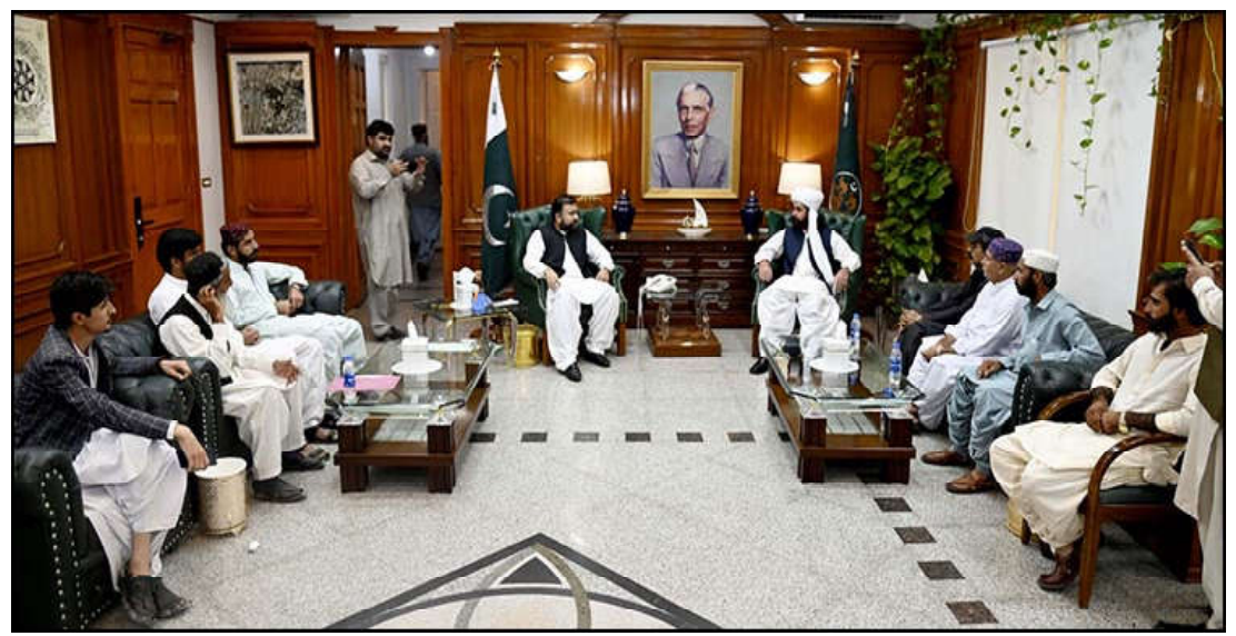
QUETTA: Tribal elders and delegations of people from Dera Bugti meeting with Chief Minister Balochistan Mir Sarfraz Ahmed Bugti