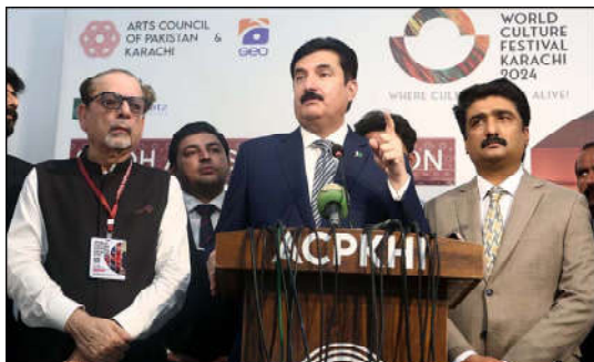
KARACHI: Khyber Pakhtunkhwa Governor, Faisal Karim Kundi addresses to media persons during World Culture Festival Karachi 2024 organized by the Arts Council of Pakistan, held at Arts Council building in Karachi.

Jl leader also said that the Punjab government, becoming a party, has adversely affected the girl student's case. He was opined that the facts of the case will surface with the high court's full bench hearing.