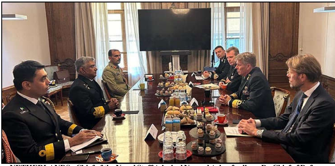
NETHERLANDS: Chief of the Naval Staff Admiral Naveed Ashraf calls on Dy Chief of Defence.

In a message on the occasion of International Day against Breast Cancer, the prime minister acknowledged the challenges the country faced in providing adequate screening and treatment facilities for breast cancer.