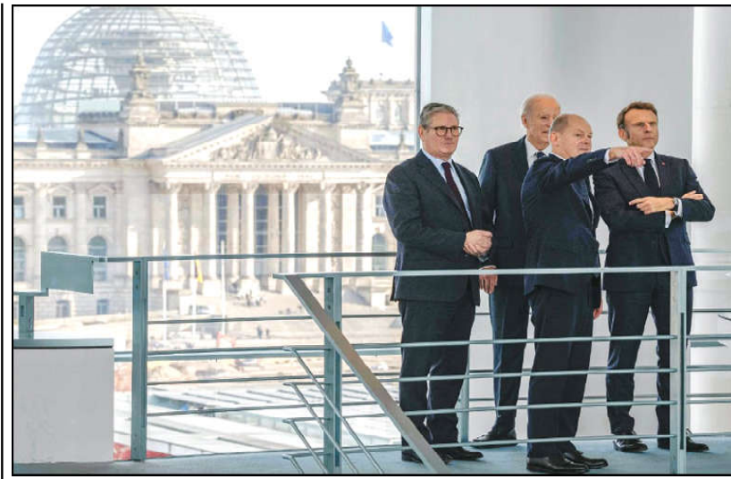
German Chancellor Olaf Scholz with British Prime Minister Keir Starmer, US President Joe Biden and French President Emmanuel Macron before their meeting in Berlin.

Five other people were killed in two separate strikes in the south Gaza cities of Khan Younis and Rafah, medics said, while seven Palestinians were killed in the Shati camp in the northern Gaza Strip.