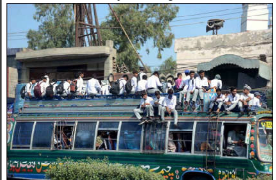
FAISALABAD: A large number of students traveling in a dangerous way on rooftop of passenger bus may cause any mishap and needs the attention of concerned authorities.

The DC said that in order to make the anti-polio campaign successful, 2,676 mobile teams would visit homes, schools and madrasas, 133 fixed teams would be deployed in rural and primary health centres, dispensaries, EPI centres and hospitals, while 69 roaming/transit teams would perform the national duty at lorry stands, bus stops and important.