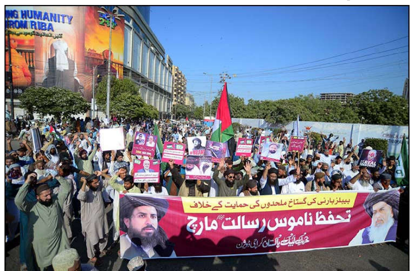
KARACHI: Activists of Tehreek-e-Labbaik (TLP) are holding Tafauz-e-Namose Risalat (PBUH) March, near Governor House in Karachi.

warned that strict legal action will be taken against individuals spreading religious hatred on social media. He emphasized that maintaining peace in Gilgit is a top priority and that merit-based actions will be taken to achieve this goal without exceptions. The SSP also mentioned that efforts are being made to reduce motorbike theft in the region and that several motorcycles have been recovered so far. He assured that every possible step will be taken to eliminate crime from Gilgit.