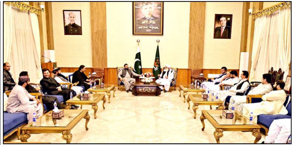
QUETTA: Provincial Amir JUI Maulana Abdul Wasey and MPAs attending dinner hosted by Chief Minister Balochistan Mir Sarfaraz Ahmed Bugti

In his address, chief guest Ambassador Masood Khan, former President of Azad Jammu and Kashmir, reflected on the historical events leading to the ongoing Kashmir tragedy since 1947.