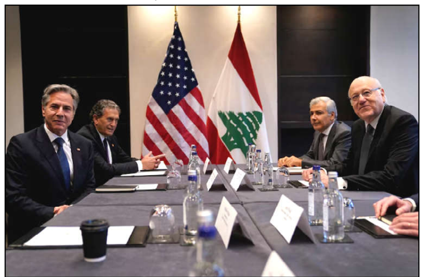
U.S. Secretary of State Antony Blinken meets with Lebanese Caretaker Prime Minister Najib Azmi Mikati in London, Britain.

To put that in context, the fall in 2020 emissions due to extraordinary lockdowns and travel restrictions was roughly five percent compared to the previous year.