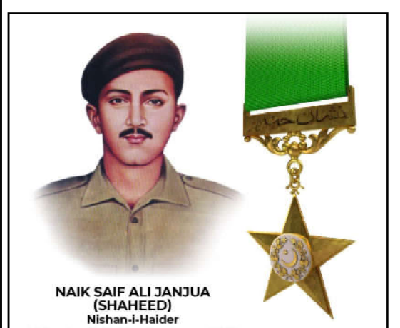
RAWALPINDI (PR): The Chairman Joint Chiefs of Staff Committee, Services Chiefs, and Armed Forces of Pakistan pay heartfelt tribute to Naik Saif Ali Janjua Shaheed, Nishan-e-Haider, on his 76th martyrdom anniversary.

Naik Saif Ali Janjua Shaheed displayed unwavering valour in defending Pir Kaleva Ridge against relentless Indian assaults in 1948. His selfless heroism serves as an enduring inspiration to those safeguarding the nation's sovereignty.