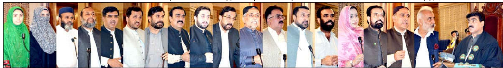
QUETTA: Provincial Ministers, Parliamentary Secretaries and MPs expressing their views on resolutions presented in Balochistan Assembly session