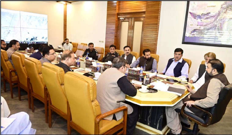
QUETTA: Chief Minister Balochistan Mir Sarfaraz presiding over a meeting regarding anti-encroachment and operation against land grabbers across the province

ment of an Inter-Agency Taskforce aimed at enhancing coordination between provincial and federal governments in anti-drug operations. He praised the Sindh government for its capacity-building initiatives and stressed the importance of ongoing collaboration with provincial authorities to strengthen anti-narcotics efforts. He mentioned the 90s PTV drama "Dhuwan," which subtly addressed the issue of drug trafficking and the glamorization of villains in the media. He expressed hopes for future films to further counter this narrative. The minister acknowledged the historical context of the ANF, which was first established in 1957 and reconstituted in the 1970s, and highlighted its global reputation as an effective anti-narcotics force.