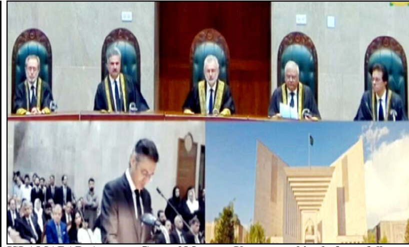
ISLAMABAD: Attorney General Mansoor Usman speaking before a full court reference held at Supreme Court in honour of outgoing Chief Justice of Pakistan Justice Qazi Faez Isa.