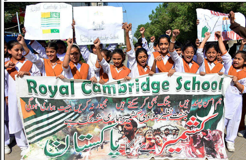
HYDERABAD: Students are participating in a rally to show solidarity with Kashmiri people on 27 October marks as Black Day to condemn the Indian atrocities against Kashmiris and illegal occupation at Latifabad.

He emphasized that these groups have made life unbearable for the citizens.