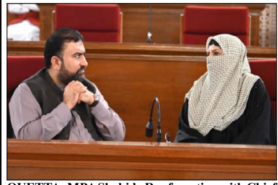
QUETTA: MPA Shahida Rauf meeting with Chief Minister Balochistan Mir Sarfaraz Ahmed Bugti during Assembly session.

Sarfaraz Bugti said that Quetta is the provincial capital and the beauty of the city should suggest that it is really a metropolitan city. In the meeting, various proposed projects related to the establishment of walking street in Quetta city were also considered and it was agreed to take early steps in this regard.