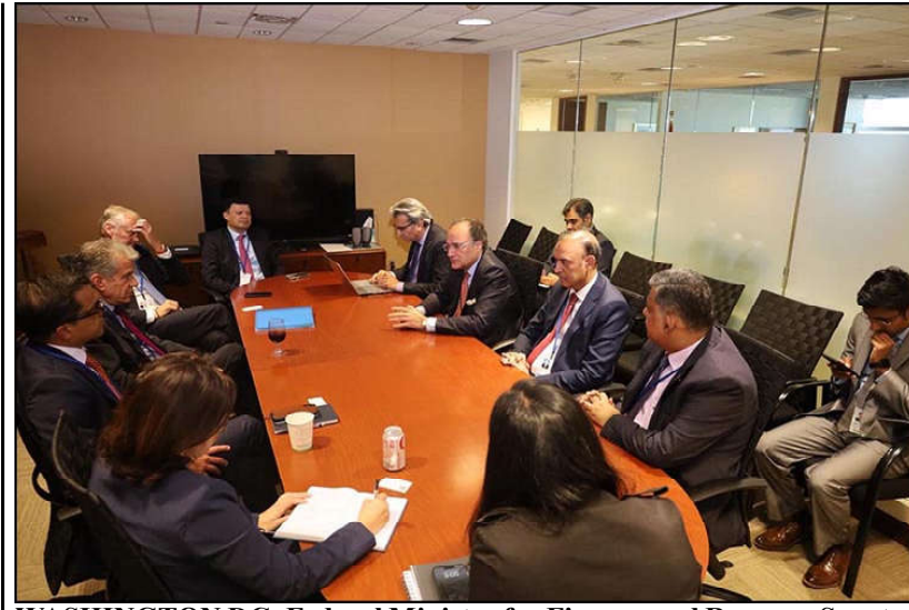
WASHINGTON DC: Federal Minister for Finance and Revenue Senator Muhammad Aurangzeb, accompanied by Governor SBP, held a meeting with the lead team of JP Morgan Bank.

appreciated its financing in diverse sectors such as energy, transportation, education and health. He especially talked about the visit of Saudi Minister for Investment to Pakistan for business-to-business (B2B) engagements with the private sector. He lauded IsDB's investment in Mohmand dam, along with other members of the Arab Coordination Group, which could serve as the template for co-financing of similar and even bigger projects in future. Meanwhile, the minister had a luncheon meeting with the leadership and members of the US-Pakistan Business Council (USPBC).