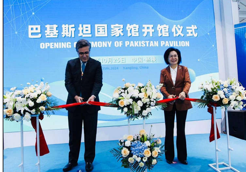
Ambassador of Pakistan to China H.E. Mr. Khalil Hashmi inaugurated Pakistan Pavilion at 31st China Yangling Agricultural Hi-Tech Fair.

The weekly SPI with the base year 2015-16 =100 covers 17 urban centres and 51 essential items for all expenditure groups. Likewise, SPI for the lowest consumption group of up to Rs 17,732 witnessed decrease of 0.18 per cent and went up to 313.16 points from last week's 313.74 points. The SPI for consumption groups of Rs 17,732 to 22,888; Rs 22,889-29,517; Rs 29,518-44,175 and above Rs 44,175, decreased by 0.23 percent and 0.21 percent respectively. During the week, out of 51 items, prices of 13 (25.49%) items increased, 10 (19.61%) items decreased and 28 (54.90%) items remained stable.