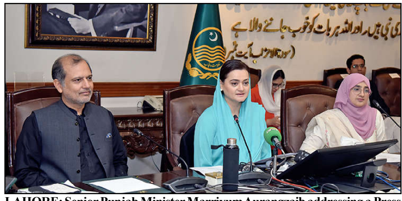
LAHORE: Senior Punjab Minister Murrariy Aurangzeb addressing a Press conference about prevention of Smog in Punjab.

The principal thanked the district administration for deputing Levies on duty at the college.