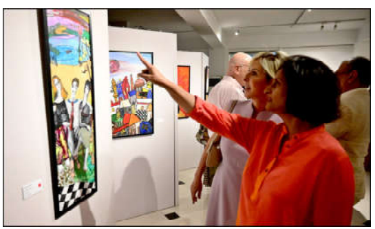
ISLAMABAD: Art enthusiasts admire the beautiful works at the "Through The Veil of Dreams" painting exhibition by artist Tabinda Chinoy at Gallery 6 in Federal Capital.

Currently, India maintains around one million troops in Kashmir, making it the most militarized zone in the world, he lamented.