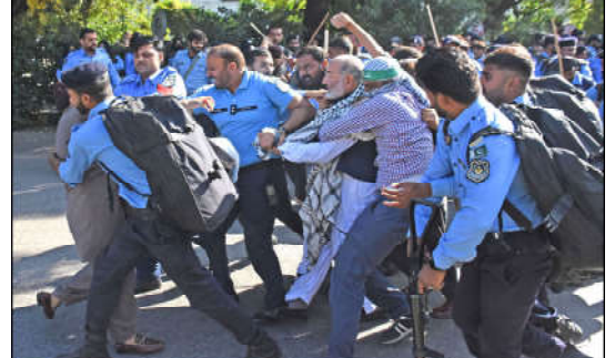
ISLAMABAD: Islamabad Police Crackdown on Aid Hamas March under the auspices of Save Gaza Campaign, police arrested the protestors heading towards US Embassy in the Federal Capital.