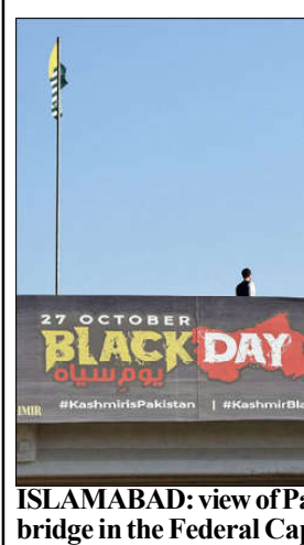
ISLAMABAD: view of Pakistan, Kashmir and black flags installed on Faizabad bridge in the Federal Capital on the eve of Black Day heald on 27th October.

ISLAMABAD (APP): Minister for Law, Justice and Human Rights Senator Azam Nazeer Tarar announced on Friday that, under the Bilateral Exchange Scholarships Program (Stipendium Hungaricum), a total of 367 Pakistani students have been awarded scholarships over the past three years. Responding to a question from Senator Shahadat Awan during the Senate session, Senator Tarar provided a provincial breakdown, stating that approximately 123 students received Stipendium Hungaricum scholarships during this period. In a supplementary query, Senator Kamran Murtaza emphasized that these scholarships should be allocated to students from Balochistan based on their domicile.