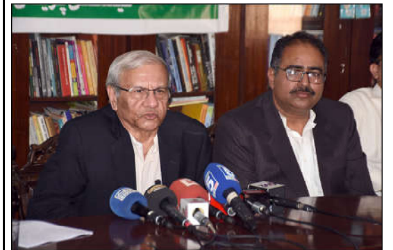
ISLAMABAD: Famous Economist Kaiser Bengali addressing during a seminar at National Press Club in the Federal Capital.

the provincial minister said that the government of Khyber Pakhtunkhwa is taking serious steps to solve the problems of trout farmers and all the problems of