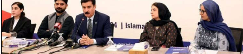
ISLAMABAD: Governor Khyber Pakhtunkhwa Faisal Karim Kundi attends Interactive session with media persons during an event arranged by SSDO.