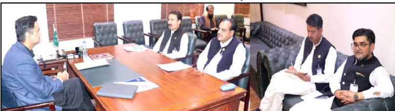
QUETTA: Officers of Balochistan Civil Services Academy Quetta meeting with Commissioner Muhammad Hamza Shafqaat.

endorse the UN Secretary General's Declaration of shared commitments which identified Women, Peace and Security as a central priority to strengthen UN peacekeeping, pointing out that the country's political commitment was matched with practical steps in the field. As an example, he said, Pakistan dispatched in 2019 its first all-female community engagement team to Africa, which undertook several successful initiatives including vocational training for local students, teachers and women. An increasing number of Pakistani women peacekeepers in recent years have served as doctors.