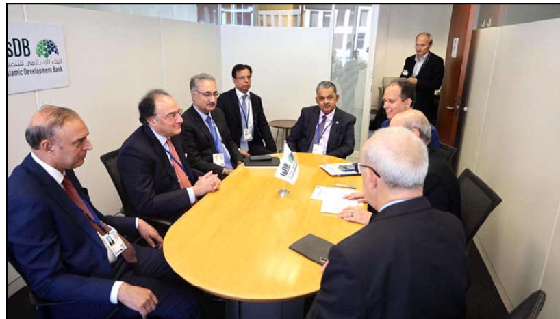
WASHINGTON DC: Federal Minister for Finance and Revenue Senator Muhammad Aurangzeb held a meeting with President Islamic Development Bank (IsDB) on the sidelines of WB/IMF annual meetings 2024.