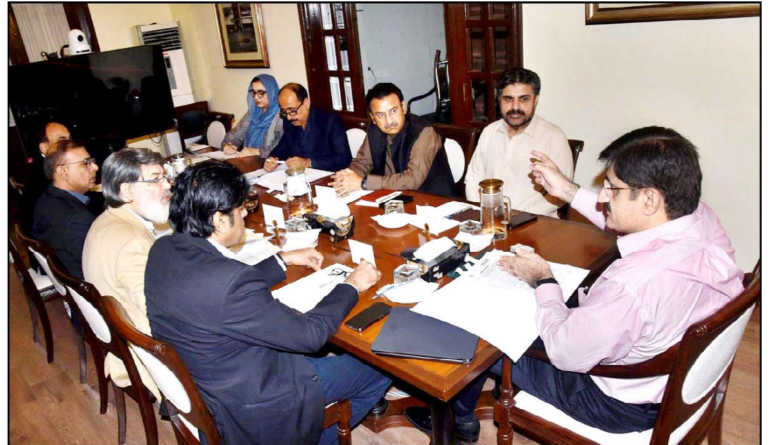
KARACHI: Sindh Chief Minister Syed Murad Ali Shah presides over a meeting to review the development portfolio of the city at CM house

The committee, requiring a two-thirds majority for approval, will then select the new Chief Justice.