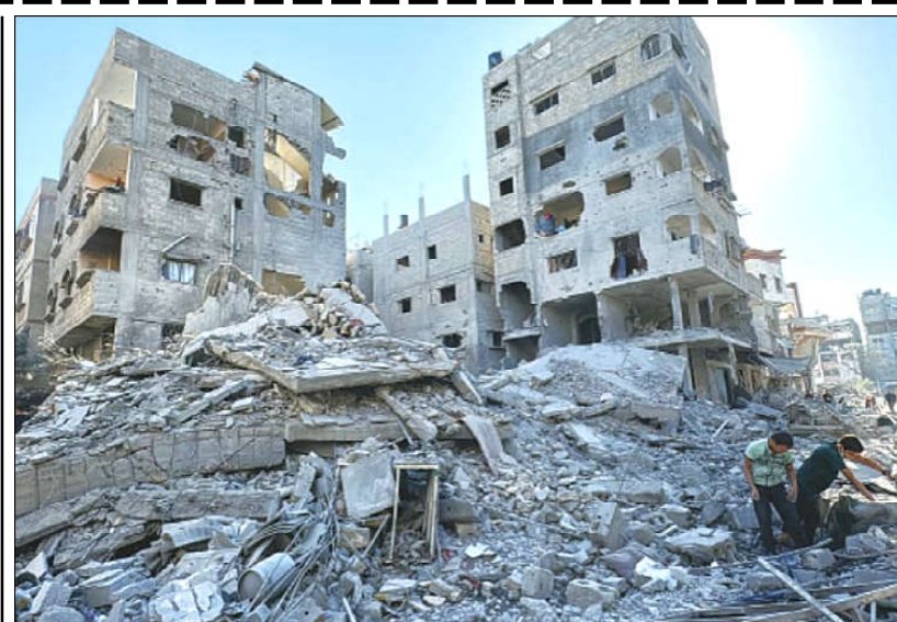
Palestinians inspect the damage after an Israeli air strike at Beit Lahya in the northern Gaza Strip.

US investigates leak on intelligence about Israel's Iran attack plans WASHINGTON: The United States is investigating the leak of a pair of highly classified intelligence documents describing Israel's preparations for a retaliatory strike on Iran, House Speaker Mike Johnson said on Sunday. The documents appear to have been prepared by the National Geospatial-Intelligence Agency, describing US interpretations of Israeli Air Force and Navy planning based on satellite imagery from Oct. 15-16. They began circulating last week on the Telegram messaging app. Israel has been planning a response to a ballistic-missile barrage carried out by Iran on Oct. 1, its second direct attack on Israel in six months. Israel has intensified its offensive in Gaza and Lebanon.