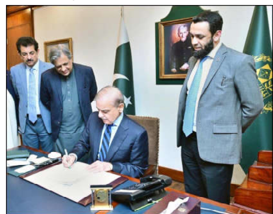
ISLAMABAD: Prime Minister Muhammad Shehbaz Sharif signs the advice for presidential assent on the 26th Constitutional Amendment Bill.