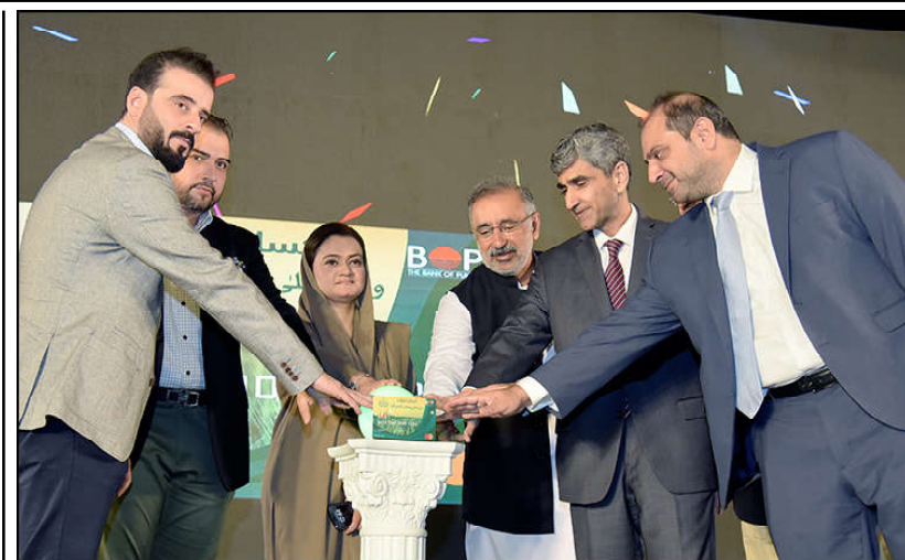
LAHORE: Punjab Senior Minister Marriyum Aurangzeb during a ceremony inaugurates to activate Kisan card and setting up anti smog squad at Agriculture House.

The minister also called for strengthened partnerships across South Asia, leveraging SANOG's experience for policy alignment and capacity building. "Our focus remains on optimizing Internet Exchange Points and enhancing network resilience. We invite international partnerships and investments to further drive the growth of our IT sector," she added.