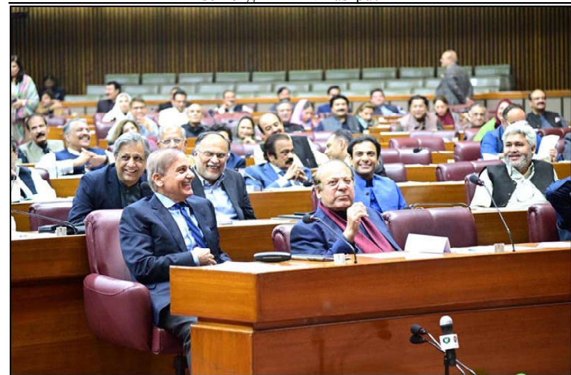
ISLAMABAD: Prime Minister Muhammad Shehbaz Sharif and PML-N Quaid Muhammad Nawz Sharif attending the session of the National Assembly convened to pass the 26th Constitutional Amendment.

World Bank assisted project Rs16800 million SWEEP focuses on solid waste services for Karachi. World Bank assisted the BRT Yellow Line project with Rs 56.189 million to provide BRT bus service from Dawood Chowrang to Numais / Lucky Star (via Korangi Road).