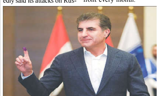
President of Kurdistan Nechirvan Barzani shows his inked finger after casting his vote at a polling station in Erbil.

Ukraine has repeatedly said its attacks on Rus-