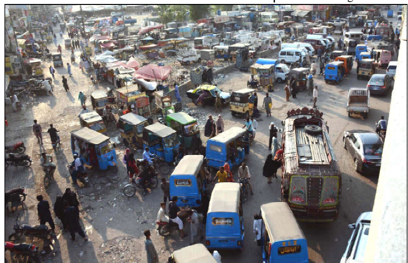
KARACHI: View of illegal encroachment by parking on a road by affluent parking and encroachment mafia, which is creating problems for residents and commuters, showing negligence of concerned authorities of anti-encroachment department to draw its attention toward issue, at Qayyumabad in Karachi