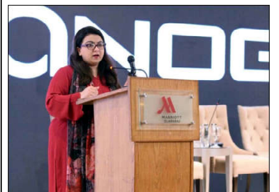
ISLAMABAD: Minister of State for IT and Telecommunication, Shaza Fatima Khawaja addresses during the SANOG-42 Conference held in Islamabad.