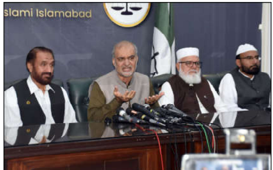
ISLAMABAD: JI Ameer Hafiz Naem Ur Rehman addressing a press conference in the Federal Capital.

tire nation on the successful passage of the amendment. He emphasized that the amendment would bring greater stability to Pakistan's constitutional and legal framework. "Extensive consultations were held to ensure as much consensus as possible on the amendment," Tarar added. The minister noted that the vision of Quaid-e-Azam Muhammad Ali Jinnah laid the foundation for constitutional thought in Pakistan. "History will confirm that this constitutional amendment is in the best interest of the people," he asserted. The amendment, according to Tarar, will eliminate obstacles to the swift delivery of justice.