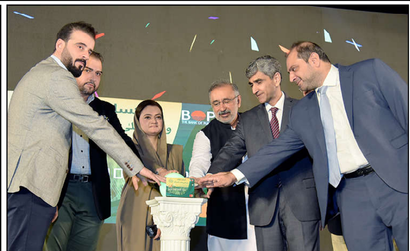
LAHORE: Punjab Senior Minister Marriyum Aurangzeb during a ceremony inaugurates to activate Kisan card and setting up anti smog squad at Agriculture House.

The minister also called for strengthened partnerships across South Asia, leveraging SANOG's experience for policy alignment and capacity building. "Our focus remains on optimizing Internet Exchange Points and enhancing network resilience. We invite international partnerships and investments to further drive the growth of our IT sector," she added.