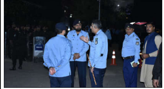
the need for stringent security measures in the Red Zone, instructing the officers patrolling the area to increase the intensity of