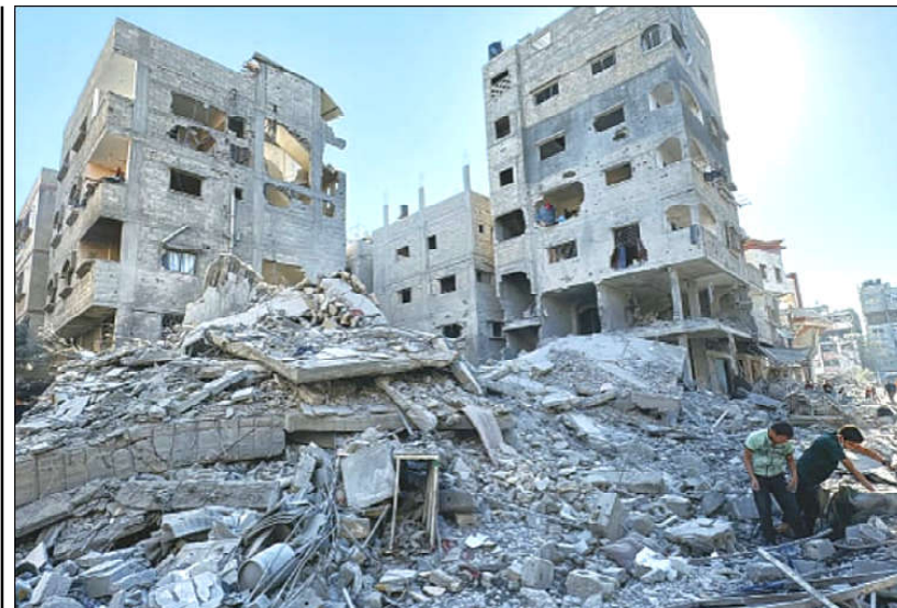
Palestinians inspect the damage after an Israeli air strike at Beit Lahya in the northern Gaza Strip.

contributing countries, UNIFIL stressed that peacekeepers remain in all their positions, the mission's statement said on Sunday. "We will continue to carry out our mandated tasks of monitoring and reporting," the statement concluded. Sunday's developments come after a series of worrying incidents in the past days in which a total of five peacekeepers have been injured. Just four days ago, UNIFIL issued a statement saying peacekeepers at a position near Kafer Kela had observed an IDF Merkava tank firing at their watchtower. Two cameras were destroyed, and the tower was damaged, it said.