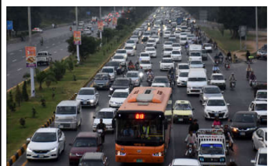
ISLAMABAD: A view of traffic jam at Islamabad Expressway in the Federal Capital.