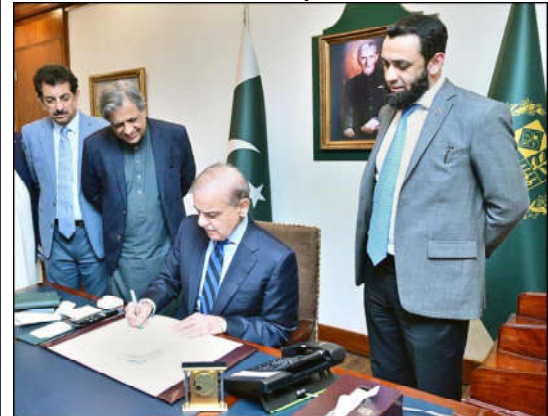
ISLAMABAD: Prime Minister Muhammad Shehbaz Sharif signs the advice for presidential assent on the 26th Constitutional Amendment Bill.

ISLAMABAD (APP): Speaker National Assembly has lauded parliamentary journalists for their outstanding reporting on the occasion of the 26th Constitutional Amendment. He commended the discipline and responsibility displayed by the journalists, recognizing their contribution to maintaining order during the session, said a news release. The Speaker specifically praised the efforts of the Parliamentary Reporters Association of Pakistan (PRAP) for its role in ensuring professionalism and decorum during the event. He emphasized that the press gallery is an essential part of the Parliament, playing a critical role in conveying legislative activities to the public. "The press gallery is a vital component of the Parliament," the Speaker stated. "The role it plays in bringing the legislative work of the House to the people is of great importance." He said that parliamentary journalists have consistently portrayed the positive image of the Parliament to the public and expressed hope that PRAP would continue to uphold its commendable traditions during future legislative sessions.