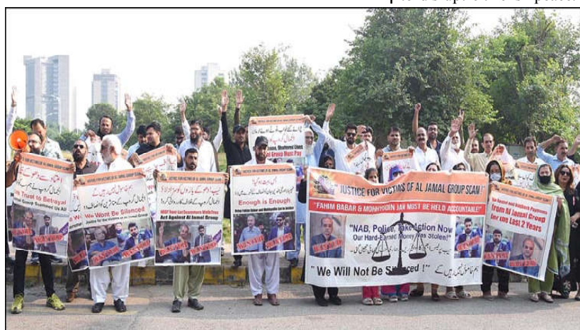
ISLAMABAD: Affected of Jamal Group (Real Estate) are protesting outside NPC for their demands.