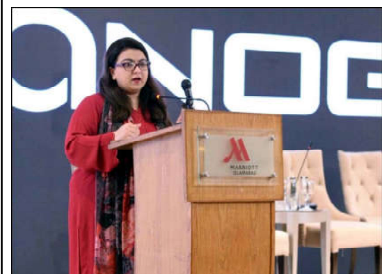
ISLAMABAD: Minister of State for IT and Telecommunication, Shaza Fatima Khawaja addresses during the SANOG-42 Conference held in Islamabad.