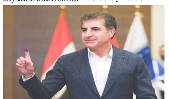
President of Kurdistan Nechirvan Barzani shows his inked finger after casting his vote at a polling station in Erbil.

sian warships in the Black Sea have forced Moscow to move ships to Novorossiisk. Rogozin told the M o s k o v s k y Komsomolets, opens new tab newspaper that Russia needed to get more serious about its drone development, the organisation of its military drone units and the development of electronic warfare and satellite positioning systems. "A military-technical revolution is taking place before our very eyes," Rogozin said of the development of drones and electronic warfare, adding that the pace of innovation was changing the situation at the front every month.