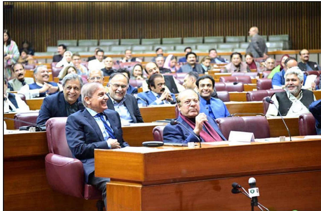
ISLAMABAD: Prime Minister Muhammad Shehbaz Sharif and PML-N Quaid Muhammad Nawz Sharif attending the session of the National Assembly convened to pass the 26th Constitutional Amendment.

clinched 225 votes of the required 224 with the crucial support of a handful of independent candidates. PTI had refused to back the package and did not participate in the voting. Speaking on the floor of the House, the prime minister emphasised that the amendment represents not just a legal change, but a symbol of unity and consensus. "This is more than an amendment; it is a reaffirmation of solidarity and agreement across political lines," he noted. Reflecting on the past, PM Shehbaz criticised what he termed "palace conspiracies" that led to the dismissal of governments and prime ministers.