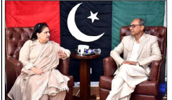
KARACHI: Benazir Income Support Programme (BISP) Chairperson, Senator Rubina Khalid exchanging views with Saeed Ghani, Sindh Minister for Local Government during meeting held in Karachi.

such institutions which are serving humanity should be encouraged in every way. Governor Punjab assured the delegation of all possible support for Down Syndrome Association. Member Provincial Assembly Salma Hashmi informed the Punjab Governor about the efforts of Dawn Syndrome Association to provide inclusive education to children with Down syndrome like the developed countries and make them active members of the society. On this occasion, Punjab Governor Sardar Saleem Haider Khan along with the delegation also planted a sapling in the Governor's House.