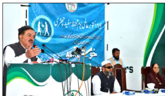
QUETTA: Governor Balochistan Sheikh Jaffar Khan Mandokhail addressing an event organized by the Balochistan Blind Association to mark White Cane Safety Day.

Independent Report QUETTA: The Governor Balochistan, Sheikh Jaffar Khan Mandokhail has assured that every possible cooperation would be extended to resolve the issues being faced by the persons with disabilities including the blind ones. The Governor emphasized upon implementing the special quota allocated by the government for jobs in different departments of the province. He also stressed to launch Himmat Cards for the special persons in Balochistan on pattern of the Punjab government. In addition to this, it should be ensured that the offices concerning the special persons should be on first floor of the official buildings so that they may not face any inconvenience to get access to them. He was addressing a special ceremony organized by the Pakistan Association of the Blinds, Balochistan chapter here at the auditorium of Boy Scouts Association's Headquarter on Tuesday. Addressing the ceremony, the Governor regretfully pointed out that the special persons are the most oppressed segment of the society, therefore, everyone should encourage them. He said that it is good that it has been declared an inappropriate to say the persons with disabilities as disabled ones.