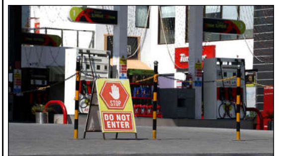
ISLAMABAD: A view of closed Petrol Pump due to Shanghai Cooperation Organisation (SCO) summit, in Islamabad.

"Our diaspora in the United States can play a pivotal role in strengthening economic ties with the U.S. while also helping their counterparts capitalize on economic opportunities in Pakistan," he said.