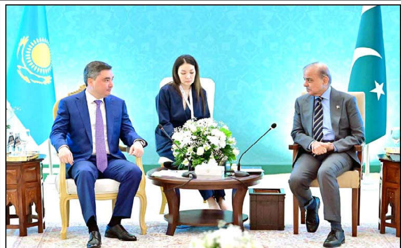
ISLAMABAD: Prime Minister Muhammad Shehbaz Sharif meets with Prime Minister of Kazakhstan H.E. Olzhas Bektenov on the sidelines of Shanghai Cooperation Organisation Head of Government Meeting.