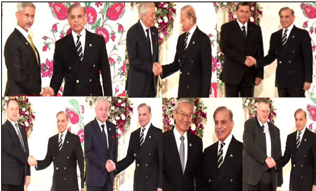
ISLAMABAD: Prime Minister Shehbaz Sharif welcoming foreign dignitaries to the dinner for the Shanghai Cooperation Organisation's (SCO) first day.

Ph: 2841470/2841473 Vol: XIX No. 226, Rabi-us-Sani 12, 1446 AH Wednesday October 16, Pages 04, Price Rs.15