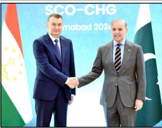
ISLAMABAD: Prime Minister of Tajikistan, Qohir Rasulzoda calls on Prime Minister Muhammad Shehbaz Sharif on the sidelines of SCO Council of Heads Meeting.