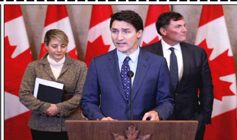
Canada's Prime Minister Justin Trudeau, with Minister of Foreign Affairs Melanie Joly, and Minister of Public Safety, Democratic Institutions and Intergovernmental Affairs Dominic LeBlanc, takes part in a press conference about the Royal Canadian Mounted Police's investigation into "violent criminal activity in Canada with connections to India", on Parliament Hill in Ottawa.

The EU agreed on Monday to impose sanctions on seven people and seven organisations, including airline Iran Air, for alleged links to Iranian transfers of ballistic missiles to Russia. Britain, which is not in the EU, also imposed new sanctions.