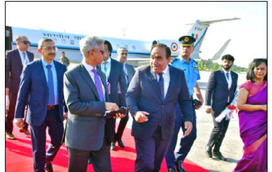
ISLAMABAD: Indian Minister of External Affairs Subrahmanyam Jaishankar being received by DG South Asia Ilyas Nizami at Nur Khan Airbase.

ISLAMABAD (INP): India's Minister of External Affairs S Jaishankar arrived at the Noor Khan Airbase on Tuesday to attend the Shanghai Cooperation Organisation summit being held here on Wednesday. He was received at the airport by the Ministry of Foreign Affairs officers. Jaishankar left for Pakistan in a special plane from the capital New Delhi. Jaishankar is the first Indian foreign minister who arrived in Pakistan after a 2015 visit of former foreign minister Sushma Swaraj.