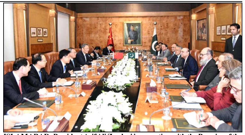
ISLAMABAD: President Asif Ali Zardari in a meeting with the Premier of the State Council of the People's Republic of China, Li Qiang, at Aiwan-e-Sadr.

Monitoring Desk ISLAMABAD: Prime Minister Shehbaz Sharif warmly welcomed Indian Minister of External Affairs Subrahmanyam Jaishankar along with other international leaders during a dinner marking the first day of the Shanghai Cooperation Organisation (SCO) summit on Tuesday. While the main SCO meeting will take place on Wednesday, Prime Minister Shehbaz Sharif hosted a welcome dinner for delegates on Tuesday. The Foreign Office said the premier will also hold bilateral meetings on the sidelines. Live footage showed Pakistan's PM and Indian FM having a brief chat while shaking hands. This rare interaction marked the first visit by an Indian foreign minister to Pakistan in nearly a decade, highlighting the ongoing complexities in diplomatic ties between the two nuclear-armed neighbours. Both leaders greeted each other at the dinner, which is part of the broader SCO summit activities taking place in the capital. Jaishankar's arrival at Islamabad's airbase shortly before 3:30 PM was ceremoniously accompanied by children presenting him with bouquets of flowers, underscoring the event's importance.