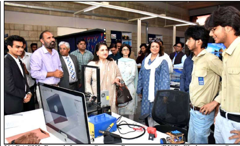
KARACHI: Benazir Income Support Programme (BISP) Chairperson, Senator Rubina Khalid visiting the Hunar Foundation in Karachi.

employment of the local labourers and its strict implementation. He on this occasion said that workers of brickkilns are met out cruelty and excesses and said that they will not allow the exploitation of those workers in any circumstances and directed for special focus on the prevention of excesses with workers of brickkilns. The chief minister said that the provision of justice and protection to the rights of such oppressed class of the society is the responsibility of the government and directed the concerned authorities to register brickkilns and compile data of the labourers working in them.