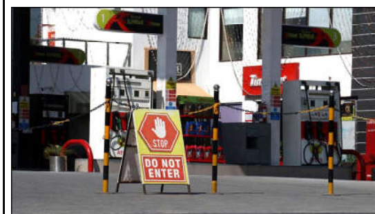
ISLAMABAD: A view of closed Petrol Pump due to Shanghai Cooperation Organisation (SCO) summit, in Islamabad.

"Our diaspora in the United States can play a pivotal role in strengthening economic ties with the U.S. while also helping their counterparts capitalize on economic opportunities in Pakistan," he said.