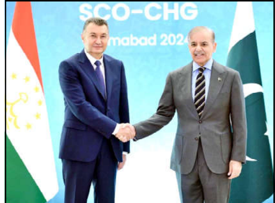
ISLAMABAD: Prime Minister of Tajikistan, Qohir Rasulzoda calls on Prime Minister Muhammad Shehbaz Sharif on the sidelines of SCO Council of Heads Meeting.

over 2,000 years to the ancient Silk Road, which served as a bridge of friendship between the two ancient civilizations. He acknowledged the strong amity that has characterized Pakistan-China relations since the establishment of diplomatic ties in May 1951 and said that Pakistan was one of the first countries to recognize the People's Republic of China. Paying tribute to the visionaries who built this enduring relationship, including former Prime Ministers Shaheed Zulfikar Ali Bhutto and Shaheed Benazir Bhutto, as well as Chinese leadership, he reflected on their contributions to solidifying ties.