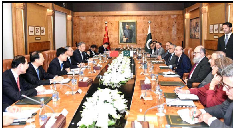
ISLAMABAD: President Asif Ali Zardari in a meeting with the Premier of the State Council of the People's Republic of China, Li Qiang, at Aiwan-e-Sadr.