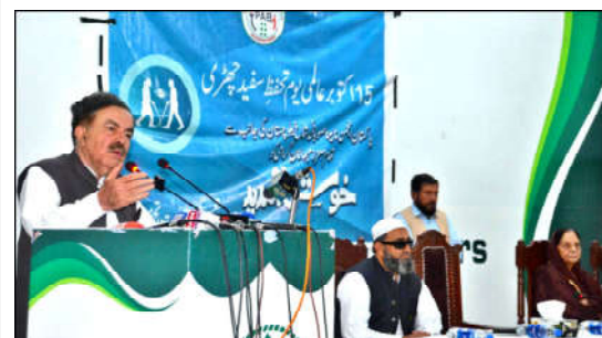
QUETTA: Governor Balochistan Sheikh Jaffar Khan Mandokhail addressing an event organized by the Balochistan Blind Association to mark White Cane Safety Day.

Addressing the ceremony, the Governor regretfully pointed out that the special persons are the most oppressed segment of the society, therefore, everyone should encourage them. He said that it is good that it has been declared an inappropriate to say the persons with disabilities as disabled ones.