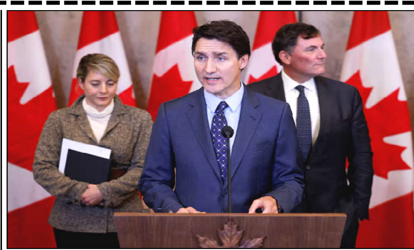
Canada's Prime Minister Justin Trudeau, with Minister of Foreign Affairs Melanie Joly, and Minister of Public Safety, Democratic Institutions and Intergovernmental Affairs Dominic LeBlanc, takes part in a press conference about the Royal Canadian Mounted Police's investigation into "violent criminal activity in Canada with connections to India", on Parliament Hill in Ottawa.

The EU agreed on Monday to impose sanctions on seven people and seven organisations, including airline Iran Air, for alleged links to Iranian transfers of ballistic missiles to Russia. Britain, which is not in the EU, also imposed new sanctions.