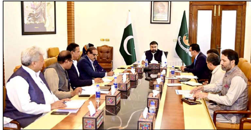
QUETTA: Balochistan Chief Minister Mir Sarfraz Bugti presides over the review meeting on the performance of the textbook board at the Chief Minister's Secretariat.