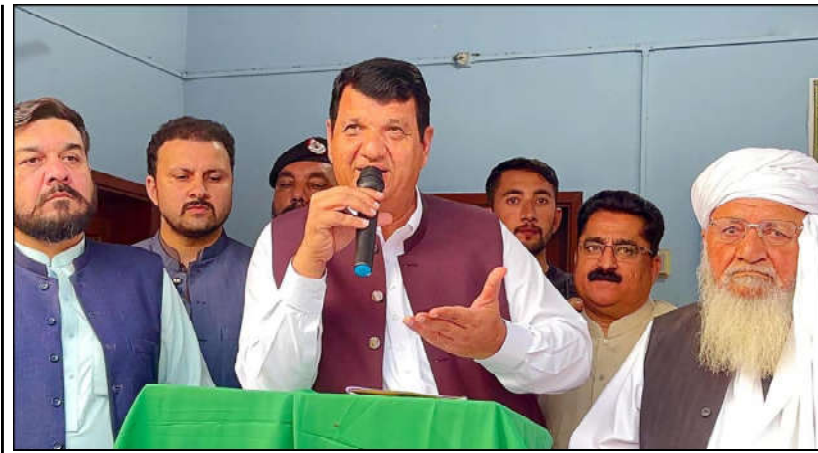
BUNER: Federal Minister for States and Frontier Regions and President PML-N KP, Engr Amir Muqam addressing Jirga Members in Buner.