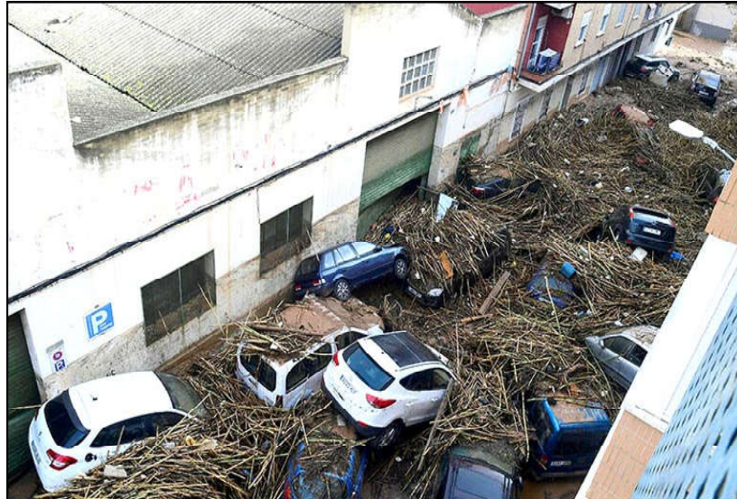
A picture taken in Picanya, near Valencia shows cars and debris piled in a street after floods.

rebuild your streets, your squares, your bridges," he said. Carlos Mazon, the regional leader of Valencia, one of Spain's most important agricultural regions, said some people remained isolated in inaccessible locations. "If [emergency services] have not arrived, it's not due to a lack of means or predisposition, but a problem of access," Mazon told a press conference, adding that reaching certain areas was "absolutely impossible". Dozens of videos shared on social media overnight appeared to show people trapped by the floodwaters, with some climbing into trees to avoid being swept away. Footage showed rescue workers transporting several women in a bulldozer's bucket.