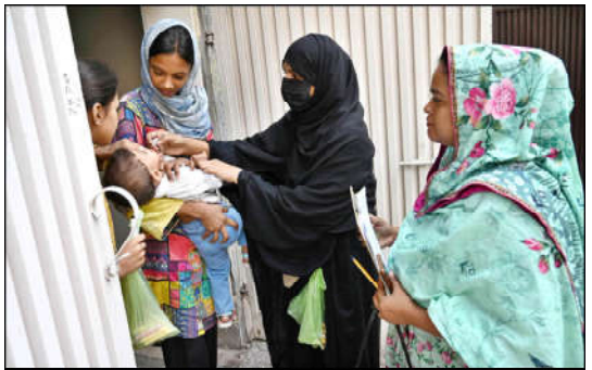
LAHORE: Polio worker administering polio drops to children at Sodiwal during anti-polio vaccination campaign in Provincial Capital.

The visit also included a tour of the "Bell of Hope" project, where Minister Shaza Fatima rang the bell in appreciation, and a review of the ration drive, lauding the efforts to provide relief through ration distribution.