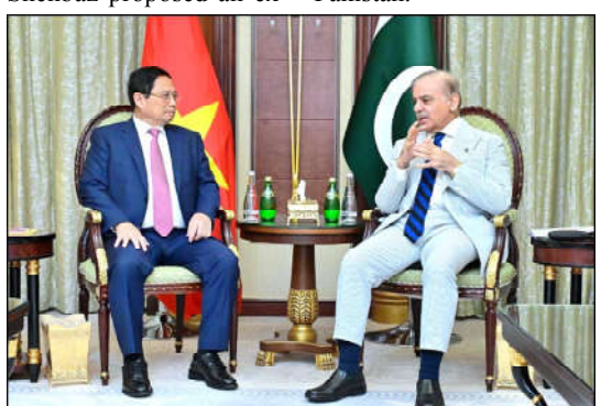
RIYADH: Prime Minister Muhammad Shehbaz Sharif meets Prime Minister Pham Minh Chinh of Vietnam on the sidelines of the 8th Future Investment Initiative (FII) Conference.

RIYADH (APP): Prime Minister Muhammad Shehbaz Sharif on Wednesday met with his Vietnamese counterpart Pham Minh Chinh and expressed Pakistan's desire to enhance ties with Vietnam, while highlighting the immense potential of the two countries to enhance trade and investment cooperation. In the meeting held on the sidelines of the 8th Future Investment Initiative (FII) Conference, the two leaders discussed ways to strengthen bilateral relations, particularly in trade and investment. Prime Minister Shehbaz proposed an exchange of trade and business delegations between both countries to further explore these opportunities. The two leaders reaffirmed their commitment to strengthening people-to-people ties and promoting tourism between the two countries. Appreciating Vietnam's role in the ASEAN region, Prime Minister Shehbaz sought support for Pakistan's efforts to become a full dialogue partner of ASEAN. He also extended an invitation to the Vietnamese prime minister to undertake an official visit to Pakistan.