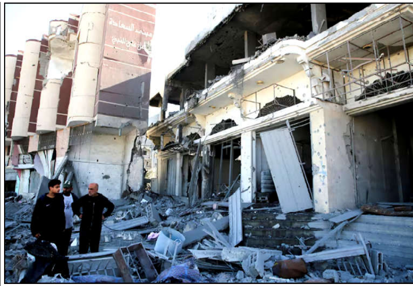
Palestinians inspect the site of an Israeli strike on a house, amid the Israel-Hamas conflict, in Khan Younis in the southern Gaza Strip.