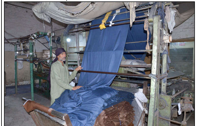
FAISALABAD: A worker busy in his work in a local Garments factory in the city.