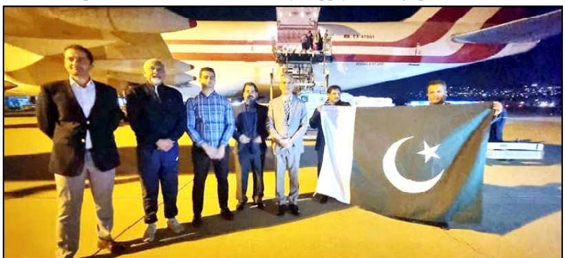
BEIRUT: The 18th Consignment of GoP/Pak NDMA carrying 95 tons landed at Beirut, Lebanon.