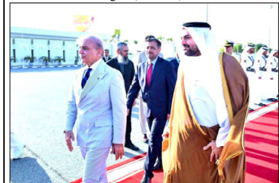
DOHA: Prime Minister Muhammad Shehbaz Sharif arrives at Doha International Airport for his 2 day official visit of Qatar. He is being received by Qatar's Minister of State, Muhammad bin Abdulaziz Al-Khulaifi.

"During this visit, I look forward to productive exchange of views with the Qatari leadership to further enhance our brotherly relations," Sharif said on X after arriving in Doha. "I will also inaugurate a special exhibition at Qatar Museum highlighting the cultural heritage of Pakistan." During his visit, the prime minister will hold bilateral meetings with Sheikh Tamim bin Hamad Al Thani, Amir of the State of Qatar and Mohammed bin Abdulrahman bin Jassim Al-Thani, Prime Minister.