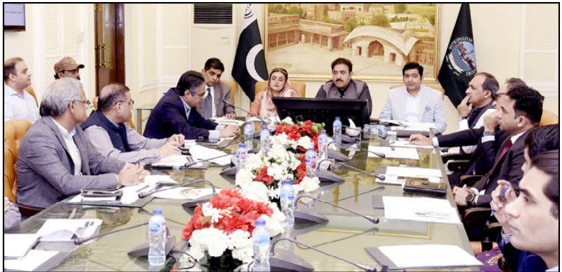
LAHORE: Punjab Minister for Local Government Zeeshan Rafique presides over the meeting regarding Lahore Development Plan. Punjab Minister for Information Azma Bukhari, SACM Zeeshan Malik and Rashid Iqbal are also present.

In a significant announcement, she mentioned that the Minority Card would launch on December 20, providing Rs. 10,500 every three months to needy families. The assistance and number of beneficiaries would also be increased, along with special provisions for differently-abled members of minority communities.