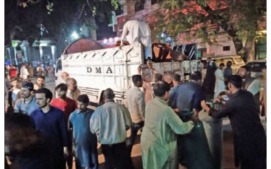
ISLAMABAD: DMA staff loading encroachments on a loading truck during anti-encroachments operation at Sittara Market, in the Federal Capital.