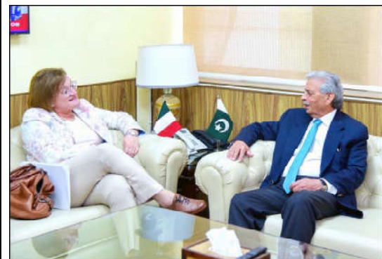
ISLAMABAD: Italian Ambassador, Marilina Armellini calls on the Federal Minister for National Food Security and Research, Rana Tanveer Hussain.

The price of per tola and ten gram silver remained unchanged at Rs.3,350 and Rs.2,872.08 respectively.