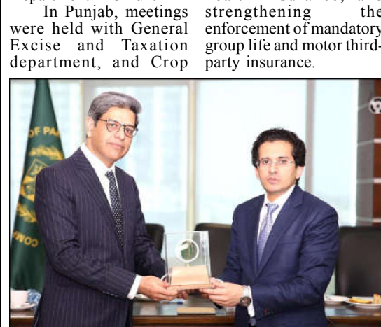
ISLAMABAD: Minister of State for Finance and Revenue, Ali Pervaiz Malik, visited the Competition Commission of Pakistan (CCP).

The focus of the discussions centered on incorporating agricultural insurance into disaster risk financing strategies and national food security policies, introducing compulsory occupational health insurance, and strengthening the enforcement of mandatory group life and motor third-party insurance.