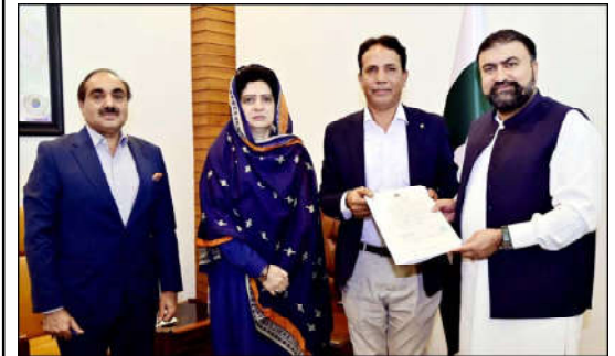
QUETTA: Balochistan Chief Minister Mir Sarfraz Bugti presenting appreciation certificate to Chairman Balochistan Textbooks Board, Gulab Khan Khilji on best performance.

The prime minister also extended his warm greetings to all the members of Hindu community across Pakistan and around the world on the occasion of Diwali. Diwali, he said, the festival of lights, symbolized the triumph of light