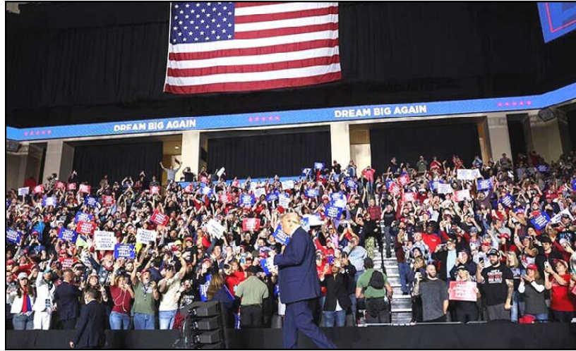
Republican presidential nominee and former US President Donald Trump attends a campaign event, in Allentown, Pennsylvania, US.

attack in the strongest possible terms and demand that it be investigated immediately," the ministry said in a statement, adding that it was not clear where the attack came from and none of the soldiers needed urgent medical care. Austria contributes about 180 soldiers to the 10,000-strong force. They are part of a "Multi Role Logistic Unit" that performs roles like transporting goods and personnel, repairing vehicles, supplying fuel and firefighting.